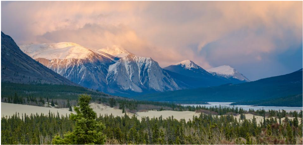
Sunset view on Carcross Desert and Nares Lake JAKUB FRYŠ

wrens in the Badlands, longspurs in the grasslands and yellow-breasted chats in the cottonwoods along the river.