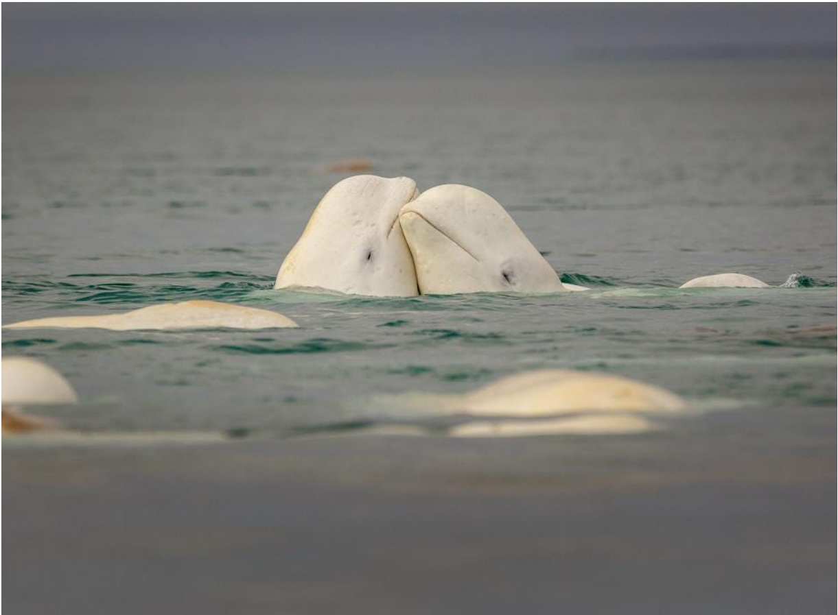
Beluga whale, Somerset Island, Canadian High Arctic.

This award-winning journey to Canada's Great Bear Rainforest is a weeklong safari among the fjords, bears and whales of this 6.4-million-hectare world. Some of the highlights include snaking down fjords laced with rainforest aboard a classic tugboat, watching the sunset from a remote island beach fire, viewing whales, hiking forest trails and kayaking in remote estuaries. The summer is an especially wonderful time for coastal exploration, and spotting whales and seabirds.