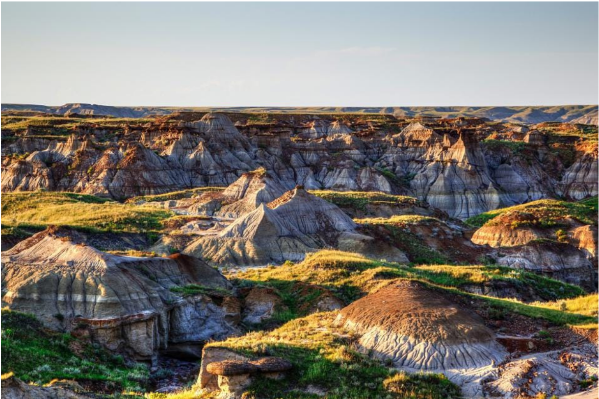
Sun setting over Dinosaur Provincial Park, a UNESCO World Heritage Site in Alberta, Canada. The ... [+]

Explore the remote island archipelago off the northwest coast of British Columbia often described as Canada's Galapagos. See ancient Haida village sites, as well as abundant marine life, including puffins, albatrosses, sunfish, jellyfish, killer whales, and humpback whales. Through sailing, small boat excursions, interpretive walks and kayaking, guests will explore Gwaii Haanas National Park Reserve, National Marine Conservation Area Reserve, and Haida Heritage Site, collectively referred to as Gwaii Haanas.