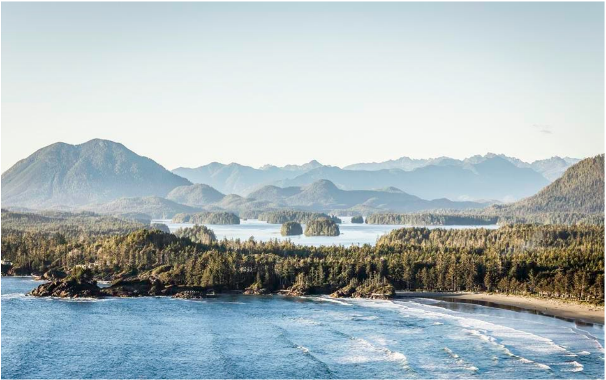
Pacific Rim National Park, Vancouver Island, British Columbia, Canada

form Canada's High Arctic region and encounter enigmatic Arctic wildlife, including walrus, beluga whale, polar bear, musk ox and more.