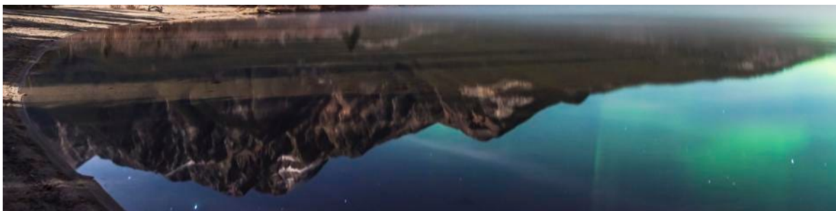
Canadian Rockies & Northern Lights