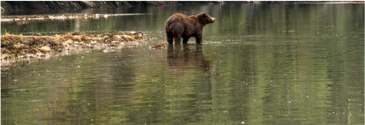
Bear reflected in the waters of the Great Bear Rainforest in British Columbia, Canada