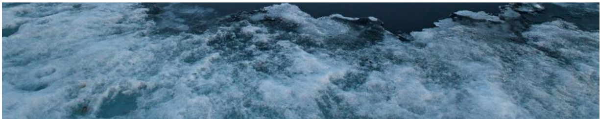
June at the Floe Edge NINA STAVLUND