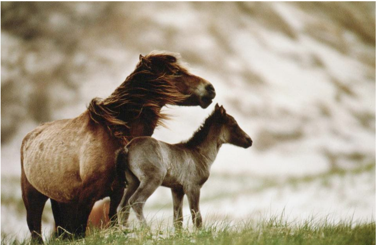
SABLE ISLAND IN NOVA SCOTIA (CANADA)

Sail away on summer breezes into Blackfish Sound in the southern Great Bear Rainforest. View orca, humpback whales and other marine wildlife. This adventure along the coast takes you to mainland fjords, white shell beaches and temperate rainforest aboard a classic, 92-foot schooner. You won't find cities or roads on this coastal safari, only ancient village sites brimming with culture.