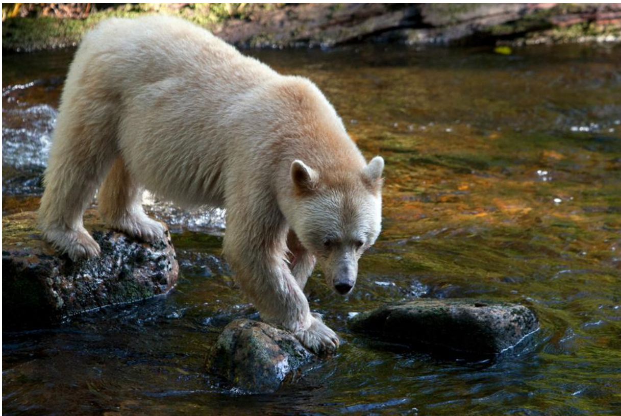
Spirit Bear, Great Bear Rainforest Summer Escape

Packed with eye-popping views of snow-capped mountain ranges and frozen wonderlands, this 11-day adventure is the ultimate great white north escape. Experience the rugged mountains of Canada and go in search of the northern lights in the night skies of Alberta. Watch for moose, white-tailed deer and elk as you drive through pristine Canadian wilderness. Meet and greet a team of canines before ticking dogsledding off your bucket list or just wrap your hands around a mug of hot chocolate and lose yourself in the beauty of the Rockies.