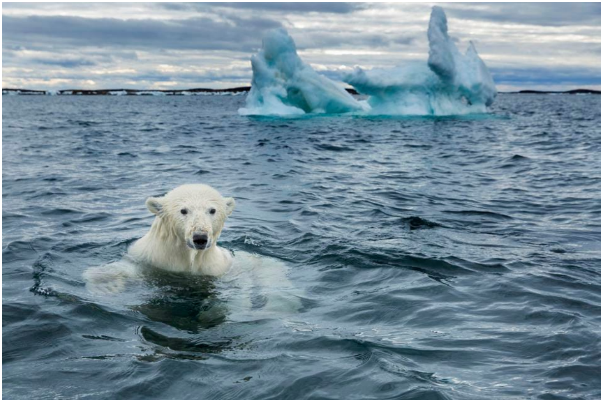
Discover some of Canada's most outstanding and unforgettable trips for adventurous travelers.

Canada has an abundance of truly unique landscapes, culture, waterways and wildlife. There's never been a better time to discover some of the country's most outstanding and unforgettable trips for adventurous travelers.