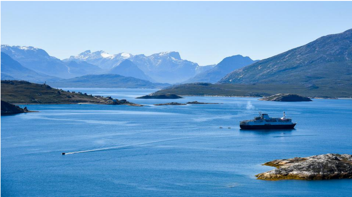
High Arctic Explorer Cruise CAM GILLIES