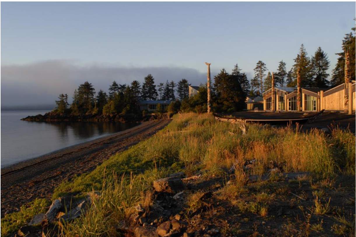
Gwaii Haanas Expedition