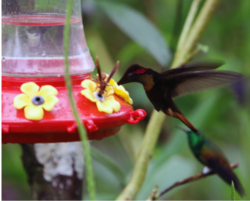
Ruby Topaz