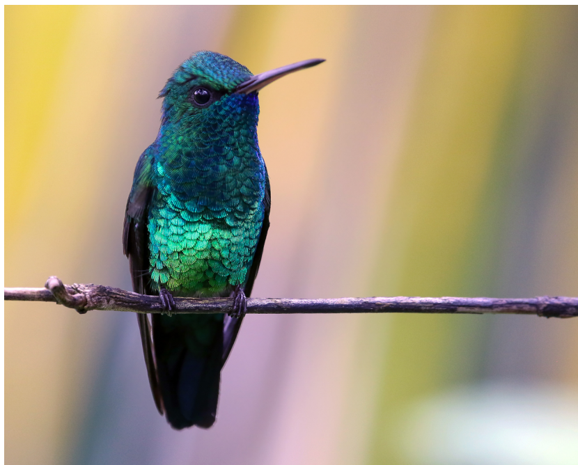
Blue-chinned Sapphire