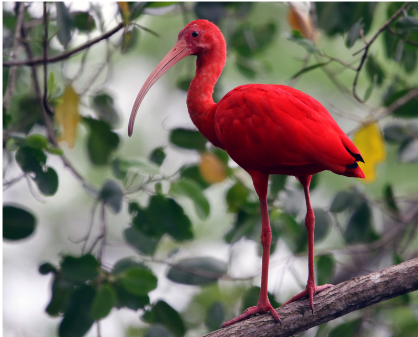
Scarlet Ibis

the tangles after teasing us by flying across the canal and over our bow. A group of seven American Flamingos were spotted in the more open waters - a testament to the new and growing population here in the last few years. Other wildlife included Mangrove Crabs , a lone Silky Anteater and a very up-close Cook's Tree Boa clinging to branches. The grand finale took place as evening set in - the incredible arrival and roosting of hundreds of Snowy Egret, Little Blue Heron, Tricolored Heron and thousands of Scarlet Ibis on a single small island. The beautiful backdrop, still waters of the swamp and stunning birds combine for an experience unlike any other. Heading back at dusk we spotted a Common Potoo camouflaged high on a branch, while a half dozen Common Parauque, several Spectacled Caiman and even a Capybara & Black-eared Possum (both very briefly) were spotted after darkness set in. What a fantastic way to end our day!