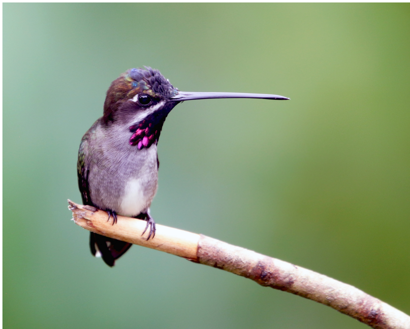
Long-billed Starthroat