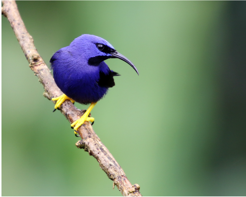
Purple Honeycreeper © Jared Clarke