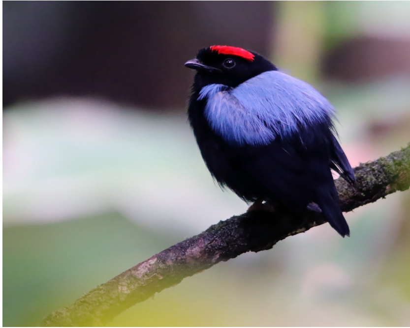
Blue-backed Manakin