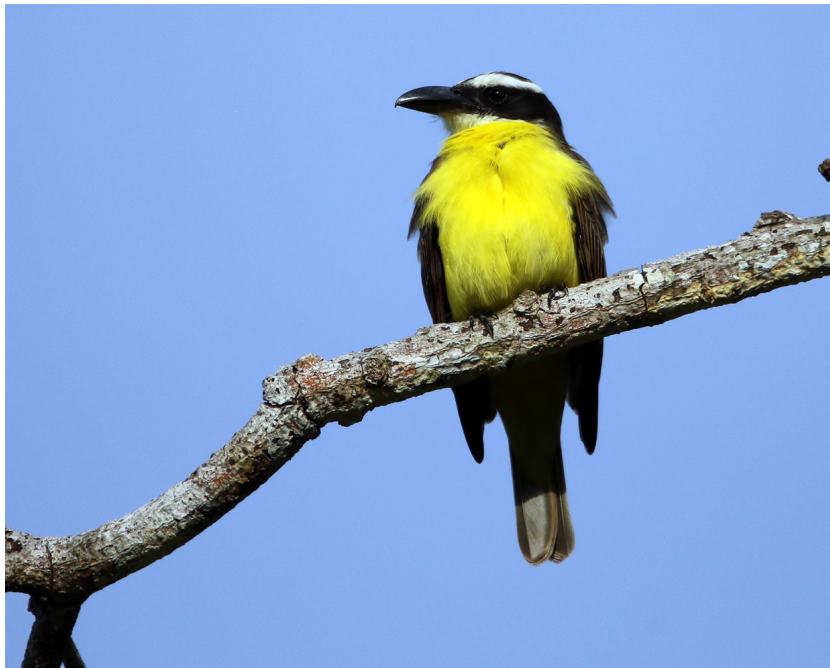
Boat-billed Flycatcher