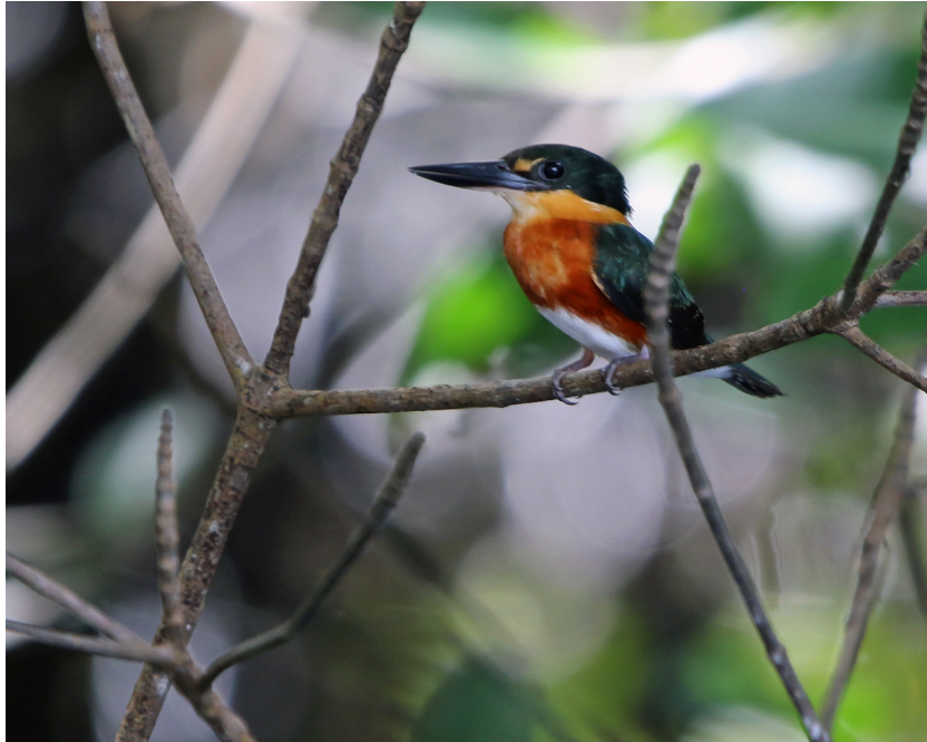
American Pygmy Kingfisher