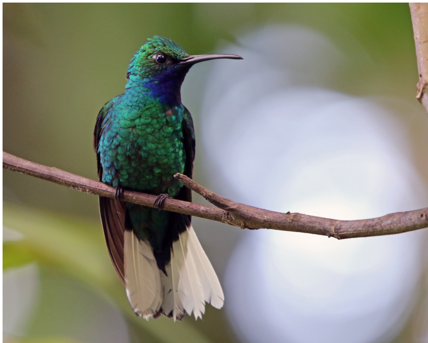
White-tailed Sabrewing © Jared Clarke