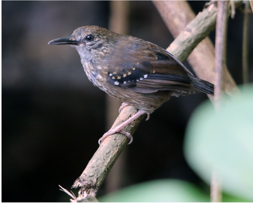
Silvered Antbird © Jared Clarke