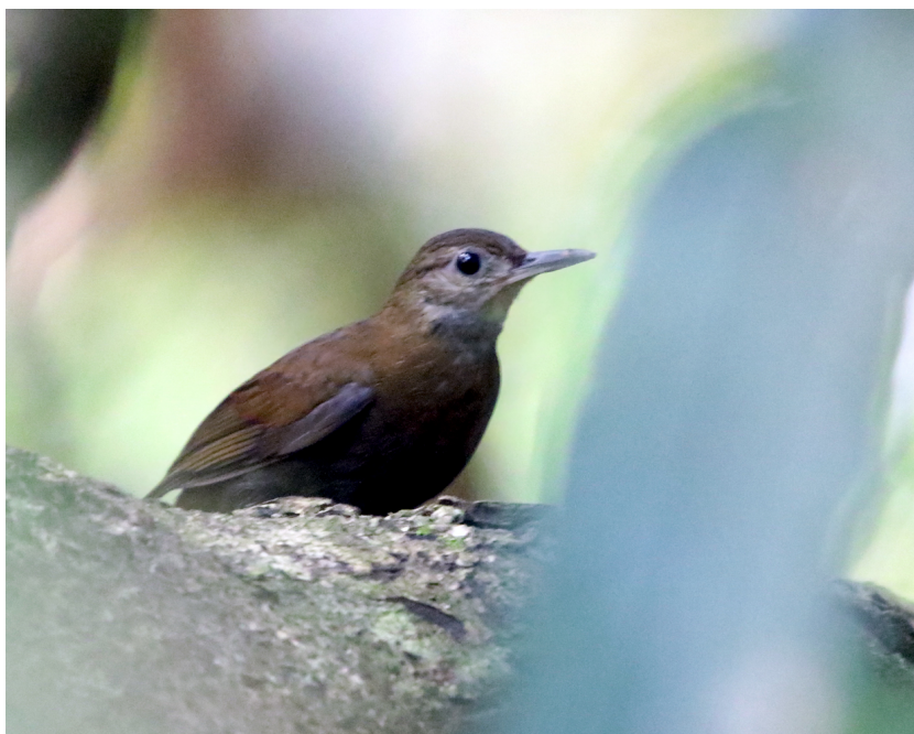
Gray-throated Leaf-tosser

As with most mornings, the great birding began even before breakfast with lots of bird activity around the lodge and verandah. The first stop on today's field trip was just a few miles Asa Wright, when a pair of Grey-throated Leaf-tossers flew across the road in front of us. With a little patience, the entire group was able to get looks at these always tough-to-see birds - a great start to the day!