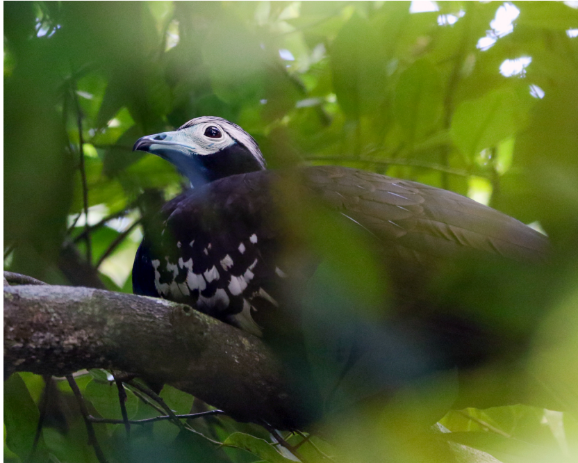
Trinidad Piping-Guan

Following an afternoon siesta, we took a leisurely stroll through the community where we enjoyed a surprising diversity of species. An adult Common Black Hawk posed in the golden light, keeping an eye on a younger bird nearby. Our first Bat Falcon of the trip zipped gracefully along the road and over a ridge, while a Gray-lined Hawk perched on a dead tree atop the hill. The air was filled with the sound of dozens of Orange-winged Parrots coming in to roost, a Green Kingfisher hunted in a wet field, a White-tipped Dove paraded around a yard and an Olive-gray Saltator sat silhouetted by the setting sun as we walked back to the lodge for yet another delicious meal.