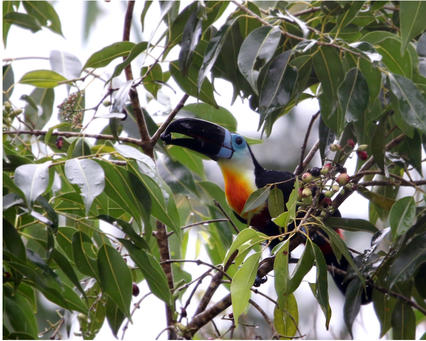
Channel-billed Toucan © Jared Clarke