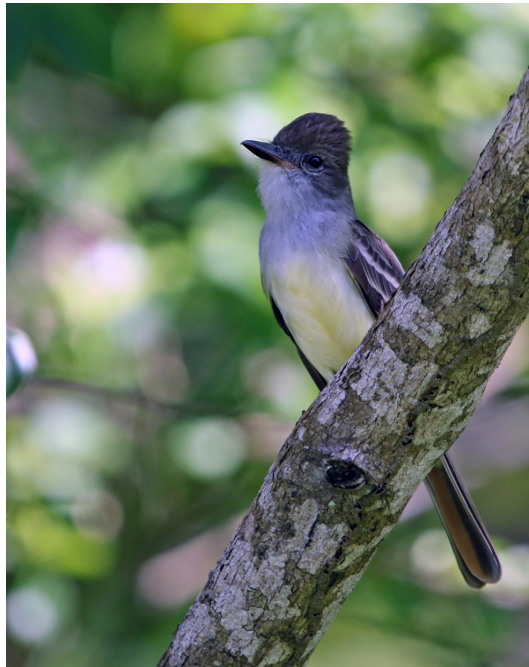
Brown-crested Flycatcher

This morning was a much anticipated one. After a leisurely breakfast, we boarded a boat with Captain Troy and headed just offshore to Little Tobago - a wonderful little island with some big birding opportunities. Since the boat was glass-bottomed, we took time to appreciate some of the coral reefs and accompanying creatures (fish, crabs, snails, etc.) along the way. After landing on a narrow jetty, we hiked and birded along the trail that leads uphill through the forest. A pair of Brown-crested Flycatchers peered down at us from the canopy, a large Hermit Crab ambled across the path, and we stopped to appreciate the ingenuity of a Trapdoor Spider . The climb to the top of the island was worth every step, since we found ourselves overlooking a large colony of Red-billed Tropicbird - perhaps one of the most beautiful and sought-after seabirds in the world. They soared around above, below and often right in front of us - a fantastic opportunity for the photographers in our group. The same cliffs were also home to dozens of nesting Brown and Red-footed Booby, while marauding Magnificent Frigatebirds circled around looking to steal an easy lunch. The spectacle of Little Tobago - a fantastic experience for everyone and the perfect way to end our birding adventure!