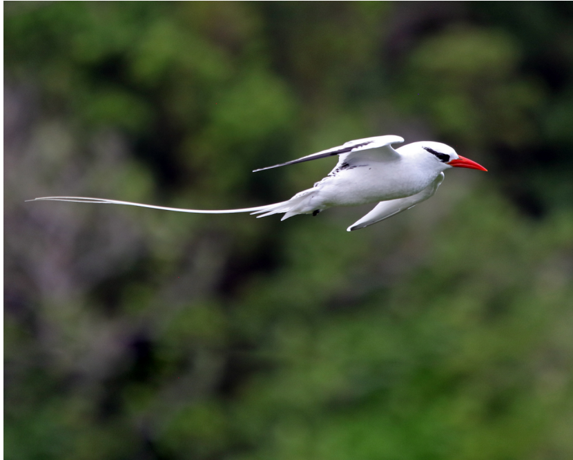
Red-billed Tropicbird

Back at the hotel property and adjacent Starwood Track, we managed to find several other target birds including a migrant Broad-winged Hawk, a smart-looking Northern White-fringed Antwren, Ochre-lored Flatbill and a flock of understated Scrub Greenlets.