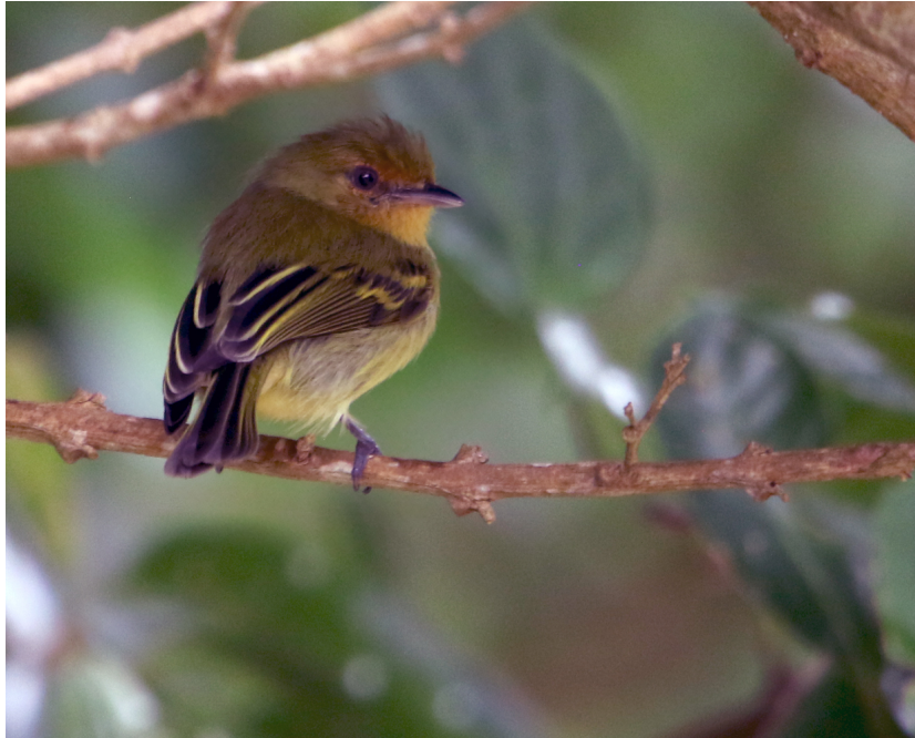
Ochre-lored Flatbill