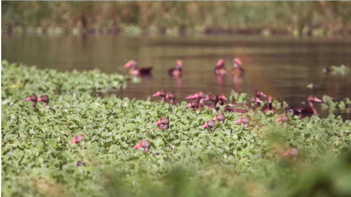
Black-bellied Whistling Ducks

We took our packed lunches to Adventure Farms - a private "sanctuary" with an array of hummingbird and fruit feeders as well as a lovely garden and trails. Always entertaining, the owners simply put out fresh fruit and ring a dinner bell, leading to a swarm of birds emerging from every tree and shrub on the property! Among the hungry visitors was our first Trinidad Motmot allowing amazingly close views, confiding Red-crowned Woodpeckers, a pair of Barred Antshrikes, Shiny Cowbirds, Spectacled Thrush and Blue-gray Tanager. While the hummingbird diversity is lower than on Trinidad, we did appreciate excellent views of Rufous-breasted Hermit and Ruby-topaz Hummingbird just feet from our faces (and cameras!). A stroll through the gardens offered up great views of Rufous-tailed Jacamar and our first pair of Northern White-fringed Antwrens.