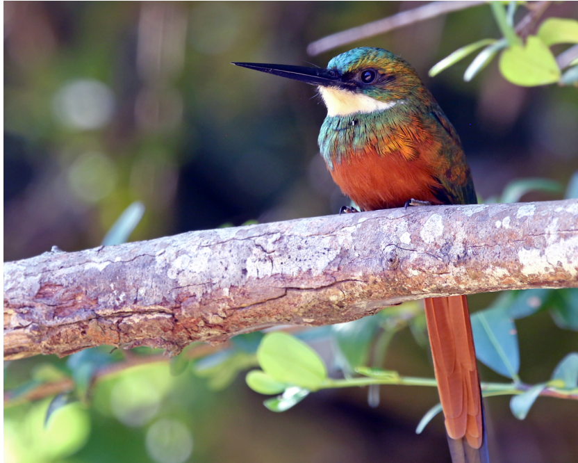
Rufous-tailed Jacamar

The afternoon was a very relaxing one with swims in the ocean, dips in the pool and probably a nap or two enjoyed amongst the group ☺ A rest well earned!