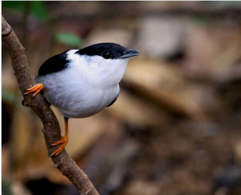
White-bearded Manakin