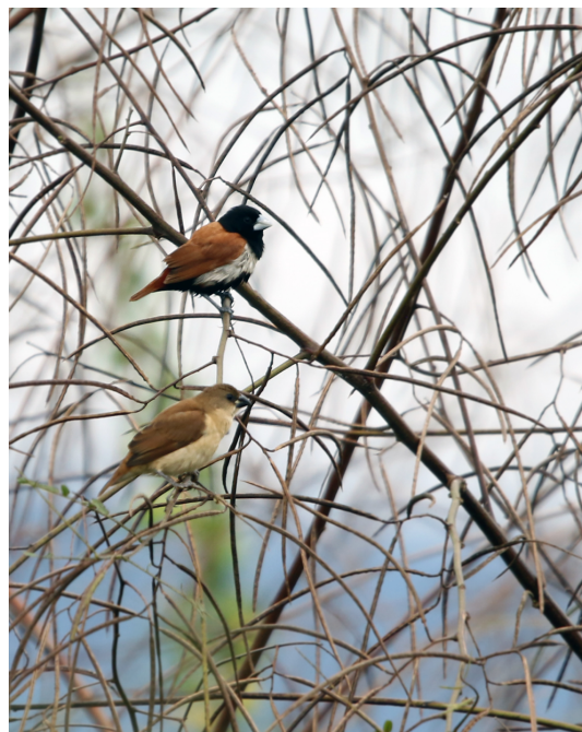
Tricolored Munia

Finally, we made our way to the famous Caroni Swamp Bird Sanctuary - a vast estuary comprising more than 500 hectares of mangroves and marshes. Our tour along the quiet channels and into the main estuary was fantastic - both for scenery as well as birds. A pair of Straight-billed Woodcreepers performed well for us, as did a little troupe of Greater Ani and an obliging Scarlet Ibis showing off its gaudy colour. Not so easy to spot was a secretive Little Cuckoo that crept through