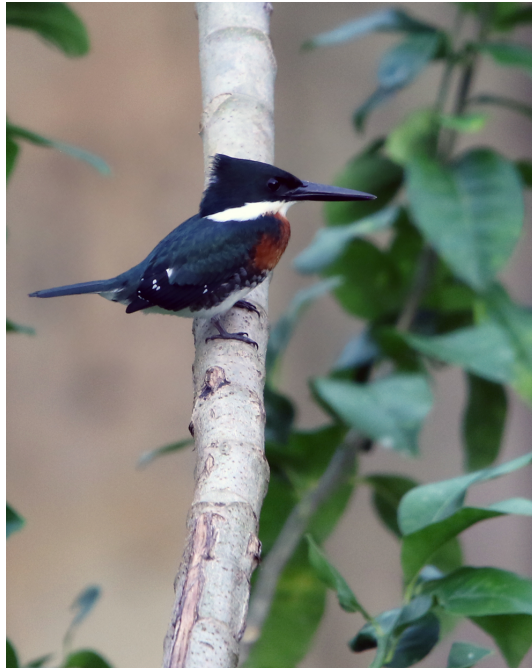
Green Kingfisher