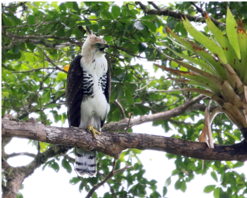
Ornate Hawk-Eagle

Our lunch stop at Brasso Seco was well timed as it gave us some cover from some short but heavy rain showers - and where many of us partook of some delicious local chocolate. We were even able to enjoy some great birds during lunch, including our only Southern Beardless Tyrannulet of the trip and a large mixed flock of both Blue-headed and Orange-winged Parrots feeding in nearby trees. Just down the road we enjoyed a raucous colony of Yellow-rumped Caciques and tried in vain to spot a