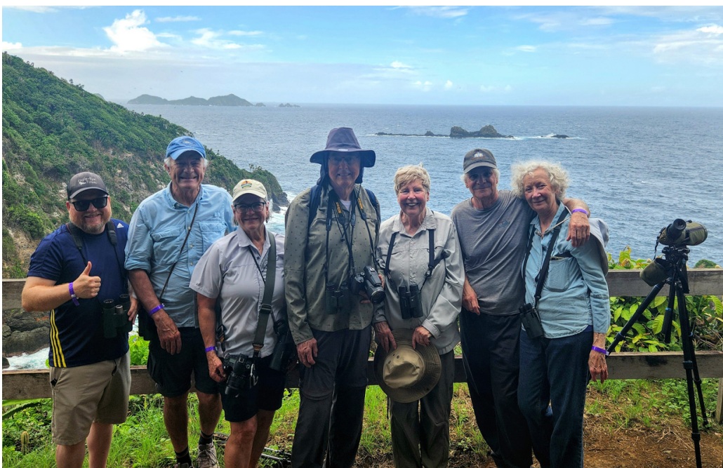
Our group on Little Tobago Island

A few of us took in one last bird walk along the Starwood Trace this morning, seeing many of our old friends plus a pair of Black-faced Grassquits. The last new bird for our trip, however, was an Eared Dove sitting on the wires as we later drove back to the Tobago airport.