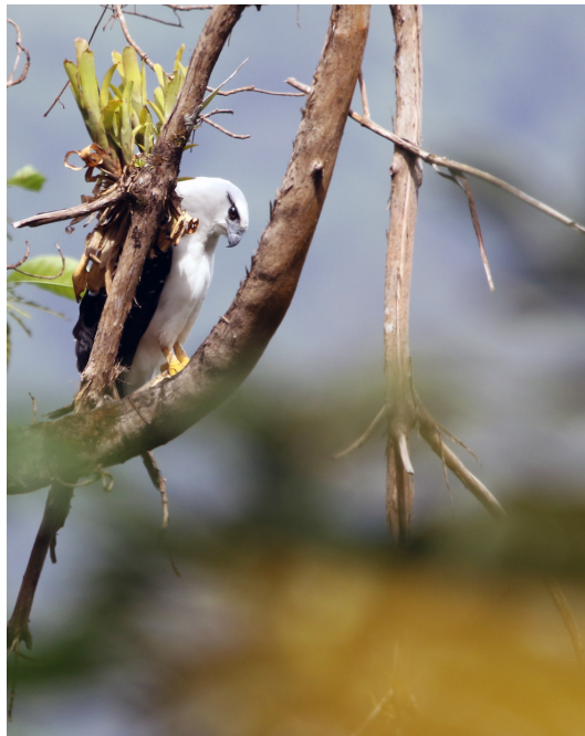
White Hawk

We ended our afternoon at the quaint village of Morne La Croix where we were treated to more new birds including Rufous-tailed Jacamar, Giant Cowbird, Boat-billed Flycatcher, Piratic Flycatcher, and