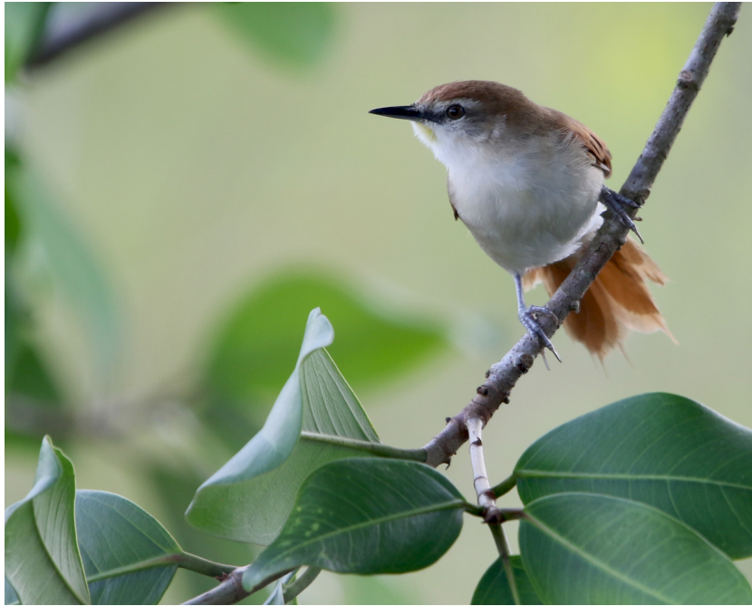
Yellow-chinned Spinetail

Most of our morning was spent exploring some fantastic lowland habitats - the relatively arid, grassy and agricultural areas known as the Aripo Savanna. Here we encountered several raptors that specialize in open grasslands: Crested Caracara, Yellow-headed Caracara, Zone-tailed Hawk and Savannah Hawk. The latter were seen on several occasions perched on wires, sitting on perches and stalking through the grass with the aid of their characteristic long legs. We enjoyed great looks at one of our main targets for the morning, a brilliant Red-breasted Meadowlark sitting regally atop a fence post. Nearby we found a pair of flitty Yellow-chinned Spinetails, our first Gray Kingbird and both Pied Water-Tyrant and White-headed Marsh Tyrants posing cooperatively in the roadside shrubs.