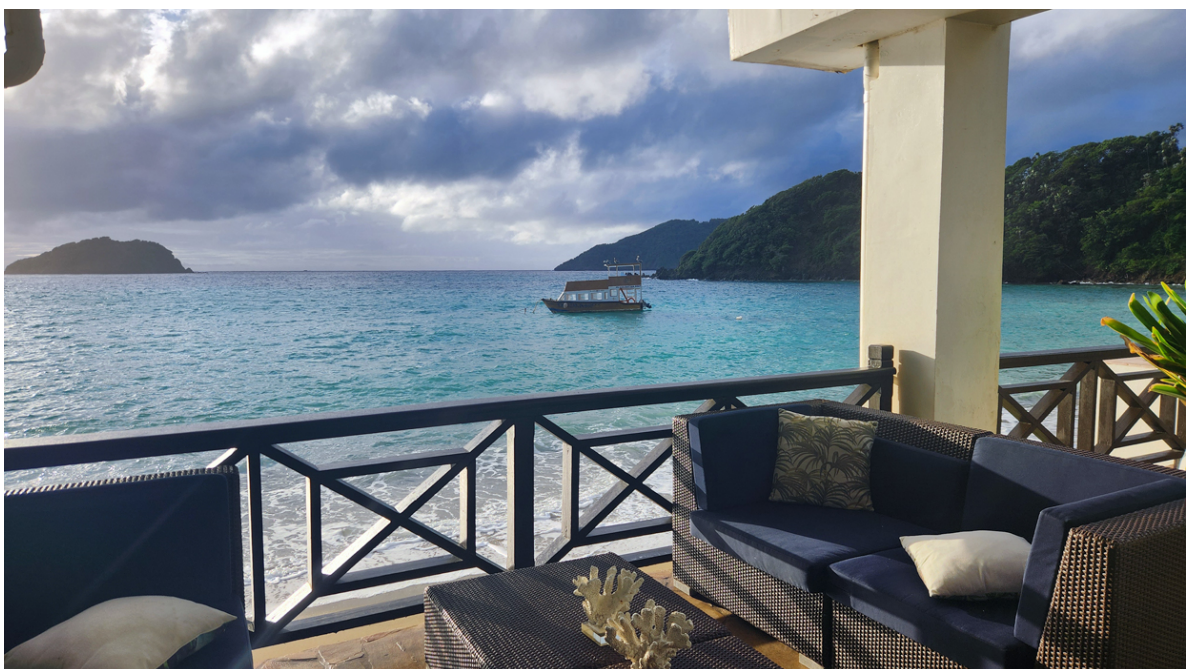
Blue Waters Inn

We ended the day by checking in to our very relaxed beachside accommodations at Blue Waters Inn, on the outskirts of Speyside. The chill Tobago vibes are very real!