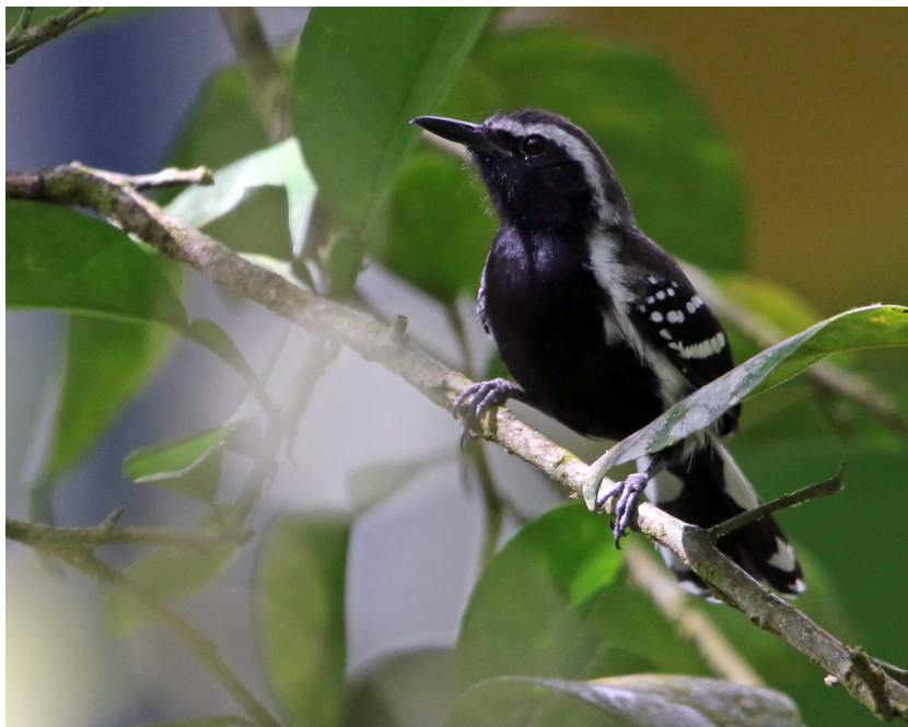
Northern White-fringed Antwren

Back at the hotel property and adjacent Starwood Track, we managed to find several other target birds including a migrant Broad-winged Hawk, a smart-looking Northern White-fringed Antwren, Ochre-lored Flatbill and a flock of understated Scrub Greenlets.