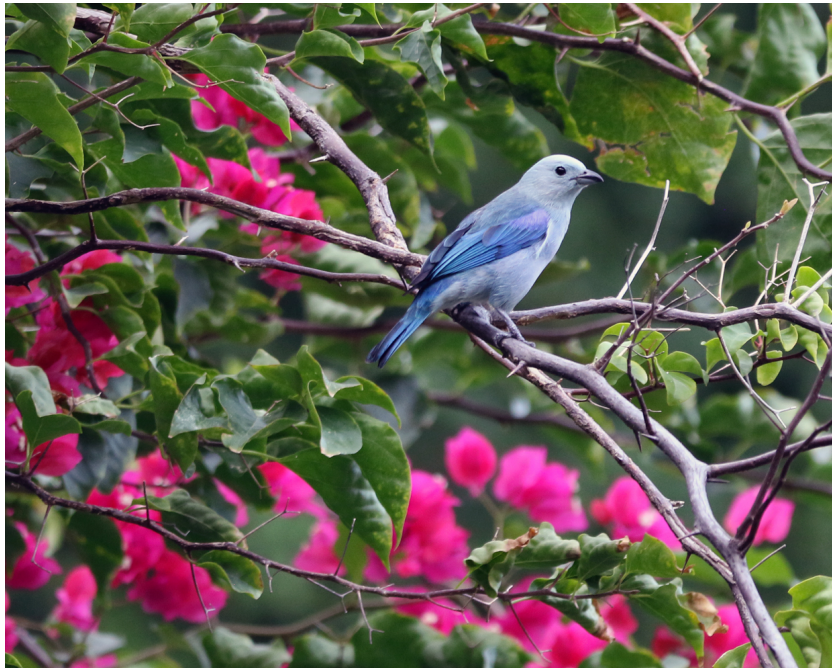
Blue-gray Tanager © Jared Clarke

We ended the day by checking in to our very relaxed beachside accommodations at Blue Waters Inn, on the outskirts of Speyside. The chill Tobago vibes are very real!