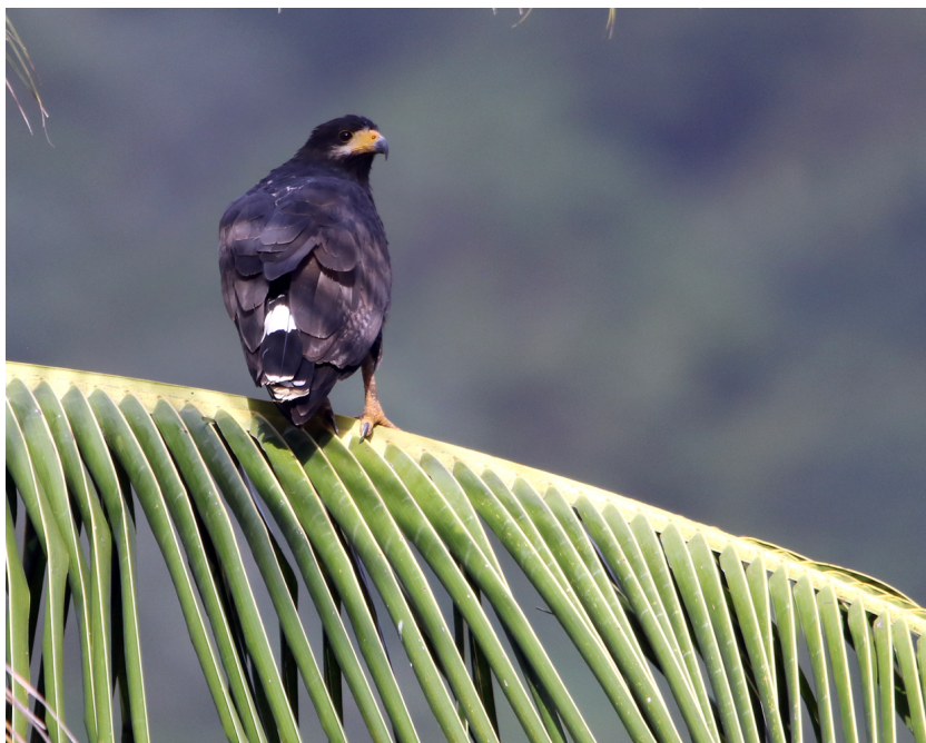
Common Black Hawk

Following an afternoon siesta, we took a leisurely stroll through the community where we enjoyed a surprising diversity of species. An adult Common Black Hawk posed in the golden light, keeping an eye on a younger bird nearby. Our first Bat Falcon of the trip zipped gracefully along the road and over a ridge, while a Gray-lined Hawk perched on a dead tree atop the hill. The air was filled with the sound of dozens of Orange-winged Parrots coming in to roost, a Green Kingfisher hunted in a wet field, a White-tipped Dove paraded around a yard and an Olive-gray Saltator sat silhouetted by the setting sun as we walked back to the lodge for yet another delicious meal.