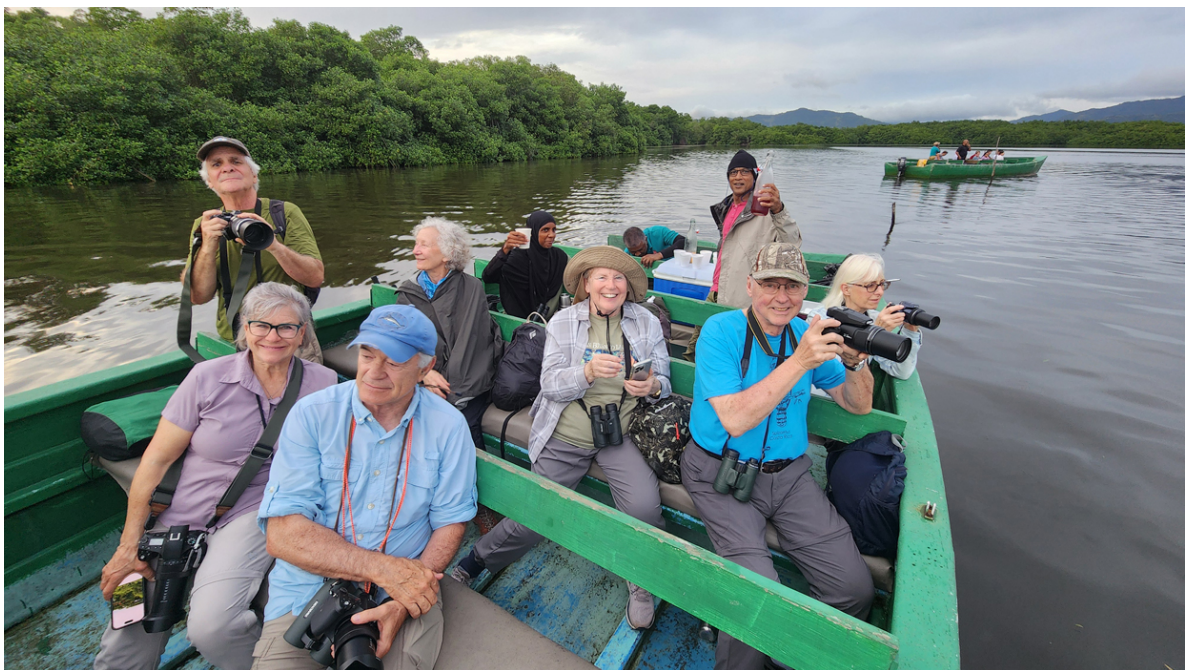
Our group in Caroni