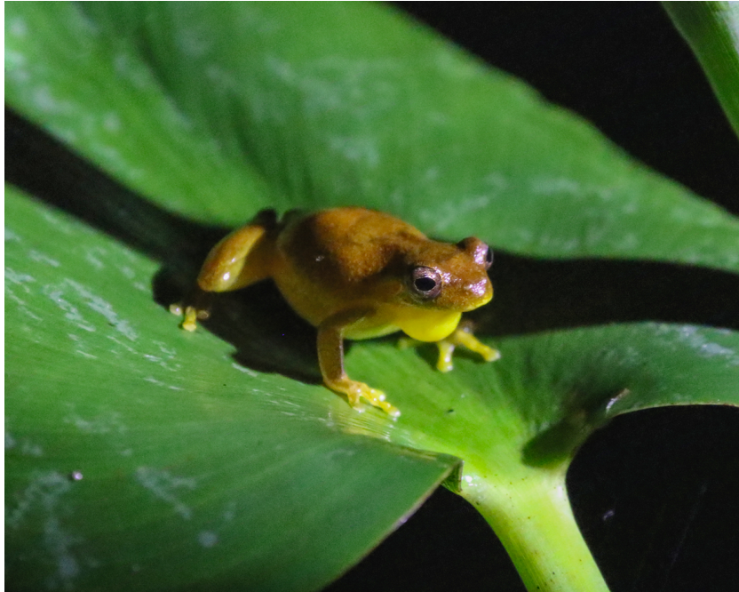
Rattling Voice Tree Frog

Late morning, we hiked down the valley to see the enigmatic Oilbird roosting in Dunstan Cave. These almost mythical birds are the only nocturnal fruit-eating birds in the world, using a combination of echolocation (just like bats!) and specially adapted eyesight to navigate in the dark. We earned our views of this very special bird, clamouring over rocks and wading through water over our boots to access their cave - but the reward was worth it! The hike itself was little quiet, but did include our best views of a male Golden-headed Manakin and some very vocal Green Hermits defending their favourite flowers.