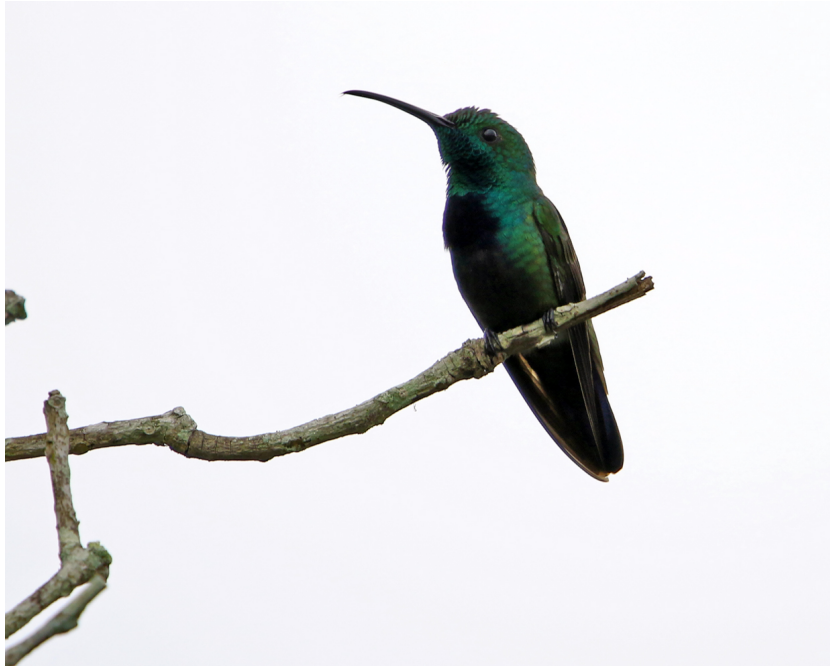
Green-throated Mango © Jared Clarke