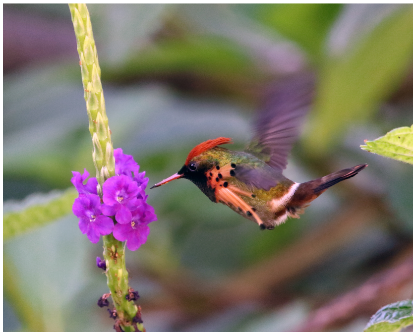
Tufted Coquette © Jared Clarke