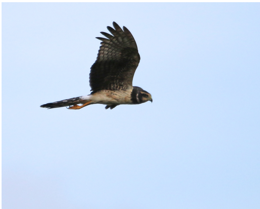
Long-winged Harrier © Jared Clarke