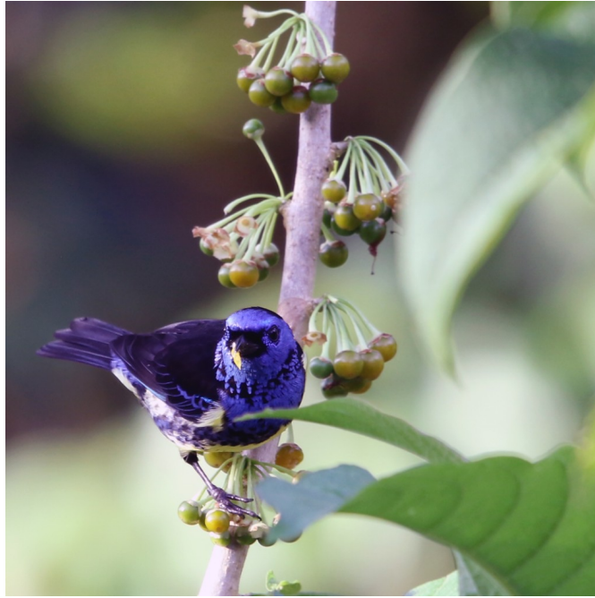
Turquoise Tanager