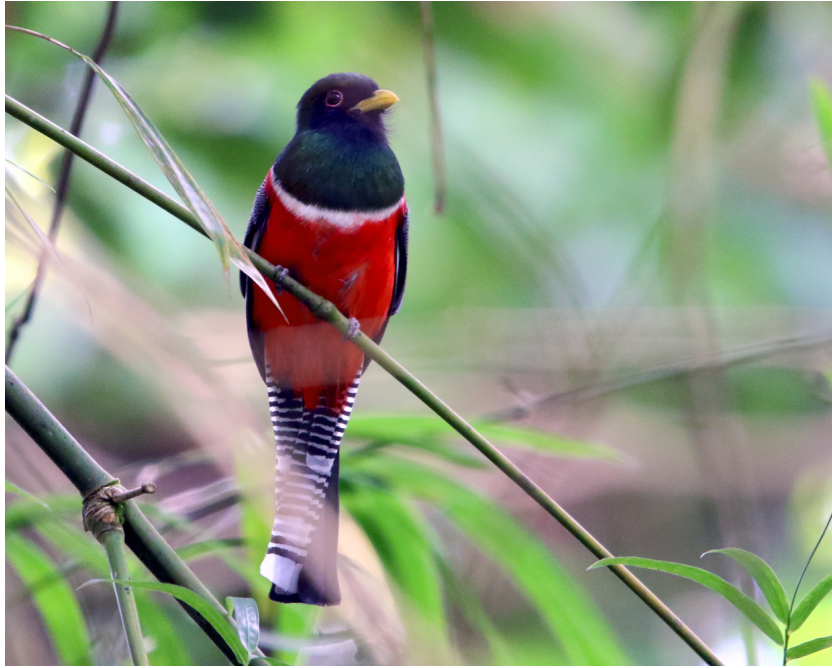
Collared Trogon