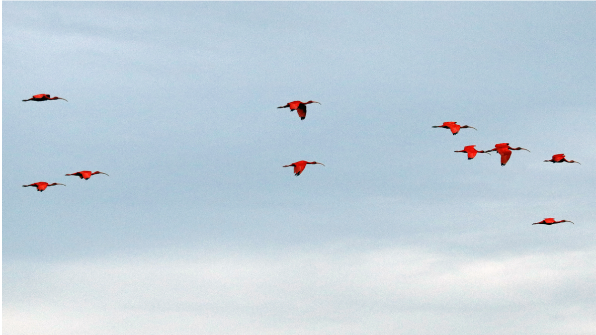
Scarlet Ibis in flight