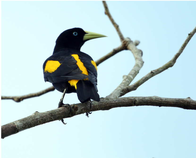
Yellow-rumped Cacique

Ferruginous Pygmy Owl calling from the canopy. A White Hawk posed beautifully along the way, giving the hawk-eagle a run for its money in the “stunning looks” department ;)