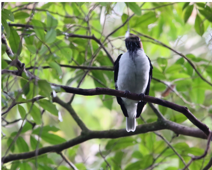
Bearded Bellbird

Late afternoon we walked the Discovery Trail in search of Bearded Bellbirds - perhaps the loudest birds in the world, and a sought-after species in these forests. We had seen them distantly from the verandah, calling from atop the canopy below - but with lots of patience we managed to spot two at much closer range and were awed by their deafening “clang”. We also stopped to watch a group of male White-bearded Manakins displaying at their lek - snapping their wings and hopping from twig to twig over their carefully curated “arenas”. Such fun birds!!