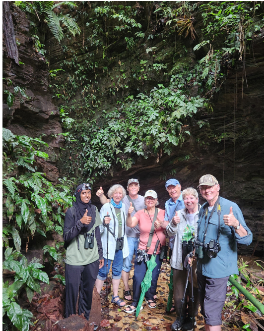
Our group at Dunstan Cave

Late afternoon we walked the Discovery Trail in search of Bearded Bellbirds - perhaps the loudest birds in the world, and a sought-after species in these forests. We had seen them distantly from the verandah, calling from atop the canopy below - but with lots of patience we managed to spot two at much closer range and were awed by their deafening “clang”. We also stopped to watch a group of male White-bearded Manakins displaying at their lek - snapping their wings and hopping from twig to twig over their carefully curated “arenas”. Such fun birds!!