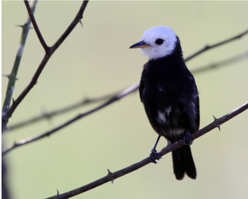
White-headed Marsh-Tyrant

After a breezy lunch alongside the ocean at Manzanilla Beach, we headed southeast along the coast to the rich mangroves and flooded fields of Nariva Swamp. An initially “quick” stop near the mouth of the Nariva River proved very birdy with great views of Black-crested Antshrike, the normally skulky Silvered Antbird, Northern Scrub Flycatcher and a Bicolored Conebill among others. Most exciting was a handsome Rufous Crab Hawk sitting quietly among the mangroves - we could easily have missed it except for Kenna Sue’s eagle eyes! We also spied three kingfishers along the river - Ringed, Green and the diminutive American Pygmy Kingfisher. We had to tear ourselves away to squeeze in our final birding destination at the town of Kernaham, where we scoured the vast flooded fields (mostly former rice paddies) for a variety of wetland species. Highlights included Purple Gallinule, Striated Heron, Limpkin, Yellow-hooded Blackbird and Yellow Oriole. A Long-winged Harrier soared by twice, provided excellent eye-level views. An added surprise popped up in the way of a several Yellow-headed Amazons heading off to roost for the evening.