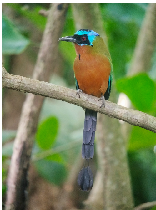
Trinidad Motmot