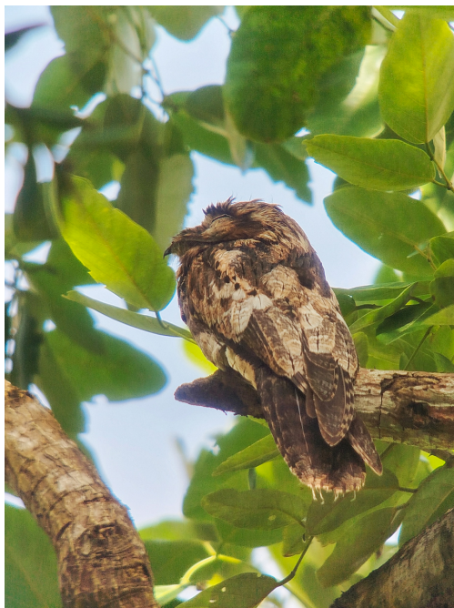
Common Potoo