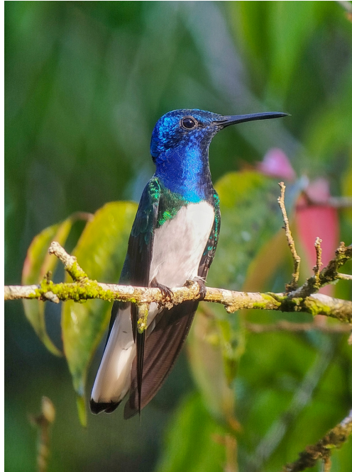
White-necked Jacobin

Our incredibly knowledgeable local guide Dave Ramlal picked us up after breakfast and we began birding along the road that continues up the Arima Valley where we saw White-winged Becard, Crested Oropendola, Short-tailed Hawk, Olive-sided Flycatcher, brief glimpses of Swallow Tanager and White Hawk. Continuing down towards the village of Brasso Seco we encountered a small army ant swarm and had views of the skulky White-bellied Antbird and Barred Antshrike. We ate our picnic lunch in this village and we had a short rain shower which we hoped would bring out the birds, and so it did! We stopped along the roadside on the drive back and had great views of Channel-billed Toucan , Golden-headed Manakin, White-necked Thrush, Southern Beardless-Tyrannulet and the gorgeous Bay-headed and Speckled Tanagers! We returned to Asa Wright in time for afternoon tea and some birding from the veranda before nightfall.