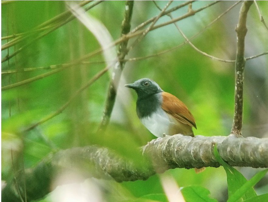
White-bellied Antbird