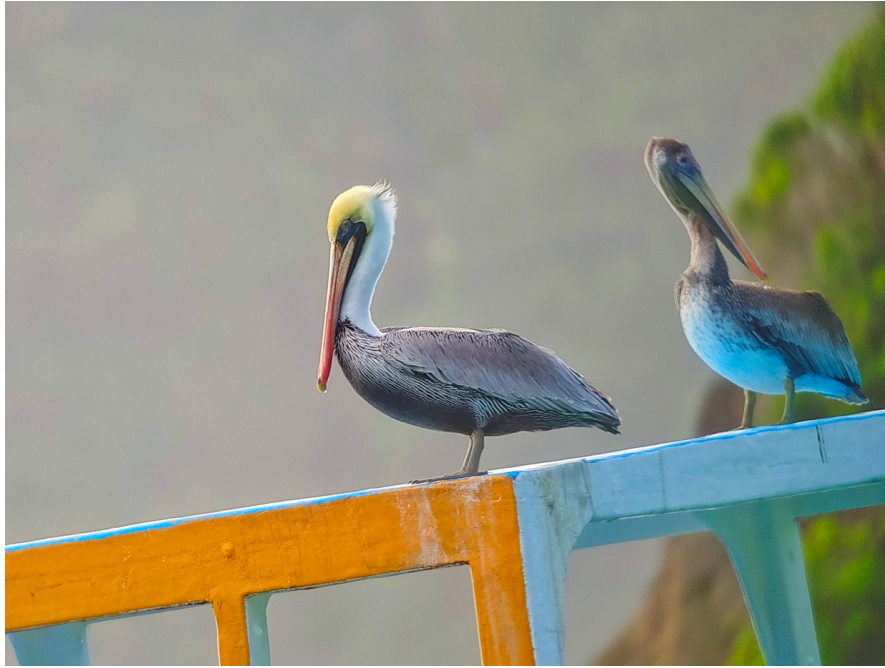
Brown Pelican