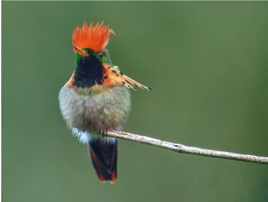
Tufted Coquette