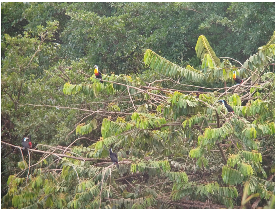
Channel-billed Toucans