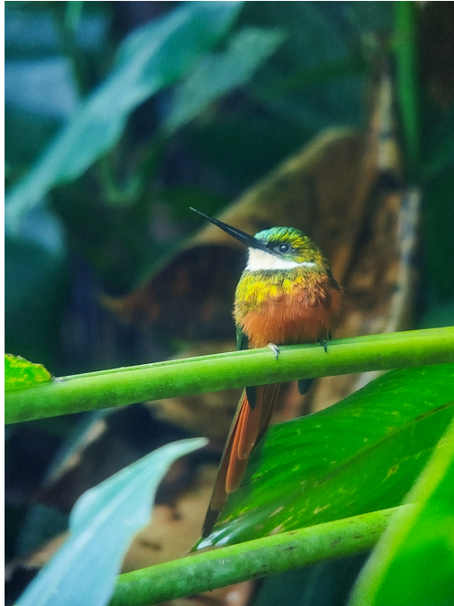
Rufous-tailed Jacamar