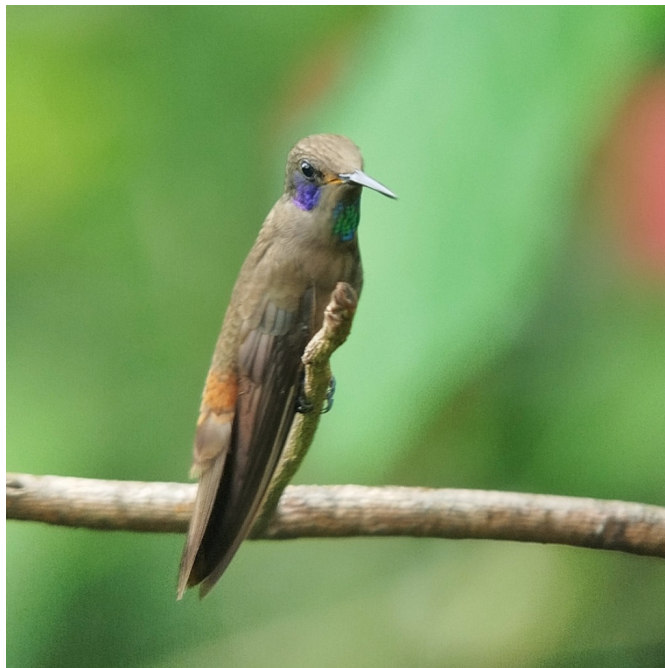
Brown Violetear