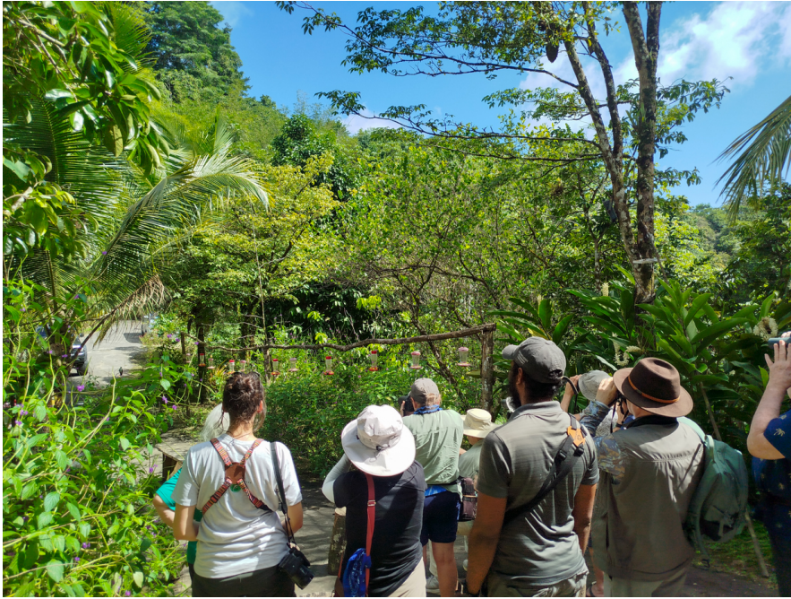
Birding at Bajnath's Estate