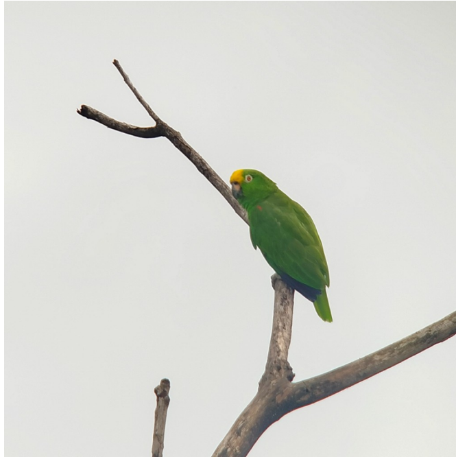
Yellow-crowned Parrot