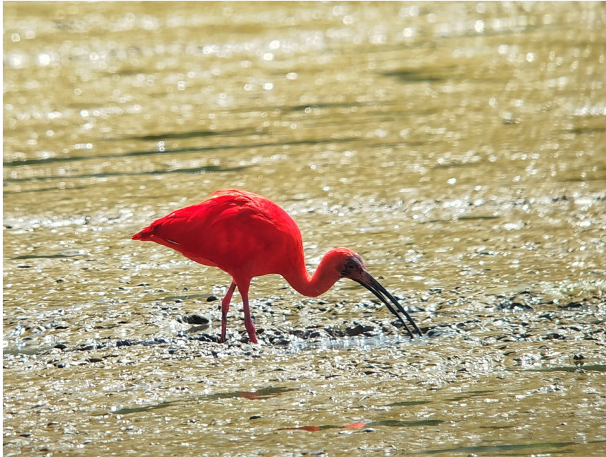
Scarlet Ibis

For lunch we stopped at a popular roti shop for lunch and had a delicious, traditional Trini-curry meal. After lunch we birded a side road near the mangroves called Sumaria Trace and saw Common Gallinule, Green-throated Mango , Yellow-hooded Blackbird, Ringed Kingfisher, Yellow-chinned Spinetail, Tricolored Munia and Common Waxbill.