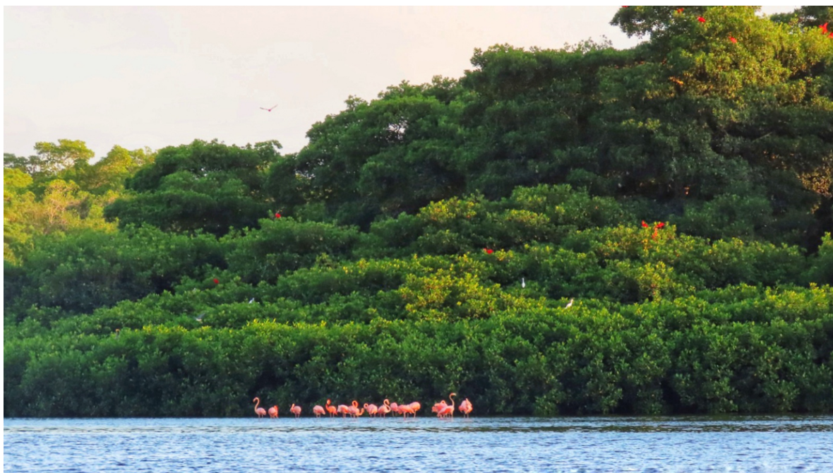
Caroni Swamp

mangrove forest and spotted Straight-billed Woodcreeper, Black-crested Antshrike, Green Kingfisher, Bicolored Conebill, many American Redstarts and Yellow-crowned Night-Heron, as well as two Ruschenberg's Tree Boas. The main objective of our boat ride however, was occurring on a small mangrove island in the center of the reserve . Here literally thousands of birds come to roost every evening including hundreds of egrets and herons, American Flamingos and well over a thousand Scarlet Ibis which make the island change from emerald green to scarlet red by sundown! Once the sun was gone we slowly worked our way back out of the mangroves searching for critters as we went and we spotted Common Pauraque, Common Potoo, a sleeping American Pygmy-Kingfisher and several Spectacled Caimans.