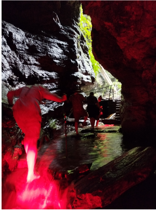
Oilbird Cave

We slowly walked back to the lodge for lunch and a siesta before we ventured out in the afternoon down the Discovery Trail. Here we had two targets, the Bearded Bellbird and White-bearded Manakin , and we succeeded at both! The male bellbird gave us prolonged views as it sang from a low tree and the manakins performed their display at their lek near the ground only a few meters in front of us.