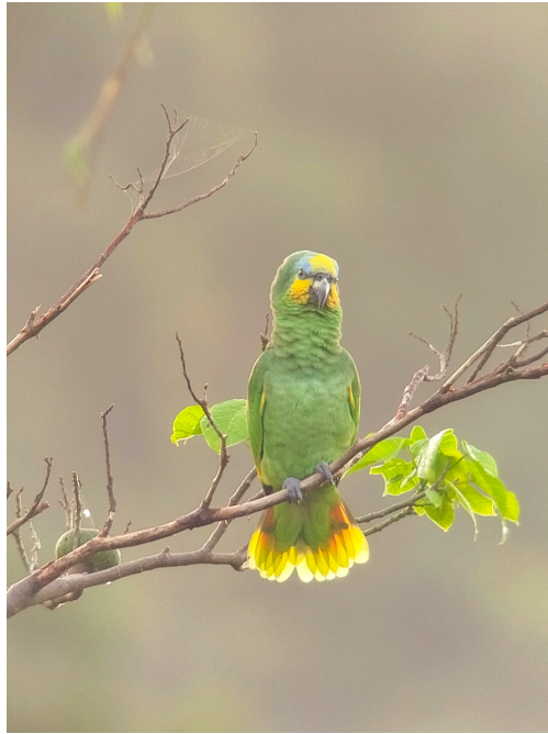
Orange-winged Parrot

soon after and spotted two amazing tropical raptors, an Ornate Hawk-Eagle flying low over the forest and a Gray-headed Kite perched on a snag. At our next stop we found Savanna Hawk, White-headed Marsh-Tyrant , Giant Cowbird and many Grassland Yellow-finches flying around us, seemingly disappearing in the dense bushes. After lunch we drove through some rain as we neared Nariva and it stopped just in time for us to get out and bird. We began with fantastic scope views of Orange-winged and Yellow-crowned Parrots , Crested and Yellow-headed Caracaras, many Southern Lapwings , Blue-and-yellow Macaws, Striated Heron and the best views ever of Long-winged Harrier as a dark morph slowly patrolled the marsh at very close range. After our afternoon tea we began our drive back, only making a brief bathroom stop where we also saw Green-rumped Parrotlets.