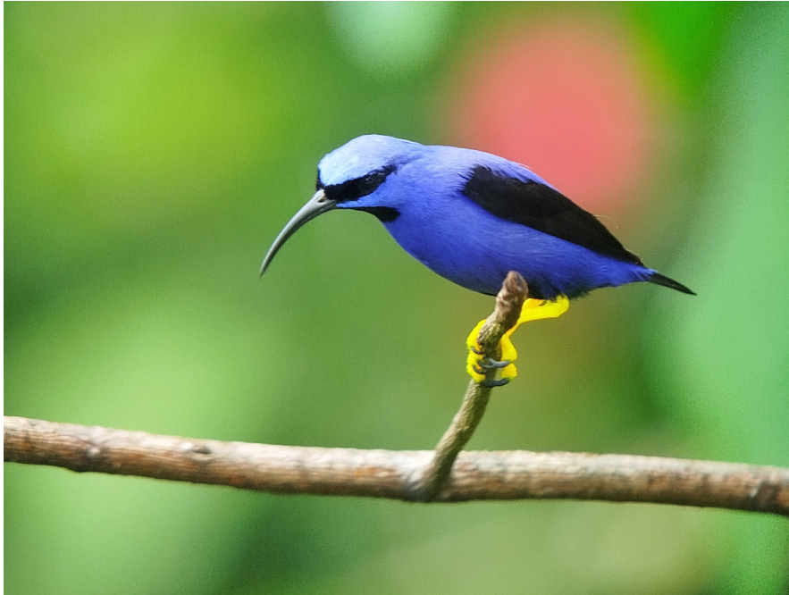
Purple Honeycreeper