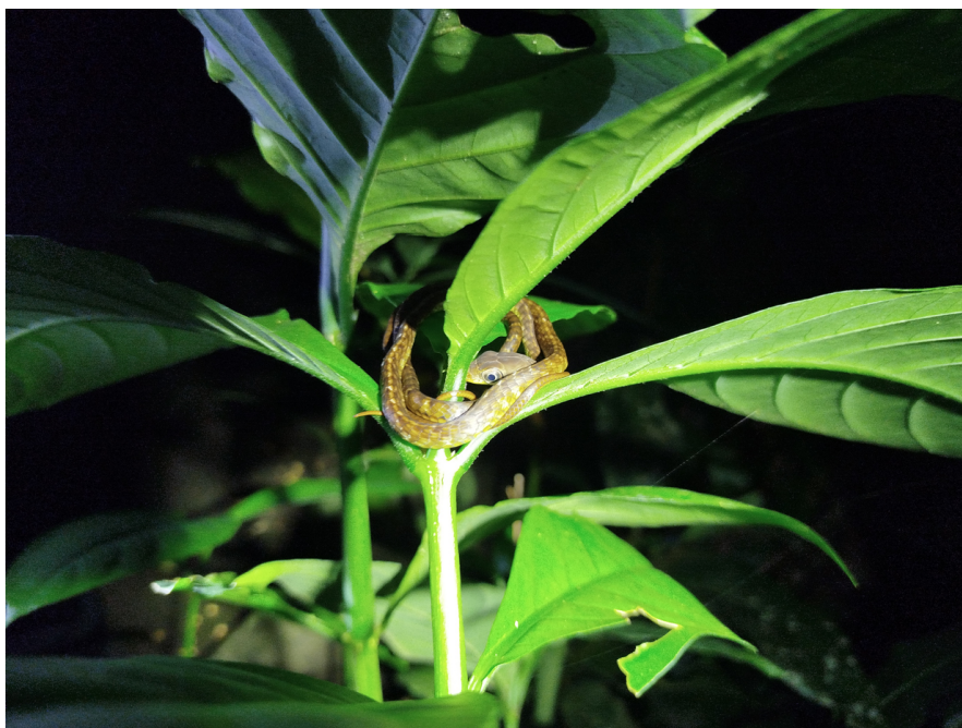
Long-tailed Machete

and found Yellow Tree frog, Lesser Antillean Whistling Frog, Thick-tailed Scorpion, mountain crabs, a small snake called the Long-tailed Machete and many more interesting invertebrates.