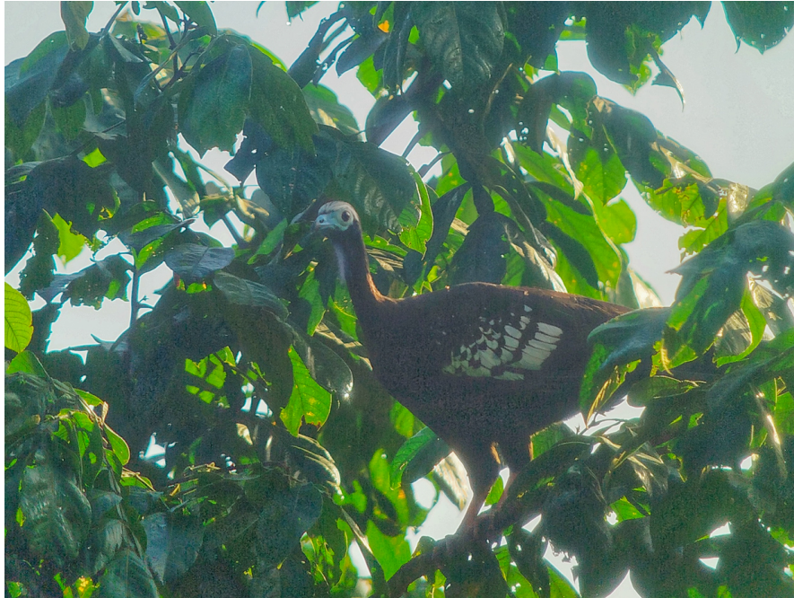
Trinidad Piping Guan

After about an hour the guans began to make their appearance, coming into a fruiting wild nutmeg tree from which they were feeding. We all had superb and extended views and once the guans moved away we went back to the hotel for our own breakfast. Mid-morning we walked through the village and down to the big river, or Grand Riviere, and despite the heat we saw Giant Cowbird, Green Kingfisher, Gray-lined Hawk, Common Black Hawk and a Black Hawk-Eagle. After lunch we birded a road through old cocoa plantations and saw White-bearded Manakin, Black-tailed Tityra, Rufous-breasted Wren, Ferruginous Pygmy-Owl, many Orange-winged Amazons and even another guan, resting in a tree alongside the road.