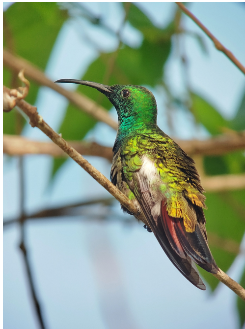
Green-throated Mango

For lunch we stopped at a popular roti shop for lunch and had a delicious, traditional Trini-curry meal. After lunch we birded a side road near the mangroves called Sumaria Trace and saw Common Gallinule, Green-throated Mango , Yellow-hooded Blackbird, Ringed Kingfisher, Yellow-chinned Spinetail, Tricolored Munia and Common Waxbill.