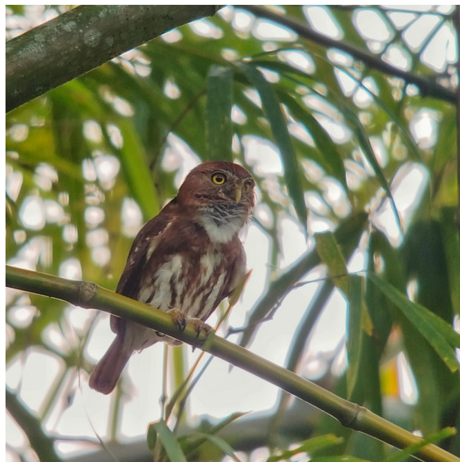
Ferruginous Pygmy-Owl