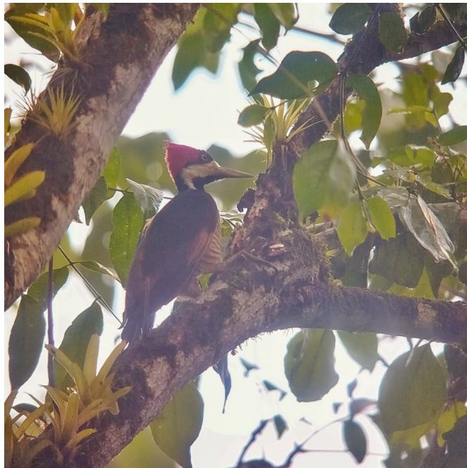
Crimson-crested Woodpecker

Before breakfast we walked the same road from the evening before and had great birds including Crimson-crested Woodpecker , a Streaked Xenops excavating it's nest cavity, Olive-gray Saltator, Trinidad Euphonia and the extremely skulky Silvered Antbird. After breakfast we drove to the main airport outside of Port of Spain for our flight to the sister island of Tobago. Here we were met by Gairy who drove us to Blue Waters Inn, our home for the next three nights.