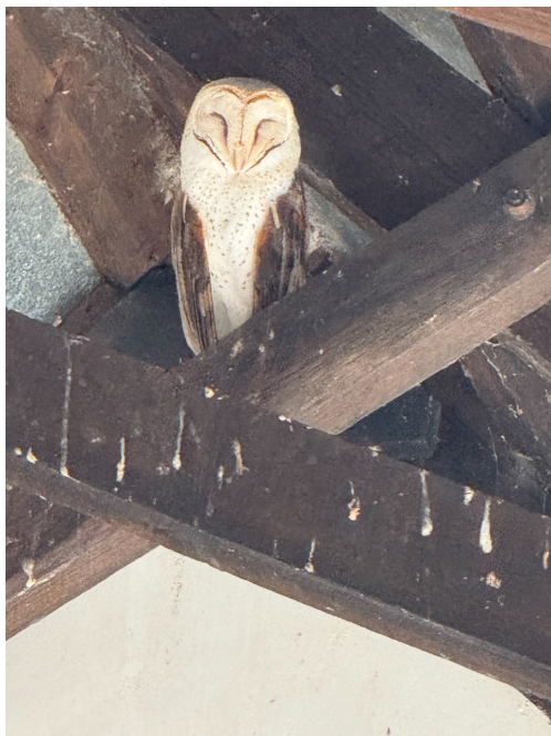
Barn Owl

The hornbills (seven species seen), the amazing 'Common' Hoopoe and the various wood-hoopoes and scimitar-bills, the four species of owl : from tiny African Scops to the giant Verreaux's and all of them snoozing, or trying to, at their diurnal roosts?