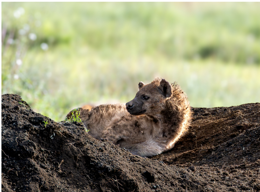
Hyena

Moreover, we enjoyed multiple “Long Rains” compensations for a slightly smaller list : the butterflies and dragonflies, the amphibians and reptiles, these groups in particular provided some special “Green Season” wonder. Experiences, some of which I have never had before. Please recall I lived in Tanzania for twelve years from 2005 to 2017. Among the mammals, particularly rewarding for me were the Spotted Hyenas who foraged around our luxury camp in the centre of the vast Serengeti and who could actually be heard laughing in the early morning.