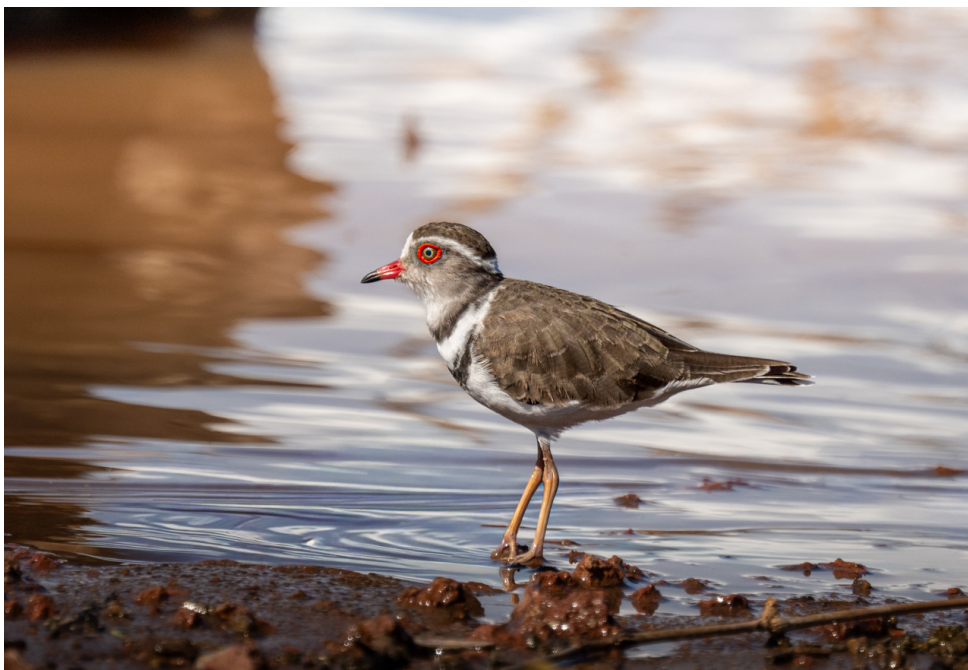
Three-banded Plover

The weavers of Tanzania come together with many of Africa's fantastic selection of starlings. Amazing birds who superficially resemble the many grackles of the New World. The starlings and the sunbirds are the most scintillating of all in Africa. The most brilliant of all the amazing birds which appear, at times, to be lining-up along the road side as if for our delectation. We "did well" for sunbirds with a total of 11 species being seen by the group. Mention must also be made of the