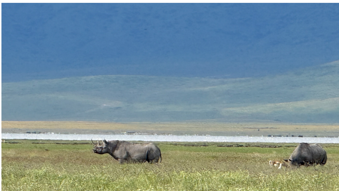
Black Rhinoceros