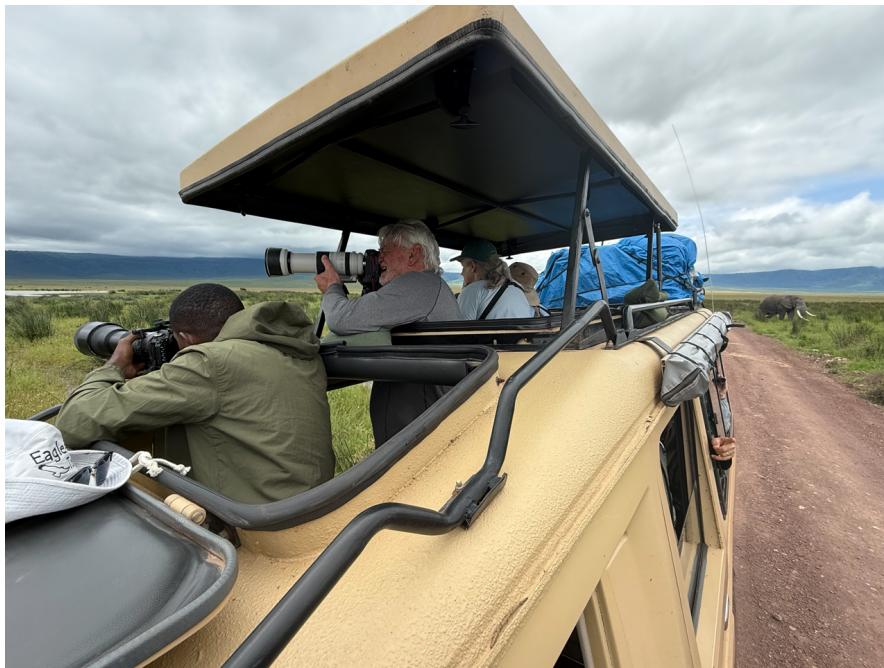
In the Crater

More than anything I think the scenic diversity and unspoiled landscapes are what makes this safari