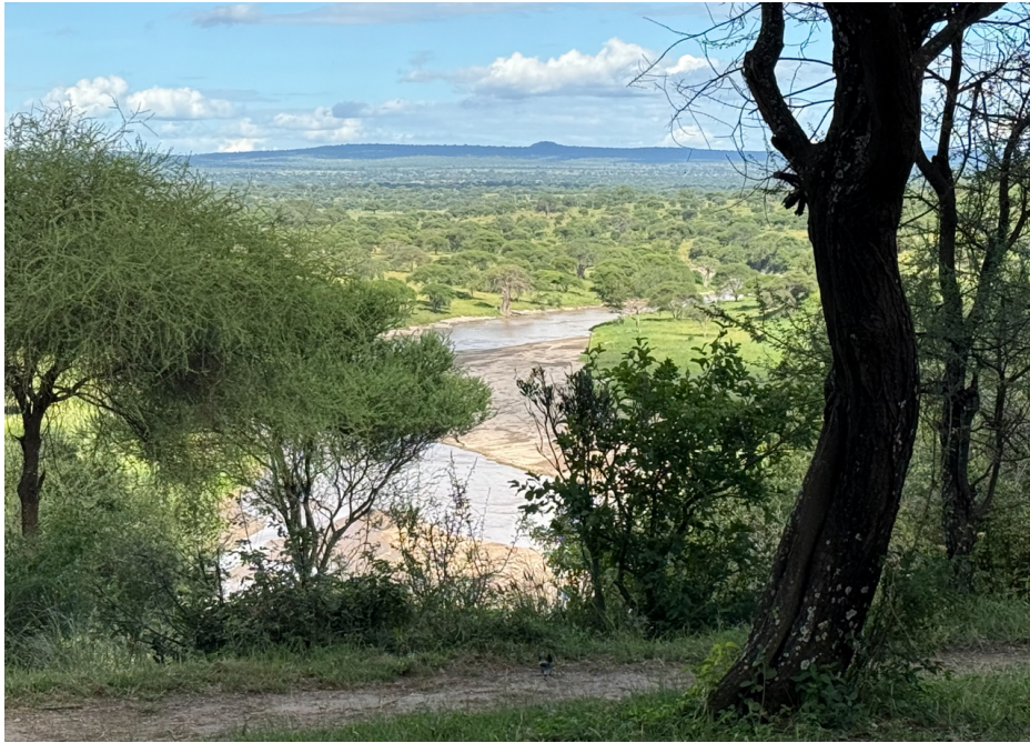
Tarangire Safari Lodge

bishops. Who could fail to gasp when a male Black Bishop pops-up in 'pom-pom' display and only a few feet away? "Tangerine Bishop" might be a more descriptive term for this particularly fine species.