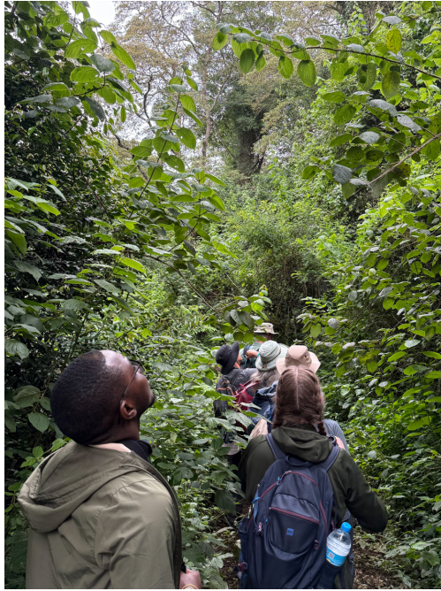
Endoro Forest

I haven't even mentioned the larger birds here. Well, where to start? Perhaps the pair of Secretary-birds at their nest, on top of a low acacia, beside a public road through the Grumeti Conservancy.