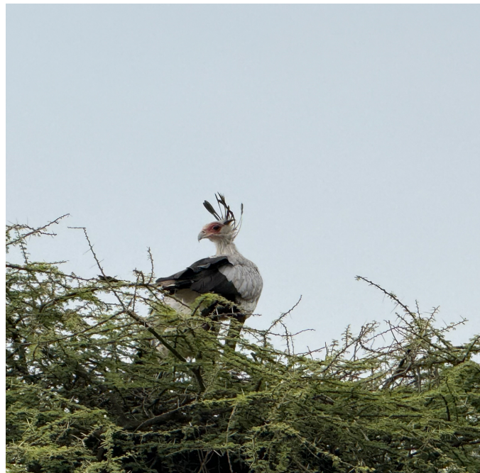
Secretary-bird

I haven't even mentioned the larger birds here. Well, where to start? Perhaps the pair of Secretary-birds at their nest, on top of a low acacia, beside a public road through the Grumeti Conservancy.