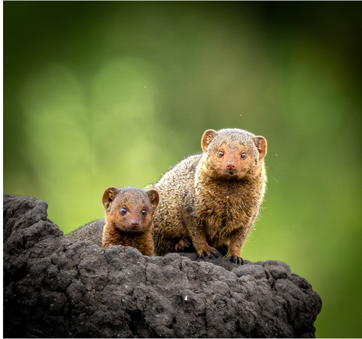
Mongoose

We saw both the open country hyraxes and really well. Strangely one can see both the diurnal species of Hyrax on the same rocks near Seronera. Despite careful scrutiny, and being able to separate the one from the other, it remains hard to accommodate the fact that these guinea pig-style animals are the nearest living relatives of the mighty Savanna and Forest Elephant. However, Top Spot among the mammal observations on this safari goes, as it so often does, to the fantastic Leopard. We saw five animals in total and on each occasion it was breathtaking. Watching the male of a pair who has been courting, pausing for a drink at an overnight puddle, early one morning on a bend in the road above Ngorongoro Crater will remain with us all forever. An absolutely breathtaking encounter. And with such a graceful and secretive being. Unimprovable! Once in a lifetime!