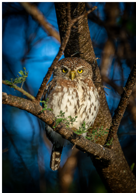
Pearl-spotted Owlet

The pair of Narina Trogons at their nest hole which we found in Arusha. The tiny Brown-backed Honeybird above the splendid accommodation at "The Retreat". Too many birds to mention in this little essay here, besides which everyone has their own particular favourites. Their cherished memories! Personally, I hope my memory of a displaying Hartlaub's Bustard, only feet away from us all beside the LandCruiser, in the beautiful flower-filled grasslands of Tarangire NP will remain with