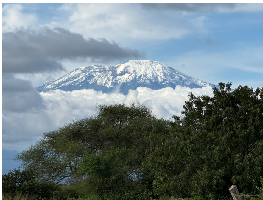
Kilimanjaro

Looking back in my mind's eye upon our Birding and Wildlife Safari from the cool and disconcerting quiet of the "Global North" Northern Tanzania really does offer the discerning traveller an utterly unique adventure. Nowhere else on Earth could we have witnessed what we saw during our two weeks in Tanzania in late April.