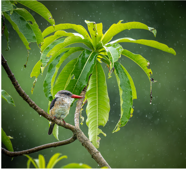
Brown-hooded Kingfisher