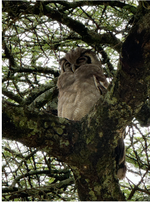
Verreaux's Eagle-Owl