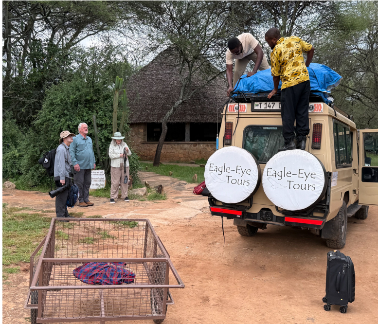
At the lodge

Moreover, we enjoyed multiple “Long Rains” compensations for a slightly smaller list : the butterflies and dragonflies, the amphibians and reptiles, these groups in particular provided some special “Green Season” wonder. Experiences, some of which I have never had before. Please recall I lived in Tanzania for twelve years from 2005 to 2017. Among the mammals, particularly rewarding for me were the Spotted Hyenas who foraged around our luxury camp in the centre of the vast Serengeti and who could actually be heard laughing in the early morning.