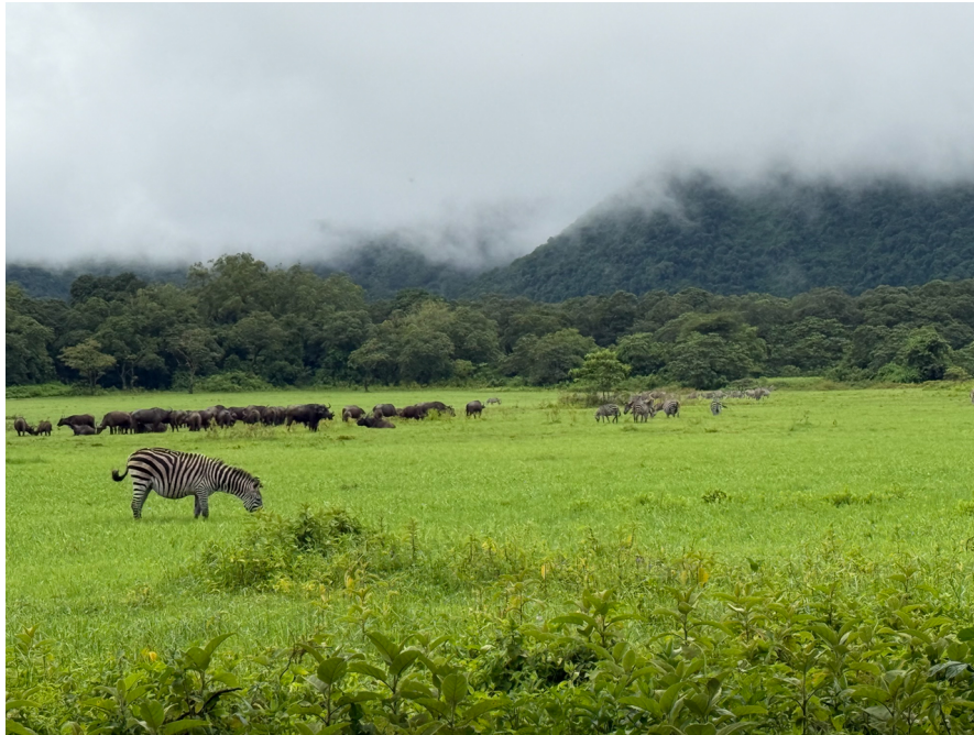
Cape Buffalo © James Wolstencroft