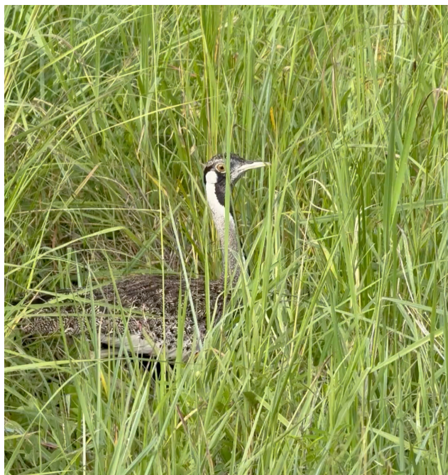
Hartlaub's Bustard

Yes, looking back from our normal lives a Birding and Wildlife Safari in Tanzania can certainly seem like a wonderful dream. A dream one hopes somehow will come again and soon.