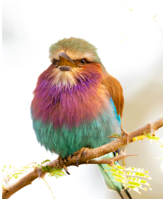
Lilac-breasted Roller