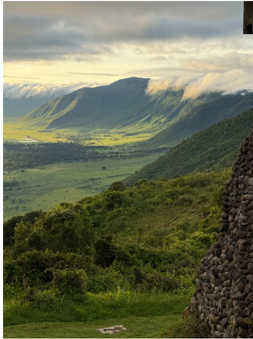
Ngorongoro Crater

measure of the safari as a whole. If the participants are awed by their individual experience here, then I am a “happy birder”, like in those days of old! And today I am pleased to report that, collectively, we have never been disappointed by this a quintessential “Big Day”.