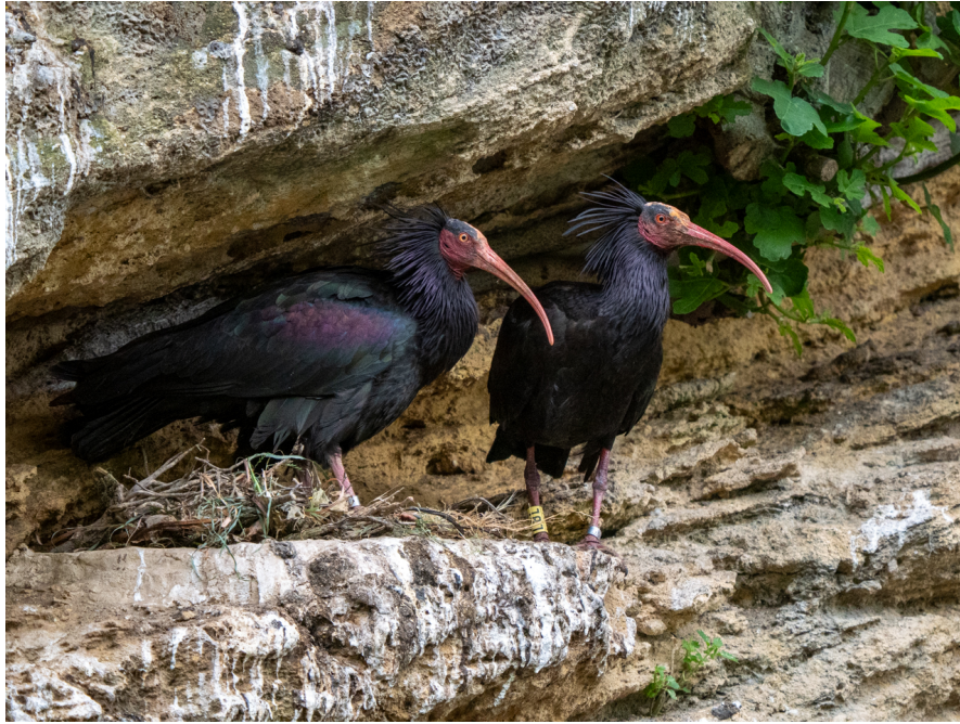
Northern Bald Ibis

The highlight of the day was still to come: the Barbate marsh, which, though muddy, was also teeming with birds. The Collared Pratincole undoubtedly stood out, followed by a large group of Stonecurlews and, of course, Kentish Plovers running with their chicks, as well as a pair of Curlew Sandpipers, one of which was already in advanced reddish breeding plumage, as opposed to their winter plumage. We also said goodbye to the abundant flamingos and Sandwich Terns before heading home, tired but happy after an intense day not only of seeing many birds, but also of dealing with persistent rain and muddy roads.