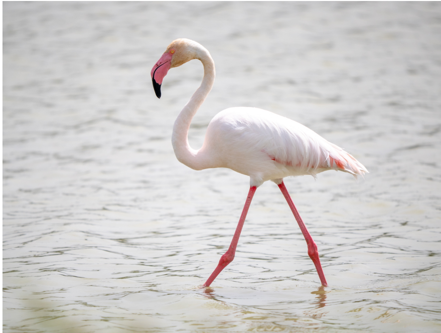
Greater Flamingo