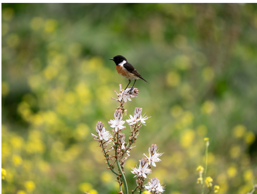
Stonechat

We visited another nearby lagoon where we had excellent views of the courtship of the White-headed Duck and Marbled Teal, two birds that are truly endangered in Europe and have one of their largest global populations in this wetland. To the group's surprise, a Granada Hare—endemic to the region—suddenly appeared on the shore, delighting us with its playful movements. On the way back to the hotel, we were able to hear and see our first Nightingale shortly before being surprised by the fleeting visit of another migrant, the Pied Flycatcher. Shortly after, we were able to enjoy a lovely pair of Woodchat Shrikes perched high in the trees, behaving similarly to Stonechats—other colorful birds that are easy to identify.