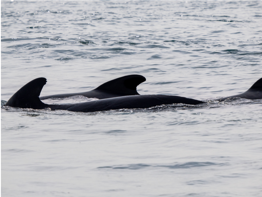
Pilot Whale