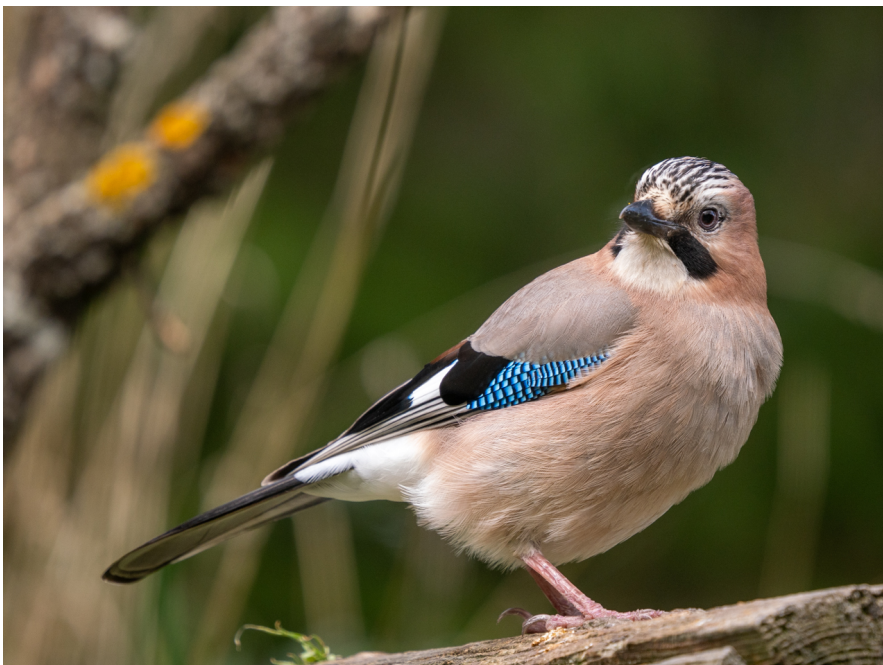
Eurasian Jay

We finally arrived at the long-awaited hotel, where an incredible surprise awaited us: we were able to enjoy the hotel's private hide, where we had excellent sightings of the Eurasian Jay and one of Spain's treasures, the Iberian Green Woodpecker, a species endemic to the Iberian Peninsula.