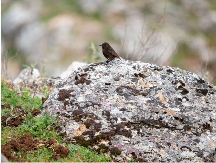
Black Wheatear