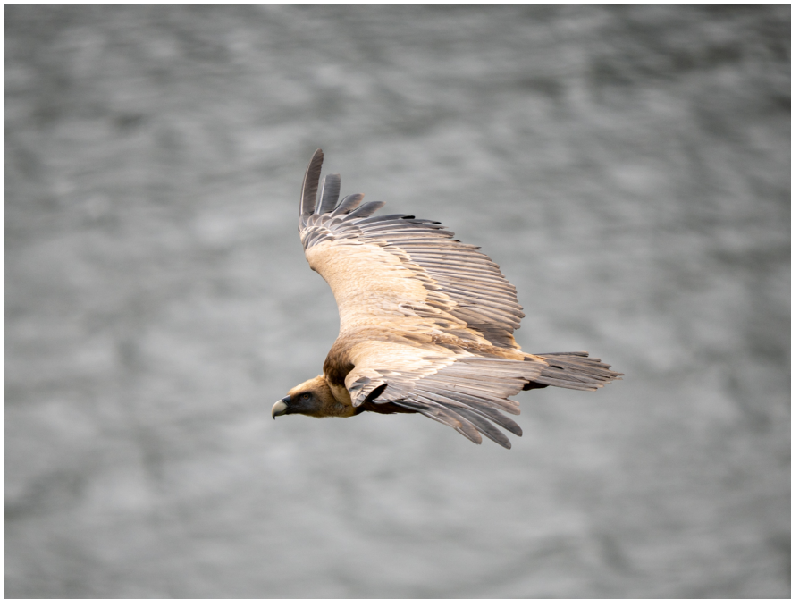
Griffon Vulture