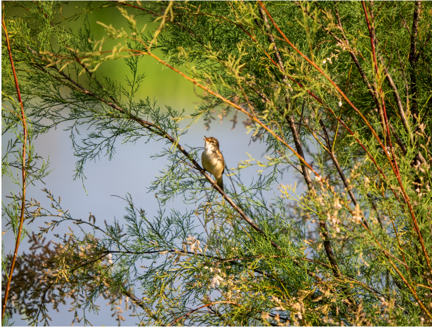
Savi's Warbler

We started the morning on the La Rocina trail, where we spotted some excellent birds, including a singing Savi's Warbler, our first Short-toed Treecreeper, and, of course, an interesting but fleeting glimpse of Europe's smallest woodpecker, the Lesser Spotted Woodpecker, which showed us its nest in a dry tree by the path.