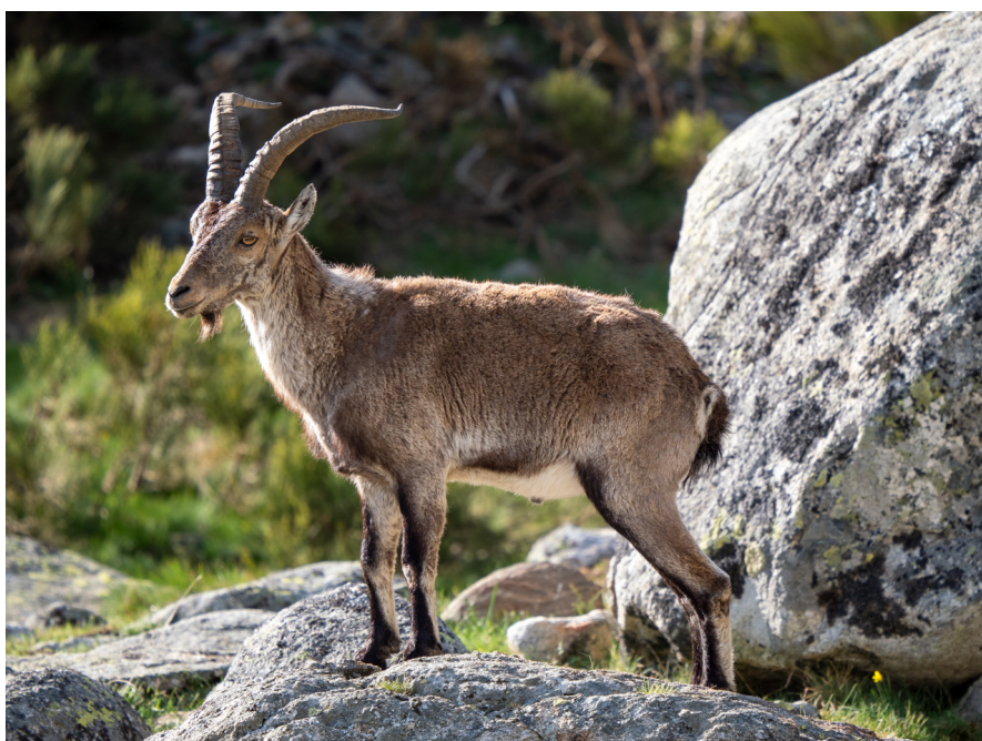
Spanish Ibex © Pablo Perez