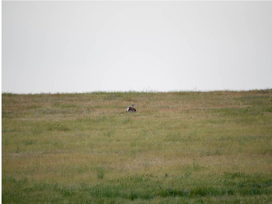
Great Bustard