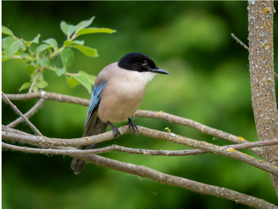
Iberian Magpie