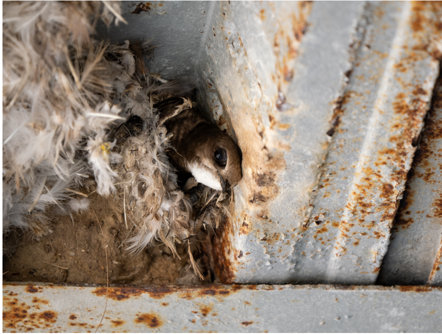
Little Swift

We then had an excellent traditional fish meal at the fish market before continuing on the road straight to the charming village of El Rocío. As soon as we arrived, a fierce storm threatened us, but fortunately it subsided, allowing us to enjoy some great sightings of numerous Eurasian Spoonbills, Glossy Ibises, Gull-billed Terns, and Greylag Geese—and, to Pablo's surprise, a beautiful Ruff in breeding plumage displaying its courtship ritual. The Marisma Madre de El Rocío was teeming with life, filled with large numbers of Greater Flamingos and, of course, many devout religious visitors from Andalusia who come on weekends to celebrate at El Rocío. We went to bed early, as Pablo predicted an intense day of birding for tomorrow.