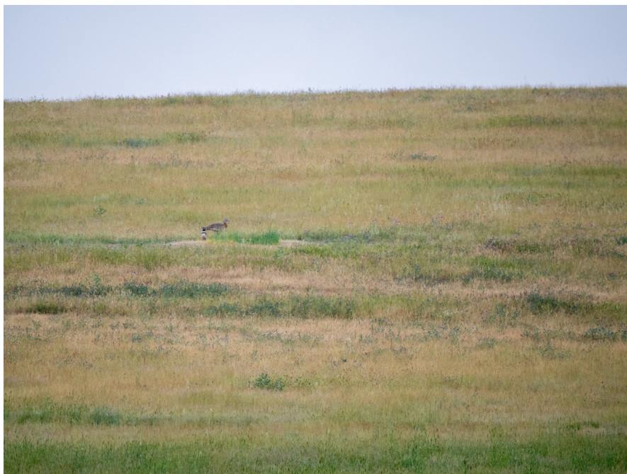
Little and Great Bustard

Without lingering too long, we stopped for a delicious coffee in Santa Marta de Magasca to recharge our energy and continue our route toward the row of nest boxes heading toward Cáceres. We pulled over to the side of the road to look for the Rollers, and sure enough, there they were alongside numerous Hoopoes and, of course, Bee-eaters. Suddenly, we heard the high-pitched call of the Pin-tailed Sandgrouse, and we watched in detail as five of them flew and landed not far from the group,