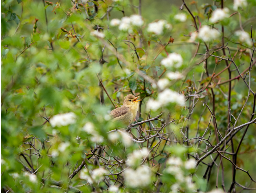
Melodious Warbler

As for birds of prey, I'd highlight an impressive adult Short-toed Snake Eagle and a more distant Booted Eagle, but without a doubt, our first encounter with the Griffon Vultures was the highlight—these large birds would accompany us throughout the trip. We had a pleasant lunch in Benaoujan before continuing on to Gaucin, the first typical white village we visited, and then followed the winding road through the Serrania de Ronda to Casares. We took the usual photos and continued on, with Gibraltar on our left, until we reached the Mirador del Estrecho. After catching our first glimpses of Morocco—and, consequently, Africa—we continued on to the hotel, where we were treated like family.