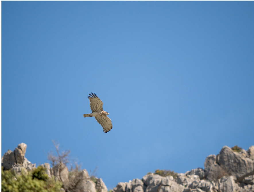
Short-toed Snake Eagle