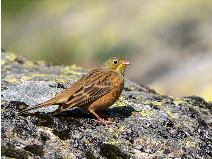
Ortolan Bunting

about the large crowds in the Sierra de Gredos mountains. Upon arriving at the viewing platform, we made our first stop to enjoy a good view of the Whitethroat and continued on to the parking lot at the end of the road. As soon as we arrived, we were surprised by a fleeting glimpse of a Common Rock Thrush, which was more than made up for by numerous sightings of the Ortolan Bunting and, of course, a pair of Spanish Ibex extremely close by, allowing us to clearly photograph their brilliant honey-colored eyes.