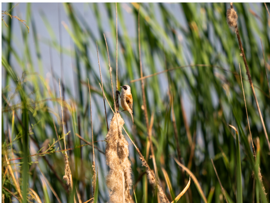
Penduline Tit

After resting at the hotel, we went for another walk at six in the evening to admire the charming white village of El Rocío and explore its stunning marshlands. I'd especially highlight a Common Reed Warbler and a captivating Penduline Tit. We were certainly having a fantastic day so far.