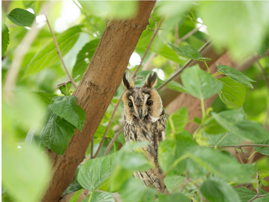
Long-eared Owl

Delighted with our discovery, we arrived at the hotel in Ronda, where we dropped off our bags and went for a cultural stroll to explore its dizzying cliffs and historic bridge. Some of the local birds we spotted included the acrobatic Red-billed Chough and Eurasian Kestrel. We enjoyed some free time to explore the town before meeting up for dinner at a nearby tapas bar, where we sampled traditional Spanish cuisine and its delicious cheeses and cured meats. Since it was a day full of surprises, we went to enjoy a well-deserved treat: the quintessential classic, a live flamenco dance show. It's truly impressive how much emotion is conveyed through that dance and song. We then understood why the birds were feeding and why the dancers, dressed in red like the flamingos, were tapping their heels by the lagoon. Without a doubt, an intense but excellent first day of the trip—this journey promises so much.