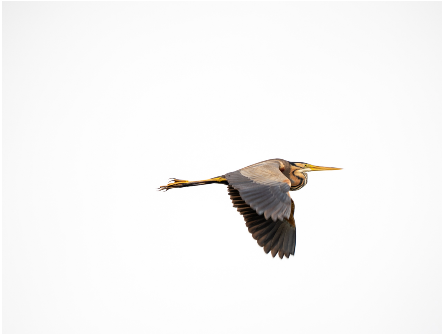
Purple Heron

We continued along the bumpy gravel road toward Valverde and, as we went, stopped at the various lagoons we came across, enjoying excellent views of hundreds and even thousands of birds. Among them, the Purple Heron, Black-crowned Night Heron, and, of course, the Squeacco Heron—with its elegant bluish bill in breeding plumage—stood out, delighting the visitors.