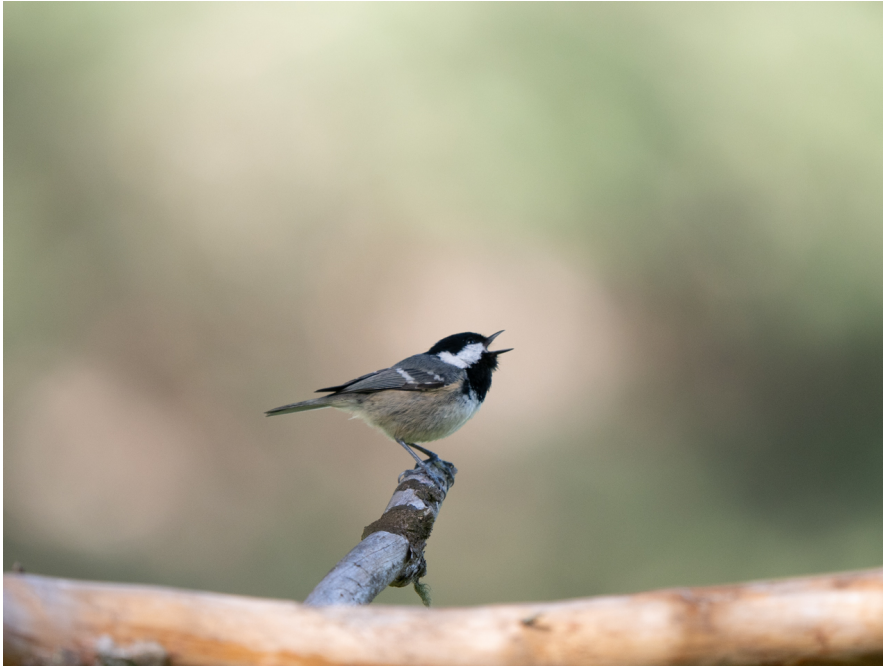
Coal Tit

We finally arrived at the long-awaited hotel, where an incredible surprise awaited us: we were able to enjoy the hotel's private hide, where we had excellent sightings of the Eurasian Jay and one of Spain's treasures, the Iberian Green Woodpecker, a species endemic to the Iberian Peninsula.