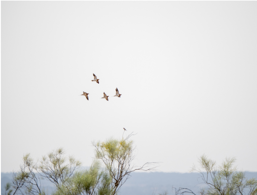
Pin-tailed Sandgrouse © Pablo Perez

offering good views alongside some nearby Iberian Grey Shrikes and Woodchat Shrikes.