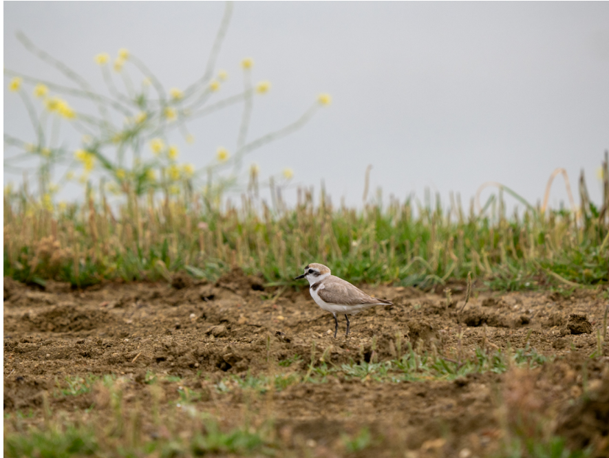
Kentish Plover

We visited another nearby lagoon where we had excellent views of the courtship of the White-headed Duck and Marbled Teal, two birds that are truly endangered in Europe and have one of their largest global populations in this wetland. To the group's surprise, a Granada Hare—endemic to the region—suddenly appeared on the shore, delighting us with its playful movements. On the way back to the hotel, we were able to hear and see our first Nightingale shortly before being surprised by the fleeting visit of another migrant, the Pied Flycatcher. Shortly after, we were able to enjoy a lovely pair of Woodchat Shrikes perched high in the trees, behaving similarly to Stonechats—other colorful birds that are easy to identify.