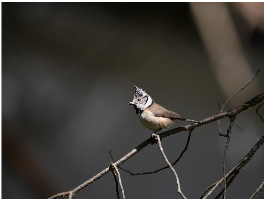
Crested Tit

We returned with enough time to enjoy the hotel, not only its incredible hide—where a Red Fox and a Black Kite also appeared—but also the nearby forest, which treated us to excellent sightings of the Pied Flycatcher and the jewel of the Gredos pine forests, the Crested Tit, which so many people wanted to photograph in high quality—just as we did.