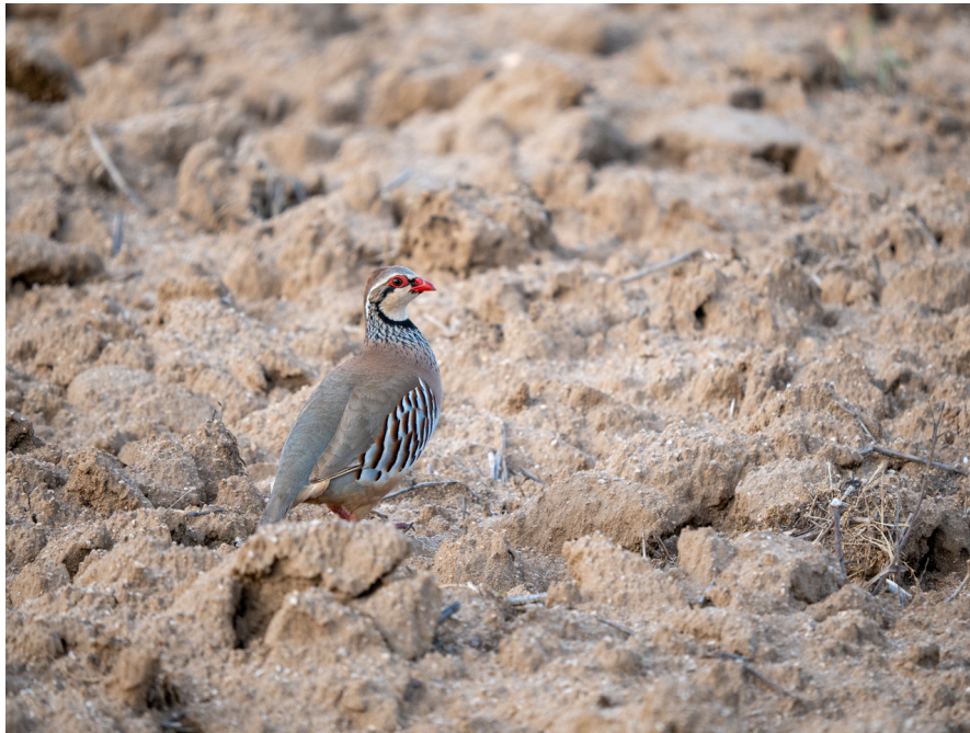
Red-legged Partridge

We once again enjoyed the delicious meal at the inn and set off for Toledo to stay at the historic family estate, which opened its secret doors to us so we could enjoy the final leg of the tour from the heart of Toledo—a place where we could feel the passage of time and experience Spain’s most ancient traditions, all accompanied, of course, by an excellent meal. So, after a brief rest, we drove through the lands near the Palace, searching for the two endemic gems of the Iberian Peninsula: Spanish Imperial Eagle and Iberian Lynx. Of course, the abundance of rabbits and Red-legged Partridges suggested we might spot these iconic wild animals in the Toledo pastures, and indeed, our hopes were fulfilled with a first distant sighting of the eagle and, of course, a brilliant sighting of an adult female Iberian Lynx beneath the holm oaks. We were able to gaze into those immense yellow eyes, adorned with the sharp tufts above the ears of this unique feline in the world.