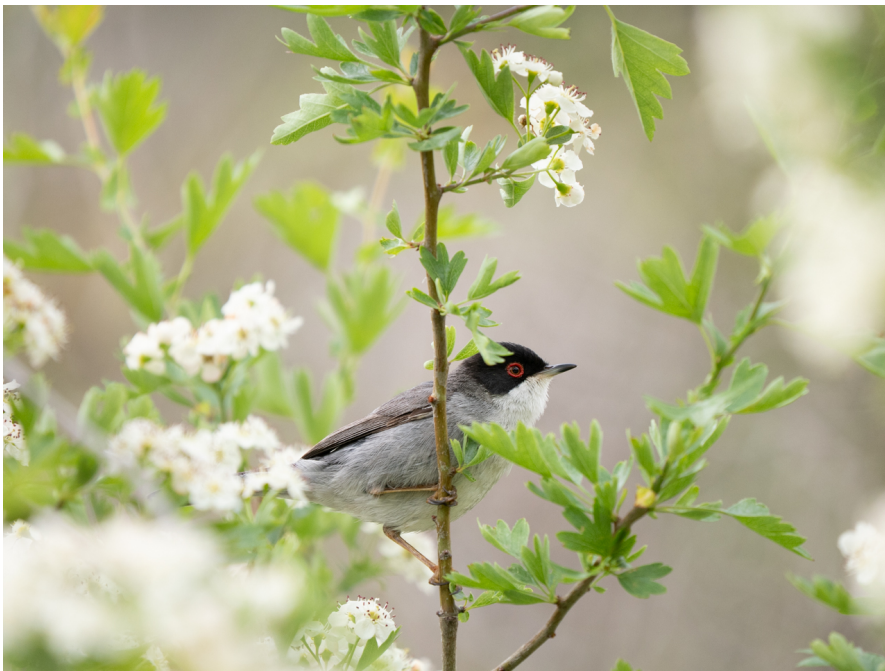
Sardinian Warbler