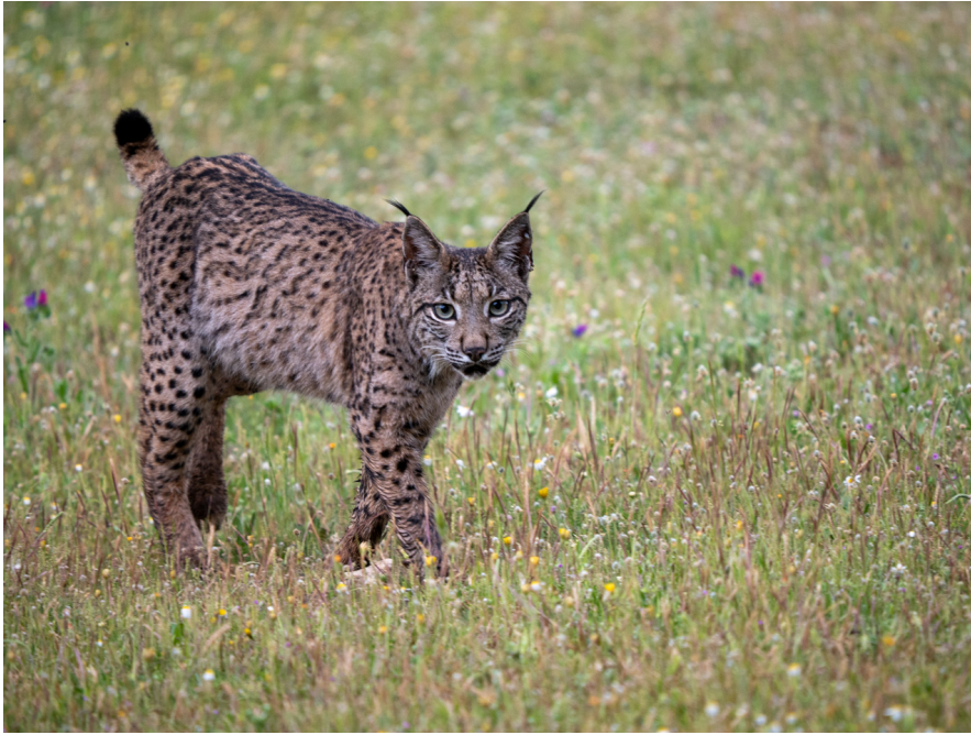
Iberian Lynx © Pablo Perez

We stopped to rest for a while at the house and continued the adventure in search of more birds, and luck was on our side with sightings of a Cirl Bunting, a Woodlark, and, surprisingly, a Western Orphean Warbler that came quite close to us while we were watching the Western Tree Sparrows. Not only were we able to spot the Spanish Imperial Eagle again, but we also heard its call—from a pair nesting nearby—which reminded us a bit of a Mallard's, but higher-pitched. The end of the tour proved most rewarding, with excellent views of the massive Hawfinch and a distant Common Cuckoo, along with some elegant Bee-eaters and, of course, the numerous Eurasian Hoopoes.