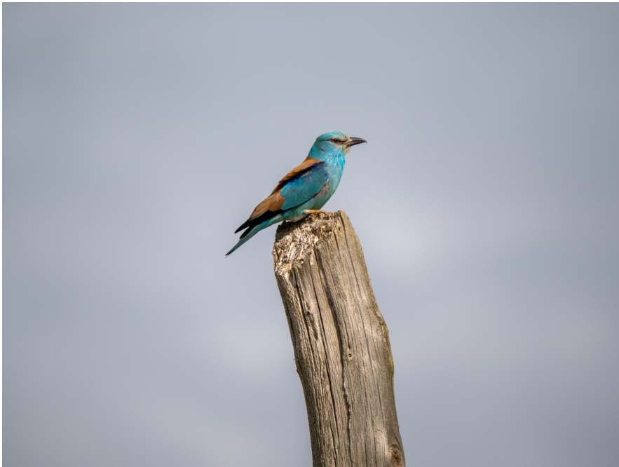
European Roller

The morning was full of energy, and we continued down the road until we could safely pull over to take some great photos of numerous European Rollers and the incredibly charming Little Owl—which would be our fifth owl of the trip.