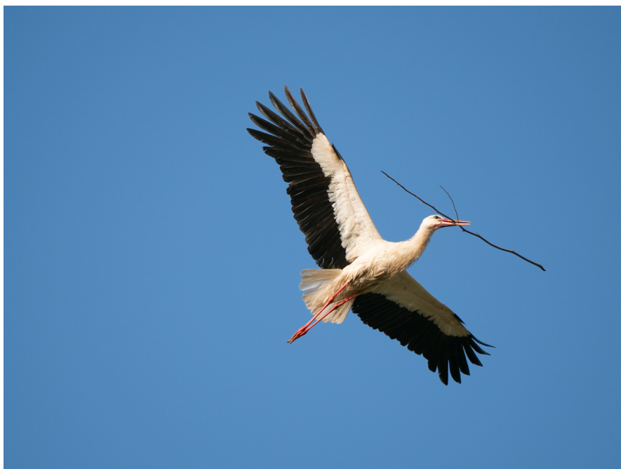
White Stork

At eight in the morning, we set out on what promised to be a day full of adventure. After driving for a while through the fog, we arrived at the first breeding colony of spoonbills, gray herons, and white storks. Thanks to the heavy rains this winter and the abundance of food, these birds are having tremendous breeding success, and the marsh is teeming with life.