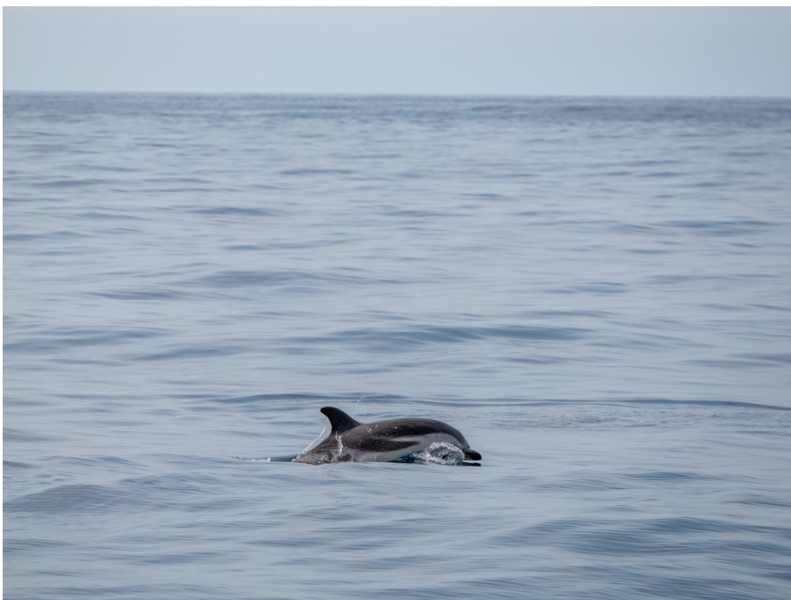
Striped Dolphin

After another delicious fruit smoothie and before heading back to the hotel, we stopped at the top of the hill again at the strait's viewpoint to look for migration, but unfortunately it was very slow, with only a few groups of Griffon Vultures and Booted Eagles in the distance. Suddenly the wind shifted and clouds rolled in, which didn't particularly favor the birds' passage between the two continents. We therefore decided to return to the pleasant nearby hotel to enjoy its comfortable facilities and, of