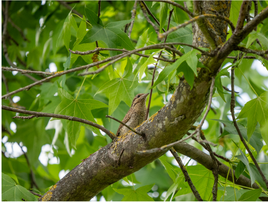
Wryneck

A storm was approaching, so we had to rush back, leaving with a great feeling that was only made better by a delicious dinner.