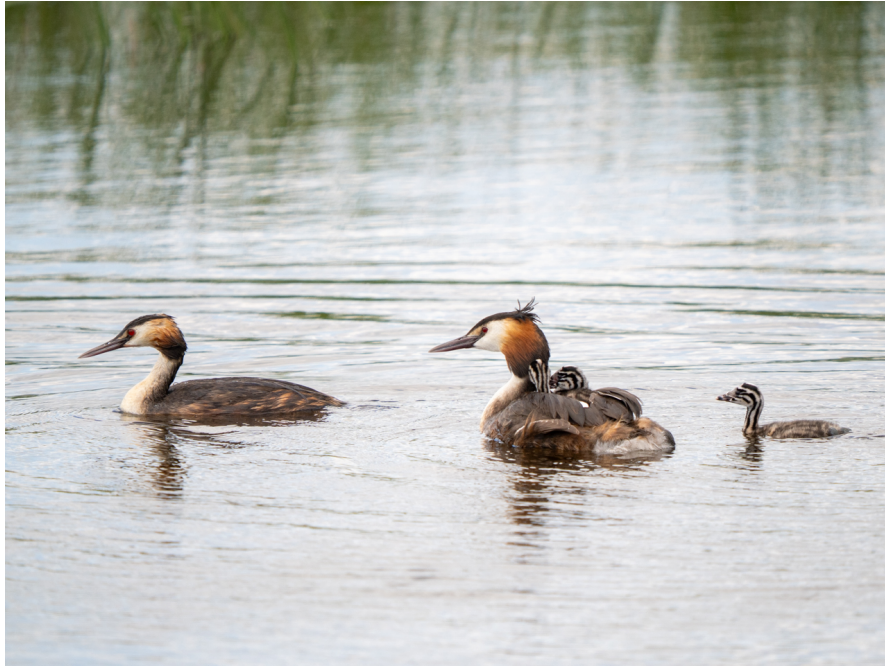
Great Crested Grebe

After resting at the hotel, we went for another walk at six in the evening to admire the charming white village of El Rocío and explore its stunning marshlands. I'd especially highlight a Common Reed Warbler and a captivating Penduline Tit. We were certainly having a fantastic day so far.