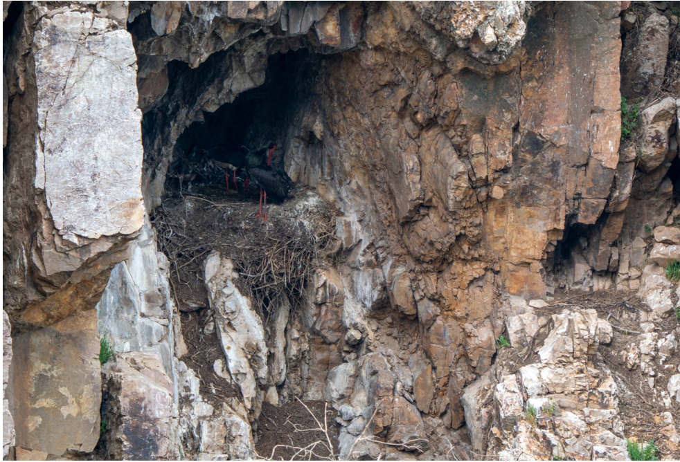
Black Stork

After enjoying such views for over an hour, we all headed out to savor a delicious dinner. After dinner, we were even able to spot a couple of red foxes playing in the woods near the hotel before nightfall.