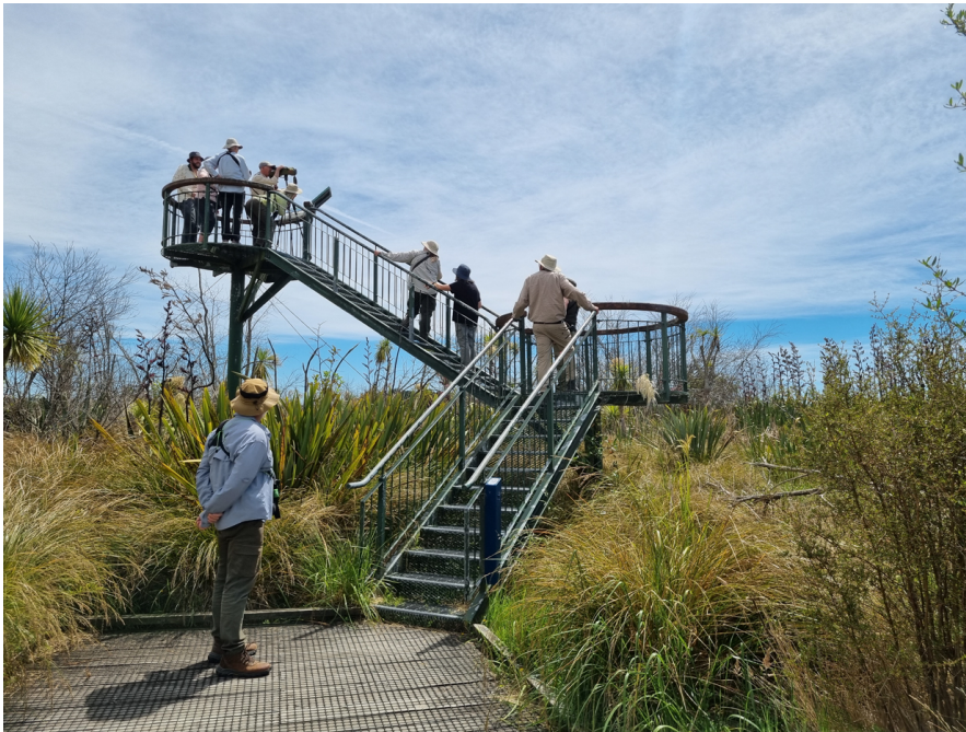
Travis Wetland

We started the day by leaving the accommodation at 6:30 a.m. and headed in search of Eastern Cattle Egret. Although the egret remained elusive, the morning was filled with anticipation and beautiful scenery. After breakfast, we went looking for Mute Swan. With some patient searching, everyone eventually enjoyed excellent views of two elegant swans. We also stopped at an estuary for Black-fronted Tern, and were thrilled to spot one almost immediately. Guests also enjoyed great views of Bar-tailed Godwit, making this a very rewarding stop. Next, we visited Travis Wetland (tower) to try to locate Cape Barren Goose. After a bit of a wait, four birds appeared, allowing everyone fantastic views. At the visitor center, we enjoyed spotting Eel, Shovelers, Scaup, and other wetland species, while appreciating the serene environment of the wetland—it was a wonderful experience for all.