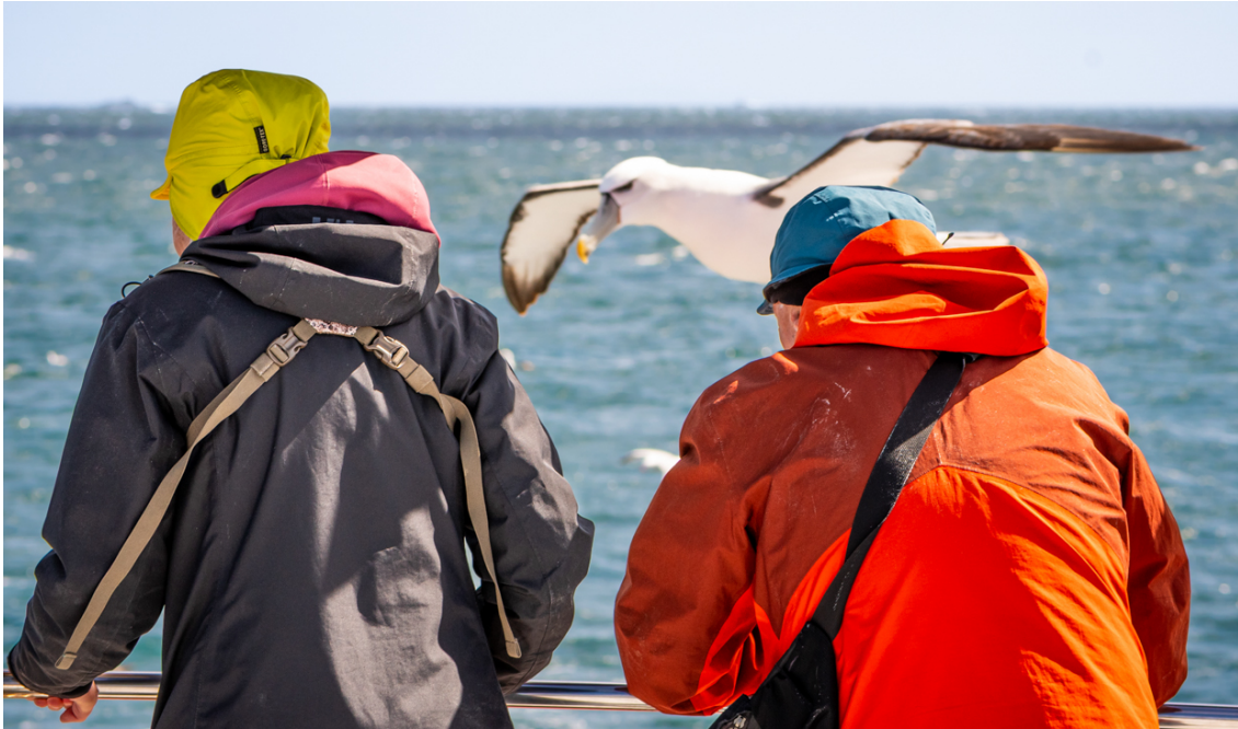
Stewart Island pelagic

Once back on land, Simone and the two guests who had opted out joined us, and we enjoyed a picnic lunch while waiting for the water taxi to Ulva Island. The ride across was adventurous due to rough seas, but our skilled skipper handled it perfectly, and everyone arrived safely. On Ulva Island, we first observed South Island Saddlebacks, Pipipi, South Island Robin, Yellowhead, and Red-crowned Parakeet. Once we reached the area where guiding was allowed, we ensured everyone had excellent views of all these species, plus a delightful Yellow-crowned Parakeet. The highlight of the day was the most incredible Kiwi encounter possible. The Kiwi walked right next to the guests, through the group, and along the path. Two guests were moved to tears, and everyone else was speechless. We paused for 100 meters to allow the group to fully absorb the experience—a truly once-in-a-lifetime moment.