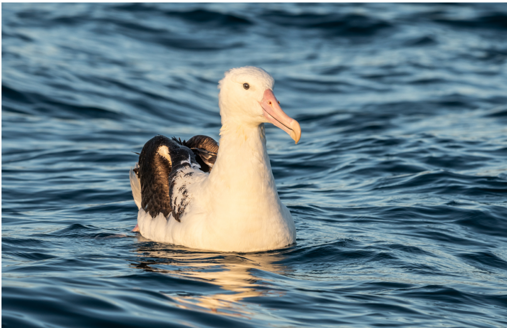
Northern Royal Albatross