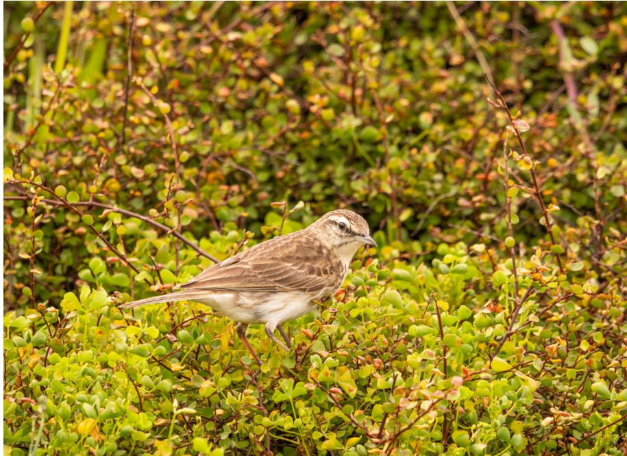
New Zealand Pipit

After a brief 30-minute rest at the hotel, we met again for dinner. Later, at 8:30 p.m., we went on an evening search for Brown Teal, Morepork, and North Island Brown Kiwi. The night did not disappoint—beautiful calls of the North Island Brown Kiwi echoed through the wetland, and we were treated to a lovely sighting of a Morepork. It was a peaceful and magical way to end an already exceptional day.