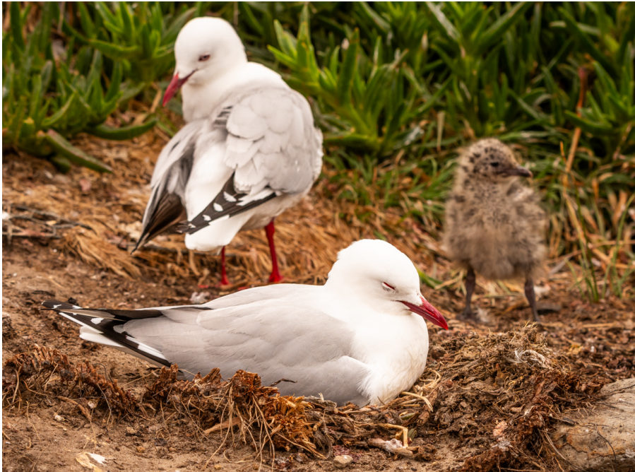
Silver Gull

chance to observe these majestic birds in their natural habitat.