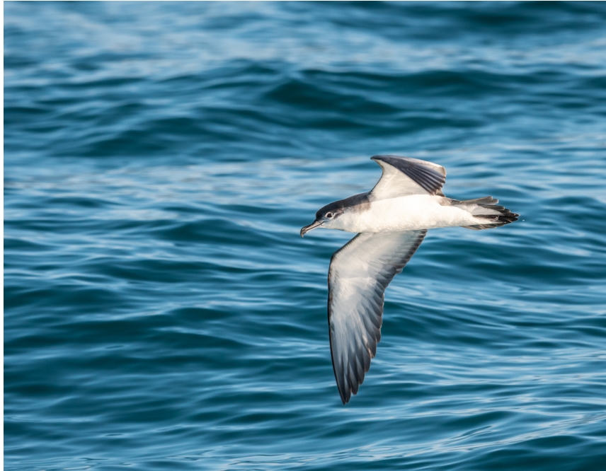
Buller's Shearwater