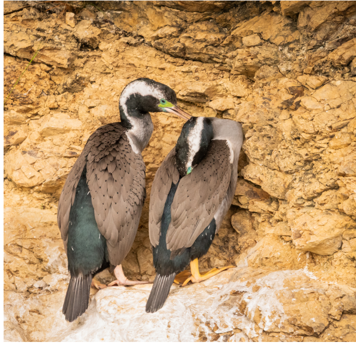
Spotted Shag