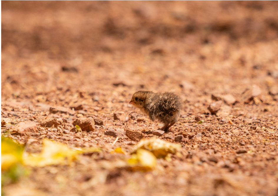
Brown Quail chick

Back at our hotel, everyone enjoyed some free time before our early dinner and an evening of birding. We set off for Tāwharanui Regional Park around 7 p.m., arriving just after 8. As soon as we reached the parking area, we were greeted by a South Island Takahē—an incredible start to the evening. While we didn't encounter Blue Penguins this time, we were treated to the magical calls of Fluttering Shearwaters and Gray-faced Petrels returning to land after their day at sea. The park was lively with visitors hoping to find a kiwi, and despite the activity, a short walk into the forest rewarded us with a kiwi sighting. Some guests had wonderfully clear views, while others glimpsed its back feathers, but everyone saw it, and the excitement was palpable. As we made our way out, we encountered the Takahē once more and took a moment to appreciate it again. Just before reaching the park gate, we spotted another kiwi running across an open field into some bushes. Everyone stepped out of the vans, quietly hopeful. After a patient wait, we edged closer and were rewarded with unforgettable views as the kiwi calmly foraged, moving through the brush while the calls of four additional kiwis echoed around us. It was a truly magical encounter—one of those special New Zealand moments that stays with you. We left the park around 11 p.m. and returned to the lodge by midnight. Everyone was tired but completely delighted with an extraordinary and deeply memorable day.