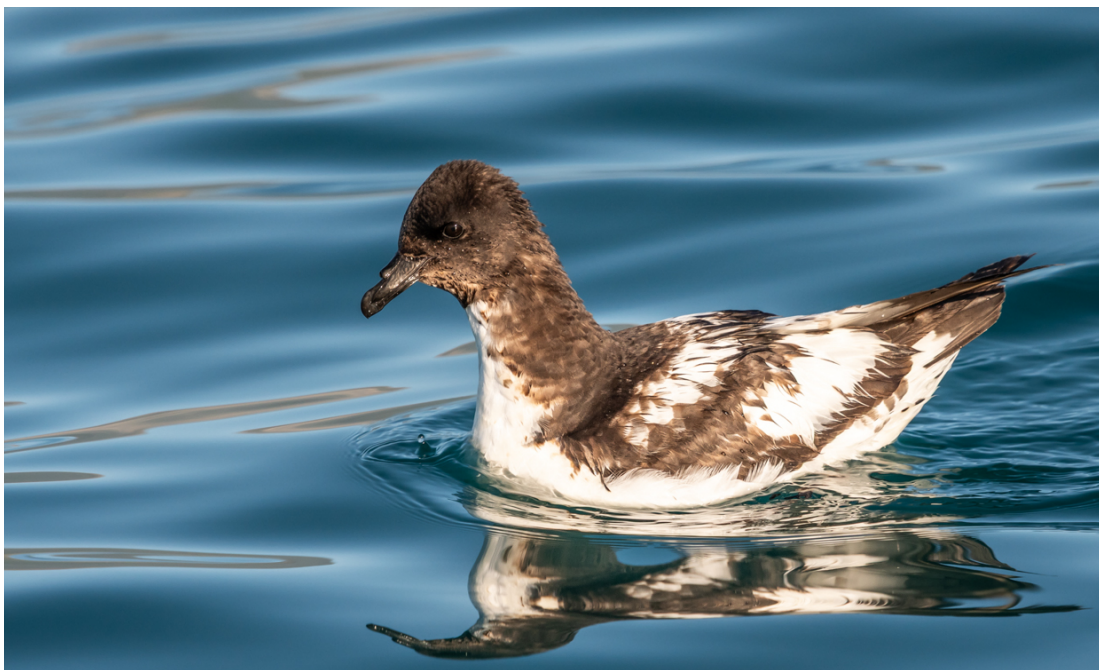
Pintado Petrel

Back on land, we had breakfast and then went looking for the Cirl Bunting. We didn't see them, and it was becoming clear that this would be our hottest day yet. After returning briefly to the hotel, we went to Schoolhouse Road to try and find the South Island Robin, Eastern Cattle Egret, and Pipipi. We didn't find any of these, but we enjoyed great views of bellbirds. We took the afternoon off to rest up for the long driving days ahead.