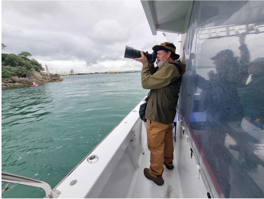
Pelagic