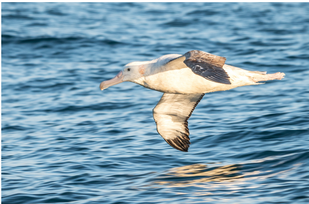
Antipodean Albatross