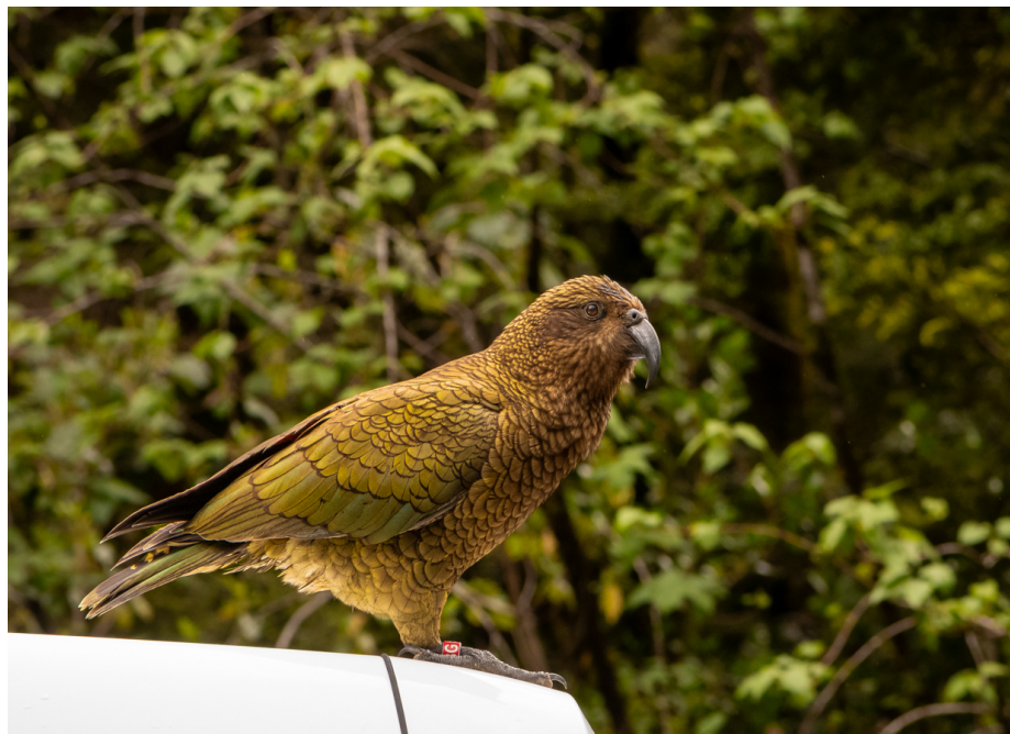
Kea

On the return trip to hotel, we stopped again at Homer Tunnel to try for the South Island Wren and were greeted by more playful Kea along the way. While the Wren remained elusive, the guests loved spending time with these intelligent birds and soaking in the dramatic scenery.