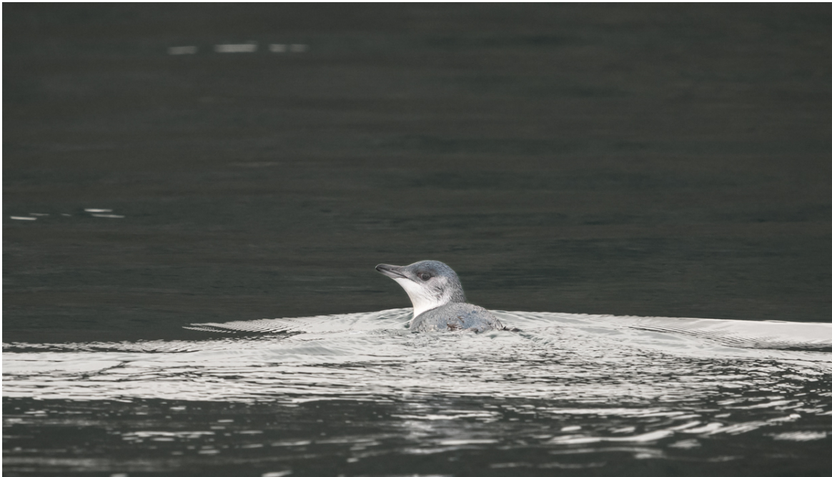
Little Penguin

We started the day with a delicious breakfast at 7 a.m. and departed by 7:30 a.m. for our boat trip to Blumine Island. We received a thorough briefing before boarding, followed by a short safety session. The weather was perfect, with calm waters and comfortable temperatures, making for a wonderful start to the journey. During the boat ride, we enjoyed spectacular encounters with Little Penguins, Dusky Dolphins, and Spotted Shags. We also saw an amazingly close and relaxed King Shag next to the boat, which is endemic to Marlborough Sound, with only 800 remaining. The knowledgeable crew shared fascinating insights throughout the trip, making it an engaging and memorable experience. Despite a slightly later departure, the incredible wildlife sightings and stunning scenery made the delay completely worthwhile.