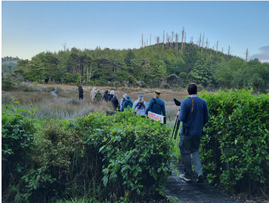
Old Mill Wetland

We began the day bright and early at 6 a.m., heading out before breakfast in search of Buff-banded Rail, New Zealand Fernbird, Brown Teal, and Australasian Bittern. Everyone arrived right on time and full of excitement. We enjoyed fantastic views of a New Zealand Fernbird almost immediately—a wonderful way to start the morning. The group moved confidently along the trail, eager to discover more. We heard several Australasian Bitterns calling clearly, which delighted everyone, and after a rewarding morning we returned for breakfast at 8:30.