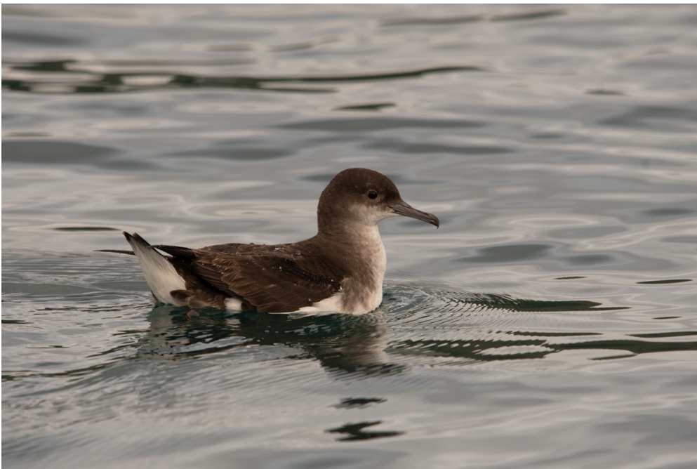
Fluttering Shearwater

Upon arriving at Blumine Island, we were immediately greeted by friendly Weka, who accompanied us throughout our visit. As we walked up to a viewpoint in search of Malherbe's Parakeet, we spotted a Yellow-crowned Parakeet along the way. While Malherbe's Parakeet was elusive at first, three guests managed a glimpse near the campsite, and just before our return, one appeared in a perfect spot for everyone to enjoy clear views. We also encountered a South Island Saddleback