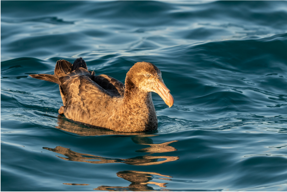
Northern Giant Petrel