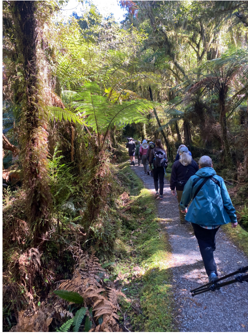
Monro Beach Walk

In the afternoon, we went looking for Pipipi, South Island Robin, and Yellowhead. While we didn't add these species to our list this time, the forest itself was stunning, and the guests loved the walk. Throughout the 60-minute stroll, the calls of Rifleman and Tomtit filled the air, adding to the magical atmosphere. We then checked into our accommodations for a refreshing break before dinner.