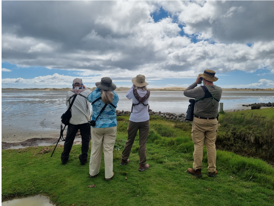
Mangawhai Heads