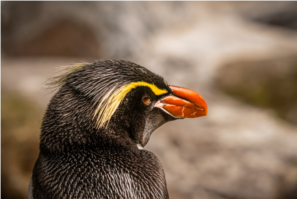
Snares Penguin at the Opera

We then returned to the Royal Albatross Centre for a close-up experience of the Albatross colony. Guests were amazed by Northern Royal Albatrosses on their nests and enjoyed learning about the history and conservation efforts at the centre. On the way back from the colony, albatrosses flew overhead as they returned from the sea—a perfect finale to a wonderful day of birding. We had a wonderful final dinner. The evening was filled with stories, reflections on favorite birds, and shared appreciation for an unforgettable experience. It was the perfect conclusion to an amazing birding adventure.