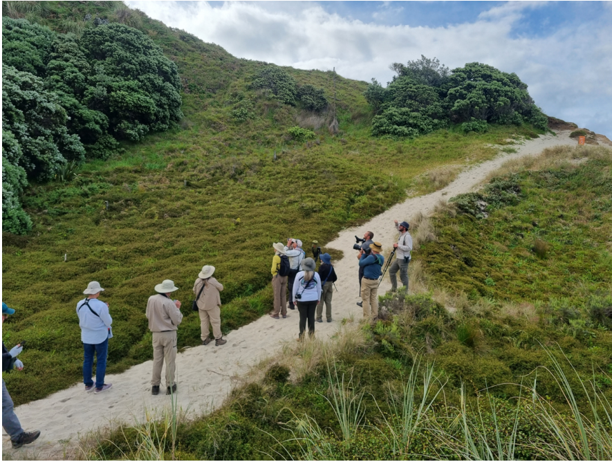
Ocean Beach