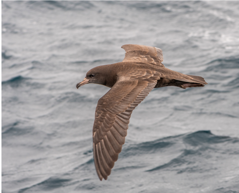
Sooty Shearwater

We then enjoyed lunch in a picturesque cove, right beside an island alive with bird activity. Here we had delightful views of Red-crowned Parakeet, New Zealand Kākā, and North Island Saddleback—an unexpected bonus that everyone loved. After lunch, we visited two additional offshore locations, both closer to land than the main pelagic site. These stops offered more fantastic views of Pycroft's Petrel, Cook's Petrel, Fairy Prion, Gray-faced Petrel, and White-faced Storm-Petrel. Returning to shore, we were greeted by a Caspian Tern flying gracefully along the coastline, adding a perfect final species to the day's list.