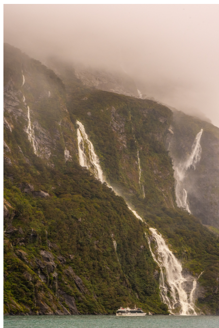
Milford Sound

At Milford Sound, the rain eased just in time for our cruise with Southern Discoveries. The experience was breathtaking, with hundreds of waterfalls, calm waters, and a little game to spot 10 species during the tour. A Fiordland Penguin made a special appearance, and guests thoroughly enjoyed this unforgettable journey.