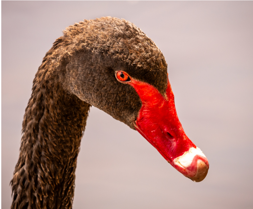
Black Swan © Donavin de Jager

After an early dinner we headed to Arthur's Pass to search for Kea. We were able to hear and observe some of these iconic birds in the distance, while a surprise South Island Robin called from a nearby bush, adding a special touch to the outing.