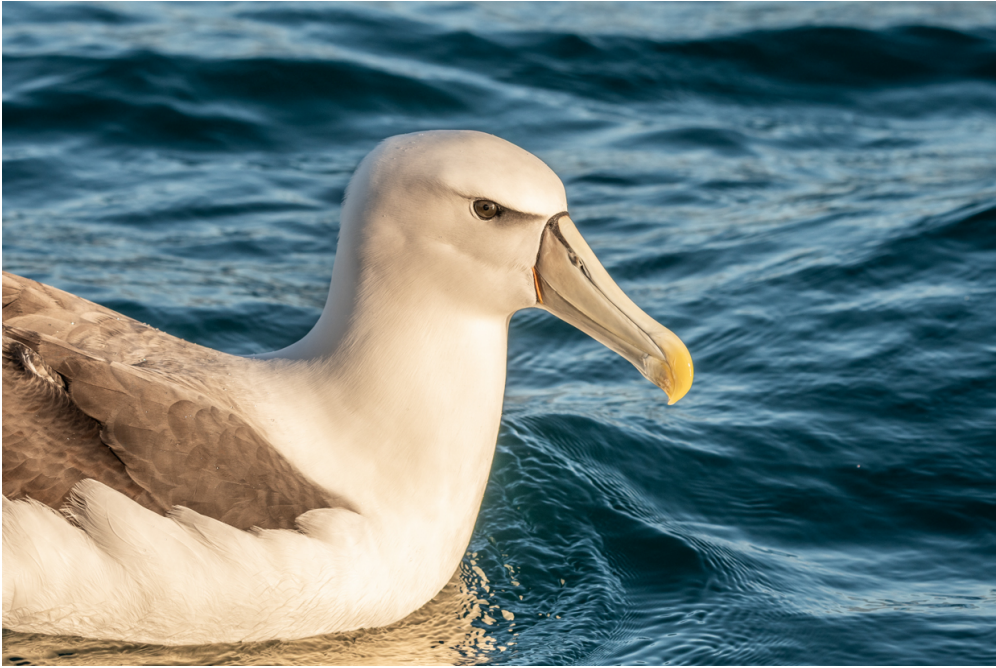
Salvin's Albatross