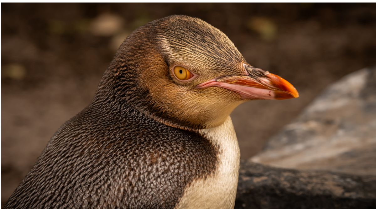
Yellow-eyed Penguin at the Opera

The highlight of the day came with our Penguin encounters at The Opera. The guide's enthusiasm and knowledge made the experience unforgettable. While a wild Yellow-eyed Penguin was a rare surprise, we were thrilled to witness one coming ashore and walking on the beach. We also saw Little Penguins in their nest boxes, and at the very end, the group enjoyed incredible views of two Yellow-eyed Penguin chicks along with a Snares Penguin they were caring for. This was a truly unforgettable wildlife encounter.