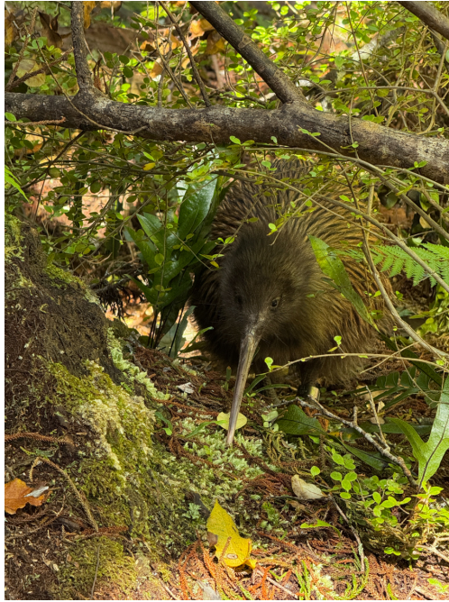
Ulva Island

The return water taxi ride was rough, but our skipper ensured everyone returned safely. Dinner at 7 p.m. gave everyone a chance to relax, and although service was slower than expected, the food itself was enjoyable. Overall, the day was filled with unforgettable wildlife encounters and magical moments, especially the extraordinary Kiwi and pelagic experiences, leaving everyone thrilled and deeply satisfied.