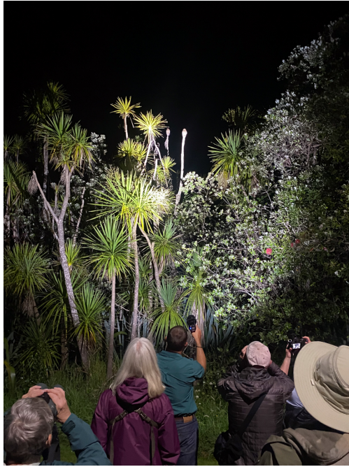
Shakespear Regional Park