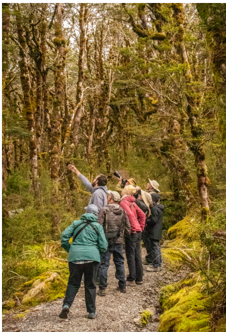
Arthur's Pass

After an early dinner we headed to Arthur's Pass to search for Kea. We were able to hear and observe some of these iconic birds in the distance, while a surprise South Island Robin called from a nearby bush, adding a special touch to the outing.