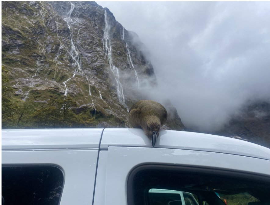
Kea at Homer Tunnel

everyone as it confidently approached and explored the cars.