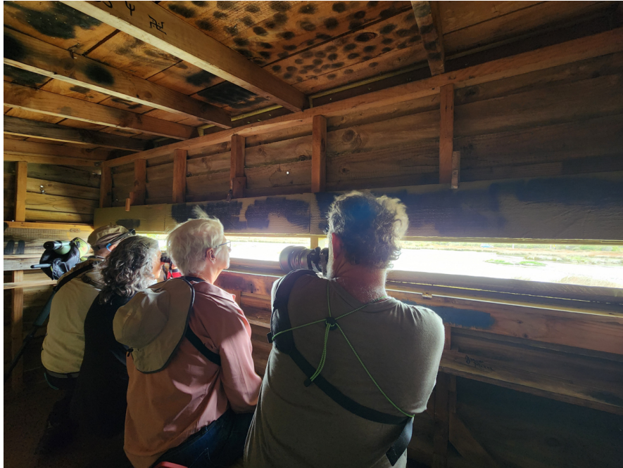
Pauatahanui Wildlife Reserve

While waiting in the Interislander Ferry queue, we took a short, refreshing walk and were delighted to find a Little Penguin nearby. A number of guests had great views of this charming bird. The Cook Strait crossing was wonderfully calm, creating a peaceful atmosphere on deck, and the strong winds made for exceptional pelagic birding. During the journey, we spotted White-capped Albatross, Salvin's Albatross, Westland Petrel, White-chinned Petrel, and Northern Royal Albatross—a truly impressive list. Entering the sounds, we enjoyed views of large numbers of Fluttering Shearwaters, a group of playful Dusky Dolphins, a majestic New Zealand King Shag, and a Parasitic Jaeger. After reviewing photos, we confirmed a Chatham Albatross—a scarce and exciting find (verified by several experts), since there are fewer than 20 records on the New Zealand mainland.