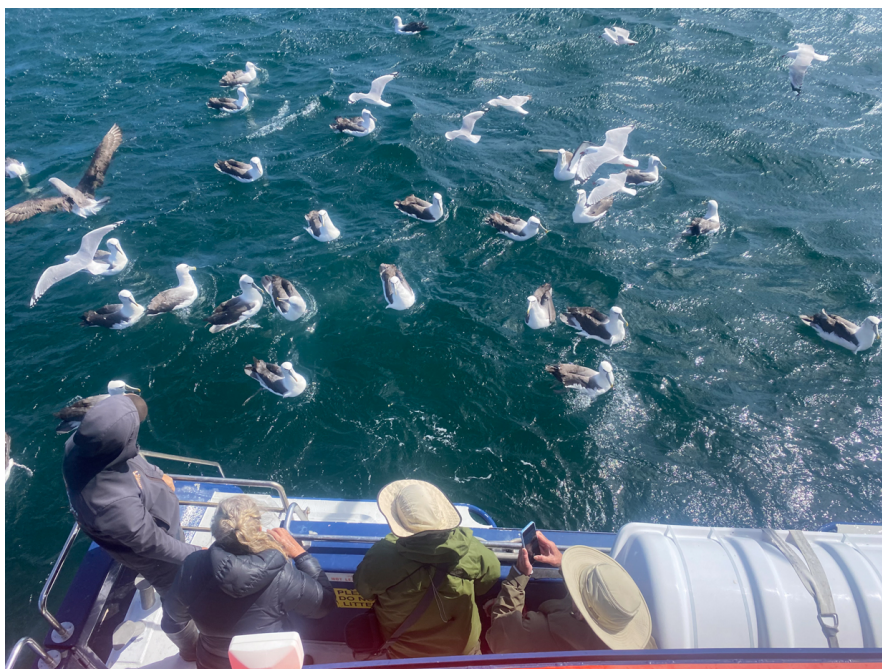
Pelagic off Stewart Island

The day began with breakfast at the hotel at 8 a.m., with some guests enjoying a short walk beforehand. Before boarding the boat for our pelagic trip, we were delighted to see another Fiordland Penguin feeding near the jetty—a magical start to the morning. The pelagic was an unforgettable experience. We enjoyed incredible close-up encounters with White-capped Albatross and Salvin's Albatross, which flew over, beside, behind, and in front of the boat, even resting on the water alongside us. Fiordland Penguins continued to charm us, and we spotted Little Penguins swimming alongside the boat. It was truly one of the most spectacular pelagic experiences yet.