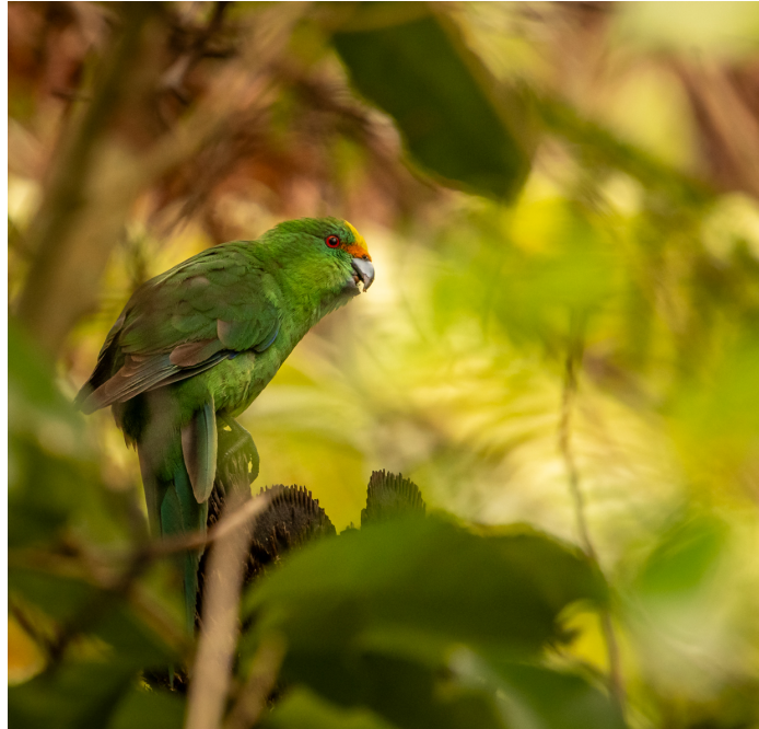
Malherbe's Parakeet

during our exploration. On the boat ride back to Picton, Dusky Dolphins leapt joyfully alongside us, creating an unforgettable finale to an amazing morning.