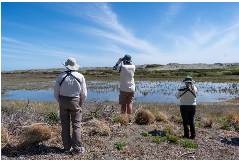
Tangimoana Beach

Little Egret and Pacific Golden Plovers, along with excellent, close views of Double-banded Plovers. With everyone feeling happy and energized, we added a scenic 45-minute extension to our drive toward Palmerston North to look for Cattle Egret and Rook. While the egrets stayed hidden, we found a group of 10 Rooks just ten minutes from our hotel—absolutely perfect views that everyone thoroughly enjoyed.