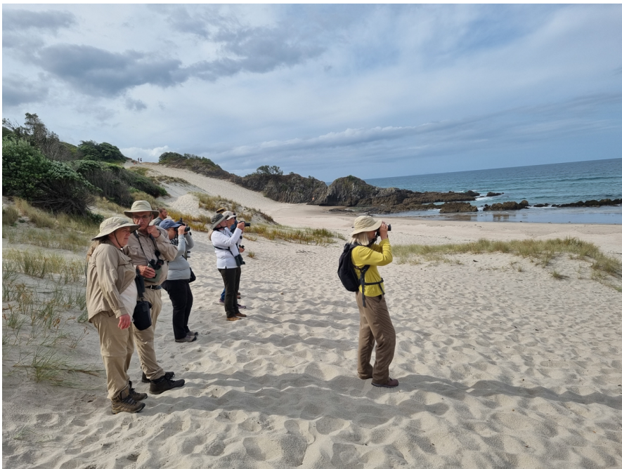
Birding at Ocean Beach