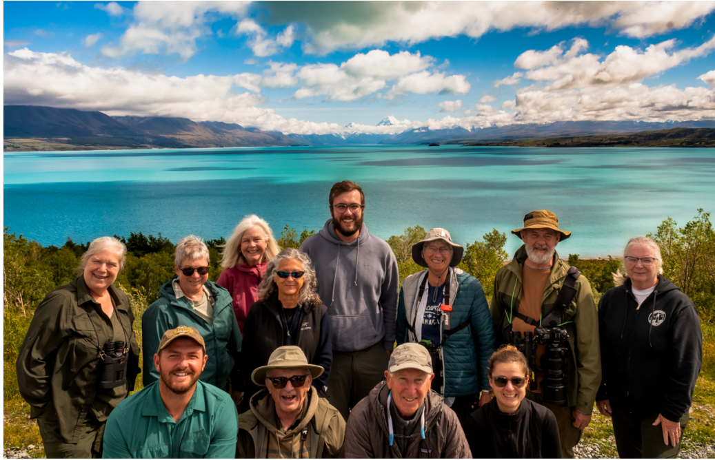
New Zealand Birding Tour

Next, we enjoyed a scenic drive to Glentanner while having lunch in the car. We then continued to Lake Poaka, where we spotted a beautiful hybrid of Black Stilt and Pied Stilt. We finished our birding at Ohau Lagoon, soaking in the spectacular views and perfect weather along the way. The day was long with lots of driving, but the guests thoroughly enjoyed the experience and the stunning landscapes of the region.