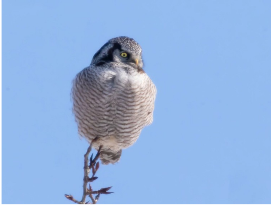
Northern Hawk Owl

With everyone frozen from the cold weather we continued back to where we saw the Northern Hawk Owl getting more looks at it before driving up Maple Creek Road. Our next stop was some open water near Powerview that didn't produce anything. With a good morning of birds, we stopped at Papertown Motor Inn for Lunch.