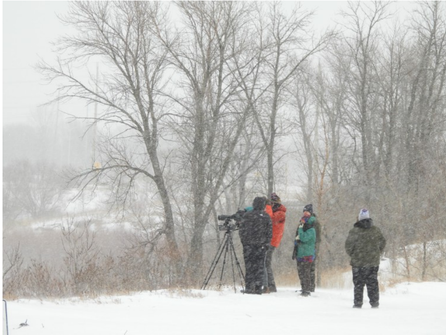
Birding in Manitoba

In the afternoon we drove north to Oak Hammock Marsh. Wind and snow made birding conditions challenging, but we spent time inside the interpretive center learning about the marsh and its importance to migratory birds. A set of feeders provided good views of Redpolls, Downy Woodpeckers, and two female Red-winged Blackbirds.