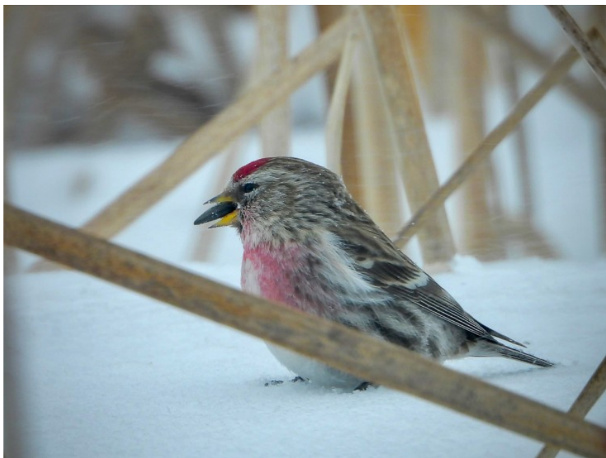
Redpoll

In the afternoon we drove north to Oak Hammock Marsh. Wind and snow made birding conditions challenging, but we spent time inside the interpretive center learning about the marsh and its importance to migratory birds. A set of feeders provided good views of Redpolls, Downy Woodpeckers, and two female Red-winged Blackbirds.