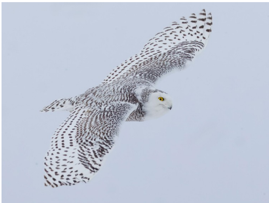
Snowy Owl

In Rosenort we encountered a group of Grey Partridge which offered close and prolonged looks before we began our return towards Winnipeg. Back in the city, we made a quick stop at Maple Grove Park where open water held a Hooded Merganser along with numerous Mallards. We then headed to FortWhyte where we enjoyed another great lunch.