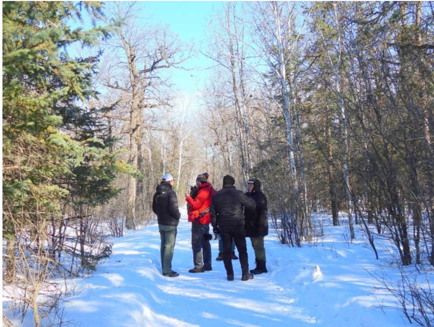
Birding in Manitoba

We returned to the hotel after a successful day and wrapped things up with dinner at Chicago Joe's.