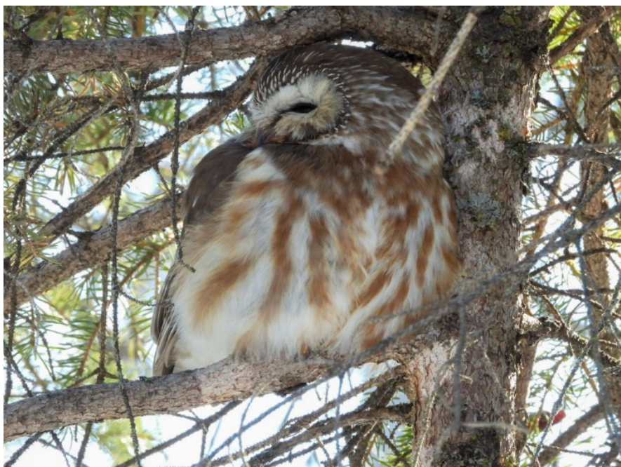
Northern Saw-whet Owl

Our final stop of the day was Assiniboine Park where we searched for a Northern Saw-whet Owl that had been previously reported in the area. After some searching the small owl was located tucked tightly against the trunk of a conifer fast asleep. Everyone enjoyed the excellent views of the owl.