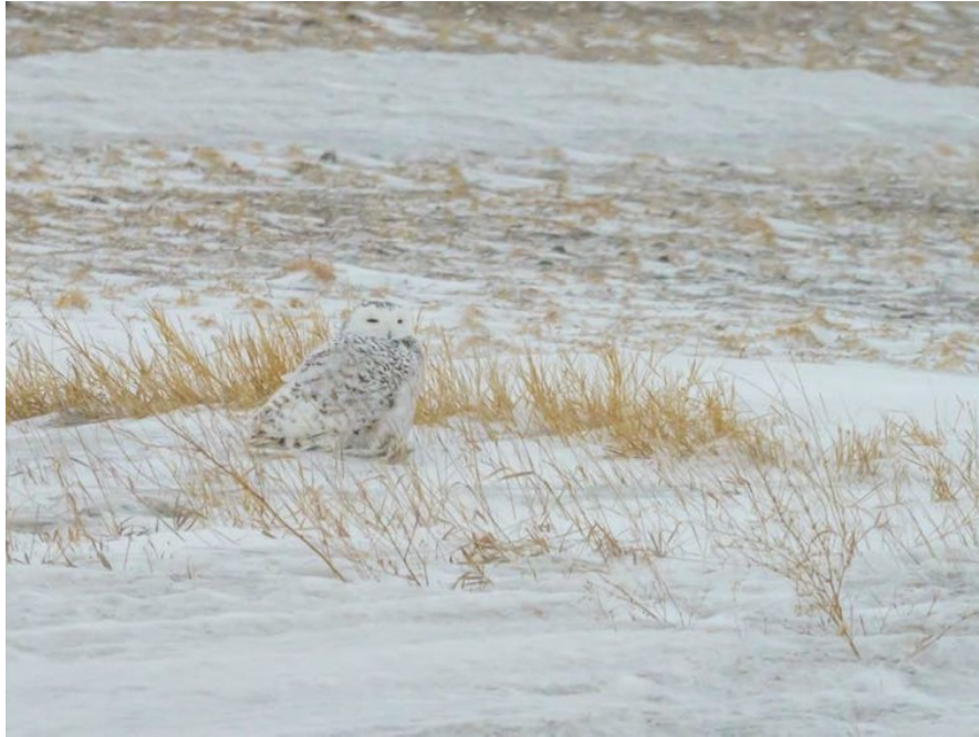
Snowy Owl