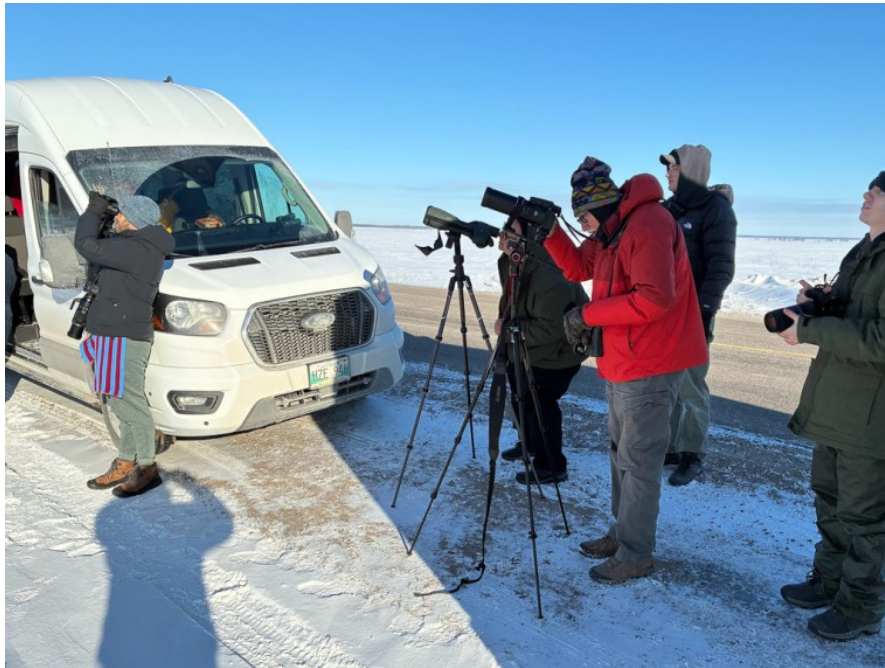
Birding in Manitoba

Moving on we drove through Lac du Bonnet and made our way to Henry Bellin Road to visit a series of feeders. Along the way we stopped at a house where a group of Sharp-tailed Grouse were present. At the feeders we got good looks at Evening Grosbeaks, Black-capped Chickadees, Redpolls, and Blue Jays.