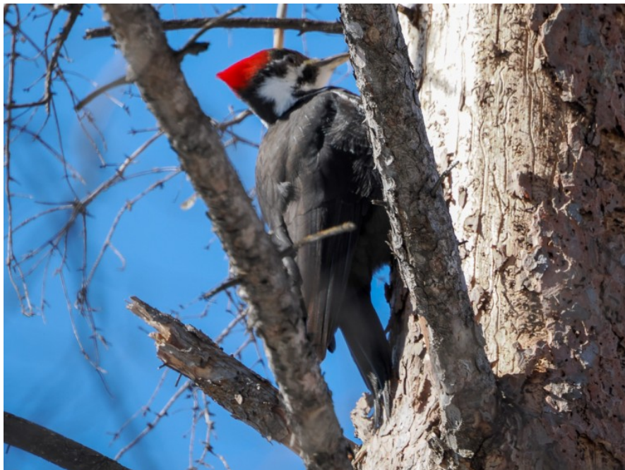
Pileated Woodpecker

Heading back towards Winnipeg, we made a stop near FortWhyte to check on a Bald Eagle nest. Although the nest appeared unoccupied at the time the group still enjoyed the view of the large nest. We then made our way over to St. Vital Park where we checked the roost of a Western Screech-Owl. While the owl was not present, we were rewarded with a great sighting of a Pileated Woodpecker. Lunch was enjoyed at a nearby indoor picnic area which offered a break from the cold weather.