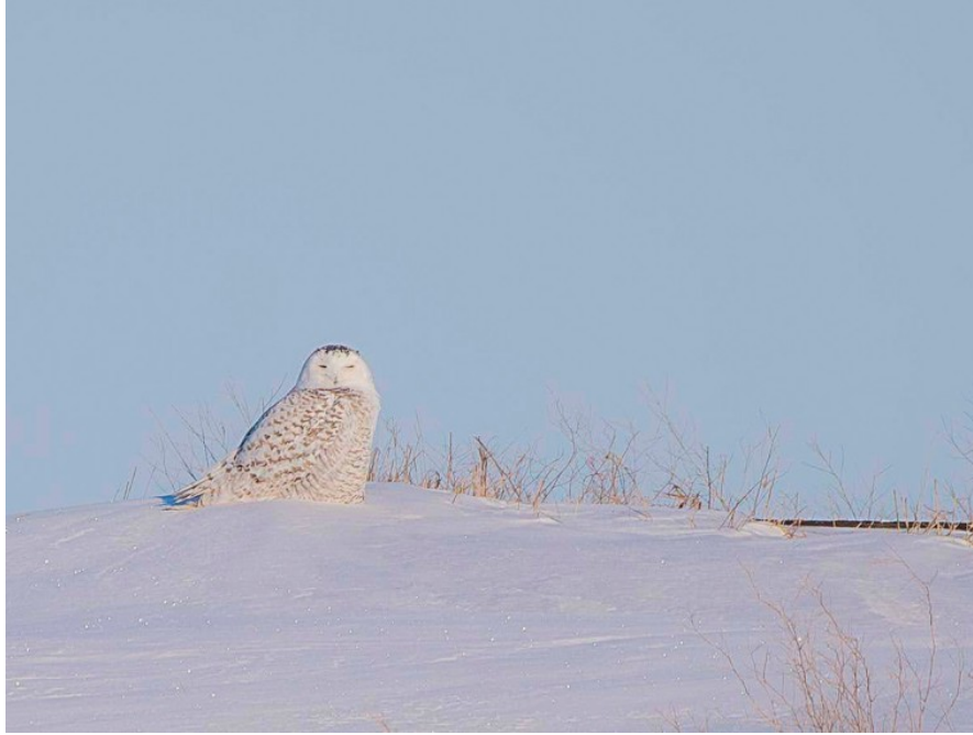
Snowy Owl

The day started with a drive to the town of Oak Bluff where there had been reports of Snowy Owls from previous groups. From Oak Bluff we continued east towards Fannystelle spotting numerous Horned Larks along the way. Just outside of Fannystelle we found our first owl of the trip, a Snowy Owl perched on a small hill. Everyone had great views before we carried on along the gravel roads where there were an abundance of Horned Larks and a lone Snow Bunting.