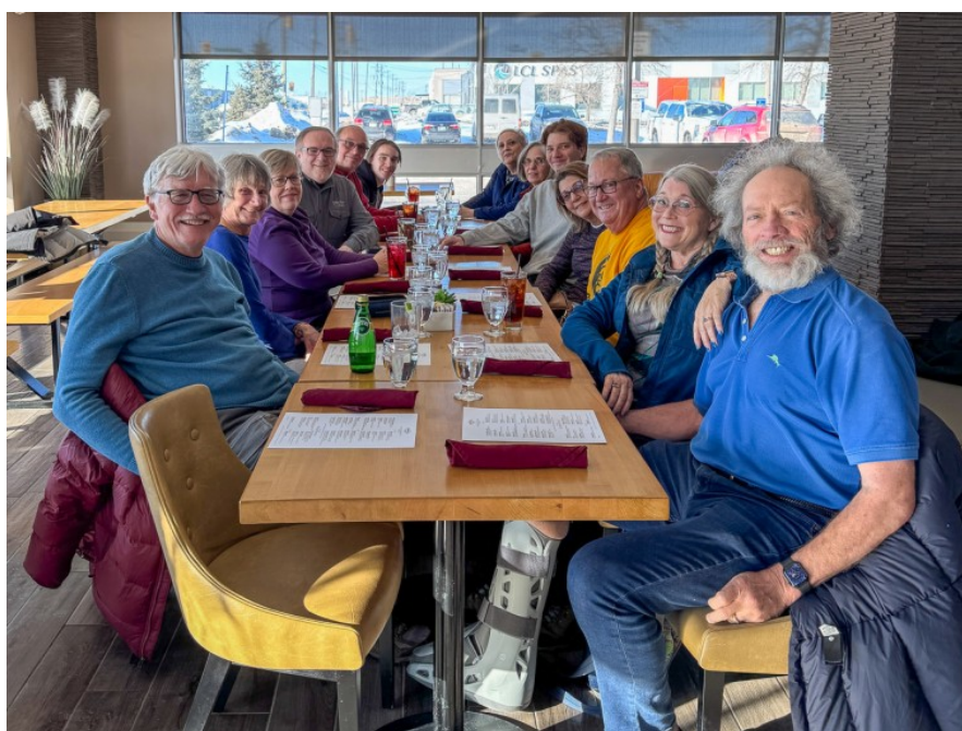
Manitoba Owls tour group

Day 1 - March 14th We met the group in the hotel lobby in the evening, where introductions were made. From there we walked over to Oak and Grain for an enjoyable dinner where we got to know everyone and went over the itinerary for the trip.