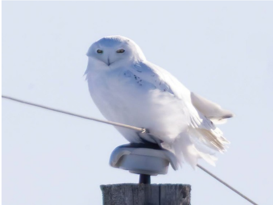
Snowy Owl

Heading back towards Winnipeg, we made a stop near FortWhyte to check on a Bald Eagle nest. Although the nest appeared unoccupied at the time the group still enjoyed the view of the large nest. We then made our way over to St. Vital Park where we checked the roost of a Western Screech-Owl. While the owl was not present, we were rewarded with a great sighting of a Pileated Woodpecker. Lunch was enjoyed at a nearby indoor picnic area which offered a break from the cold weather.