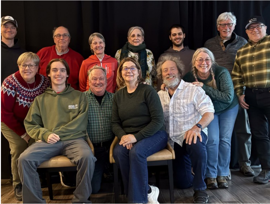
Manitoba Owls tour group 2026

After a fantastic trip, full of great memories and great birds, everyone headed home.