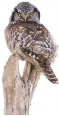
Northern Hawk Owl

After breakfast, we started our birding along highway 317, where we got our target specie for the day, a Northern Hawk Owl. The same bird seen on earlier tours; this owl was sitting on an exposed log providing great views.