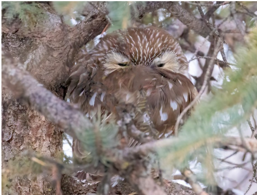
Northern Saw-whet Owl

With everyone happy and satisfied with our birds for the day we had our last dinner at Oak and Grain Restaurant.