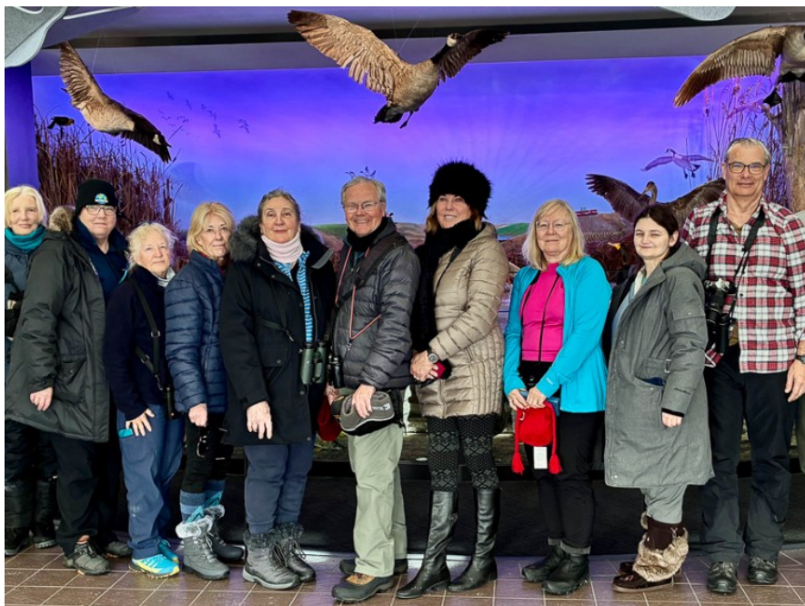
Manitoba Owls tour group

After a fantastic trip, full of great memories and great birds, everyone headed home.