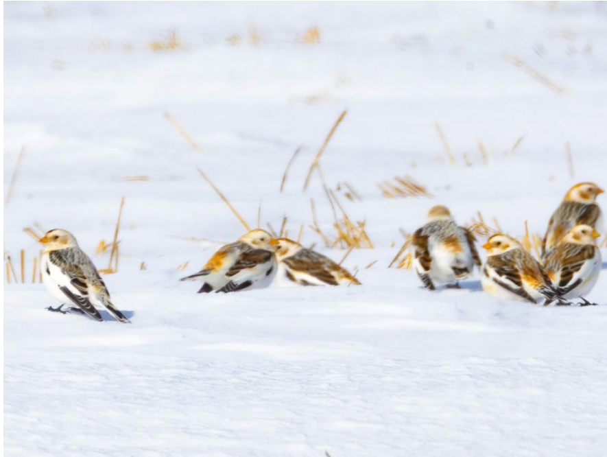
Snow Buntings

We spent a couple of hours at the interpretive center at Oak Hammock Marsh learning about the work they do and enjoying the views of the marsh. A set of feeders provided looks at many Redpolls and two female Red-winged Blackbirds.