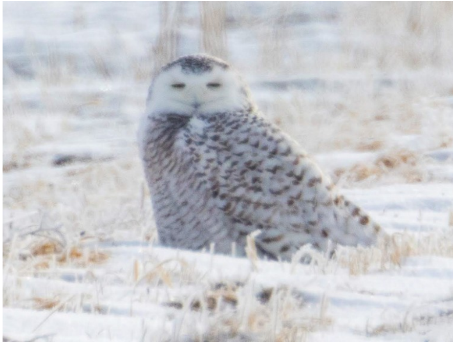
Snowy Owl

We made our way back towards Winnipeg stopping near Fort Whyte to observe a Bald Eagle nest. One Bald Eagle was seen perched in the surrounding area, but none were observed on the nest. We then made our way over to St. Vital Park where we checked the roost of a Western Screech-Owl. With nobody home we continued to a nice indoor picknick area where we enjoyed lunch. With our bellies full we moved on to Harris Park where a Barred Owl had been reported previously. With no success we tried calling in a Red-bellied Woodpecker. The woodpecker was heard responding multiple times, but nobody got any views of it. From Harris Park we drove to the north end of the city and made a visit to see a pair of nesting Great Horned Owls along Bunn's Creek. The female was on the nest and downy feathers of the chicks were seen underneath her with some briefly seeing one of the chicks. The male was seen in a surrounding tree keeping an eye on everyone. Both before and after observing the Great Horned Owls everyone got good looks at a pair of Pileated Woodpeckers at the beginning of the trail.