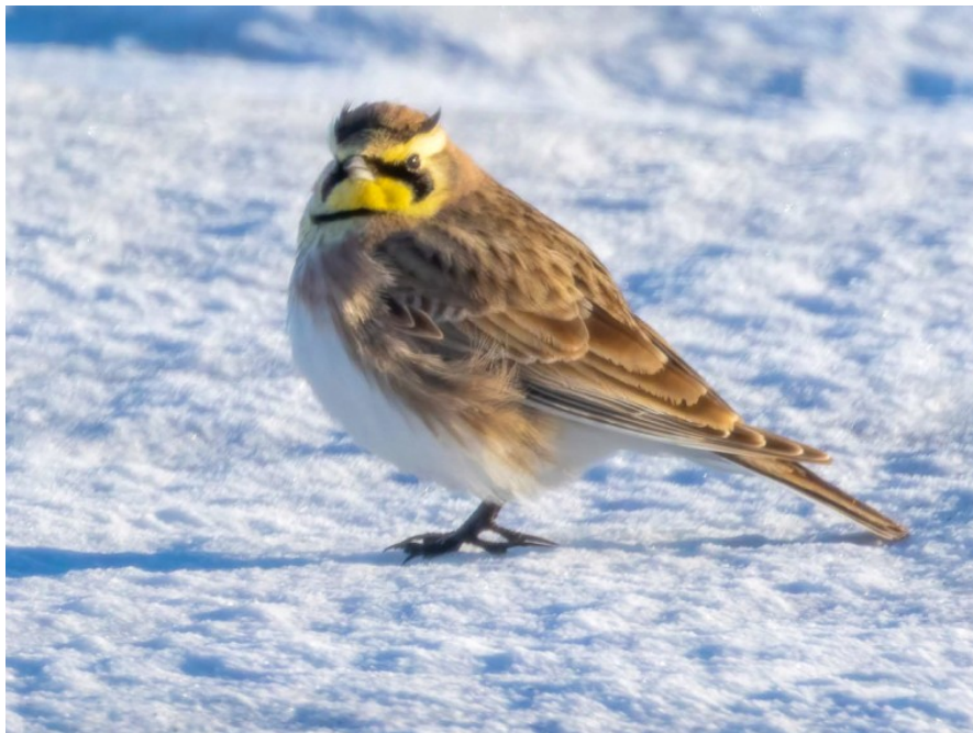
Horned Lark

After some talking with the group the previous night, we decided to switch up the plan for the last day and stay around the city. After a later start and breakfast, we made our way back to Oak Bluff area in hopes to find a Snowy Owl. After much searching we were unsuccessful, but we continued to have numerous sightings of Horned Larks.