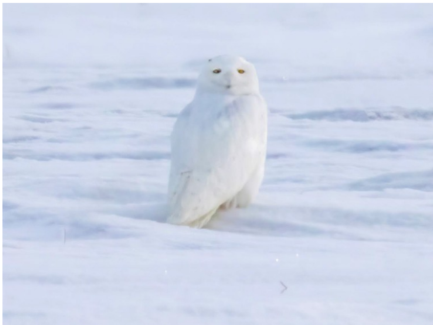
Snowy Owl

Along the gravel roads we observed many groups of Horned Larks and a got a short look at a Rough-legged Hawk before it took off. As we continued, we spotted our first Snowy Owl, an all-white ghost bird.