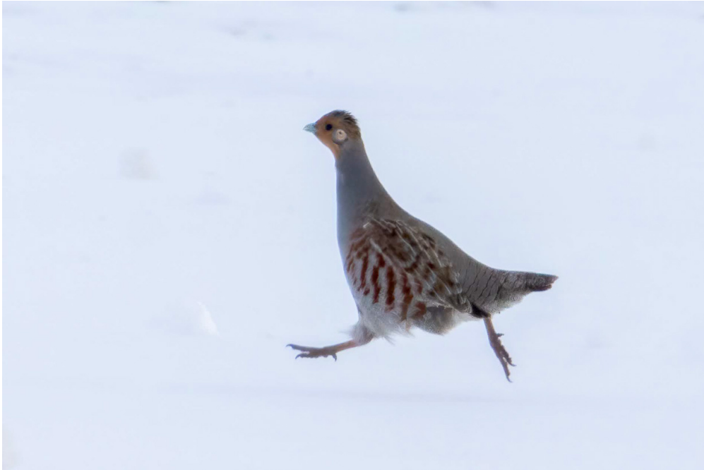
Gray Partridge

Along the gravel roads we observed many groups of Horned Larks and a got a short look at a Rough-legged Hawk before it took off. As we continued, we spotted our first Snowy Owl, an all-white ghost bird.