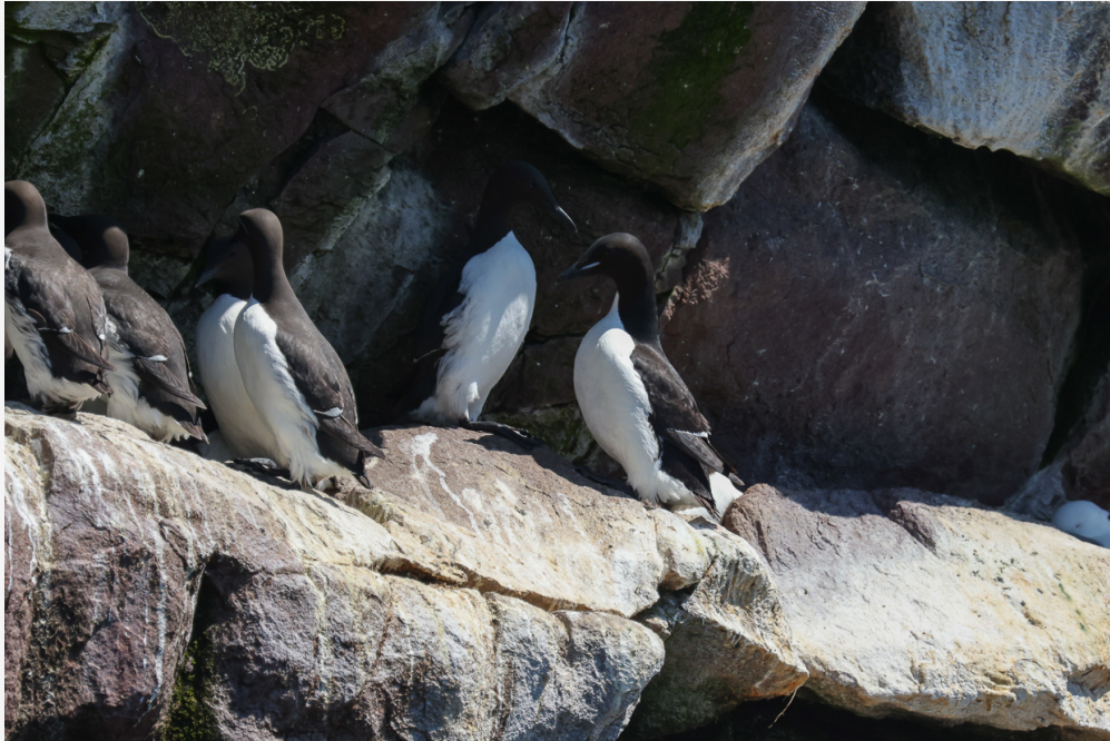
Thick-billed Murre

Arriving to the Islands, impressive swarms of murres, puffins, and Razorbills streamed to and from their nests. Our captain maneuvered the boat to get close, and we even got looks at Thick-billed Murre amongst the Common Murre. After a perfect afternoon on the water we made our way back to St. John's for dinner at the historic Celtic Hearth.