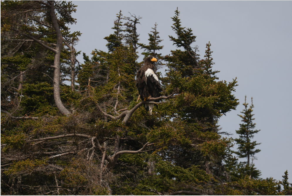
Steller's Sea Eagle