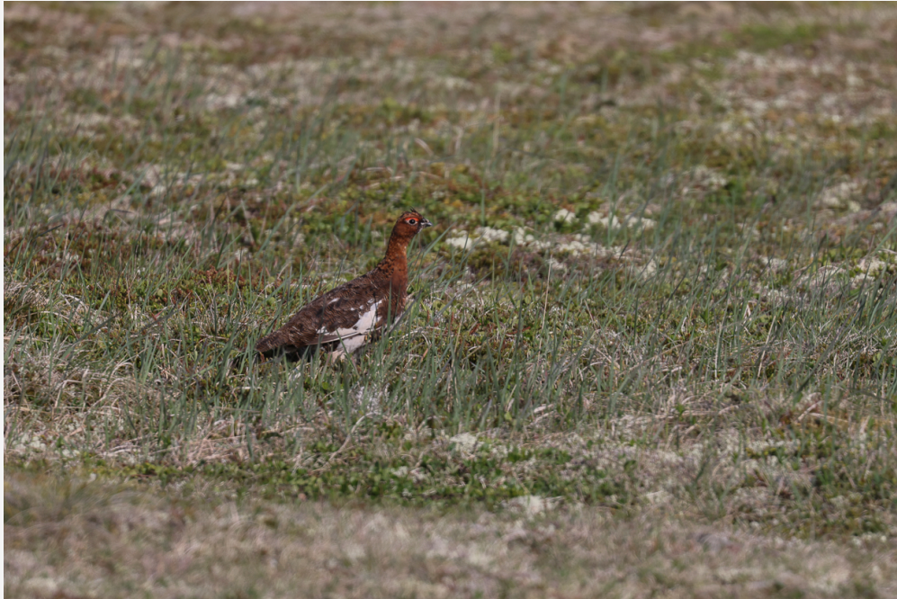
Willow Ptarmigan

After brief hellos at the Visitor Centre, we made the short walk across stunning terrain to arrive at the Gannet colony at Bird Rock. This colony is a must visit for anyone interested in seabirds, and particularly photography. Gannets swirled around us and nested just feet from the ends of our camera lenses. Common Murre lined the cliffs and we even managed to pick out a Thick-billed Murre amongst the Commons. A group of Gray Seals and our only Great Cormorants were other highlights here.