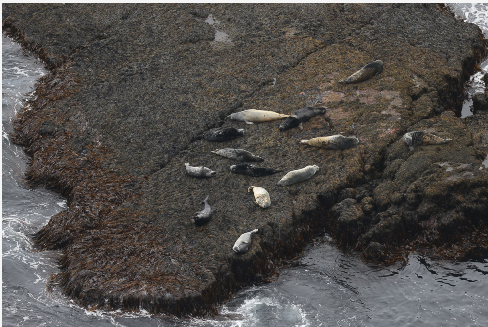
Gray Seals

After brief hellos at the Visitor Centre, we made the short walk across stunning terrain to arrive at the Gannet colony at Bird Rock. This colony is a must visit for anyone interested in seabirds, and particularly photography. Gannets swirled around us and nested just feet from the ends of our camera lenses. Common Murre lined the cliffs and we even managed to pick out a Thick-billed Murre amongst the Commons. A group of Gray Seals and our only Great Cormorants were other highlights here.