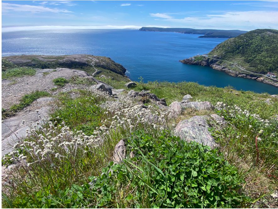
Signal Hill

In the afternoon, we ventured into downtown St. John's in search of rare bird species. Our first success was spotting a Pink-footed Goose at Burton's Pond, where we also had great views of Red Crossbills. At Kenny's Pond, although our search for a Tufted Duck was unsuccessful, we had excellent looks at Boreal and Black-capped Chickadees, along with a lone Ring-necked Duck that had given us false hope. We finished the day at a local favorite Italian restaurant, Piatto, enjoying a delicious meal to wrap up a day full of memorable experiences.