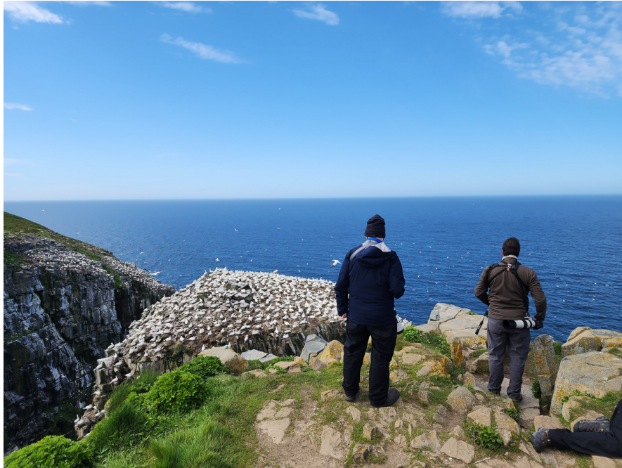
Cape St Mary's View

On the way down, we spotted a huge target for us: Willow Ptarmigan. Two counter-singing males and a female! We spent some time photographing them within view of the Cape St. Mary's Visitor's Centre.