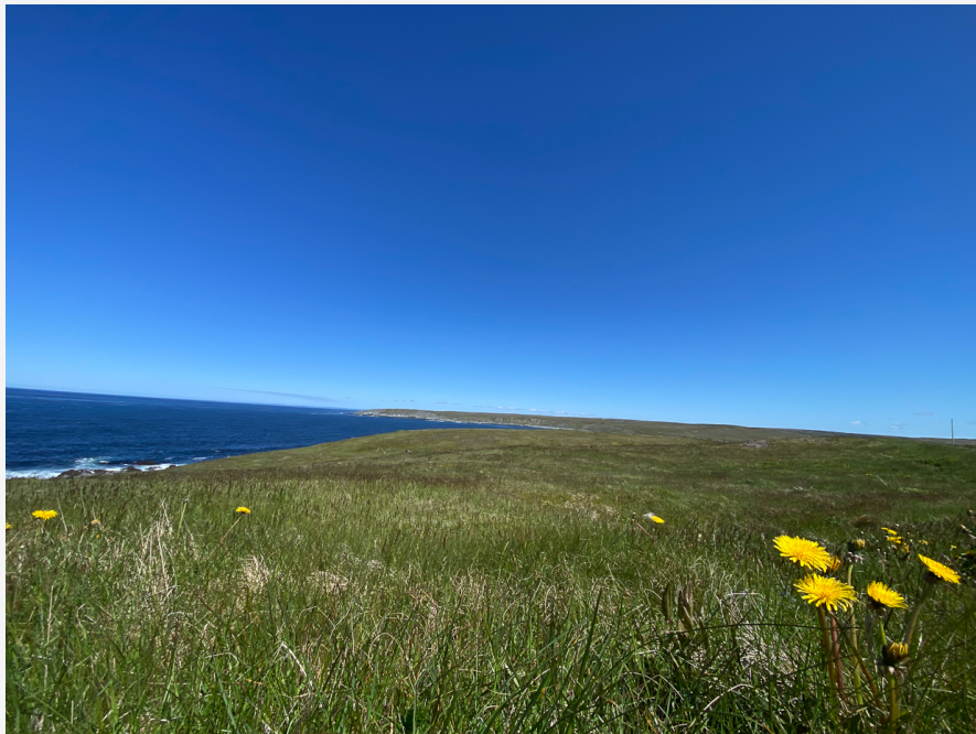
St Schotts

Before we packed up, another small group crested the ridge in front of us, made their way onto the road and started towards us, allowing for awesome views and photo opportunities! We continued on to scenic St. Schotts, where we scored our first Common Eider, Sooty Shearwaters, Short-tailed Swallowtails and beautiful looks at pairs of both Harlequin and Long-tailed Ducks!