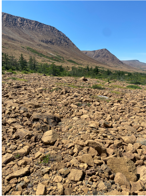
Tablelands

Our final stop was the Gros Morne Discovery Centre, where we learned of the geology, history, and culture of this unique and fascinating national park. Lastly, we made the drive to Deer Lake for dinner, a final wrap up, hugs, and goodbyes.