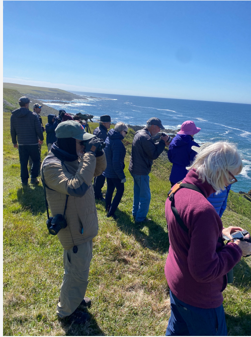
Group at St Shotts

Leaving St. Schotts, we drove along the beautiful coastline, stopping in Peters River, and then just across the causeway at St. Vincent's beach, where Humpback Whales were putting on a show just off the beach. We ate lunch here and continued on our scenic drive, stopping in Point La Haye and finally at Capeway Inn in St. Brides to stay the night.