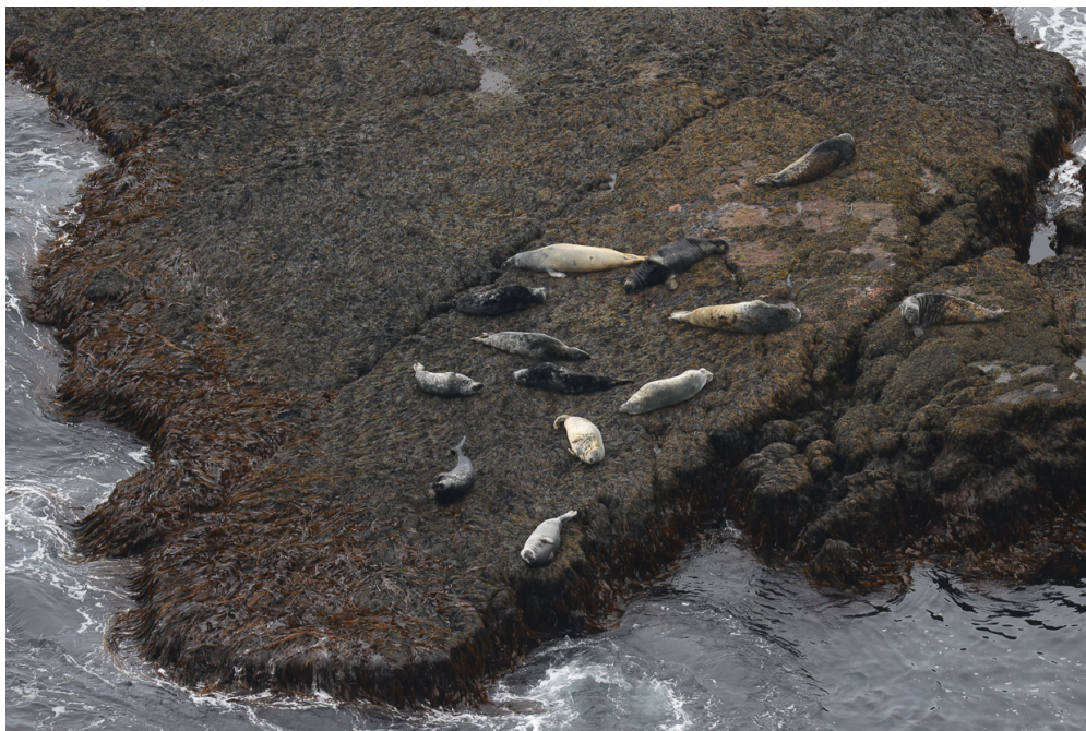
Gray Seals

camera lenses. Common Murre lined the cliffs and we even managed to pick out a Thick-billed Murre amongst the Commons. A group of Gray Seals and our only Great Cormorants were other highlights here.