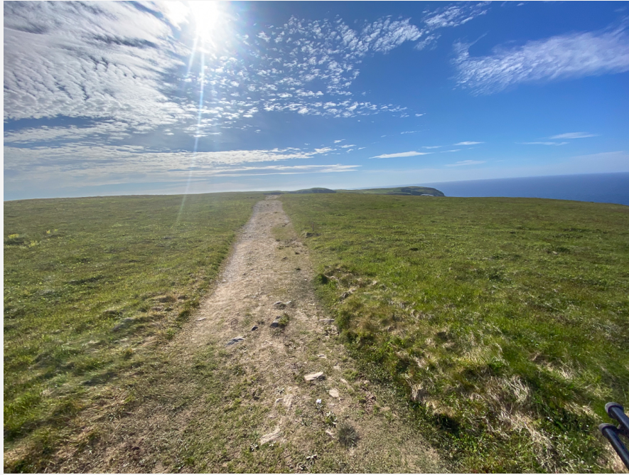
Cape St Marys © Tim Lucas