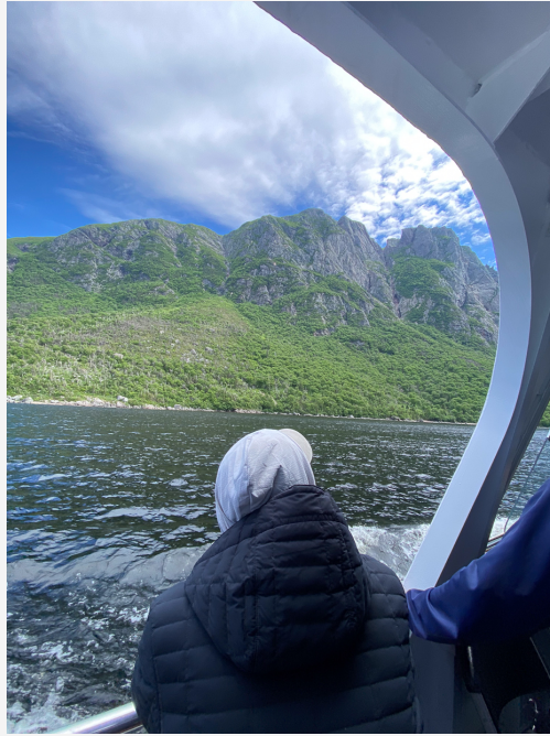
Gros Morne Boat trip

We ate our lunch at the edge of the pond after the walk in and took in the scenery on the boat. After the tour we made our way to Parson's Pond, where a colony of Bank Swallows has established a stronghold. We then made the long drive back to the Hotel in Rocky Harbour for dinner at Java Jacks.