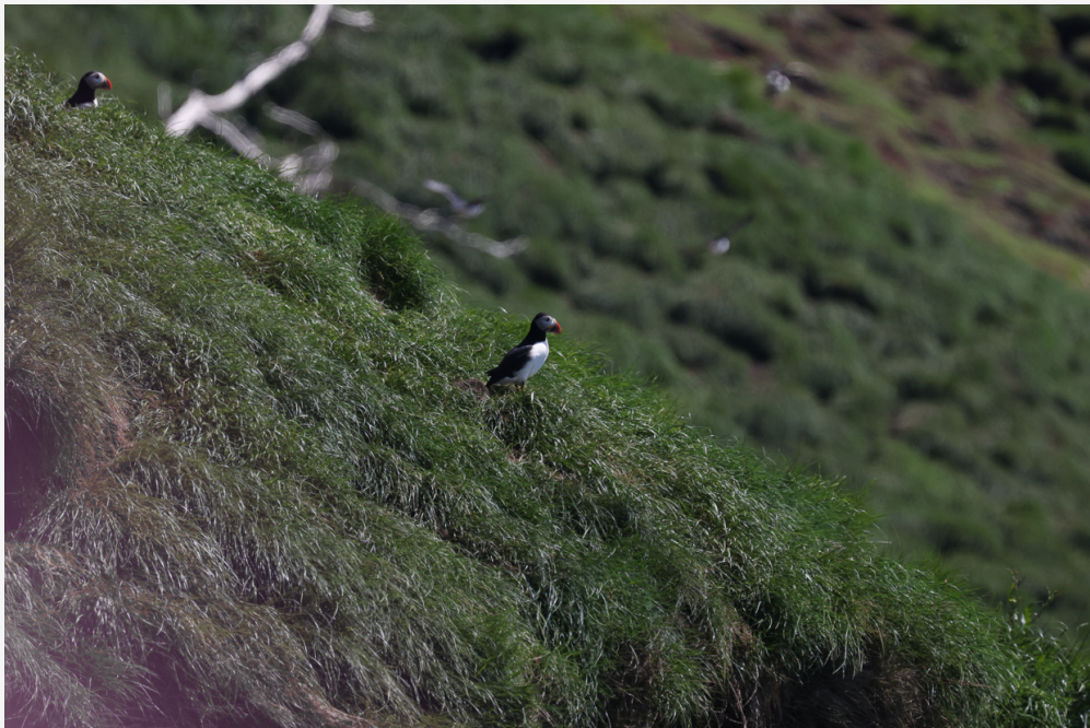
Atlantic Puffins

Arriving to the Islands, impressive swarms of murres, puffins, and Razorbills streamed to and from their nests. Our captain maneuvered the boat to get close, and we even got looks at Thick-billed Murre amongst the Common Murre. After a perfect afternoon on the water we made our way back to St. John's for dinner at the historic Celtic Hearth.