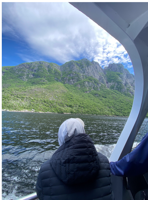
Gros Morne Boat trip

We started the morning at Berry Hill, where we had great looks at Mourning and Tennessee Warblers. We even spotted a singing Blue-headed Vireo! Then it was time to make the hike to Western Brook Pond for our boat tour of this stunning pond.