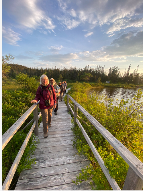
Sandy Pond

We spent the evening in Terra Nova National Park, making sure to stop by the Ochre Hill Lookout to watch the sun set and to spot our first moose.