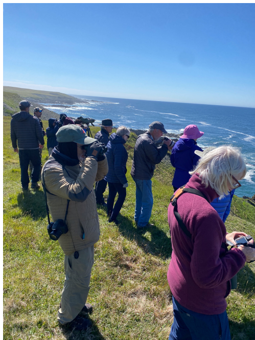
Group at St Schotts