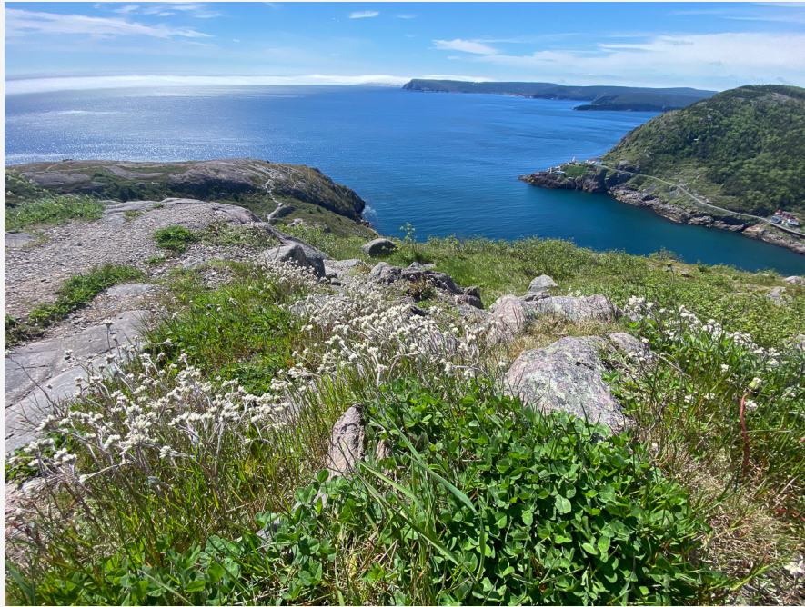
Signal Hill

We started the day with a visit to Cape Spear, the easternmost point of land in North America, and home to Newfoundland's oldest lighthouse. The weather was clear, providing incredible visibility all the way back to St. John's and to the horizon of the ocean. Despite the clarity, there was enough fog to create a moody and atmospheric scene. At Cape Spear, a few of us had the thrill of seeing two humpback whales and dolphins offshore, as well as Northern Gannets and an American Pipit. Next, we headed to Signal Hill, where we explored the rich history and diverse wildlife of the area. Bird highlights at Signal Hill included Yellow Warblers, Common Grackles, and Purple Finches. Here we enjoyed a picnic lunch amidst the beautiful surroundings.