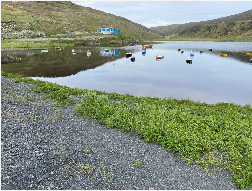
Cape Race Models

Cape Race Lighthouse, spotting Horned Larks and Northern Harrier, Scoters, and distant Manx Shearwaters. Our day concluded at the Edge of the Avalon Inn, where we were treated to live music and an amazing meal together, providing a perfect end to a day filled with diverse and memorable experiences.