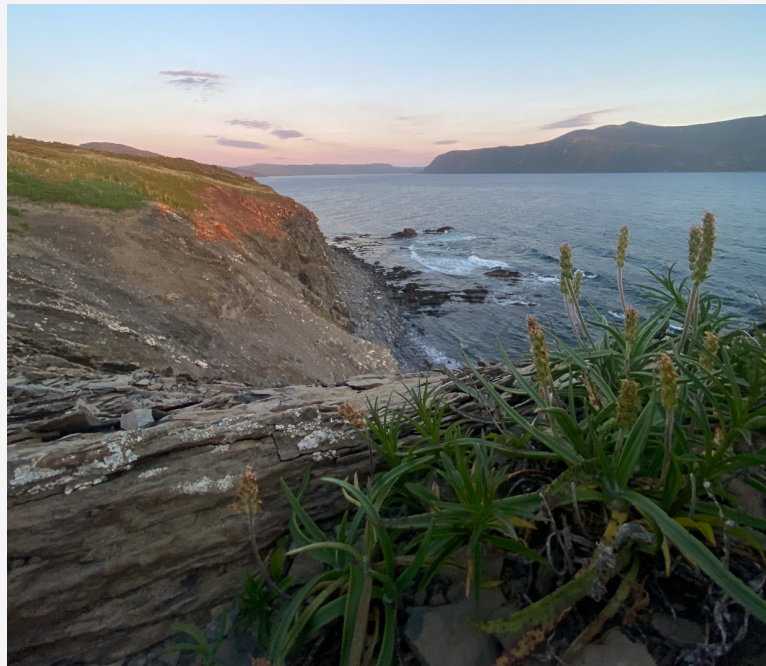
Rocky Harbour

We ate our lunch at the edge of the pond after the walk in and took in the scenery on the boat. After the tour we made our way to Parson's Pond, where a colony of Bank Swallows has established a stronghold. We then made the long drive back to the Hotel in Rocky Harbour for dinner at Java Jacks.