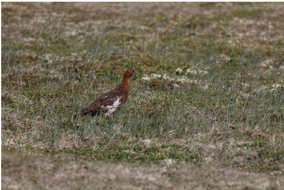
Willow Ptarmigan

On the way down, we spotted a huge target for us: Willow Ptarmigan. Two counter-singing males and a female! We spent some time photographing them within view of the Cape St. Mary's Visitor's Centre.