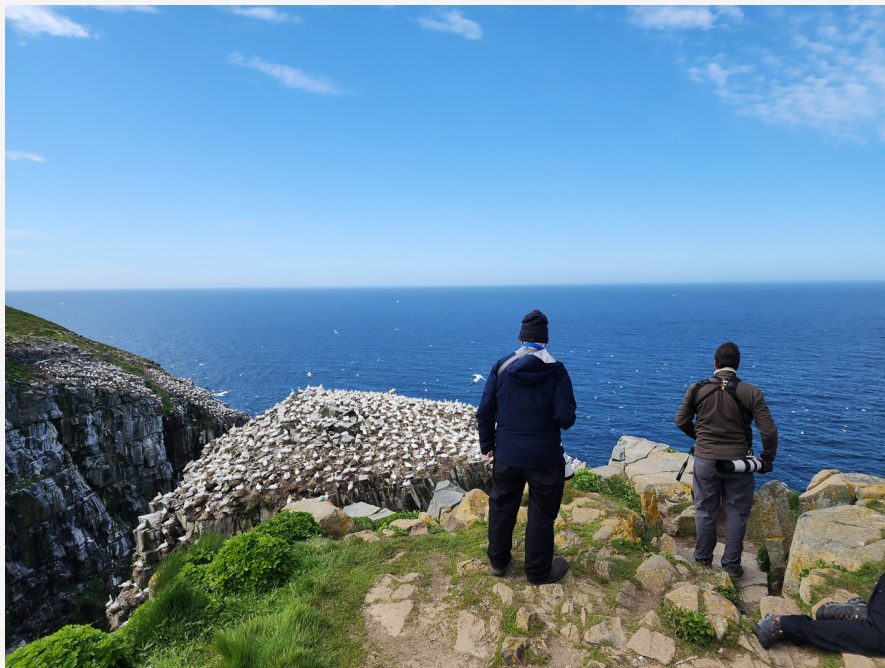
Cape St Mary's View

On the way down, we spotted a huge target for us: Willow Ptarmigan. Two counter-singing males and a female! We spent some time photographing them within view of the Cape St. Mary's Visitor's Centre.