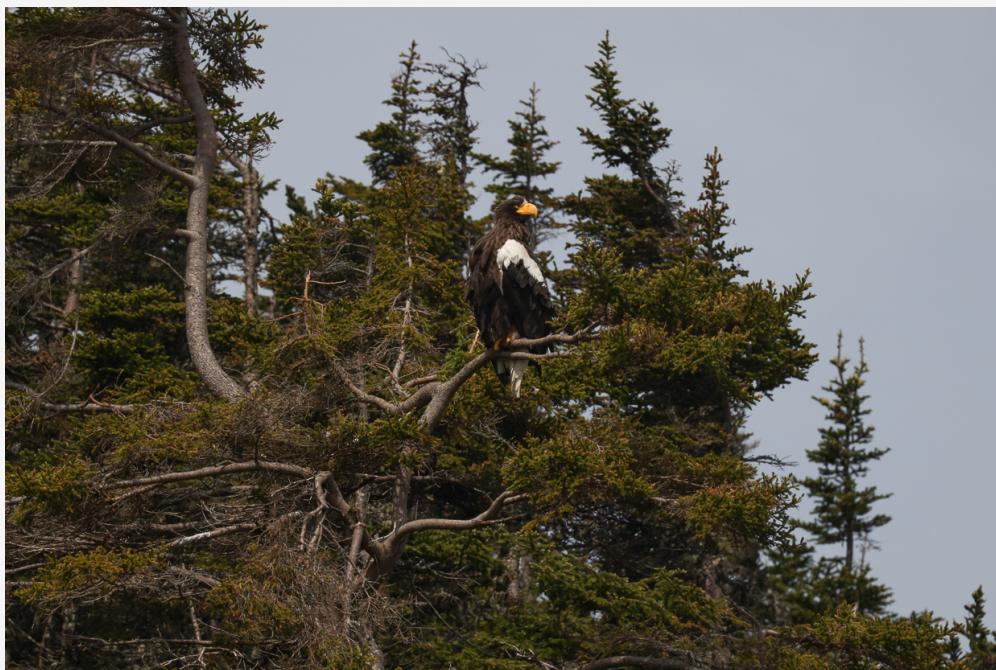
Steller's Sea Eagle

Today we were determined to try for the long-staying Steller's Sea Eagle. We started our day with an amazing breakfast at the motel that included homemade Partridge Berry jam! After breakfast, we packed up and headed East towards Trinity. We arrived in Trinity and checked into Sea of Whales Adventures, who offer boat tours of Trinity Bay and surrounding areas. After donning our survival suits we headed out on the water, where we were greeted by dozens of Black Guillemots, fair weather and fair seas! Arctic Terns made passes by our boat and we caught glimpses of brand new Herring Gull chicks! We made our way along the coastline in and out of coves in search of the Steller's Sea Eagle. Although many Bald Eagles were perched up on the rock, we were not having much luck with our target. Finally, on the South Shore of Cat Cove, our skipper spotted our target perched low in a Black Spruce.