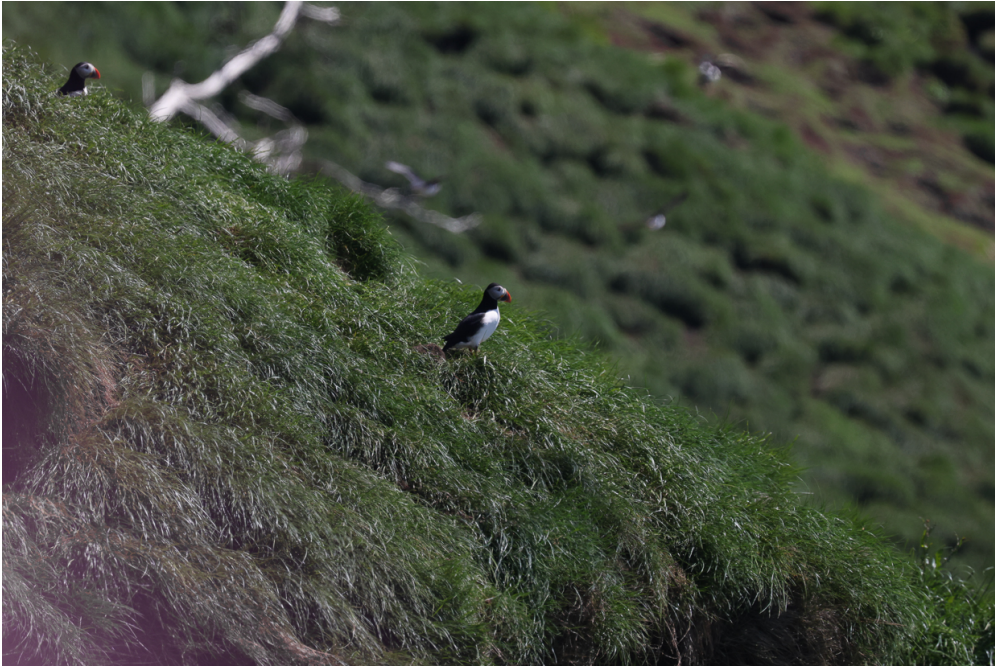
Atlantic Puffins