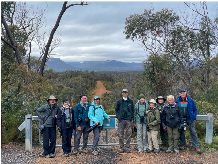
Eagle-Eye Tours guests at Capertee Valley

Day 17: October 26, 2022 The fantastic tour concluded this morning in Sydney with some of the group heading onwards for the Tasmania extension and others heading to their respective homes.