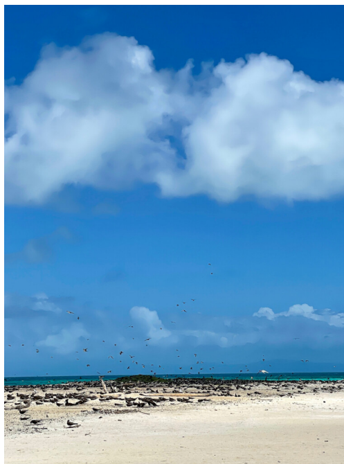
Michaelmas Cay © Abram Tompkins

Time allowed for one more stop: a known Rufous Owl location. Darkness was settling in quickly, but all guests had views before we retreated for dinner. Day 3: October 12, 2022 It was a rainy start on our 2-hour journey to Michaelmas Cay on the Great Barrier Reef for nesting seabirds, but upon arrival the weather was absolutely perfect and the birding spectacle was top-notch! We had unbeatable views of Brown Noddies, Sooty Terns, Great and Lesser Crested Terns, Brown Boobies and a Red-footed Booby, in addition to fly-by views of Great Frigatebirds. Brief views of Black-naped Terns and a lone Roseate Tern as well rounded out our day on the reef.