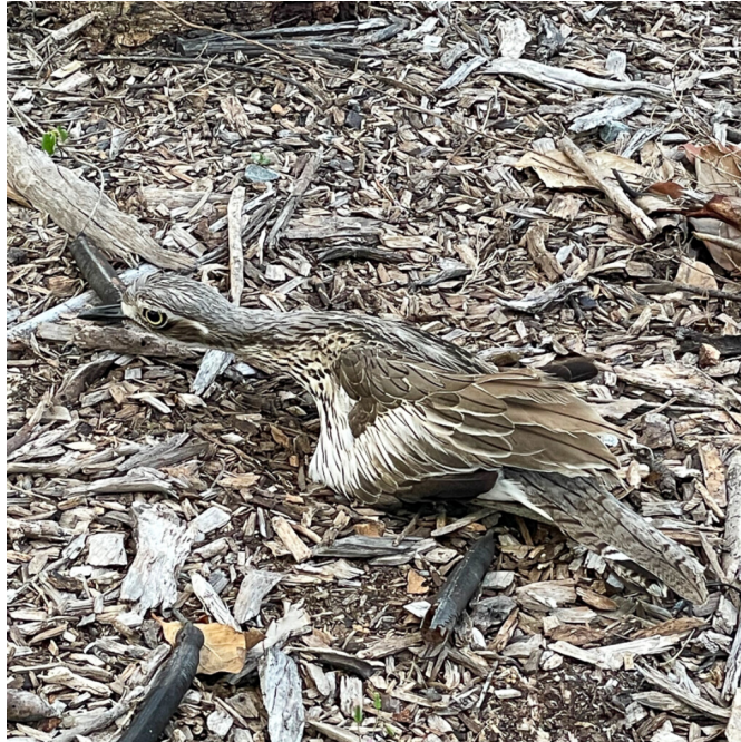
Bush Stone-Curlew on nest

Time allowed for one more stop: a known Rufous Owl location. Darkness was settling in quickly, but all guests had views before we retreated for dinner. Day 3: October 12, 2022 It was a rainy start on our 2-hour journey to Michaelmas Cay on the Great Barrier Reef for nesting seabirds, but upon arrival the weather was absolutely perfect and the birding spectacle was top-notch! We had unbeatable views of Brown Noddies, Sooty Terns, Great and Lesser Crested Terns, Brown Boobies and a Red-footed Booby, in addition to fly-by views of Great Frigatebirds. Brief views of Black-naped Terns and a lone Roseate Tern as well rounded out our day on the reef.