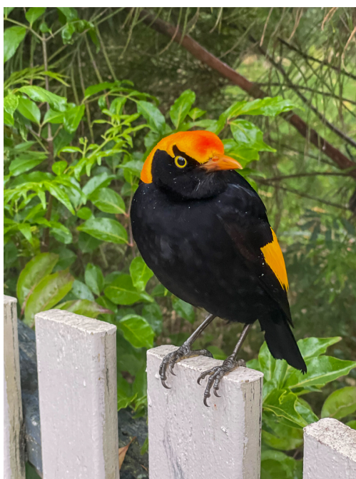
Regent Bowerbird male

Fairy-wren pair near a fence line, Brown Cuckoo Doves and Eastern Yellow Robins. We returned to Cairns for the evening and prepared for our early morning flight to Brisbane. Day 9: October 18, 2022 We boarded our 6am flight for Brisbane and after arrival we drove to a southern suburb in search of the iconic Koala, which was successful. We saw several Maned Ducks, Noisy Miners, Mangrove Honeyeater, Noisy Friarbird, Pied Oystercatcher, Masked Lapwings, Australian Ibis, Grey Butcherbird and heard a Mangrove Gerygone. Closer to Lamington National Park we made one additional stop and came across Bell Miners, Variegated Fairywrens and spotted a female Paradise Riflebird and a handful of White-breasted Woodswallows. We continued onward to O'Reilly's Rainforest Retreat with short stops along the way to get better looks at Red-necked Wallabies. Once up the mountain and outside O'Reilly's reception, we were greeted by an assortment of extremely tame species seeking food, which included Regent and Satin Bowerbirds, Australian King Parrots, Crimson Rosellas, Wonga Pigeons, Grey Shrikethrush and White-browed Scrubwrens. Spotlighting after dinner had several close views of Common Ringtail Possums.