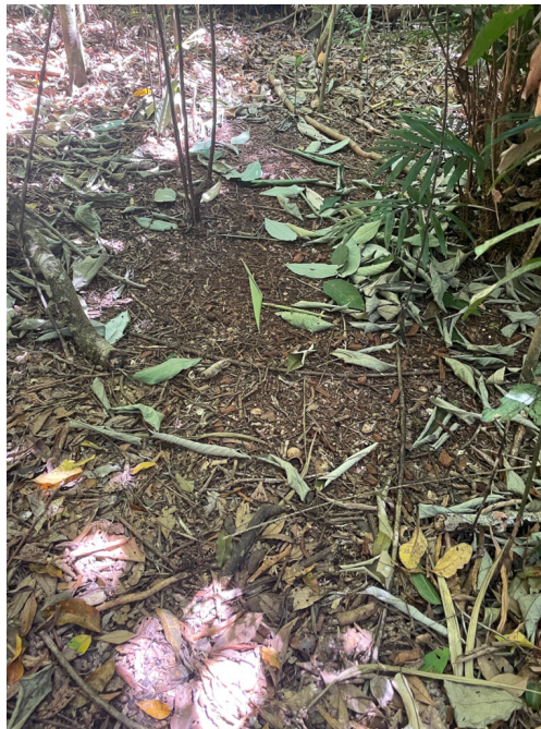
Tooth-billed Bowerbird stage

A rest stop at Hasties Swamp always produces several species and today was no different. While eating lunch, we had great looks at Grey Teal, Dusky Moorhen, Australasian Swamphen, Eurasian Coot, Pied Stilt, Comb-crested Jacana, Little Black Cormorant, White-faced Heron, Hardhead, Australasian Grebe and Royal Spoonbill. An eventful search at Mt Hypipamee Crater had a calling White-throated Treecreeper, a Peregrine Falcon perched above the crater, Grey-headed Robins and best of all, a male calling Golden Bowerbird which perched calmly nearby for great viewing. Barn Owls were spotted near the Curtain Fig parking area and Coppery Brushtail Possum were spotted at the entry just after dark, then we retreated to the lodge for a well-deserved rest. Day 8: October 17, 2022 We started around the lodge this morning and had great views of Victoria's Riflebirds and Spotted Catbirds yet again, plus other usual sightings. After breakfast we made a few stops to admire Sarus Cranes and Brolgas at close range, followed up by fabulous views of a Red-backed