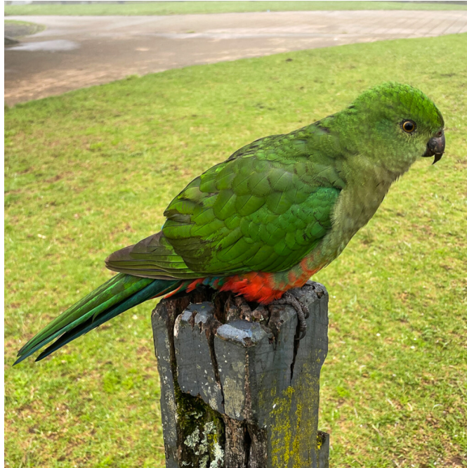
Australian King Parrot

Day 12: October 21, 2022 Our pelagic trip out was cancelled due to strong wind warnings and 2-3m waves so we had a change of plans and birded in the Sydney suburbs and found an assortment of new trip species, which included Sacred Kingfisher, Fan-tailed Cuckoo, Australian Raven, New Holland Honeyeater, Little Wattlebird, Red Wattlebird, Dollarbird, Spotted Pardalote and Yellow-tailed Black-Cockatoo, in addition to more spectacular views of Topknot Pigeons, which has been seen in such great positions on several occasions.