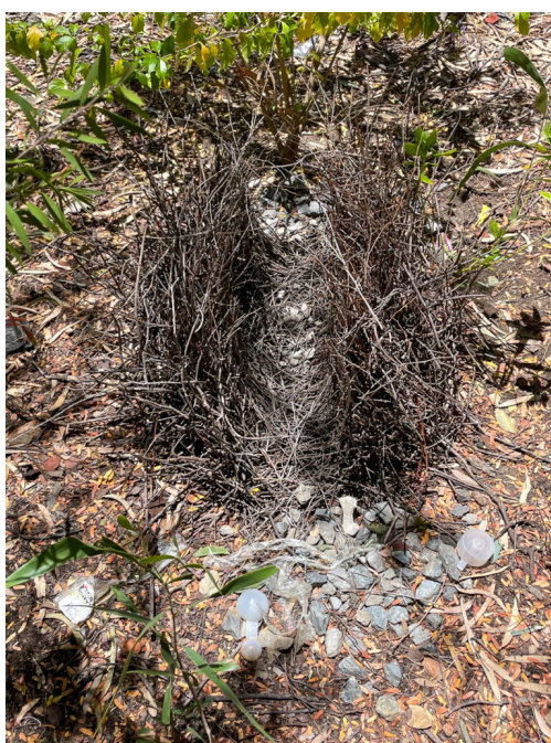
Great Bowerbird bower

Day 4: October 13, 2022 We started another morning at the Cairns Esplanade and added Olive-backed Sunbird, White-bellied Cuckooshrike, Yellow Honeyeater, Common Greenshank, Sharp-tailed Sandpiper, Bar-shouldered Dove before venturing to a cemetery nearby. A fly-by Pacific Baza was on display, followed by a pair of nesting Gray Goshawks and Brahminy Kites, plus a roost of flying foxes (both Spectacled and Black Flying Foxes were present). We hit the road, left Cairns and picked up where we left off in the Atherton Tablelands (Cairns Highlands). A brief stop at an information centre further added to our trip total with Olive-backed Oriole, Rufous Whistlers, White-throated Honeyeater and Black Kites. A nearby stop for a mob of Eastern Grey Kangaroos (and very excited tour guests) had Channel-billed Cuckoos and Pacific Koel calling, followed by sightings of Little Corella, Red-winged Parrot, Crested Pigeon and Pale-headed Rosellas. A targeted search in Mount Malloy found us a Squatter Pigeon along with several Great Bowerbirds (and bowers too)! Upon arrival at Kingfisher Park Birdwatchers Lodge, we quickly added Chestnut-breasted Munia, Red-browed Firetail, Macleay's Honeyeater, Blue-faced honeyeater, Cryptic Honeyeater, Yellow-faced Honeyeater and Spectacled Monarch at the feeders and surrounding areas.