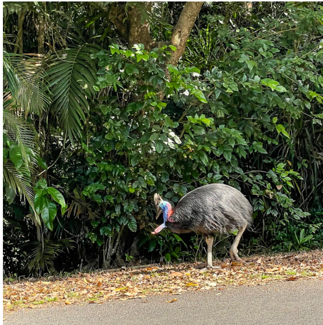
Cassowary scouring for food

We returned to Cairns to walk around the Centenary Lakes and added Osprey, Striated Heron, Little Black Cormorant, Magpie-lark, Australian Brushturkey, Orange-footed Scrubfowl, Pacific Black Duck, Bush Stone-curlew and Black Butcherbird.