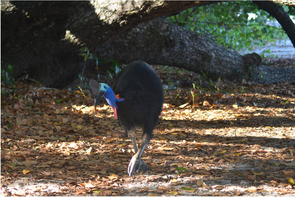
Southern Cassowary