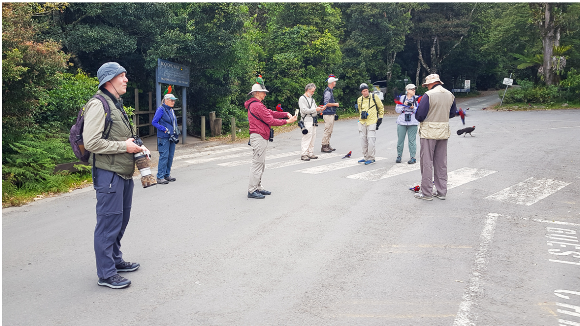
Birding at O'Reilly's