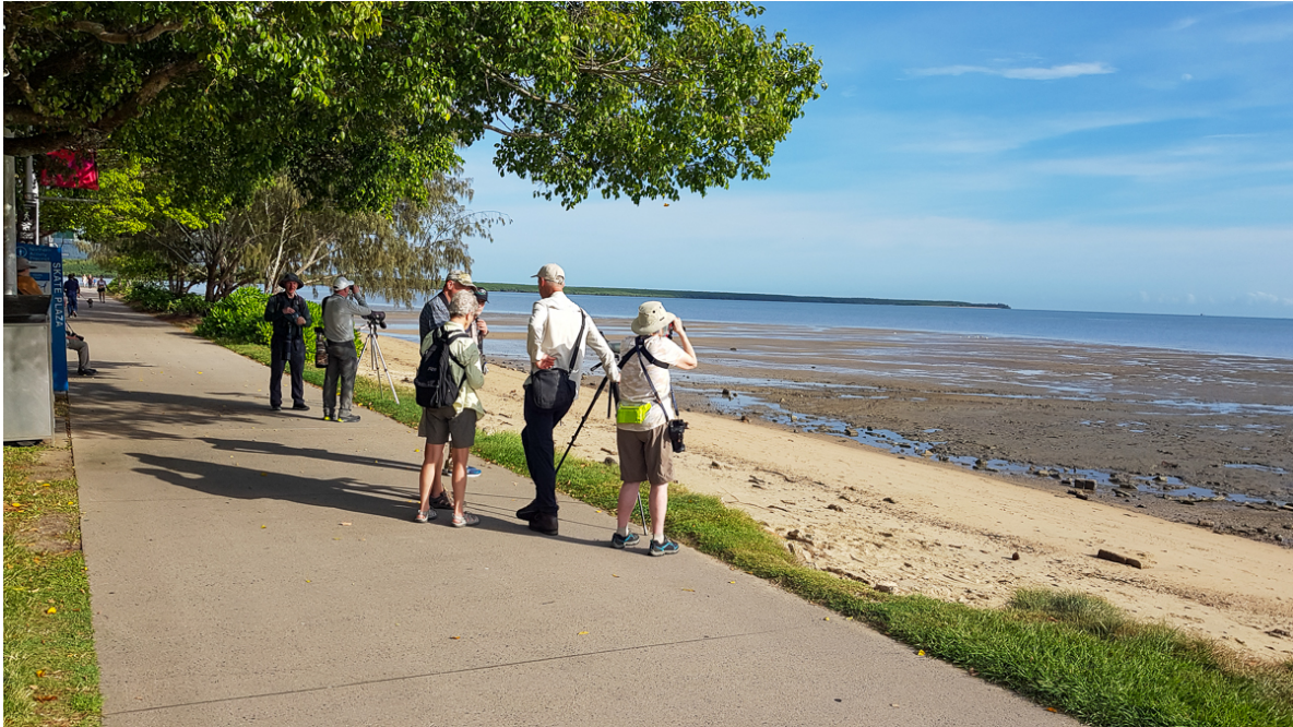
Birding on the Cairns Esplanade

After a visit to the Botanic Gardens for Papuan Frogmouths at roost we moved down the coast to a site for Southern Cassowary. Here our initial disappointment was replaced with awe as we found not one but two of the stunning big birds; the first strolling along the beach. Later we stopped at a colony of nesting Metallic Starlings.