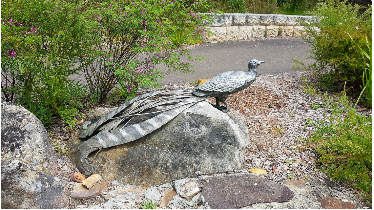
This Lyrebird just wouldn't move!