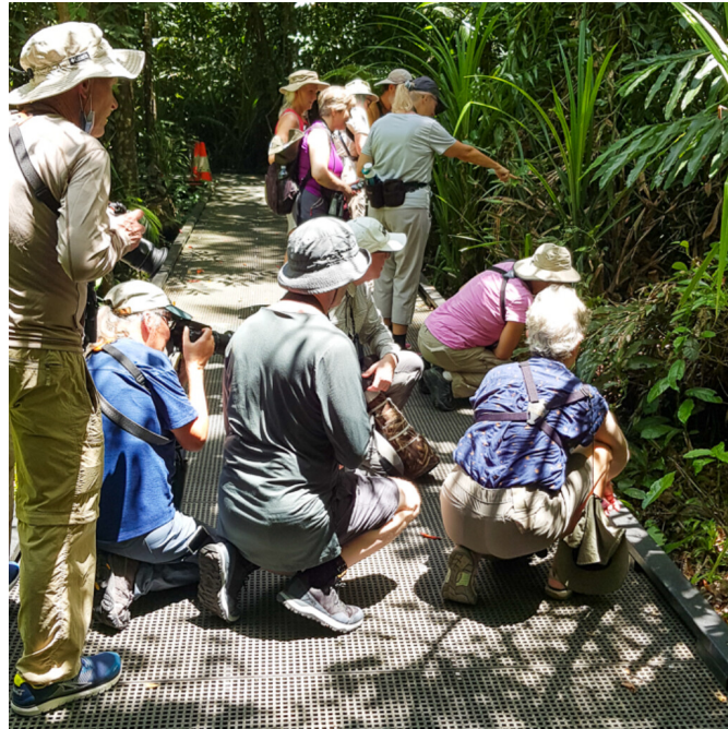
Birding on a Cairns boardwalk

More birding in the Cairns region produced Mangrove Robin and nesting Grey Goshawk, along with many more common species. Later we moved northwards to our new accommodation in Port Douglas.