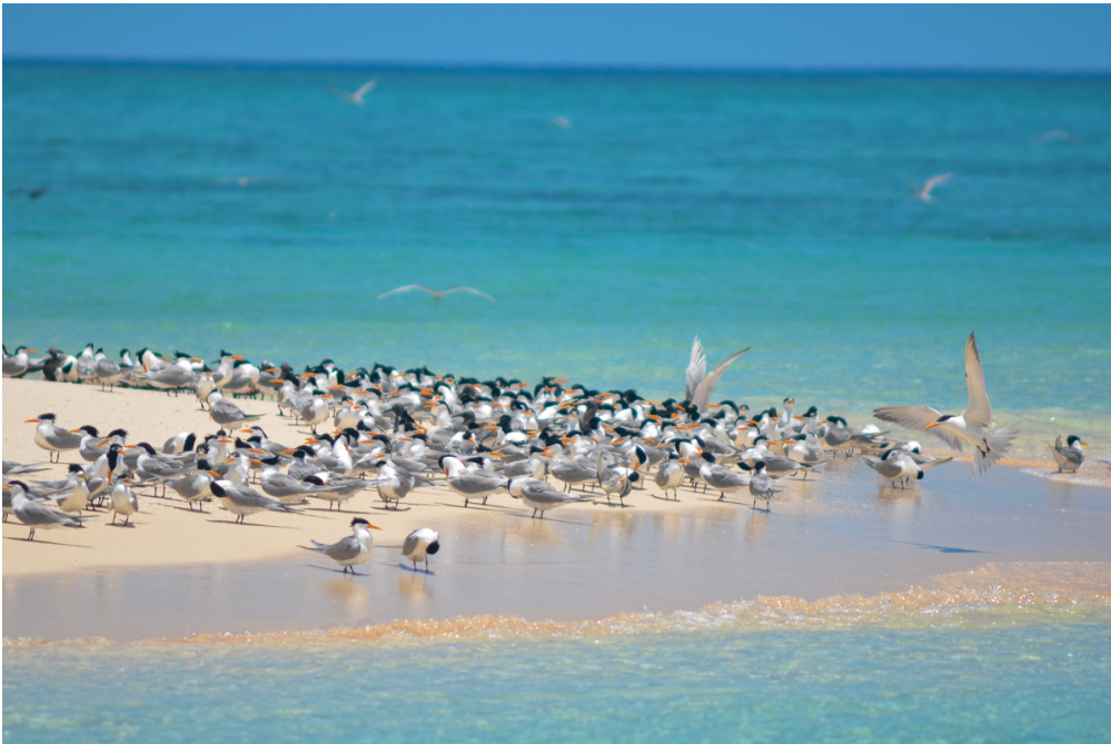
Great and Lesser Crested Terns

try snorkelling or glass bottom boat coral viewing, had great weather. We had incredible close views of Brown Noddies, Sooty Terns, Great and Lesser Crested Terns, Brown Boobies all at various stages of nesting and visitors like Lesser and Great Frigatebirds, a Red-footed Booby and other terns and shorebirds.