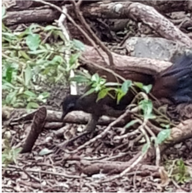
Albert's Lyrebird