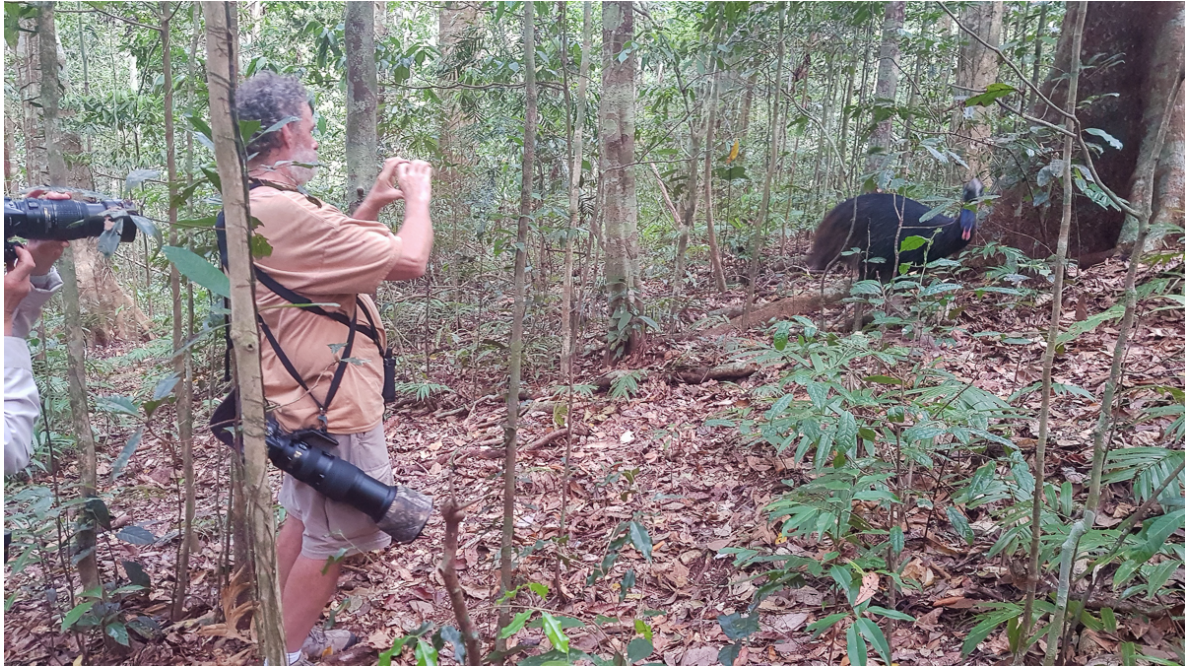
Taking photos of Southern Cassowary