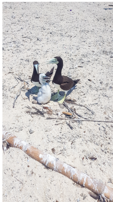
Brown Boobies