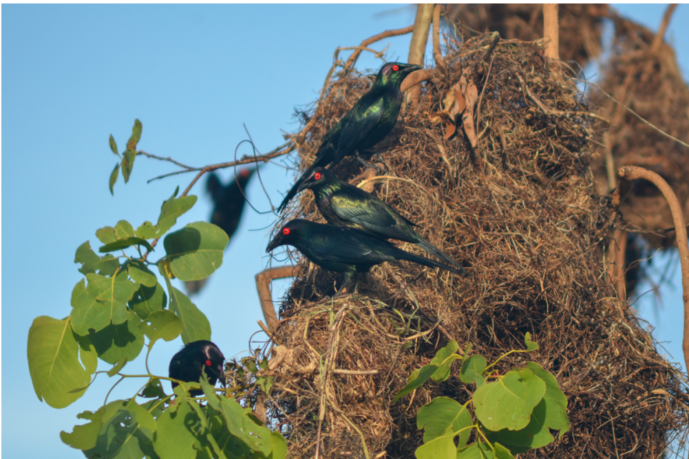
Nesting Metallic Starlings