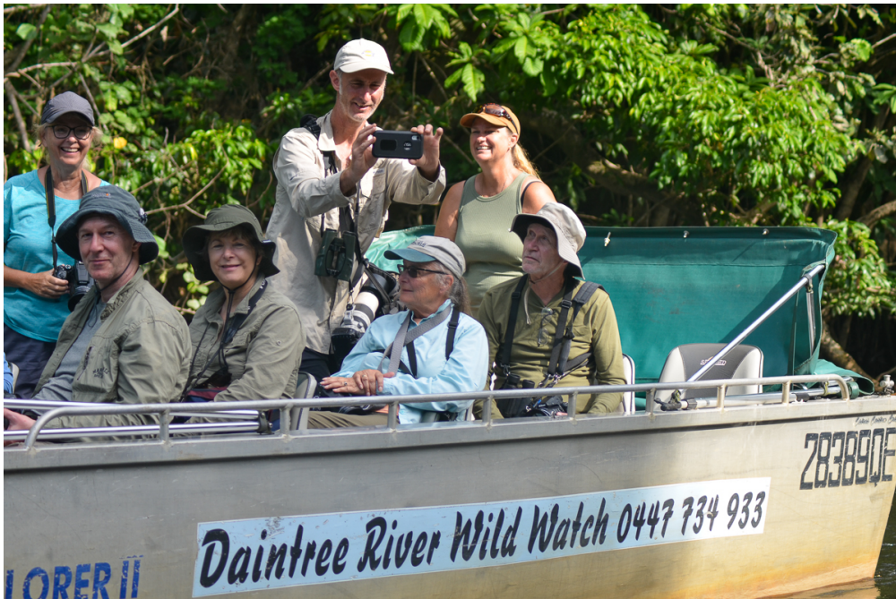
Boat trip on the Daintree River