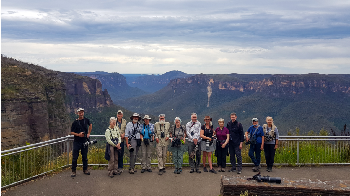
Birding group at Blue Mountains lookout