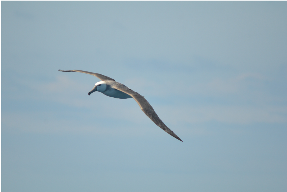
White-capped Albatross

Our pelagic day trip out from Sydney had ideal conditions, not too rough and not too calm. We were able to find three species of Albatross, White-capped, Black-browed and Wandering, Wilson's Storm-Petrel and five different species of shearwaters. For some, the highlight of the day was a close sighting of a huge Sunfish or Mola mola relaxing at the surface.