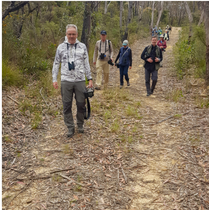
Blue Mountain birding