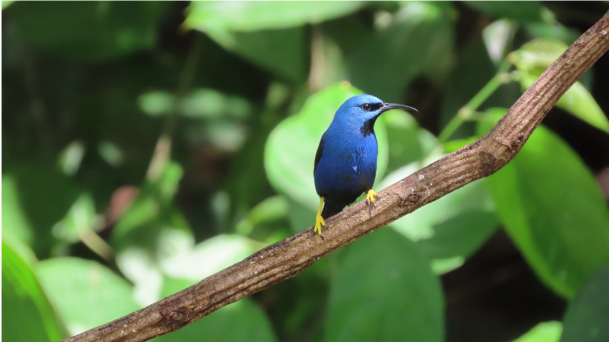
Shinning Honeycreeper © Ernesto Carman