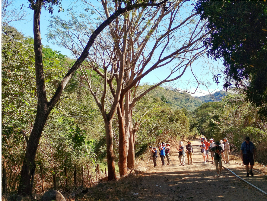
Birding at Caldera

As the temperature began to soar we boarded the air conditioned bus and went birding along the Guácimo Road where we saw Plain-capped Starthroat, Groove-billed Ani and Clay-colored Thrush, and a little further down the road we spotted another one of our targets for this road, the Double-striped Thick-Knee , standing in the shade of a small tree. We drove to Tárcoles Birding Hotel where we had lunch while we enjoyed the view of the Golfo de Nicoya and watched White-faced Capuchin Monkeys and White-nosed Coatis raid the bird feeder. We also enjoyed great views of several hummingbirds feeding from a vervaine hedge including Ruby-throated, Blue-vented and Cinnamon Hummingbirds and Blue-throated Goldentail. After lunch we drove to the small village of Tárcoles where we saw Rufous-naped Wren, Yellow-bellied Elaenia, Lineated Woodpecker and a family of Black-and-white Owls roosting in a mango tree along the roadside! From here we drove the short distance to our hotel where we settled in for the evening and enjoyed a fantastic dinner.