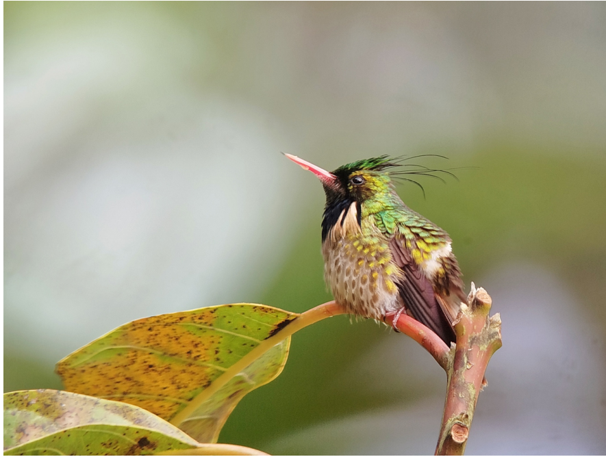
Black-crested Coquette