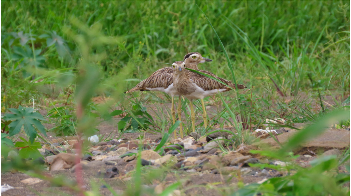
Double-striped Thick-Knee © Ernesto Carman