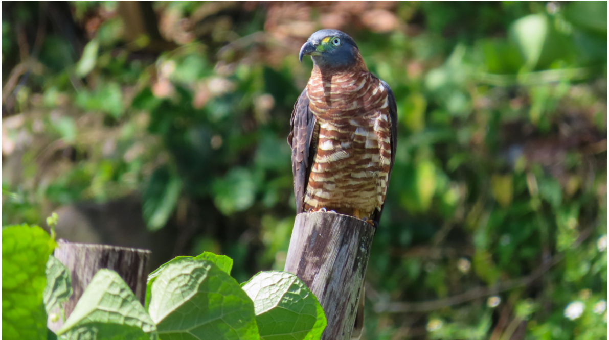
Hook-billed Kite

We returned for breakfast and had a blast watching the feeder where Montezuma Oropendola, Scarlet-rumped, Silver-throated and Summer Tanagers, White-eared Ground-Sparrow , White-naped Brush-Finch and Baltimore Orioles joined us for breakfast. After breakfast we drove back out the valley and had close-up views of a pair of Bat Falcons and Southern Lapwings, then ended up visiting the Ruinas de Ujarrás, the ruins of an old church from the seventeenth century and saw Green-breasted Mango, Collared Aracari , Black Phoebe and Golden-browed Chlorophonia.