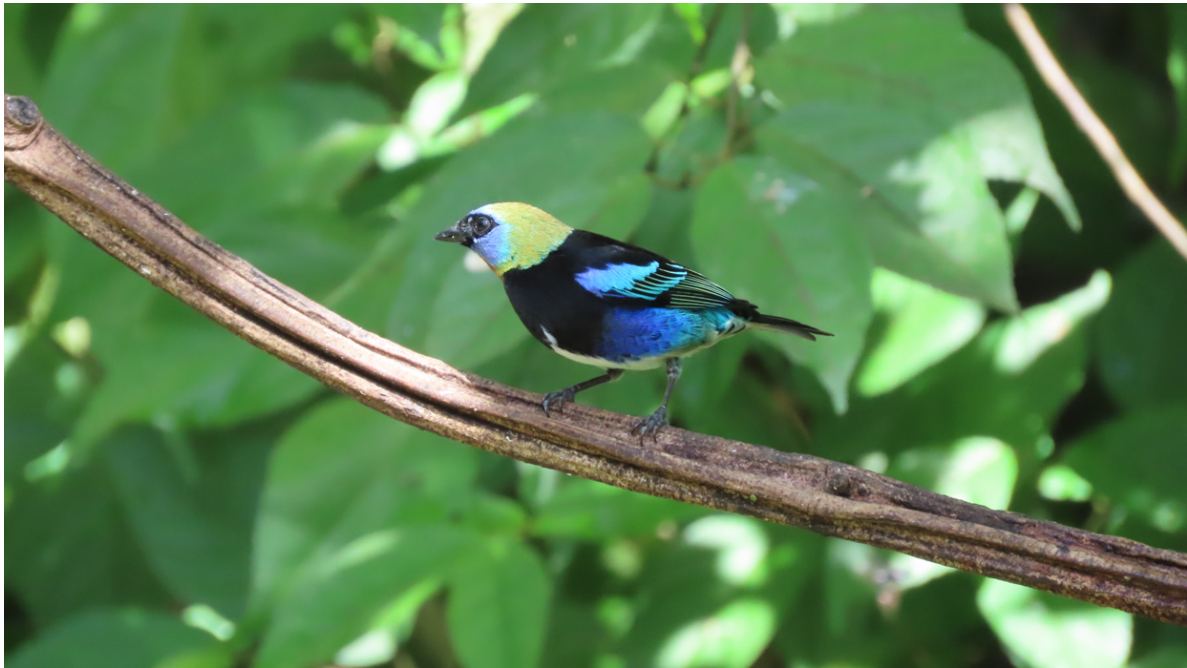
Golden-hooded Tanager