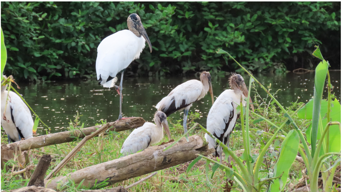
Wood Stork