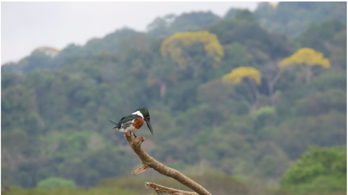
Amazon Kingfisher