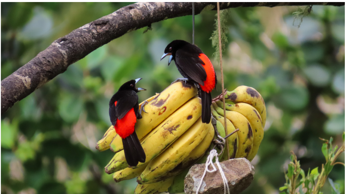
Scarlet-rumped Tanager

We returned for breakfast and had a blast watching the feeder where Montezuma Oropendola, Scarlet-rumped, Silver-throated and Summer Tanagers, White-eared Ground-Sparrow , White-naped Brush-Finch and Baltimore Orioles joined us for breakfast. After breakfast we drove back out the valley and had close-up views of a pair of Bat Falcons and Southern Lapwings, then ended up visiting the Ruinas de Ujarrás, the ruins of an old church from the seventeenth century and saw Green-breasted Mango, Collared Aracari , Black Phoebe and Golden-browed Chlorophonia.