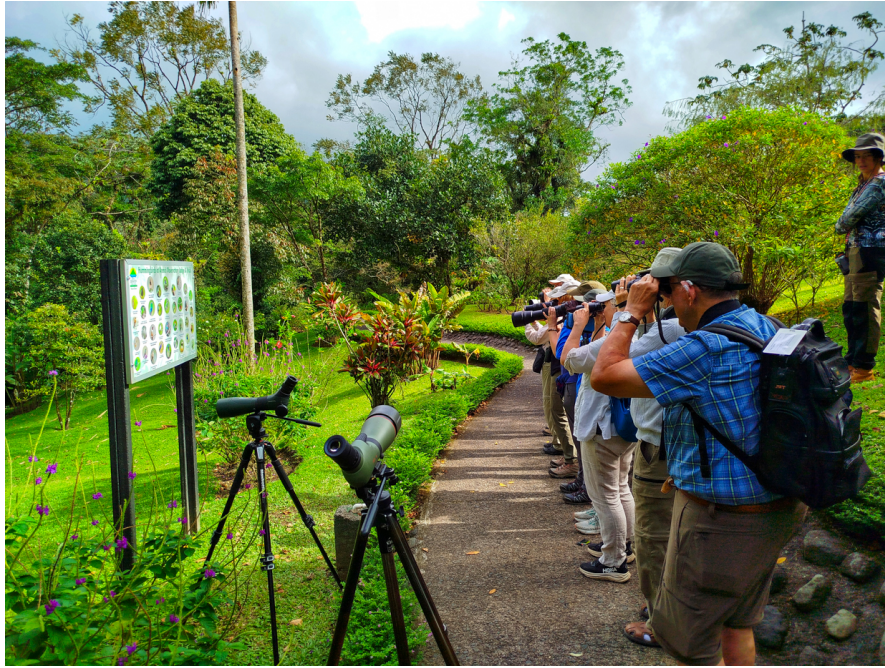
Birding Arenal Observatory Lodge

Bellies and memory cards full, we continued heading west towards Arenal Observatory Lodge, but we made one pit stop along the way in Muelle where, not only were there bathrooms, there was also a pair of Barn Owls roosting in the rafters inside the supermarket! As we neared the lodge, the impressive Arenal Volcano welcomed us, almost completely clear of clouds and our expectations grew for the following day.