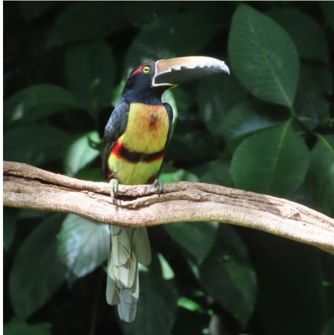
Collared Aracari