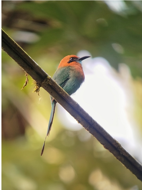
Broad-billed Motmot