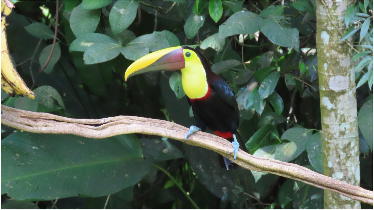
Yellow-throated Toucan