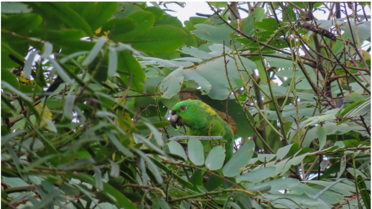
Yellow-naped Amazon © Ernesto Carman