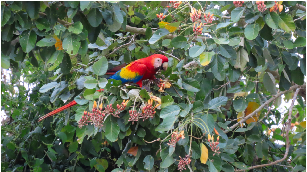
Scarlet Macaw