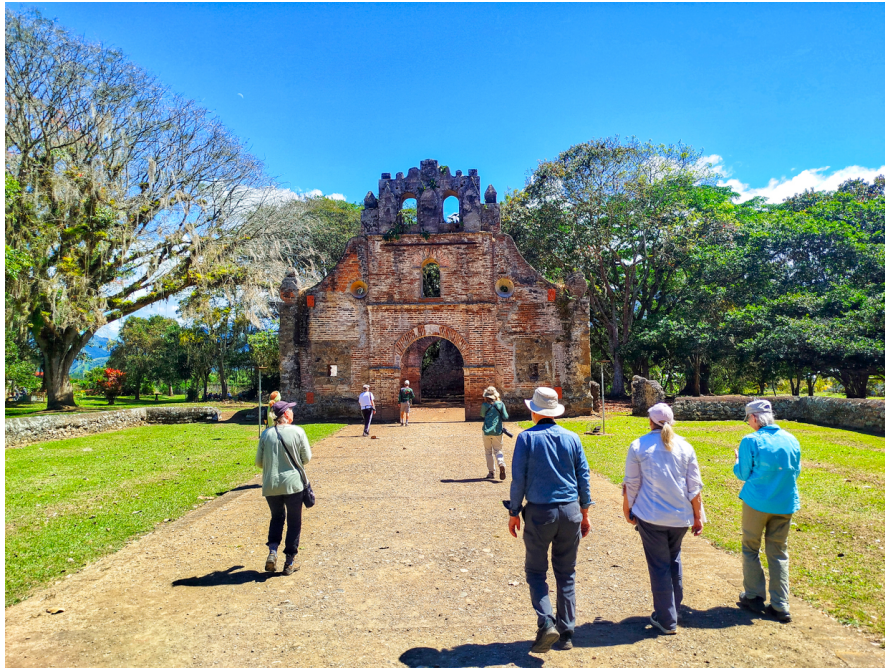
Birding Ruinas de Ujarrás

After lunch and a siesta (though some spotted Sunbittern instead!) we drove to Río Macho Forest Reserve just outside the village of Orosi. We arrived at sundown and spotted a pair of Black Guans feasting on the leaves and flowers of a Morning Glory vine before disappearing into the forest. We walked along the road, surrounded by forest, hoping to find an owl, but instead we saw several sleeping birds with the help of a thermal camera, including Swainson's Thrush, Silver-throated Tanager and Broad-winged Hawk. We also spotted an Olingo, a new mammal for our trip. After this night walk we enjoyed an amazing pizza dinner at Il Giardino before heading back to the hotel. But we had one more stop to make, and that was to see the resident Barn Owls in Paraíso!