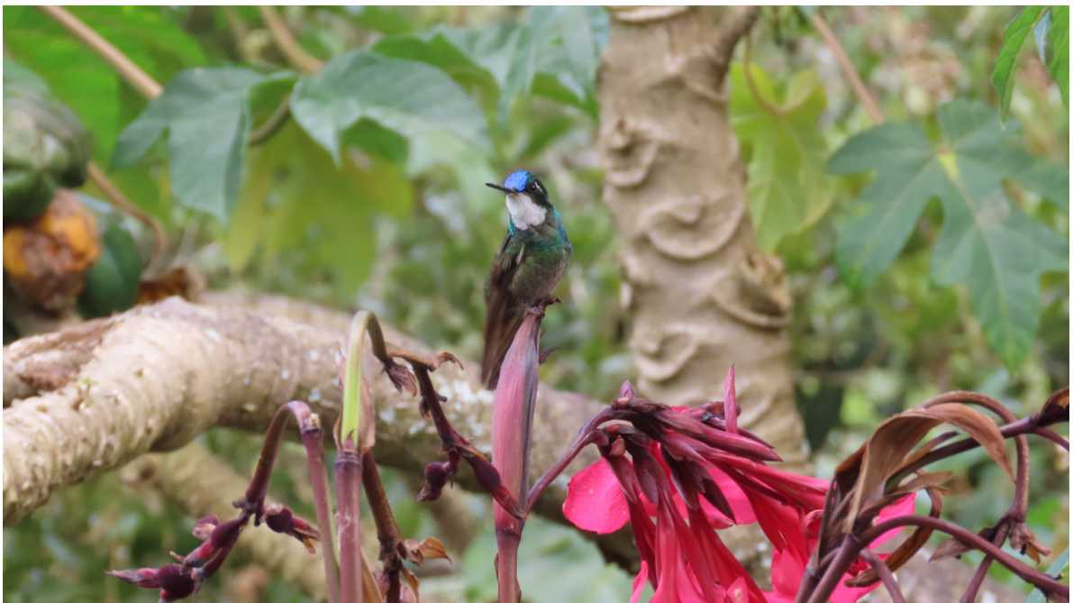
White-throated Mountain-Gem