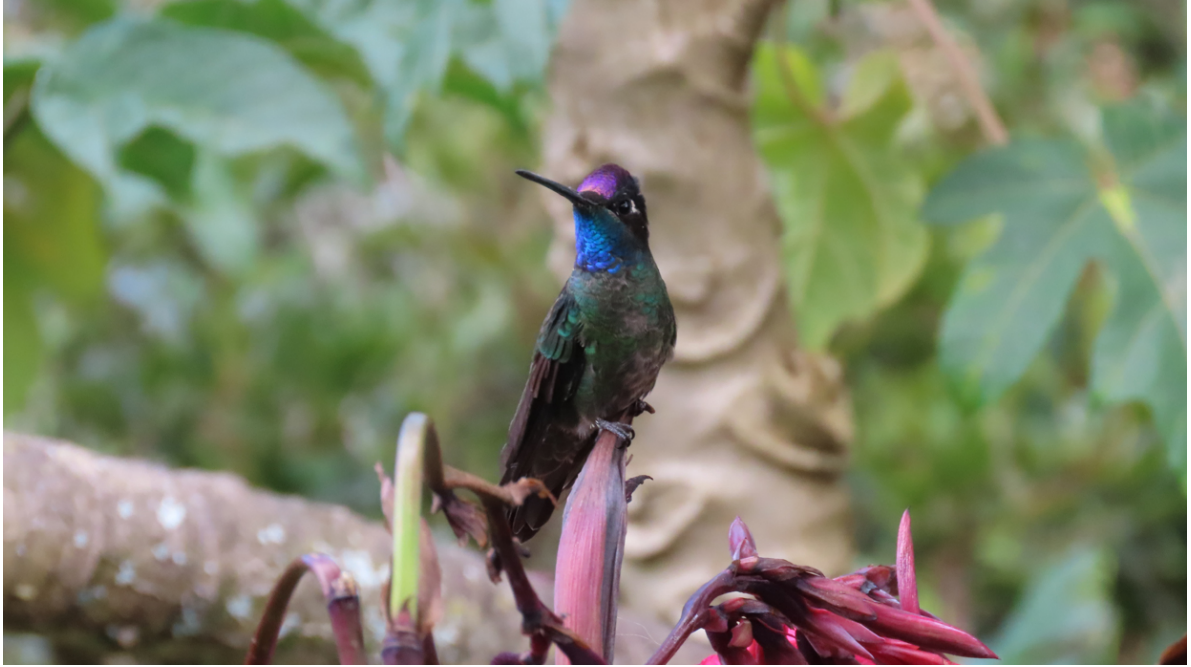
Talamanca Hummingbird

Lesser Violetear, White-throated Mountain-Gem , Yellow-thighed Brushfinch, Large-footed Finch, Acorn Woodpecker, Mountain Thrush and Flame-colored Tanager . Satisfied with the amazing birds we had seen, we drove back to Quelitales in time to visit the feeders by the waterfall and saw the usual suspects, but also had Green-fronted Lancebill , Slaty-backed Nightingale-Thrush and one of the specialties of this lodge, the Scaled Antpitta!