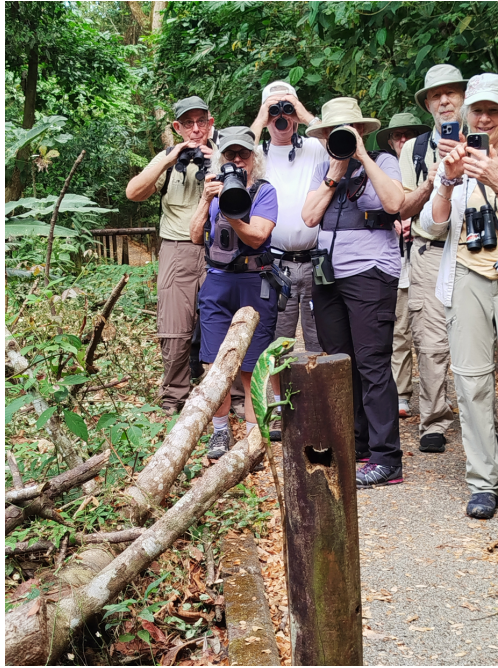
Watching Canopy Bush Anole (on post)