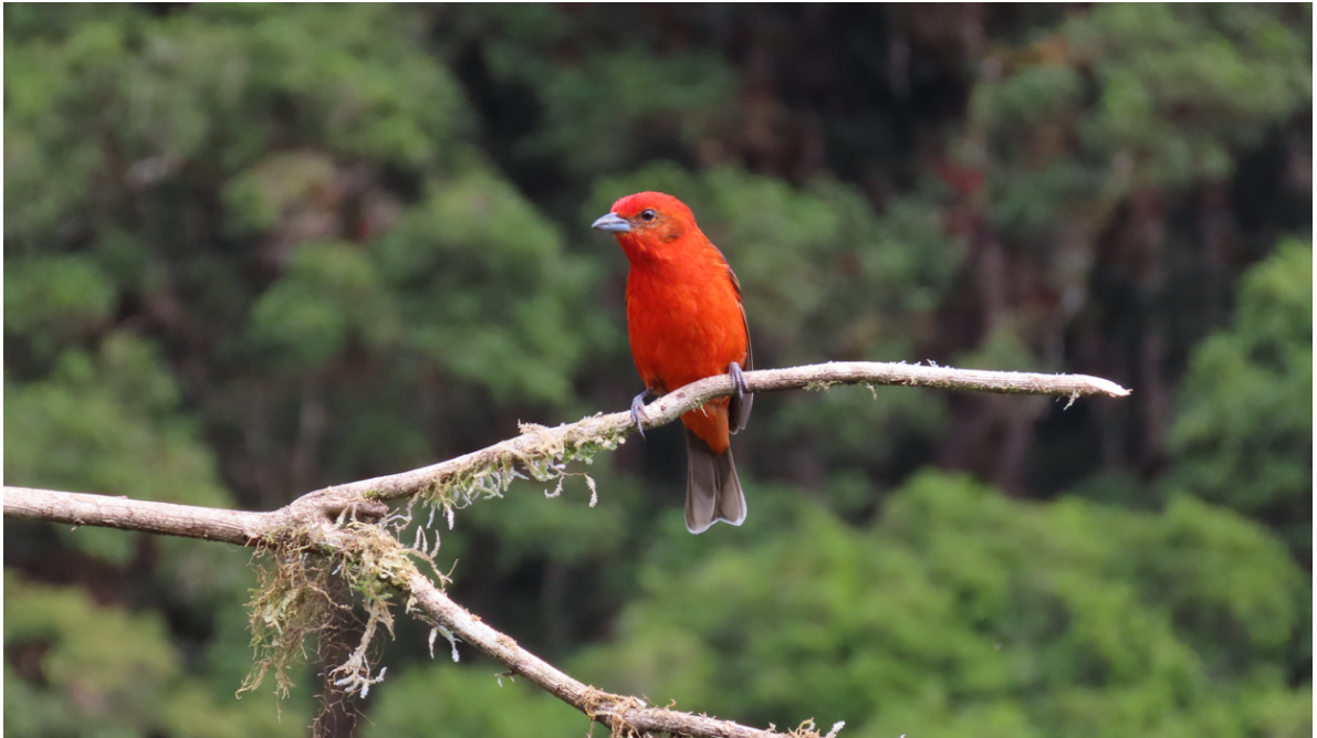
Flame-colored Tanager