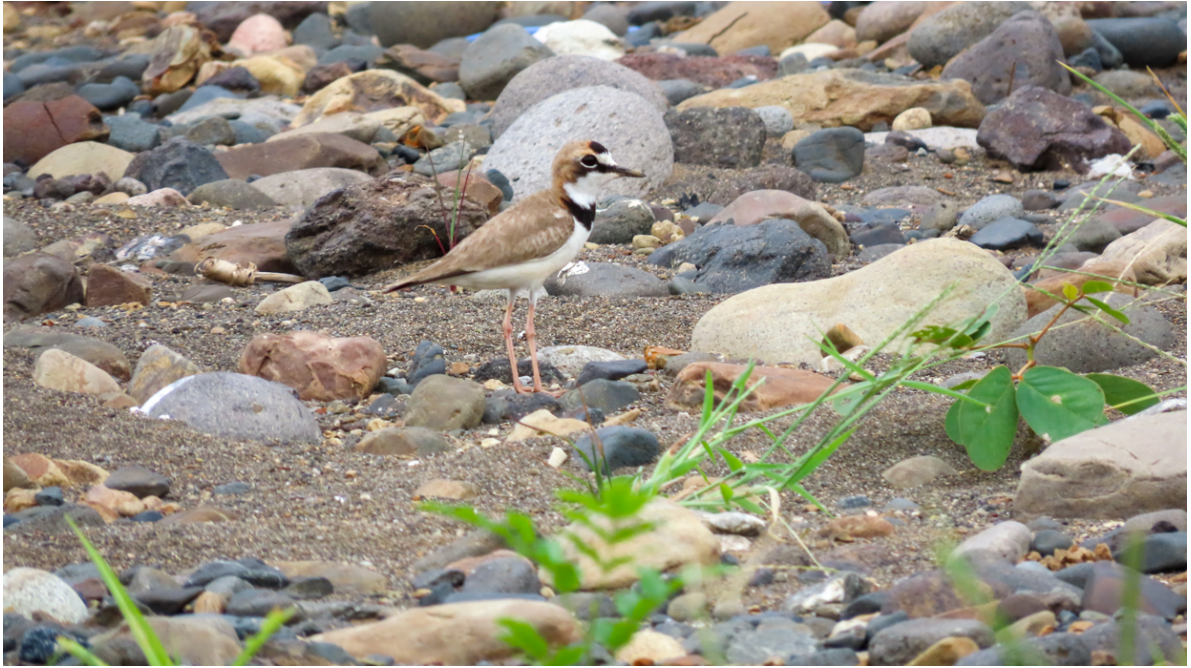
Collared Plover adult