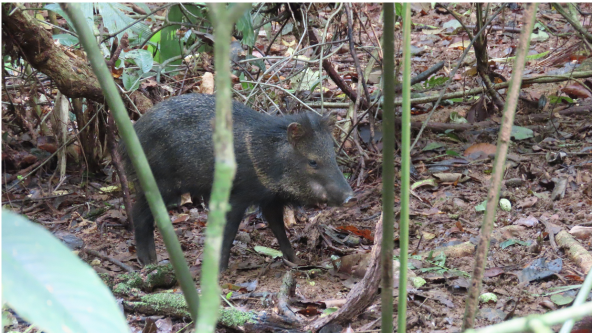
Collared Peccary © Ernesto Carman