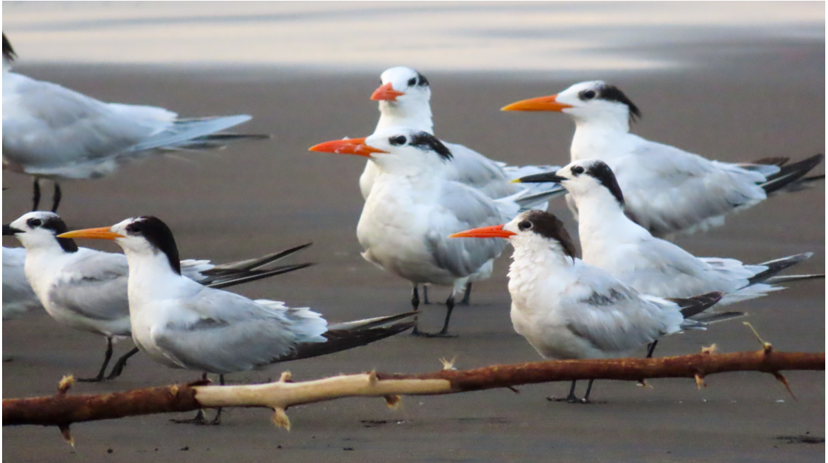
Royal, Sandwich and Elegant Terns