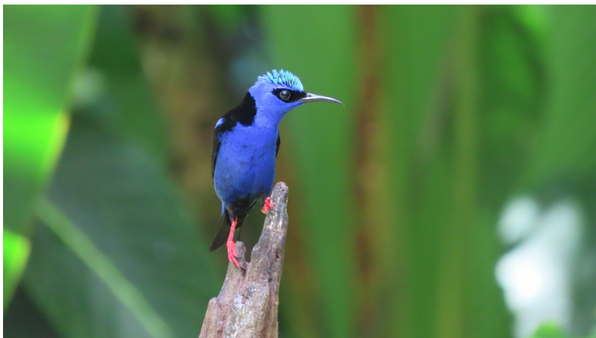
Red-legged Honeycreeper

We gathered at 6:00 a.m. at the main deck in front of the restaurant which faces the impressive Arenal Volcano and has a bird feeder at eye level, and the birds were already lining-up and showing their pecking order with Great Curasows, Crested Guans and Montezuma Oropendolas feeding first, then all the smaller species came in including dozens of Red-legged and Green Honeycreepers, Yellow-throated Euphonias, Golden-hooded, Emerald, Silver-throated and Hepatic Tanagers. We also saw Yellow-throated Toucans , Rufous-winged Tanager, Bananaquit, Olive-sided Flycatcher, Red-lored Amazon and White-crowned Parrot. After breakfast we birded the gardens and one the shorter trails behind the lodge and had nonstop birds! We started out with point-blank views of two male Black-crested Coquettes feeding a few meters from where we were standing. We also encountered a mixed species flock in the forest where we saw White-throated Shrike-Tanager, Rufous Mourner, Spotted Woodcreeper and Sulphur-rumped Flycatcher, as White-collared Manakins displayed, snapping loudly in the background. Fortunately for us there were several fruiting fig trees in the garden which provided incessant views and photo opportunities of tanagers and toucans.