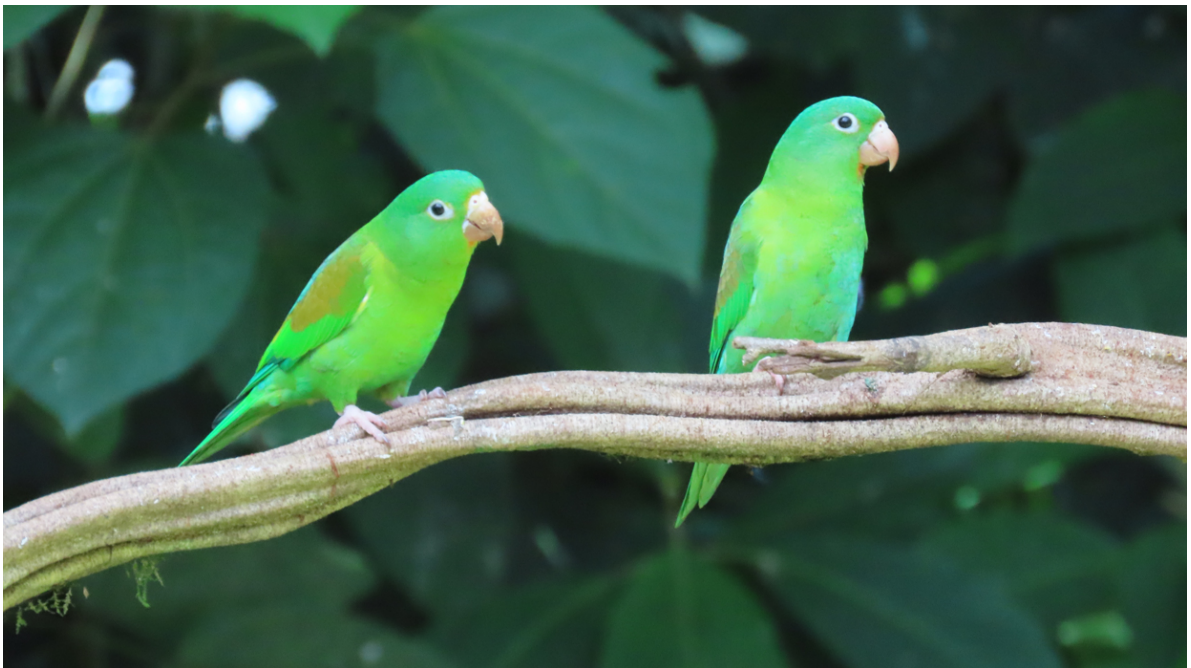
Orange-chinned Parakeets