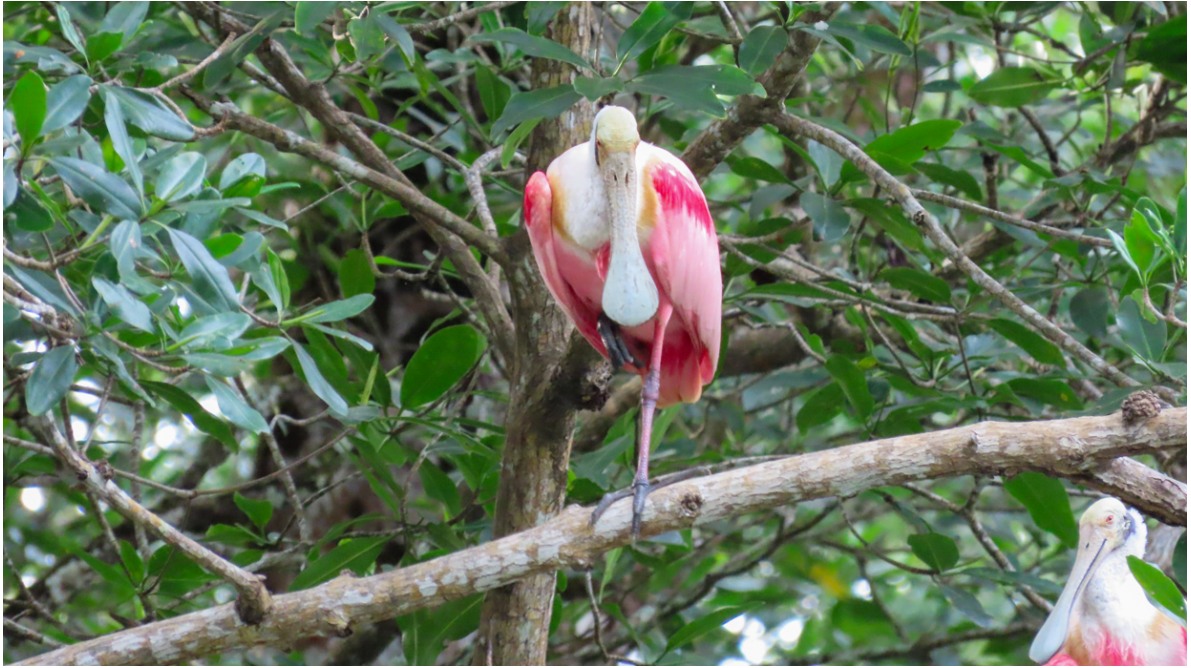
Roseate Spoonbill