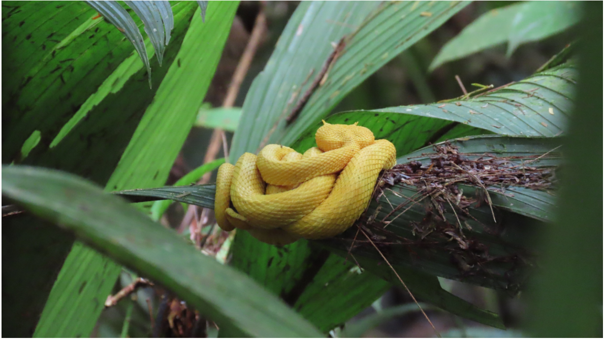
Golden Eyelash Pitviper © Ernesto Carman