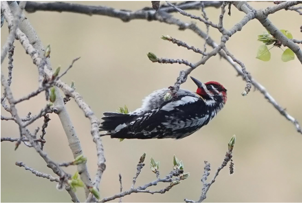
Red-naped Sapsucker

inner chickadee as it clung upside down to an aspen twig.