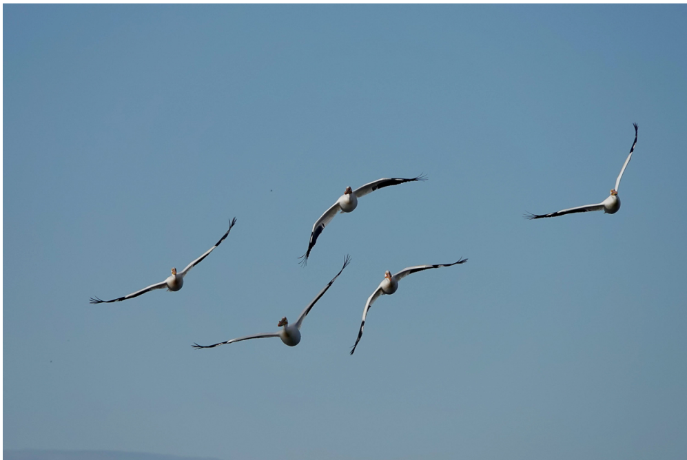
White Pelicans