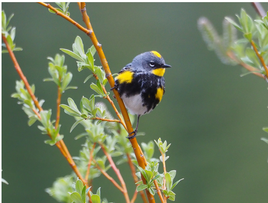
Yellow-rumped Warbler (Audubon subspecies)

Even this group's voracious appetite for birds was satiated at Frank Lake, a spectacular large lake and wetland complex just east of High River: guests simply did not know which way to look as the ecosystem gave a spectacular display of bird diversity and abundance, from the squadron of regal White Pelicans patrolling the airways, to rare views of a Sora Rail sharing its breakfast nook with a Yellow-headed Blackbird.