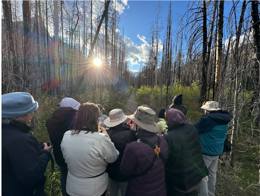
Birding in Waterton Lake burn