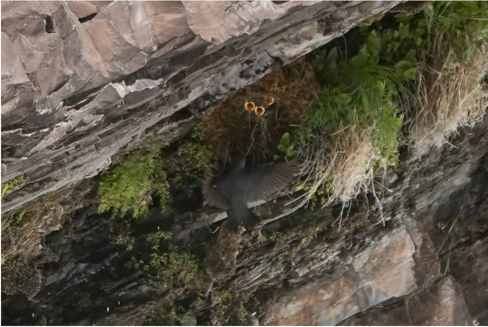
American Dipper feeding three nestlings

Canadian Rockies: Waterton Lakes Bird List (May 28 - Jun 2, 2024)