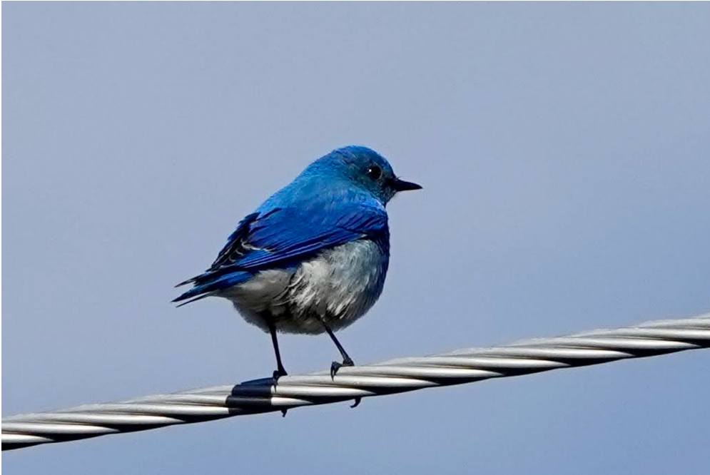
Mountain Bluebird

We were surprised and delighted to see an unprecedented swirl of no fewer than five turkey vultures circling overhead in Kananaskis Country, evidence of their recent range expansion. We viewed dazzling Harlequin Ducks most days, freshly returned from their migration - from the west, not the south, flying from the Pacific Ocean where they spend their winters.