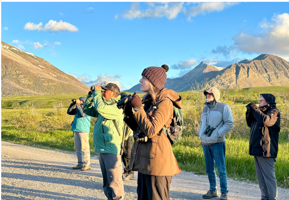
Dawn birding

Temperatures were lower than normal, and a late Spring meant that a few of the later-migrating birds had not yet arrived in the area - but it was still Spring, and the riot of birdsong and a full palate of resplendent colours had our guests leaning into the birding. This was a good natured and keen group, ranging in age from 29 to, well, older than 29: they all wanted to experience every birding opportunity, including the optional pre-breakfast birding and optional post-dinner birding.