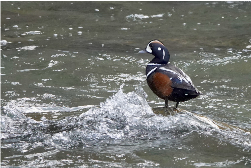
Harlequin Duck

We were surprised and delighted to see an unprecedented swirl of no fewer than five turkey vultures circling overhead in Kananaskis Country, evidence of their recent range expansion. We viewed dazzling Harlequin Ducks most days, freshly returned from their migration - from the west, not the south, flying from the Pacific Ocean where they spend their winters.