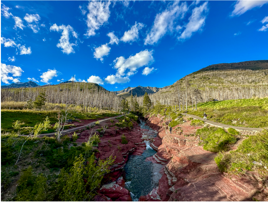
Red Rock Canyon

Mammals came out in full force: one guest was heard to murmur during our visit to Waterton Lakes National Park, paraphrasing a line from the Wizard of Oz: 'Bisons and Badgers and Bears, oh my!' Our numerous bear sightings included a foraging mother with 2 cubs of the year, who entertained us all with their playful boxing matches.