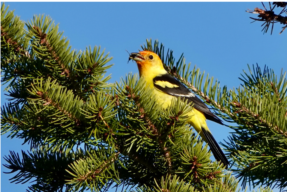
Western Tanager