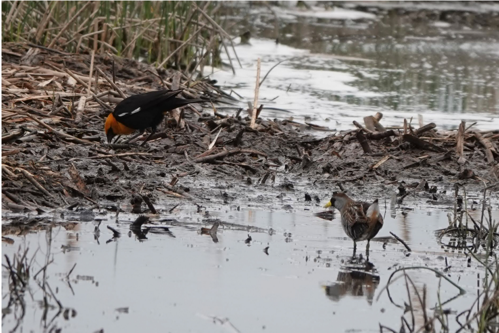
Sora Rail and Yellow-headed Blackbird

Even the driving did not disappoint, with Swainson's Hawk, Western Meadowlark, and Mountain Bluebirds (as blue as the Alberta sky!) swirling around us as we drove, like confetti at a wedding. One keen-eyed guest spotted a recently fledged Great Horned Owl by the roadside; and later we all got great looks at a regal adult through our guides' telescopes.