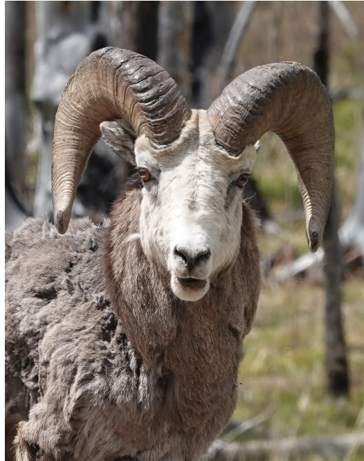
Bighorn Sheep

Temperatures were lower than normal, and a late Spring meant that a few of the later-migrating birds had not yet arrived in the area - but it was still Spring, and the riot of birdsong and a full palate of resplendent colours had our guests leaning into the birding. This was a good natured and keen group, ranging in age from 29 to, well, older than 29: they all wanted to experience every birding opportunity, including the optional pre-breakfast birding and optional post-dinner birding.