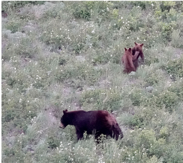
Black bear and cubs

Mammals came out in full force: one guest was heard to murmur during our visit to Waterton Lakes National Park, paraphrasing a line from the Wizard of Oz: 'Bisons and Badgers and Bears, oh my!' Our numerous bear sightings included a foraging mother with 2 cubs of the year, who entertained us all with their playful boxing matches.