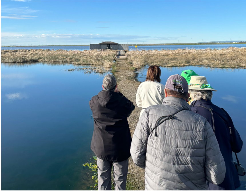
Blind at Frank Lake