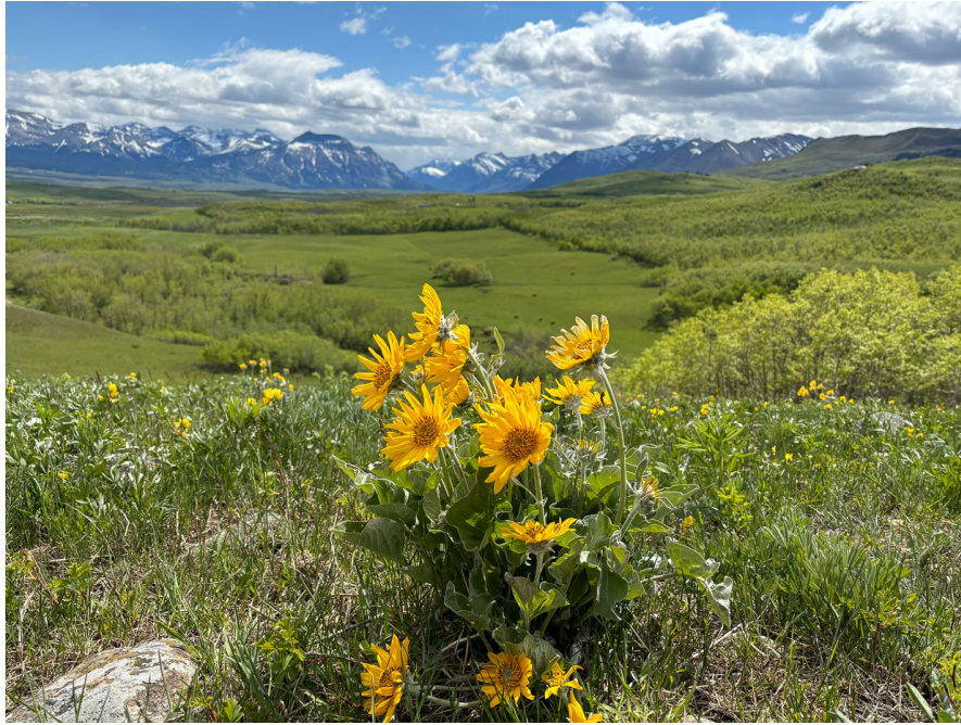
Waterton Lakes National Park