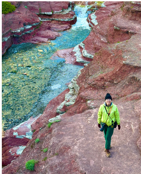
Red Rock Canyon, Waterton Lakes National Park