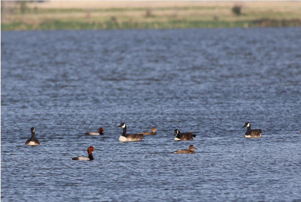
Redhead and Canada Geese

A bit of scoping in the distance produced several Western Grebes, a large group of American White Pelicans, and two Trumpeter Swans. No less than five Black-crowned Night-Herons flew over us, and we eventually had good looks at White-faced Ibis, Wilson's Phalarope, Willet, Marbled Godwit, American Avocet, and Black-necked Stilt. We also checked out a California Gull breeding colony that already had some recently hatched youngsters. With just shy of 50 species, Frank Lake never disappoints!