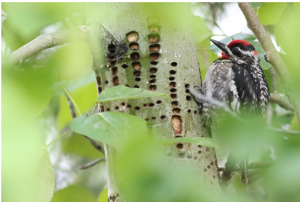
Red-naped Sapsucker © Yousif Attia