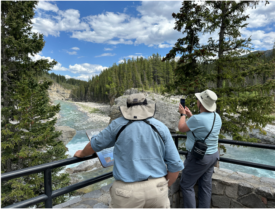
Birding at Elbow Falls