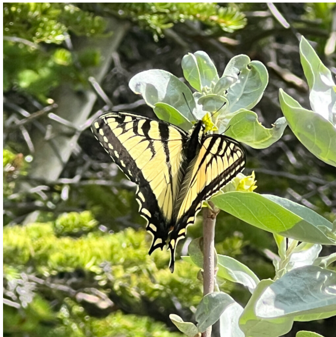
Swallow-tailed Butterfly

We rolled into Bragg Creek for an excellent supper. But our birding wasn't done yet. We drove the scenic foothills to Brown Lowery Provincial Park. This patch of transitional boreal to foothills forest is known to harbor a nice diversity of birds. A short stroll through the forest produced singing Varied