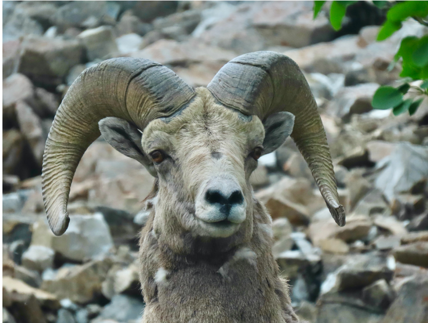
Bighorn Sheep

American Redstart was elusive but heard well and perhaps most notable was a cooperative Veery that perched out in the open for several minutes, allowing scope views! After a very scenic breakfast, we proceeded to Cameron Falls where another American Dipper was below the falls and we played hide-and-seek with a couple of cryptic MacGillivray's Warblers. We proceeded down the Akamina highway all the way to Cameron Lake at the end seeing our first Bighorn Sheep beside the road.