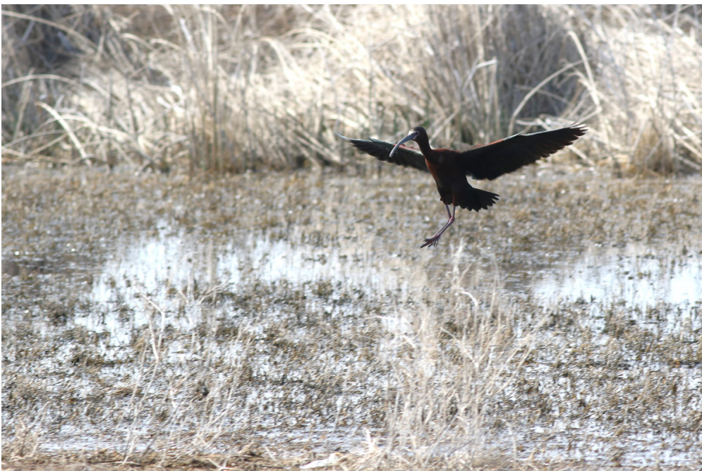
White-faced Ibis

A bit of scoping in the distance produced several Western Grebes, a large group of American White Pelicans, and two Trumpeter Swans. No less than five Black-crowned Night-Herons flew over us, and we eventually had good looks at White-faced Ibis, Wilson's Phalarope, Willet, Marbled Godwit, American Avocet, and Black-necked Stilt. We also checked out a California Gull breeding colony that already had some recently hatched youngsters. With just shy of 50 species, Frank Lake never disappoints!