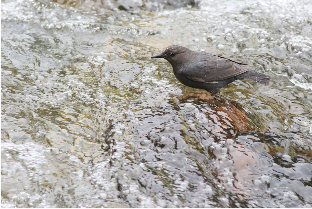
American Dipper

We left Waterton with pretty much everything we could have hoped to see. We had lunch in Pincher Creek, before heading up to Head-Smashed-In Buffalo Jump World Heritage Site. The focus here was to learn more about the Plains Bison, and their importance both ecologically and to the Indigenous Peoples that relied on them. The site itself did have some interesting birds including Brown Thrasher, Rock Wren, Spotted Towhee, and a family of Yellow-bellied Marmots. After ample time to learn about the cultural significance in the interpretive center, we hunkered down for our drive to Calgary. Drive-by birding kept our eyes peeled, and we even had a flyby Long-billed Curlew south of Claresholm. We pulled into Calgary with time to clean up before our final supper. It was a great chance to reflect on our action-packed adventure!