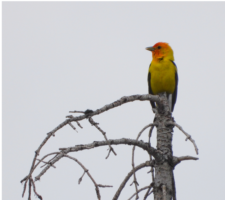
Western Tanager