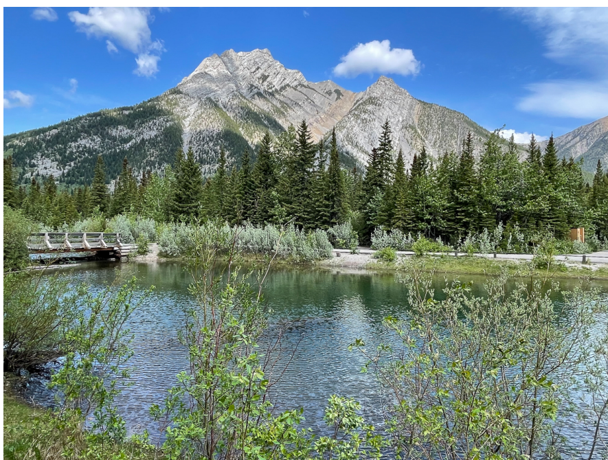
Mount Lorette Ponds

We eventually made it to Hwy 40, the Kananaskis Trail, and decided to make a quick stop at Barrier Lake. The scenery did not disappoint and we were able to watch the behavior of a large group of Cliff Swallows collecting mud at the shoreline. Just before we moved on, a very high flying Golden Eagle was spotted. Little did we know that this would be the first of 5 Golden Eagles we would encounter on the tour! It was time for lunch, so we settled into Mount Lorette Ponds for a picnic feast. Townsend's Warblers were singing from the spruce trees and a single White-winged Crossbill flew over. We don't always look up on our tours, and some keen eyed participants looking down found a patch of lovely Small Round-leaved Orchid ( Galearis rotundifolia ) among other flowers.