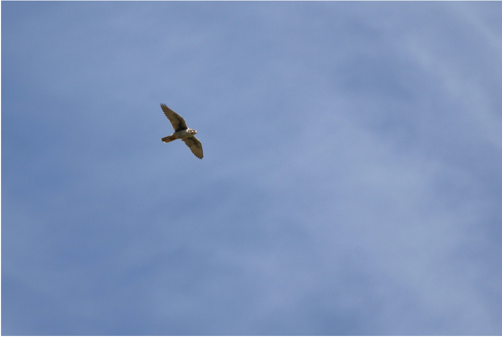
Prairie Falcon

The afternoon was spent mostly B-lining it to Waterton Lakes National Park. We did have time for one quick birding stop, and it would turn out to be a memorable one. We pulled up to the Bear's Hump trailhead, and started up the first few hundred meters. Recent reports of a pair of Lewis's Woodpecker was just too good to pass up. We weren't sure if we would be successful due to the late time in the afternoon but tried just the same. Sure enough, we eventually spotted one, then two Lewis's Woodpeckers! It was indeed a pair, and we were treated to some incredible interactions as the pair proceeded to copulate on a branch beside their nest tree! Not long after, a male Pileated Woodpecker, minding his own business came too close to the nest tree and was escorted away by the Lewis's! We were in awe of our good fortune to observe this very rare breeding species at such close range and backdropped by the incredible scenery of Waterton. All of a sudden, a MacGillivray's Warbler popped up, followed by a Lazuli Bunting! We proceeded to check into our hotel in town, and met for supper to reflect on a truly incredible day of birding!