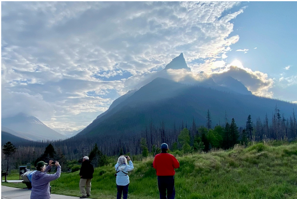
Waterton scenery