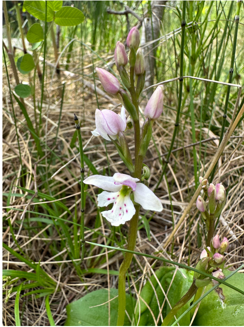
Small Round-leaved Orchid

After lunch we made a few strategic stops along the Kananaskis River and had our first prolonged looks at the spritely Rufous Hummingbird. A brief exploration down a path turned up a wonderful surprise: a female American Three-toed Woodpecker! We had incredibly close views as we watched her forage by flaking away bark on the conifers. A short drive later to a southern access point of K-Country, and we were enjoying the antics of a pair of American Dippers at their nest at Elbow Falls. The weather was warming up and butterflies kept us occupied too! We spent a bit more time trying ever so hard to turn up a Harlequin Duck, but the uncharacteristically low water levels meant the Harleys were elsewhere.