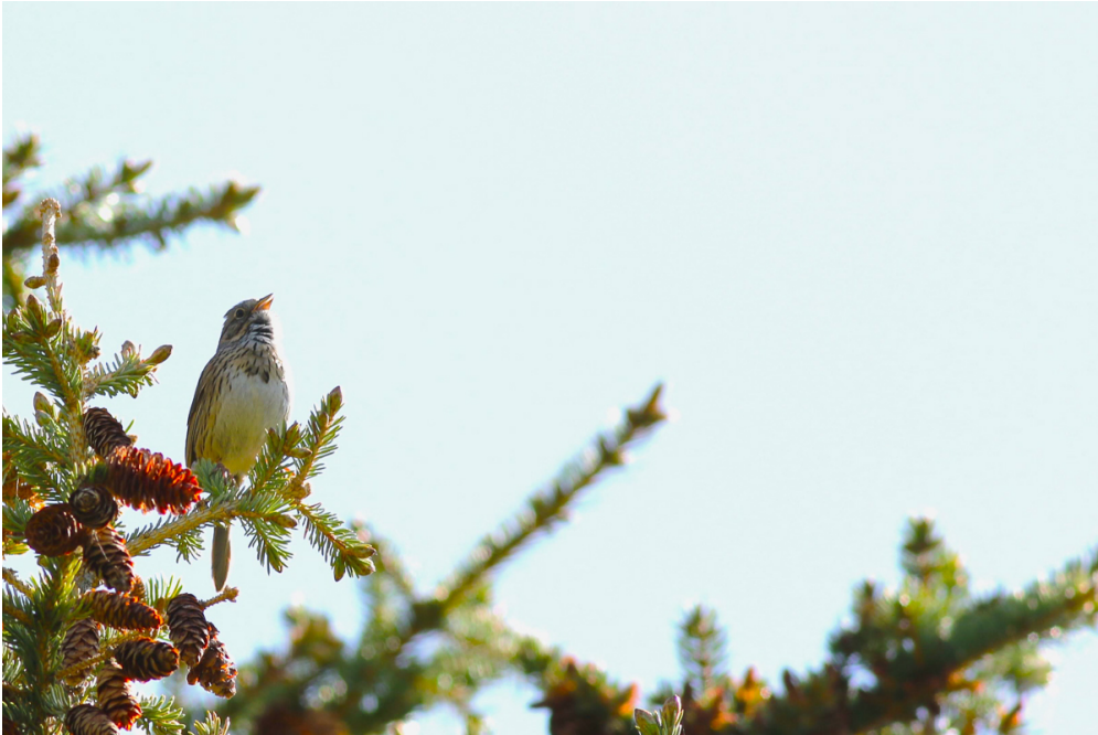
Lincoln's Sparrow

We eventually made it to Hwy 40, the Kananaskis Trail, and decided to make a quick stop at Barrier Lake. The scenery did not disappoint and we were able to watch the behavior of a large group of Cliff Swallows collecting mud at the shoreline. Just before we moved on, a very high flying Golden Eagle was spotted. Little did we know that this would be the first of 5 Golden Eagles we would encounter on the tour! It was time for lunch, so we settled into Mount Lorette Ponds for a picnic feast. Townsend's Warblers were singing from the spruce trees and a single White-winged Crossbill flew over. We don't always look up on our tours, and some keen eyed participants looking down found a patch of lovely Small Round-leaved Orchid ( Galearis rotundifolia ) among other flowers.