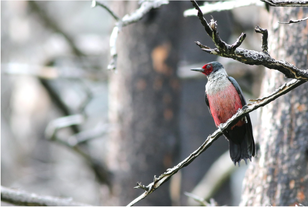
Lewis's Woodpecker