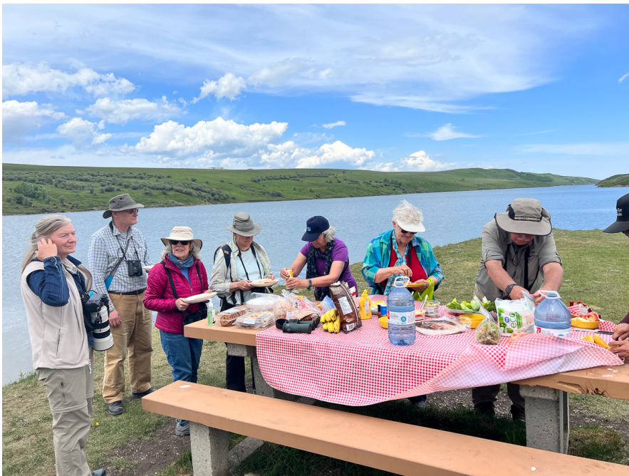
Picnic lunch