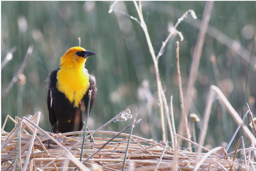
Yellow-headed Blackbird

Thrush, Evening Grosbeak, Mountain Chickadee and Pacific Wren. On our walk out however, a mysterious large bird flew silently through the woods and perched directly in line with a tree trunk. It was a Great Gray Owl! Unfortunately, the bird did not sit very long and soon after slipped through the woods as silently as it appeared. It's not everyday that you come across a Great Gray Owl on foot! We pressed on to High river for the night. Day 3: Frank Lake and Waterton Lakes National Park Part of what makes southern Alberta unique, is the abrupt transitions of landscapes. Frank Lake, on the doorstep of the Rockies, is one of the most important places for birds in Alberta. Dedicated as a BirdLife International Important Bird Area, and Key Biodiversity Area. We departed High River and within minutes were immersed in a prairie wetland birding bonanza. Yellow-headed Blackbirds were seemingly oblivious to our presence as they disputed over territories surrounding the blind. The blind itself gave us an immersive experience where we watched Eared Grebes, Ruddy Ducks, Redheads, and so much more at close range.