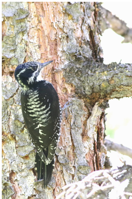
American Three-toed Woodpecker © Yousif Attia

After lunch we made a few strategic stops along the Kananaskis River and had our first prolonged looks at the spritely Rufous Hummingbird. A brief exploration down a path turned up a wonderful surprise: a female American Three-toed Woodpecker! We had incredibly close views as we watched her forage by flaking away bark on the conifers. A short drive later to a southern access point of K-Country, and we were enjoying the antics of a pair of American Dippers at their nest at Elbow Falls. The weather was warming up and butterflies kept us occupied too! We spent a bit more time trying ever so hard to turn up a Harlequin Duck, but the uncharacteristically low water levels meant the Harleys were elsewhere.