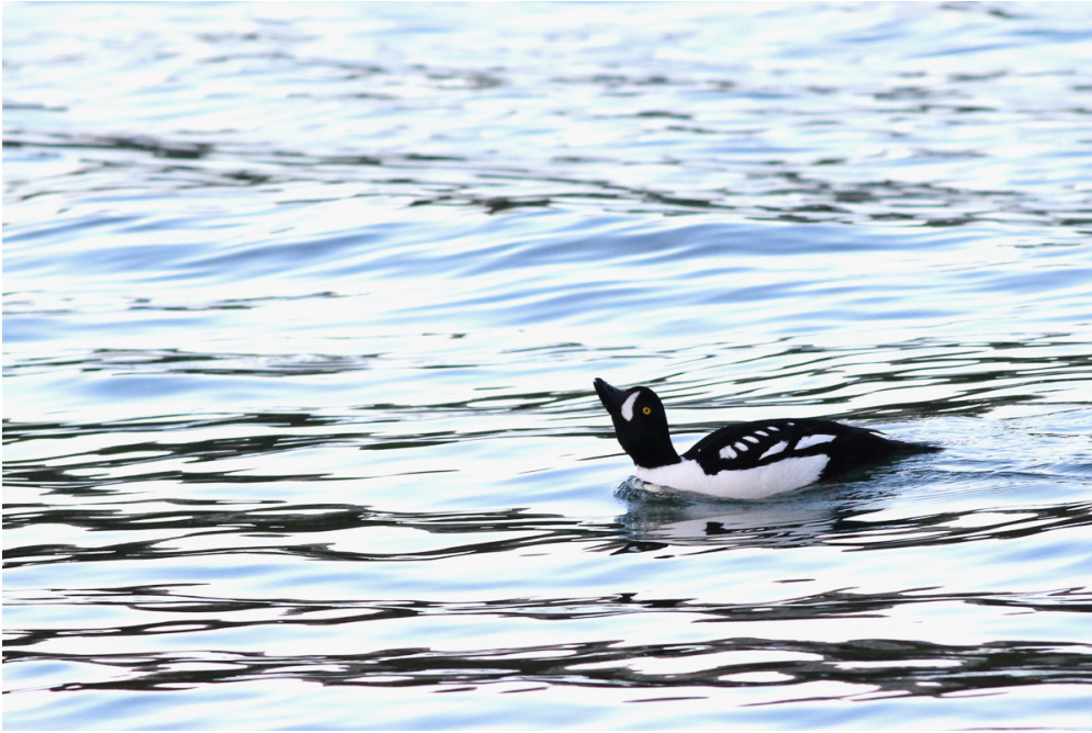
Barrow's Goldeneye

We found a great spot for our picnic lunch halfway down the parkway. After Lunch, we drove back to town and had some free time to explore before supper. Waterton is known for its mammal life, but driving around in the early mornings and evenings can increase your chances of encountering them. We did just that and drove the Red Rock Parkway to Red Rock Canyon and back. The scenery in the evening light was breathtaking. Lazuli Buntings were singing along much of the stretch and a Western Kingbird was another nice addition. A short boo around Red Rock Canyon produced Hairy Woodpecker, and a few Red-naped Sapsuckers visiting a well right beside the trail! On the drive back we were rewarded with a lovely cinnamon coloured Black Bear, and the second vehicle had a Dusky Grouse fly right across the road! What a day!