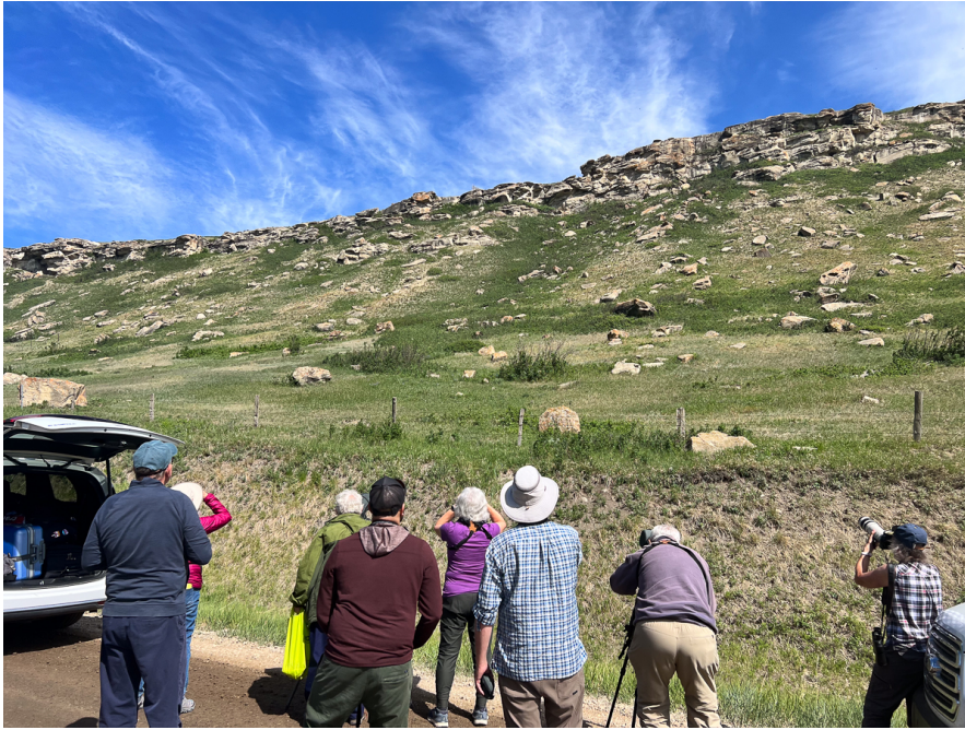
Birding Williams Coulee