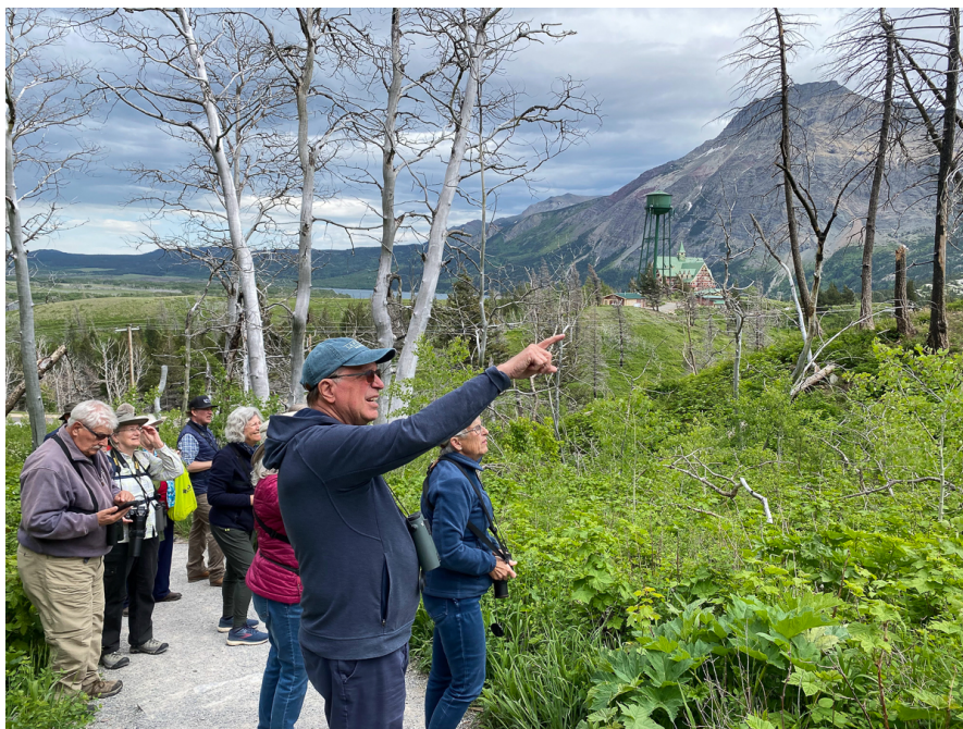
Birding in Waterton National Park

Day 4: Waterton Lakes National Park To maximize our time in Waterton, most of the group went out for some pre-breakfast birding at Haybarn/Dardanelles. We were rewarded with several new species and the woods were teeming with bird song. Several Black-headed Grosbeaks were singing and offered views, as did a few cooperative territorial Calliope Hummingbirds. Ruffed Grouse drummed in the woods and a very clean Red-naped Sapsucker popped into view. Our first