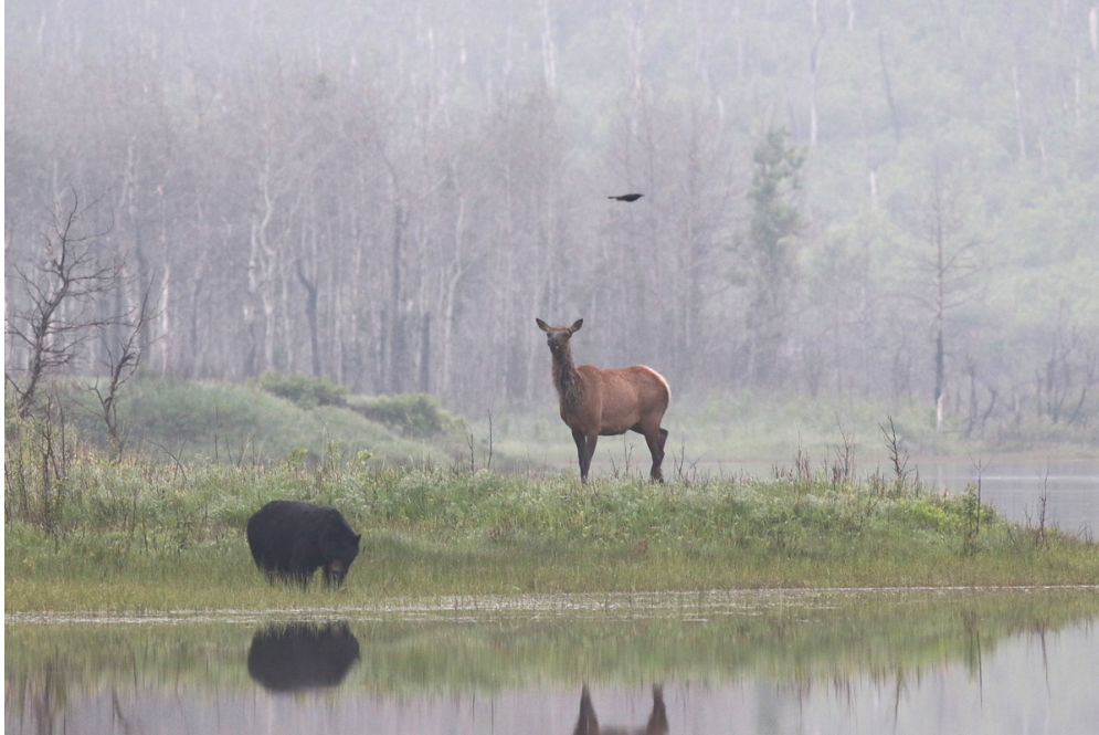
Black Bear and Wapiti (and Common Grackle)

Day 5: Head-Smashed-In Buffalo Jump, return to Calgary We opted for another early morning excursion before breakfast, this time to Maskinonge Marsh. It was another calm morning and the birding was exceptional! We heard a distant American Bittern, Pied-billed Grebe, and Common Loon while Black Terns circled over the wetland. Probably most memorable however was an interaction between a cow Wapiti (Elk), and a large Black Bear. Across the lake, we first spotted the two having a bit of a standoff, and that was followed by grunts and huffs from the Wapiti.