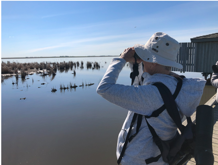
Birder at Frank Lake

We started our adventure into one of the most stunning regions of the continent, by visiting the Frank Lake Important Bird and Biodiversity Area south of Calgary. This site is one of the best birding locations in the province and our group was spoiled with amazing views of White-faced Ibis, Western Grebes doing their courtship dances along the water, Eared Grebes so close you could almost reach out and touch them, American Avocets displaying, and even a few bonus Sabine's Gulls roosting out on the lake before resuming their long journey from the Salish Sea to the high arctic. Reluctantly, we had to tear ourselves away from this epic location so that we could round up our other targets for the day.