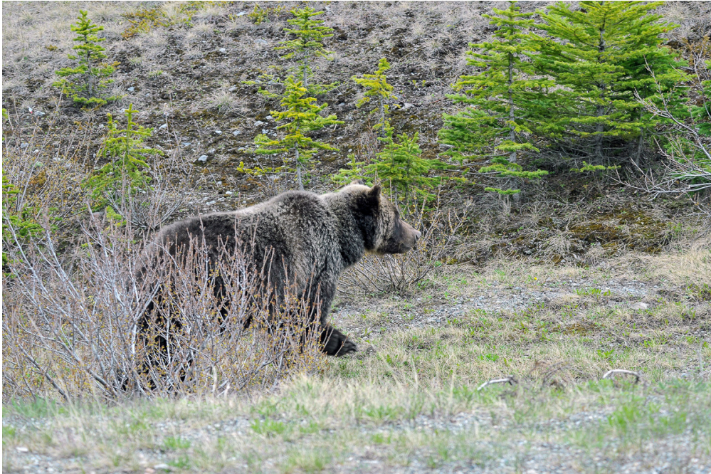
Grizzly Bear

Today we were up early and ready to explore the excellent mountain birds of Banff National Park. One of my favourite birding locations adjacent to town is the Cave and Basin Hot Springs wetlands. Here we had tremendous views of Rufous Hummingbirds, MacGillvray's Warbler and Lincoln's Sparrow.