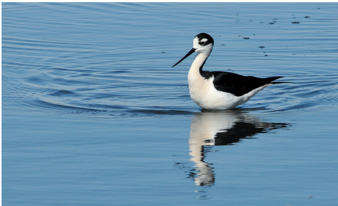
Black-necked Stilt © Donna Sheppard

Our next birding locations were in the foothills of the Canadian Rockies. This surprisingly species rich region is home to several boreal species, and the open rural landscape can be an excellent area to find Mountain Bluebirds and Bobolinks - a very localized rarity here in Alberta. We found both of these fairly easily on our drive up to Brown Lowry Provincial Park.