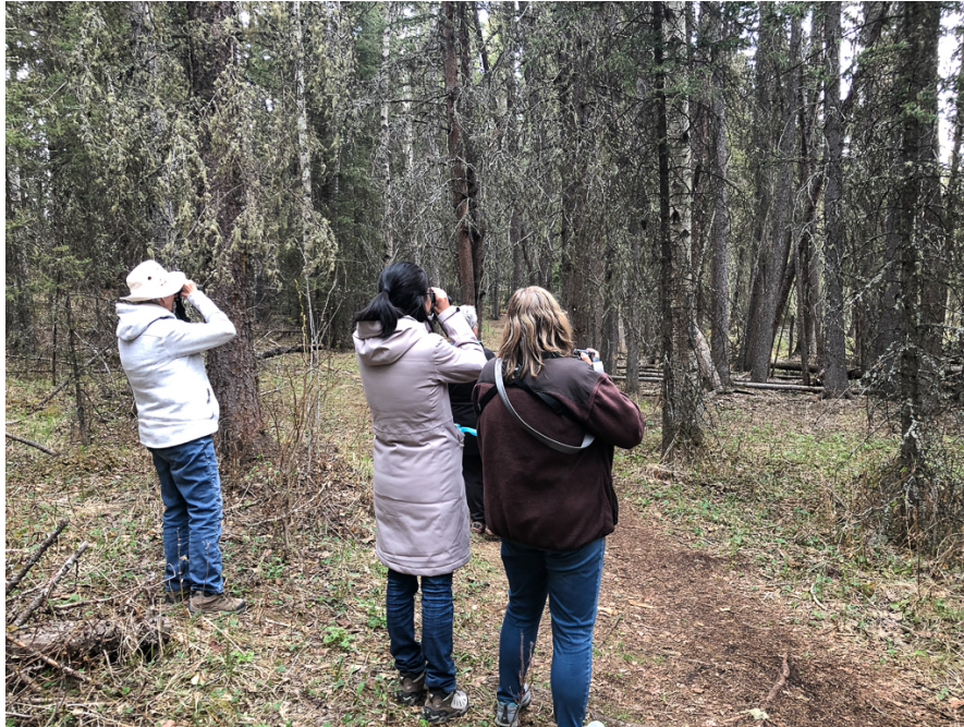
Watching American Three-toed Woodpeckers at Brown Lowry Park

After a wonderful picnic lunch we spent a couple hours exploring the trails through this southern extension of the boreal forest. We managed to find a pair of American Three-toed Woodpeckers, Western Tanager, Tennessee Warbler and even a surprise Varied Thrush! From here we travelled to Elbow Falls where we secured mind numbing views of American Dippers (always a highlight for everyone - including the guide) and our first of many Harlequin Ducks.