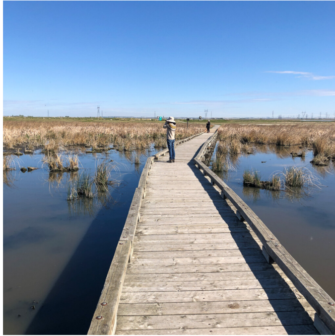
Frank Lake Boardwalk