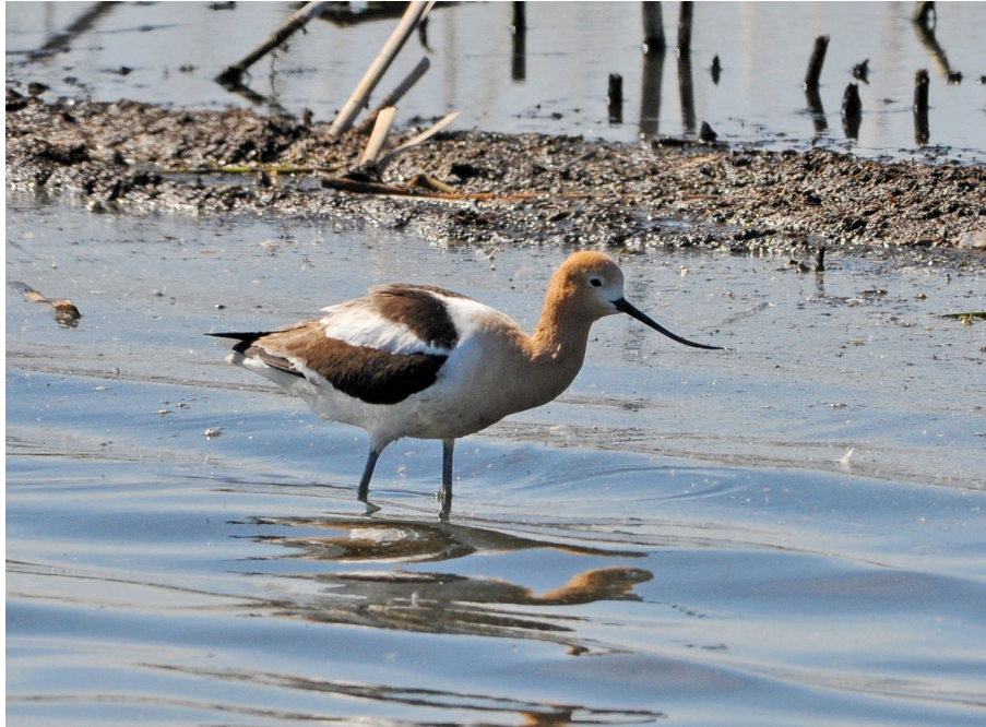
American Avocet