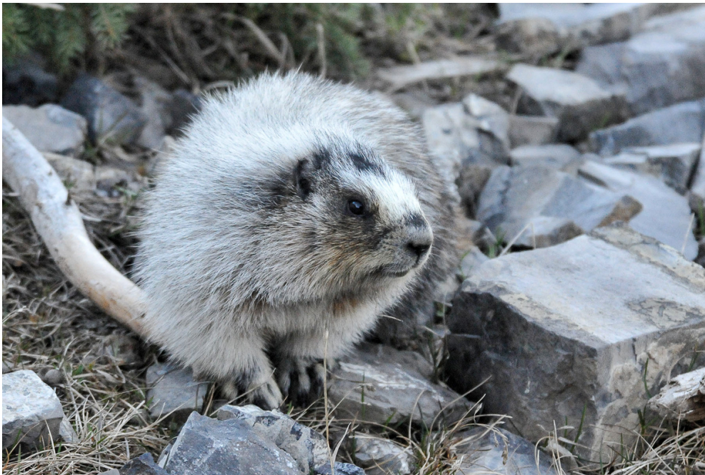
Hoary Marmot

Our final day in this beautiful place started off with an early morning visit to the Vermillion Lakes. Here we found Northern Waterthrush, Willow Flycatcher and nesting Common Loons. From here we made our way to the Sulphur Mountain Gondola where we enjoyed incredible views with sunny clear conditions and very few people. Greeting us up at the summit were Hoary Marmots, Townsend's Solitaires, Clark's Nutcracker and even a couple distant Pine Grosbeaks.