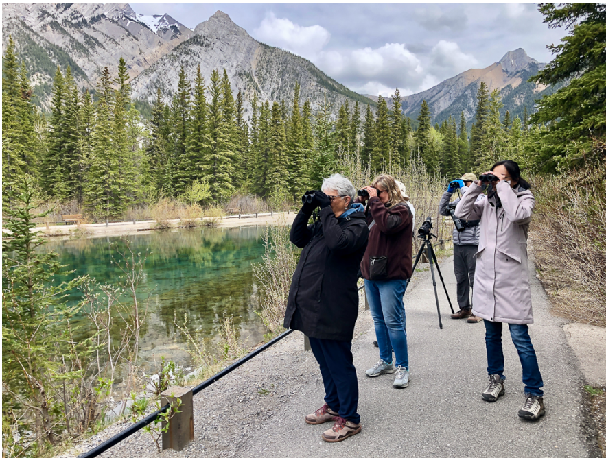
Birders Mount Lorette Ponds, Kananaskis

Our final hours of the tour were spent visiting Lake Minnewanka and having some very close encounters with some beautiful Elk. And as is tradition on this tour, we stopped at the famous MacKay's Ice Cream shop in Cochrane on the way back to Calgary.