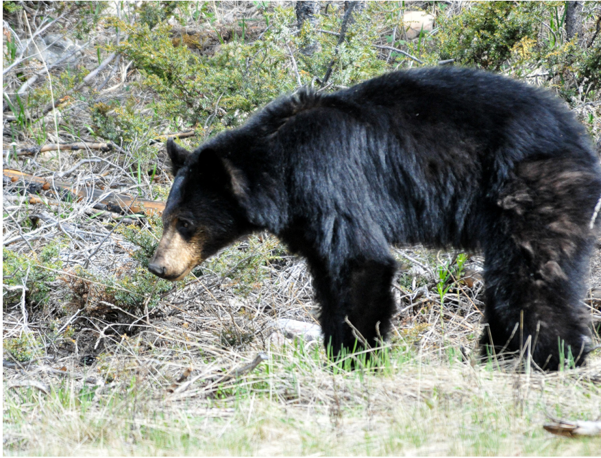
Black Bear

Our final day in this beautiful place started off with an early morning visit to the Vermillion Lakes. Here we found Northern Waterthrush, Willow Flycatcher and nesting Common Loons. From here we made our way to the Sulphur Mountain Gondola where we enjoyed incredible views with sunny clear conditions and very few people. Greeting us up at the summit were Hoary Marmots, Townsend's Solitaires, Clark's Nutcracker and even a couple distant Pine Grosbeaks.