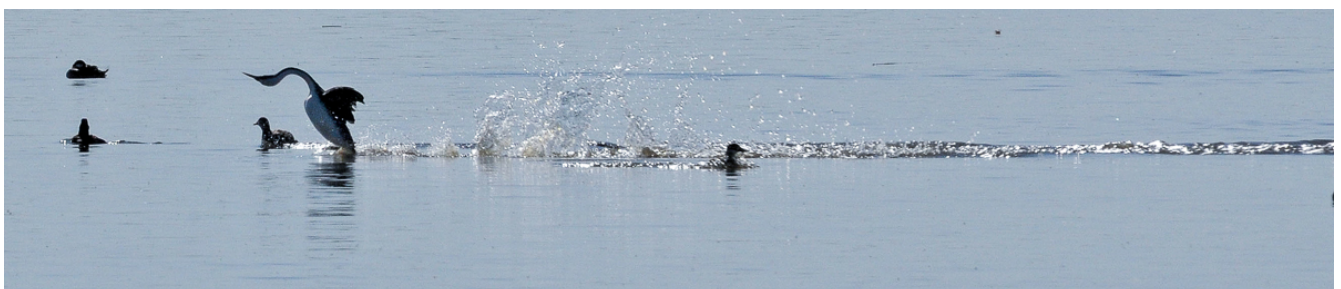
Western Grebe display

Our group enjoyed excellent weather and absolutely first-rate birds on the 2022 Eagle-eye Tours trip to Kananaskis and Banff. In addition to the stunning mountain scenery we managed to track down all of our target bird species including American Dipper, several Harlequin Ducks, Clark's Nutcracker, Rufous Hummingbird, along with close views of Pacific-slope Flycatcher, Pacific Wren and American Three-toed Woodpecker. Distant Sabine's Gulls at Frank Lake were a nice surprise and the courtship displays of Western Grebes was an experience that we all won't soon forget.