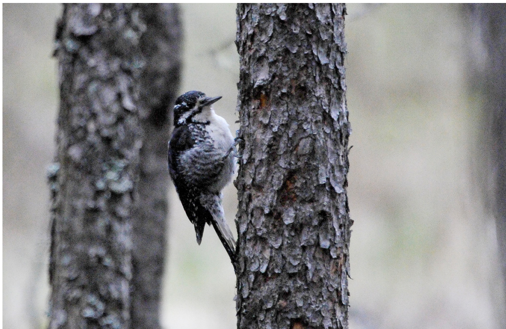
Three-toed Woodpecker © Donna Sheppard