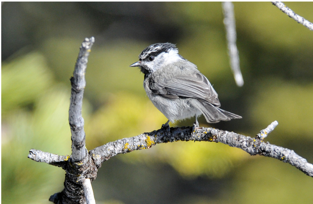
Mountain Chickadee