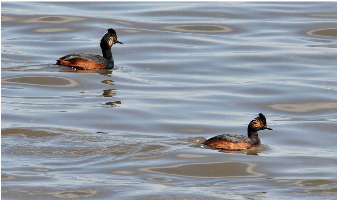
Eared Grebes © Donna Sheppard