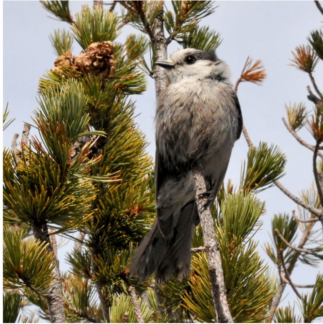
Canada Jay