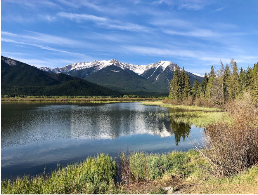
Vermillion Lakes, Banff