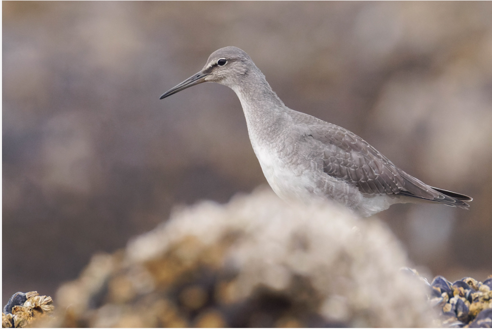
Wandering Tattler © Blair Dudeck