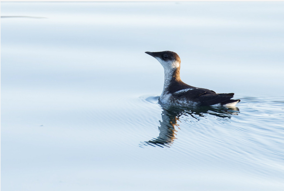
Marbled Murrelet