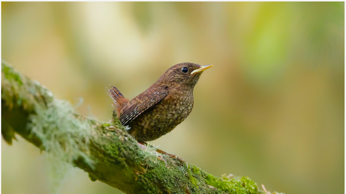
Pacific Wren