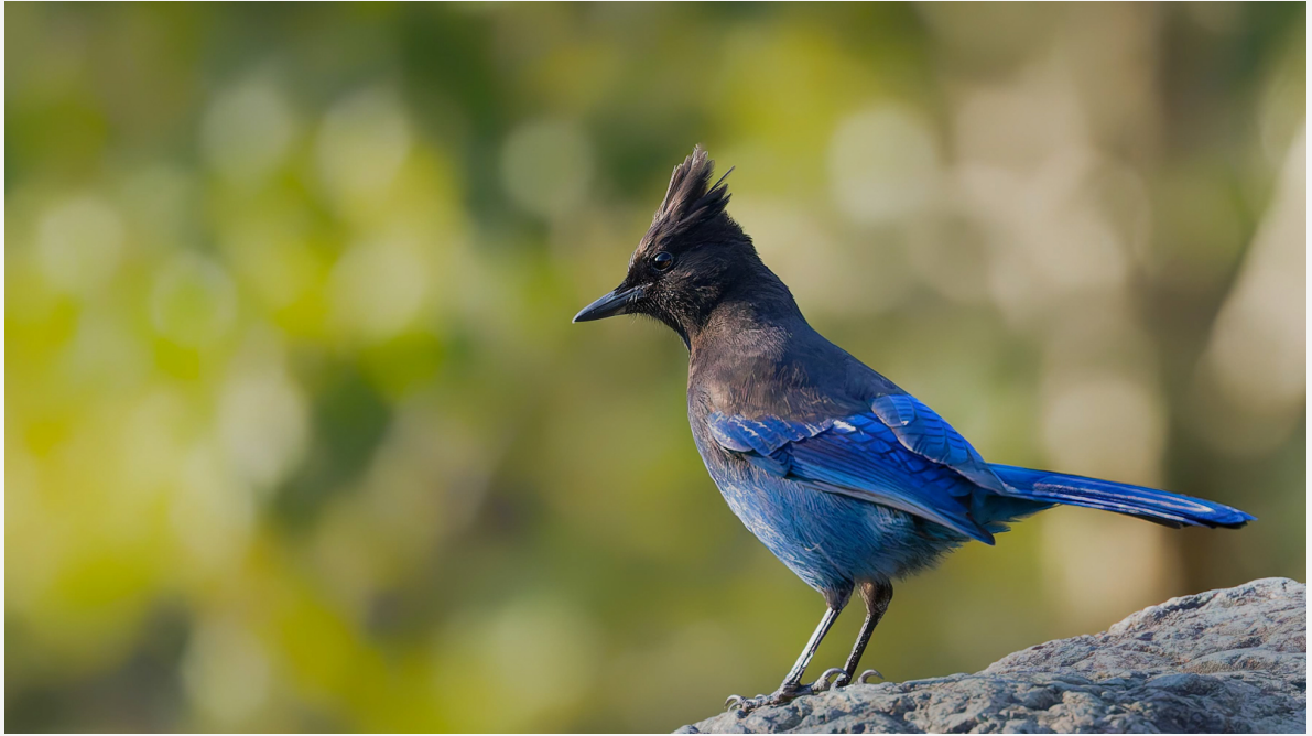
Steller's Jay

Our next stop was the Englishman River Estuary for lunch and some ocean birding. We observed a Western Grebe floating offshore, and during our coastal exploration, we noted flocks of Western Sandpipers. On our ferry ride back to Vancouver, we spotted Short-billed Gulls, Black Turnstones, and several Humpback Whales. We concluded the day with a final group meal at Horseshoe Bay before returning to our hotel.