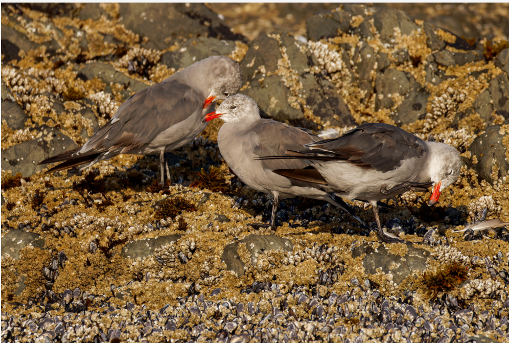
Heerman's Gull