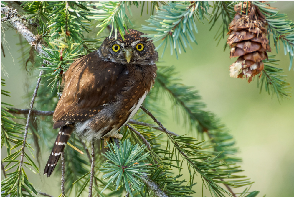
Northern Pygmy-Owl