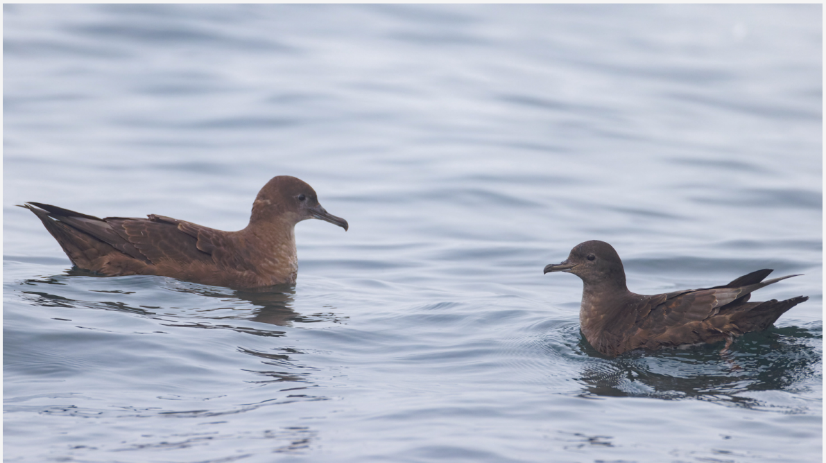
Sooty and Short-tailed Shearwaters