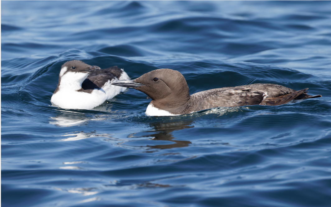
Common Murre