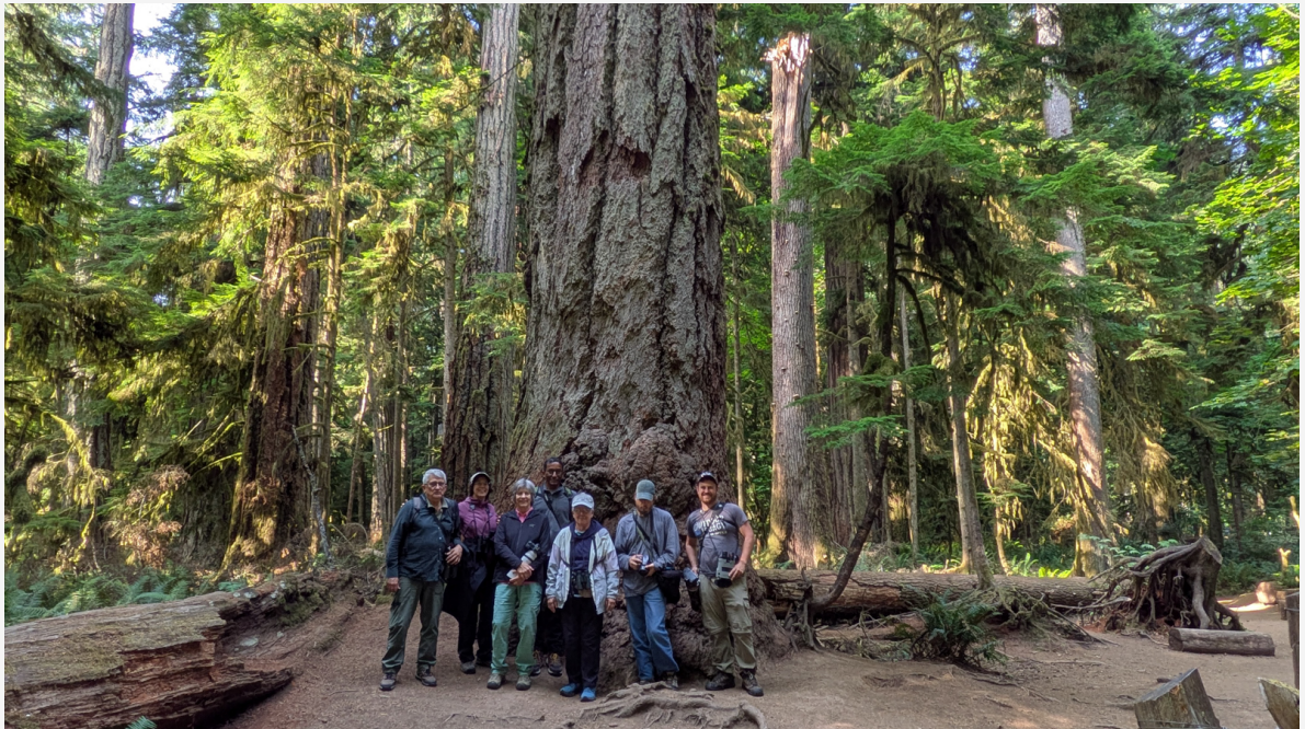
Our group

Our next stop was the Englishman River Estuary for lunch and some ocean birding. We observed a Western Grebe floating offshore, and during our coastal exploration, we noted flocks of Western Sandpipers. On our ferry ride back to Vancouver, we spotted Short-billed Gulls, Black Turnstones, and several Humpback Whales. We concluded the day with a final group meal at Horseshoe Bay before returning to our hotel.