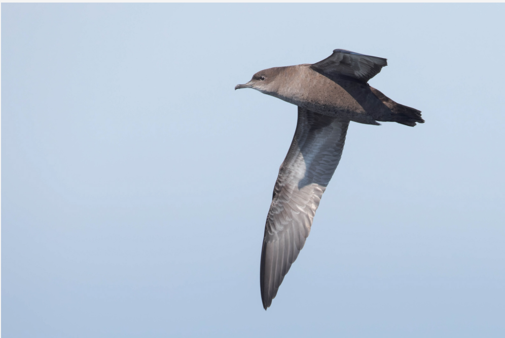
Short-tailed Shearwater in flight