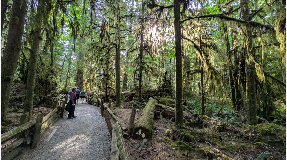
Cathedral Grove

species including Anna's Hummingbird, Oregon Dark-eyed Junco, Hutton's Vireo, and a very cooperative Northern Pygmy-Owl.