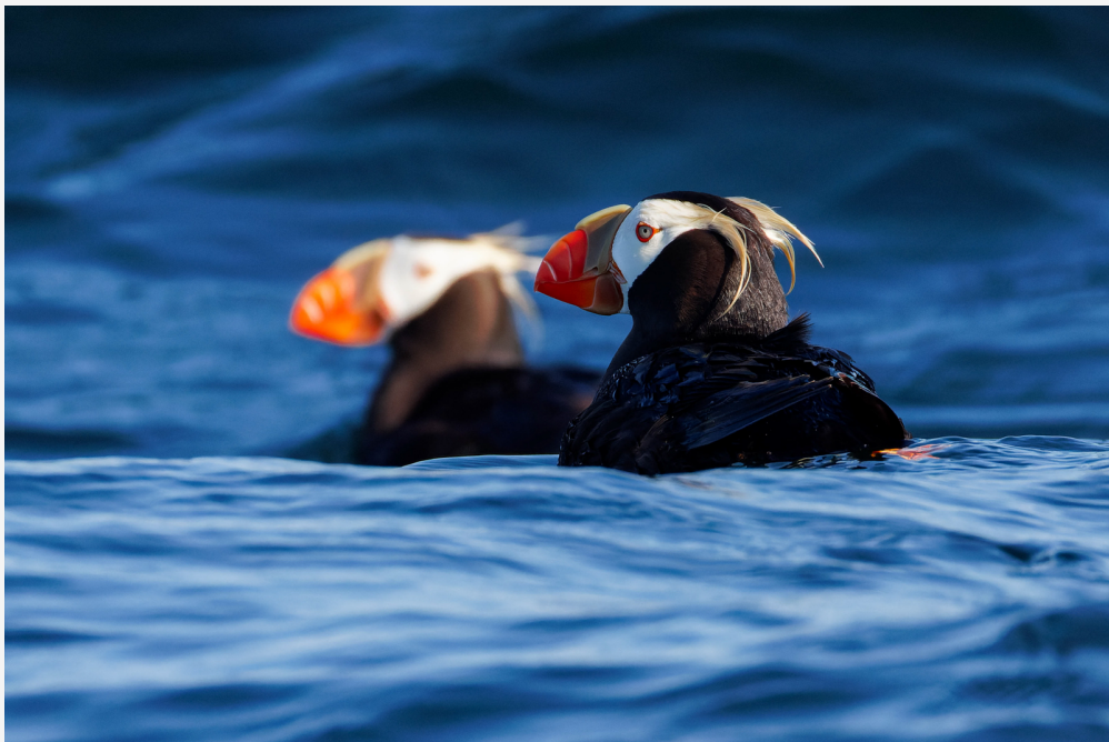
Tufted Puffin