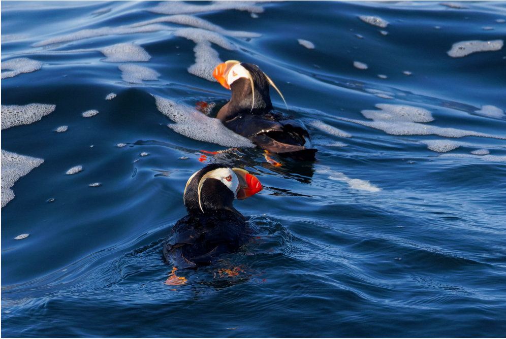
Tufted Puffin