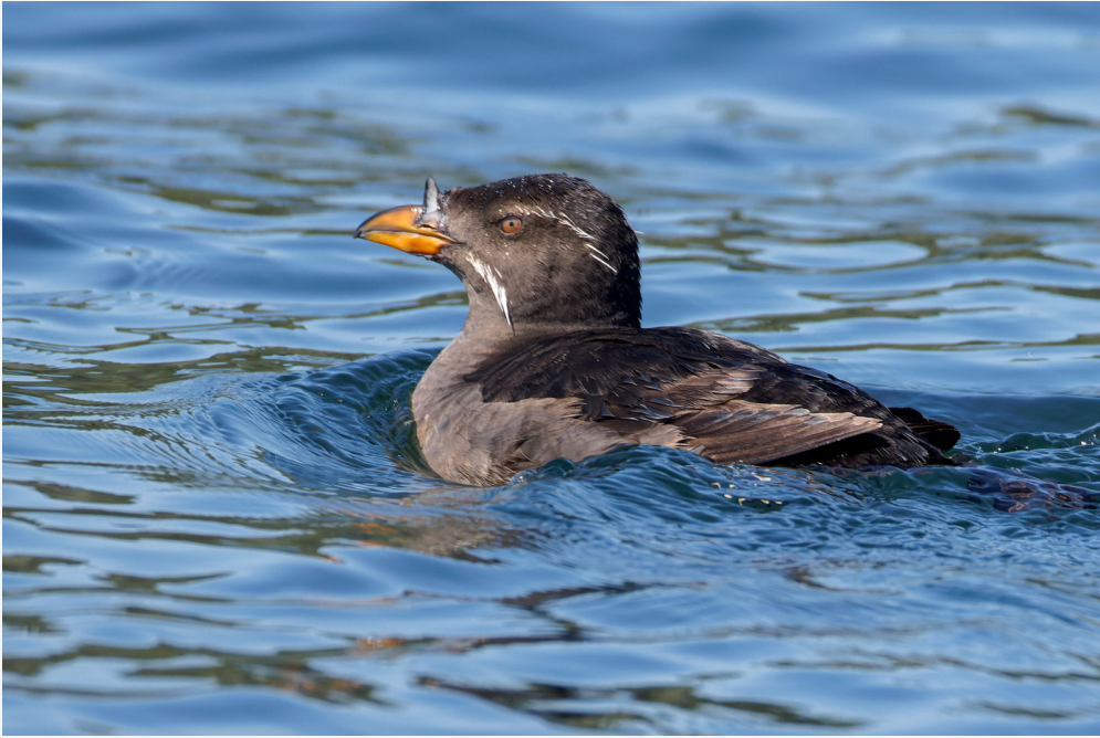
Rhinoceros Auklet