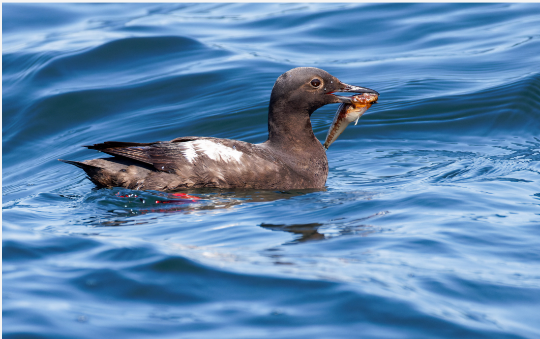
Pigeon Guillemot

Though the weather prevented us from reaching the continental shelf, we managed to see Pink-footed Shearwaters and a Northern Fulmar about halfway out. Returning to Cleland Island, the bird life continued to impress with large flocks of murres and auklets. The highlight came when a juvenile Horned Puffin was spotted among the murres—a rare BC visitor and a challenging species to observe in Canada. We spent over ten minutes watching this plump bird diving and surfacing,