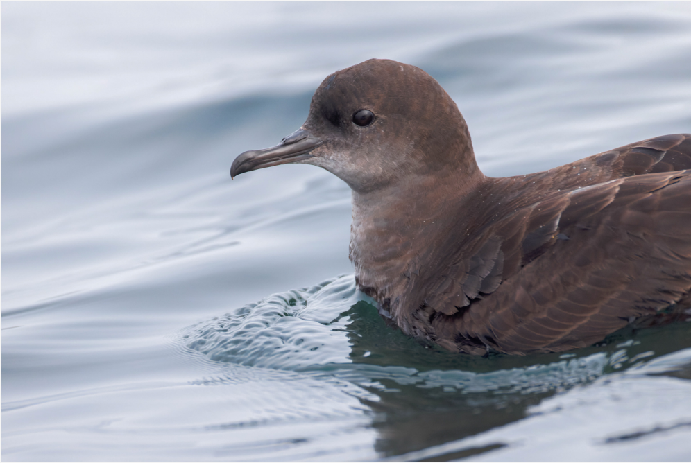
Short-tailed Shearwater