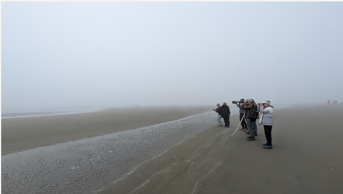
Birding in the fog in Tofino

Our second full day on Vancouver Island involved exploring the area between Ucluelet and Tofino. Foggy conditions made birding challenging but added to the adventure as we explored the park's stunning old-growth forests. At Amphitrite Lighthouse, we observed Stellar's Jays and Orange-crowned Warblers. Before lunch, we added Semipalmated Plover, Fox Sparrow, Pacific Wren, Red Crossbill, and Brown Creeper to our list. During lunch in Tofino, we were delighted by an adult Western Gull perched nearby on a roof. The afternoon included a walk around Ucluelet Harbour and the gardens downtown, where we spotted several Rufous Hummingbirds.