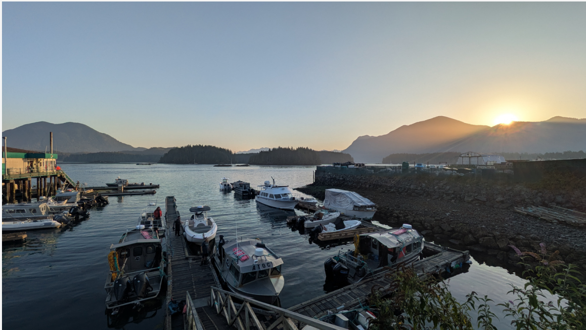
Tofino Harbour

We departed from Tofino Harbour toward Cleland Island, one of the last points of land on the west coast before the open ocean. The island is home to several pairs of Tufted Puffins, which we observed on the water for several minutes. The waters surrounding Cleland Island teemed with seabirds, including numerous Common Murres and Rhinoceros Auklets. An unexpected influx of Short-tailed Shearwaters—typically pelagic—allowed a close comparison with the more numerous Sooty Shearwaters. We also spotted several Wandering Tattlers on rocky islets; these elegant shorebirds are hard to see on the mainland, so this was a special opportunity.