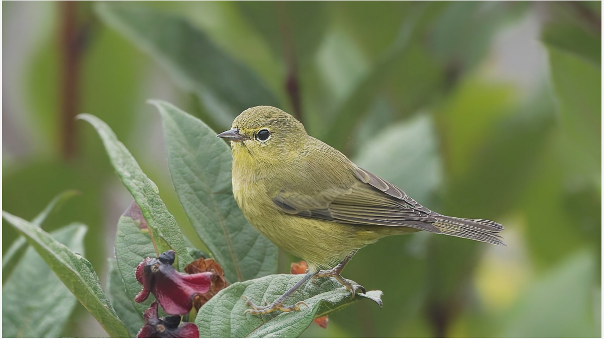
Orange-crowned Warbler