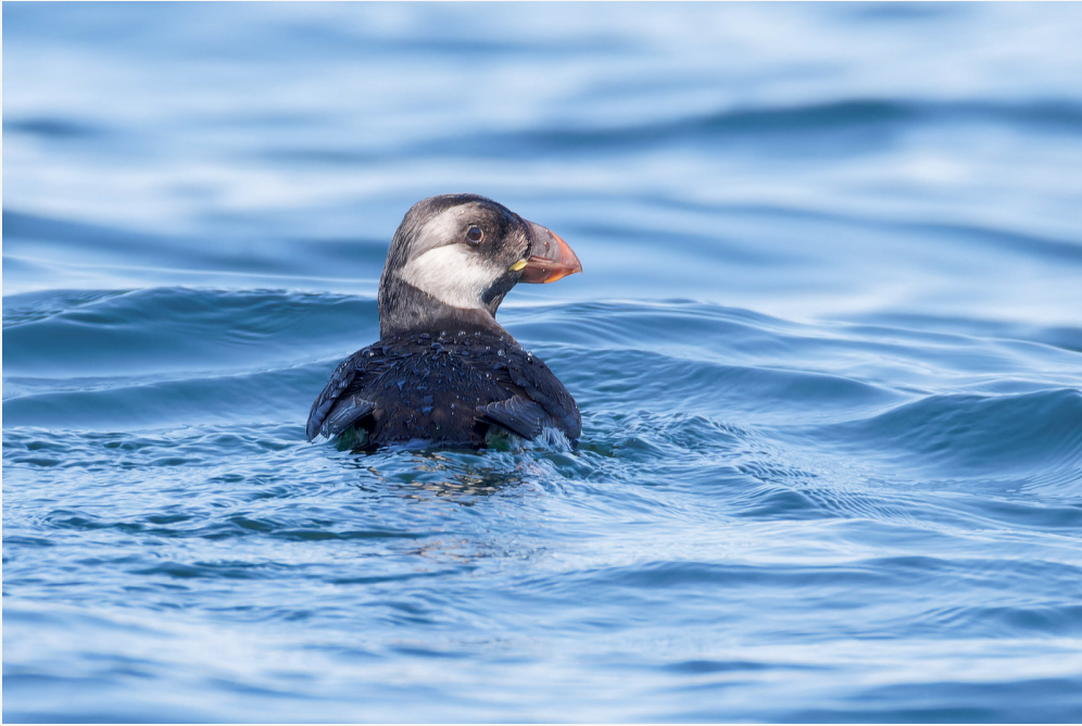
Horned Puffin