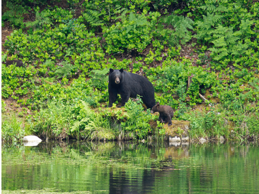
Bear bear and cubs

After lunch, we made our way to Minnekhada Regional Park to bird this beautiful mix of mature forest and riparian habitat. There, we saw our first Western Tanager of the trip, leaving us in awe with its magnificent colors. It was quickly elected by some as one of the great North American passerines. The colorful tanager almost overshadowed some truly great birds that were seen at this location such as an Olive-sided Flycatcher, a Black-throated Grey Warbler and a fledgling Pileated Woodpecker. However, even more unforgettable was the Black bear mom and cubs that played around us (at a reasonable distance of course).