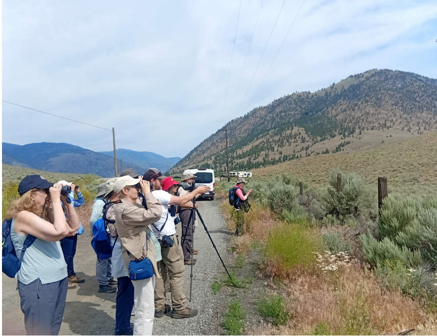
Birding in Osoyoos

great diversity, from fields to marshes to woodlands and brushy habitats. The group got a chance to see Bobolinks, a colony of Cliff Swallows nesting under a bridge and a long awaited Belted Kingfisher, a species that had eluded us until now. We were then very lucky to grasp quick but satisfying looks at some Yellow-breasted Chats in the understory. This elusive bird kept slipping in and out of the dense vegetation, as its partner sang further away.