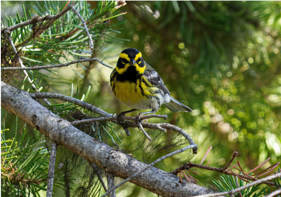
Townsend's Warbler

Crossbills flying over and appearances of our first Mountain Chickadees.