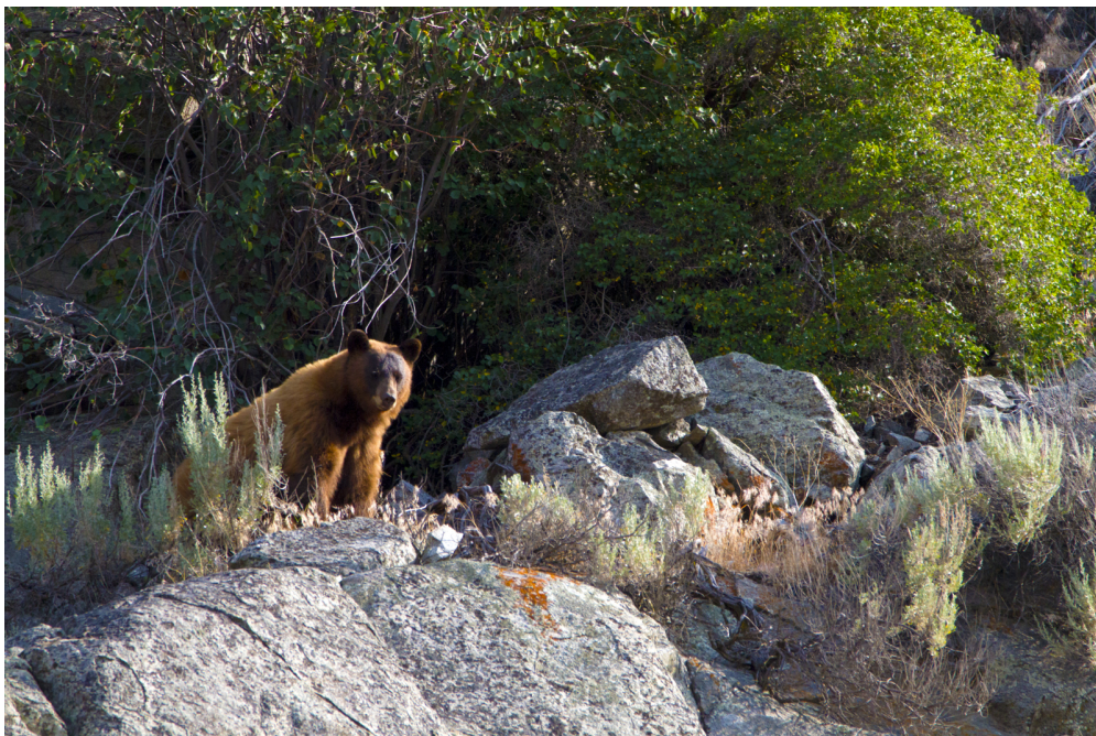
Black Bear © Arnaud Valade

The rest of the day was spent on the road, as our travelers rested and marveled at the majestic landscapes going from the boreal forests of the altitudes to the sage brush habitat of the Okanagan Valley. Once in Osoyoos, we stopped for lunch as the locals asked us what kind of people we were with our earthy colored apparel and optical gear. "Birders! I know a good spot closeby" our server said. We decided to try it out and it did not disappoint. Haynes Point Provincial Park, a narrow strip of land cutting lake Osoyoos in half, offered very good birding and close proximity with the birds. We could appreciate a rare sight of a Virginia Rail family with young and our first looks of the very orange Bullock's Orioles. Our first true taste of sage brush habitat was on the morning of the fourth day when we went to Haynes Lease, a beautiful trail at the foot of a typical Okanagan canyon. Even from the van going up there the birding was great and we saw our first Lark sparrows, Western bluebirds and the infamous California quails on fence posts. Making our way to the territory of an anticipated Canyon Wren, we found a pair of cooperative Peregrines, Chukar, Rock Wrens and a cinnamon coloured Black Bear, calmly foraging on the cliffs. The Canyon Wren finally showed, climbing onto the rock faces, granting us its beautiful cascading song.