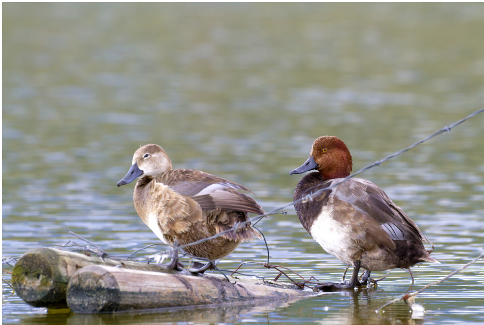
Redhead © Arnaud Valade

Farther along the way to Kelowna, we birded the rocky cliffs and grasslands of White Lake protected area where we saw a colony of White-throated Swifts chirping loudly and zooming in and out of crevices. In the prairies, we saw a beautiful Mountain Bluebird, patiently letting itself get admired by the travelers. There, we also caught good views of Western Kingbirds, Lark and Clay-colored Sparrows and some more Golden Eagles to top it off. After settling in Kelowna for our final night, we decided to make an evening outing to Robert Lake to tick off some waterbirds and shorebirds before the end of the trip. The alkaline lake proved to be one of the highlights for many as we could easily watch great quantities of ducks, grebes, Yellow-headed Blackbirds and Phalaropes go about their business, barely noticing our presence. We observed broods of baby coots playing around and preening only a few feet away from us as some magnificent Black-necked stilts sat on the other side of the lake. Sated by so many wonderful birds and scenery, we headed to the city for our final dinner.