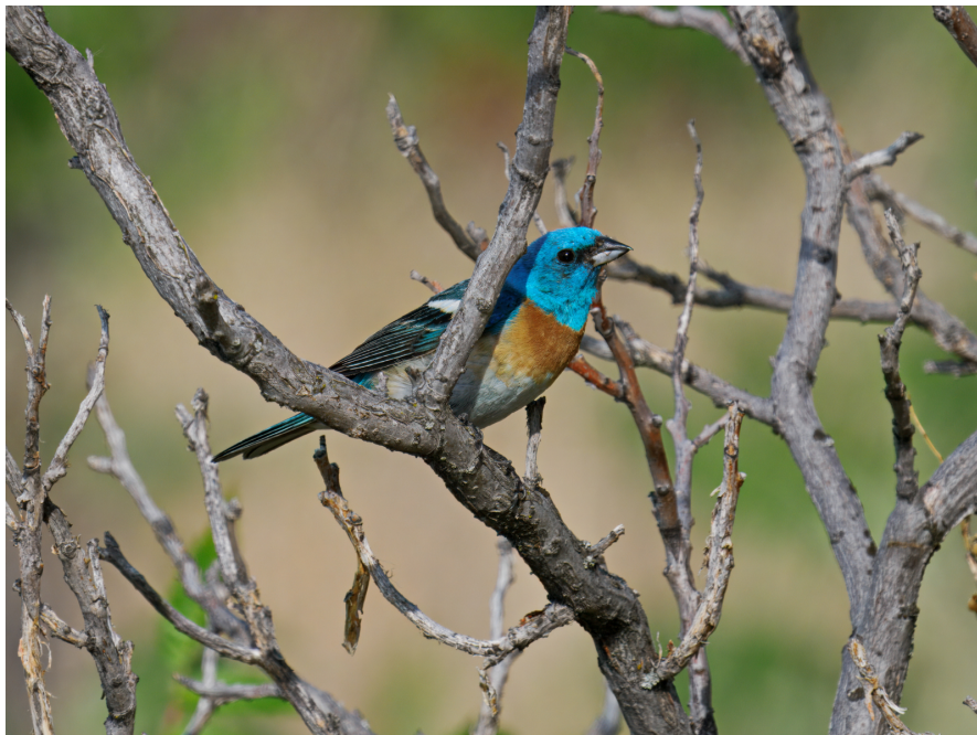
Lazuli Bunting

We proceeded to walk the trails around the meadows and shrubs, counting multiple Willow flycatchers and getting distant looks at one of the highlights of the trip, the Lazuli bunting, a species that would follow us all along our itinerary. As time passed, some raptors started filling the skies and offered a great identification clinic. While scanning for the predators, we noticed swifts in the distance. Vaux's got very close as another species flew in the distance. The dark coloration, long wings and gliding flight style revealed the identity of these Black swifts, a truly awesome and mysterious bird!