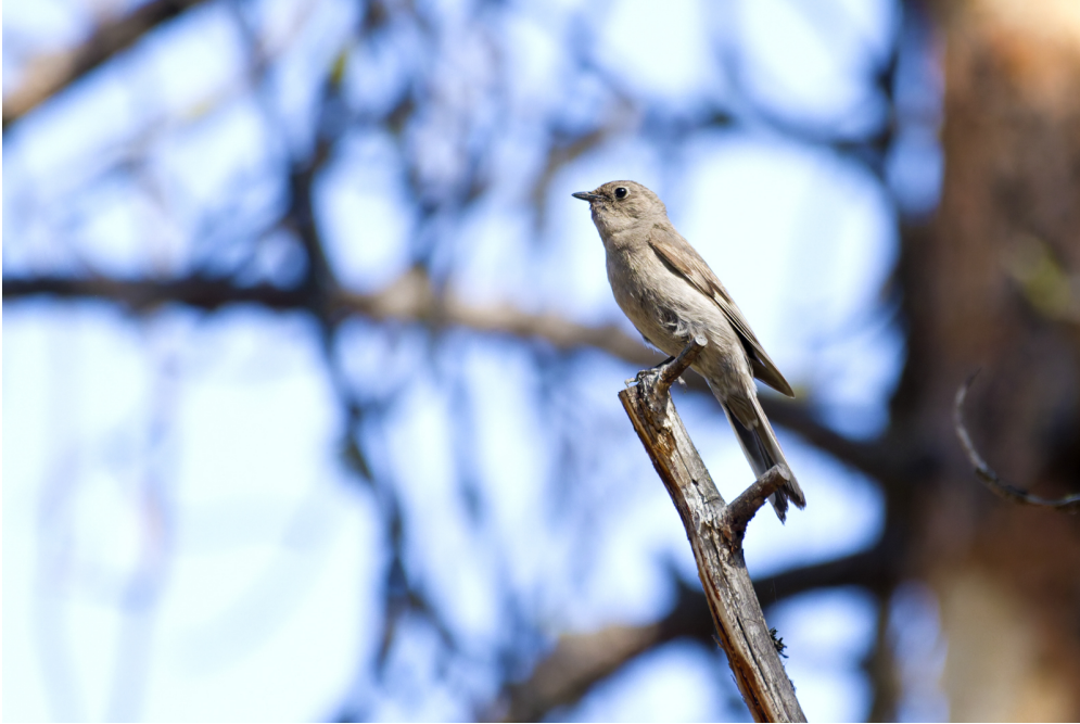
Townsend Solitaire © Arnaud Valade

Heading north, we made a stop on McKinney road to explore some more Ponderosa pine forest habitat to seek out some Okanagan Valley specialities. We sought out a Gray Flycatcher, its understated beauty quietly admired by all. This forest proved to be full of activity and good birds kept coming and going such as a very cooperative Townsend's Solitaire, Pygmy Nuthatches and Cassin's Finches.