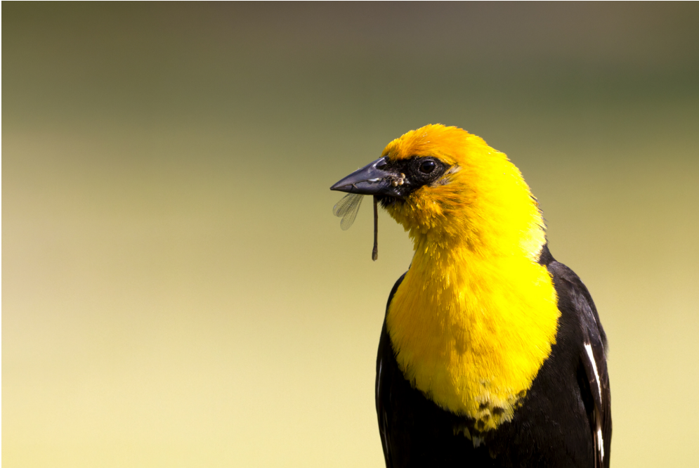
Yellow-headed Blackbird

That same afternoon, we went out again to explore the enigmatic Anarchist Mountain overlooking Osoyoos. There, the open Ponderosa pine forest hosted some nesting Lewis's Woodpeckers whom we observed going in and out of a cavity from the other side of the valley for as long as we could. All of us were in wonder of its unusual flight style and colours setting it apart from other woodpecker species.