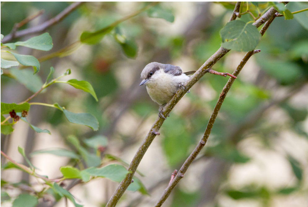
Pygmy Nuthatch