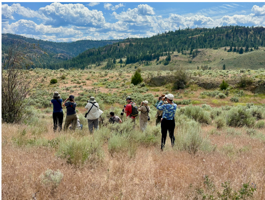
Birding in Osoyoos