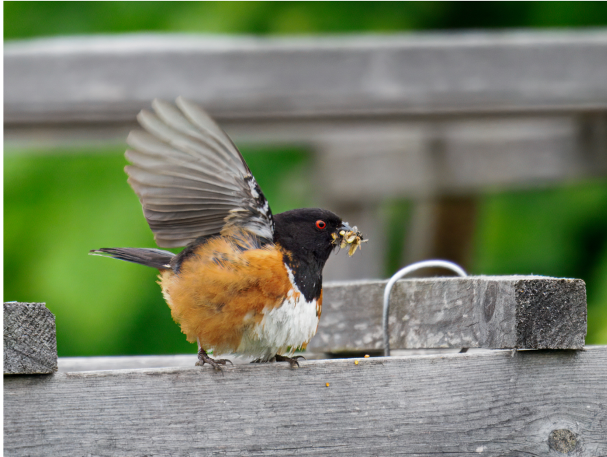
Spotted Towhee

We proceeded to walk the trails around the meadows and shrubs, counting multiple Willow flycatchers and getting distant looks at one of the highlights of the trip, the Lazuli bunting, a species that would follow us all along our itinerary. As time passed, some raptors started filling the skies and offered a great identification clinic. While scanning for the predators, we noticed swifts in the distance. Vaux's got very close as another species flew in the distance. The dark coloration, long wings and gliding flight style revealed the identity of these Black swifts, a truly awesome and mysterious bird!