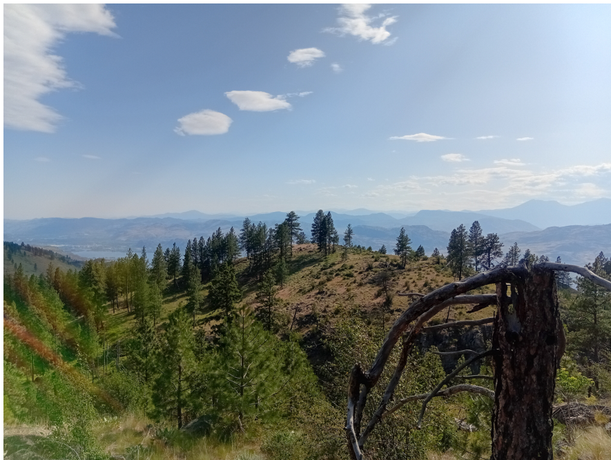
Anarchist Mountain

That same afternoon, we went out again to explore the enigmatic Anarchist Mountain overlooking Osoyoos. There, the open Ponderosa pine forest hosted some nesting Lewis's Woodpeckers whom we observed going in and out of a cavity from the other side of the valley for as long as we could. All of us were in wonder of its unusual flight style and colours setting it apart from other woodpecker species.