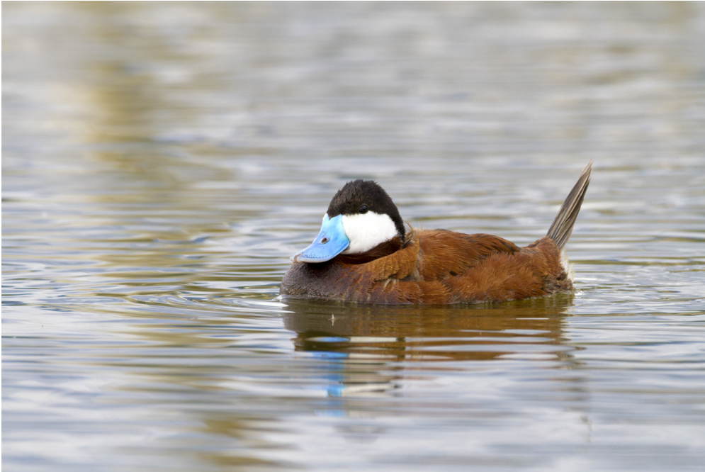
Ruddy Duck

During the trip, we managed to see a remarkable 142 species, of which a great deal were lifers for many of us. From the lowland forests of the Vancouver coast to the mountain boreal forests of the Cascade range to the dry prairies and open woodlands of the Okanagan, this short trip transported us through an unbelievable array of landscapes. Any bird watcher or avian enthusiast should once appreciate what British Columbia has to offer as it truly is one of the best destinations for birding in North America. We were lucky to share the trip with such a lovely group with individuals from rich and diverse backgrounds that contributed to the depth of the experience.