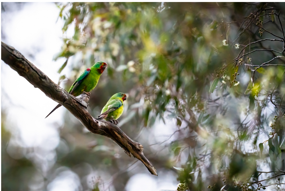
Swift Parrot

The afternoon at Adventure Bay began with a picnic surrounded by Swift Parrots, giving us extended views of the world's fastest parrot feeding in eucalypt blossoms and drinking from puddles on the ground. We continued our day with sightings of a Hooded Plover, one of the island's specialties. Bruny Island is a stronghold for this endangered species, which faces threats from disturbance and predation when they nest on exposed beaches.