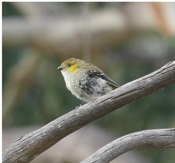
Forty-spotted Pardalote

Birding on Bruny Island began early the next morning with a tour of Inala Nature Reserve. Here, we enjoyed excellent views of the endangered endemic Forty-spotted Pardalote from Inala's unique "Pardalote Platform" and learned about the conservation challenges and vital work being done to save one of Tasmania's most iconic birds from extinction.