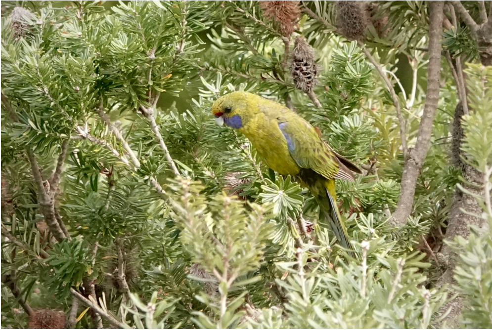
Green Rosella