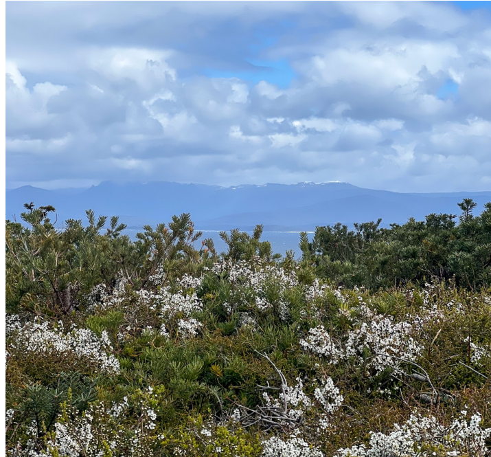
Snow-capped Mountains

Antarctica and frequent rain or hail showers, birding was a challenge. Because of the weather, the group split: some headed south to Cape Bruny Lighthouse, while others braved the freezing wind and swell on the Pennicott cruise. The strong winds rewarded us with several pelagic species, including Northern Giant Petrel, White-headed Petrel, and White-capped (Shy) Albatross. We reunited for lunch and soon afterwards ticked off our 12th and final endemic of the tour, the Strong-billed Honeyeater.