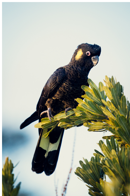
Yellow-tailed Black Cockatoo

After lunch, we drove back through Hobart to catch the Bruny Island ferry.