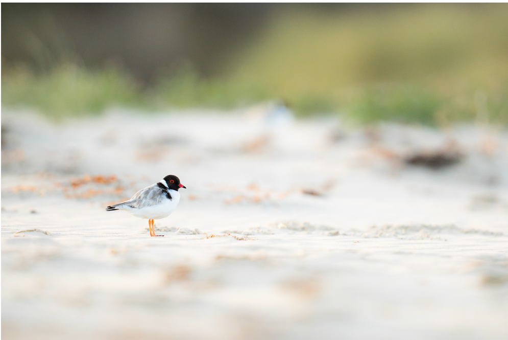
Hooded Plover

To end the day, we walked along the Cape Queen Elizabeth Track in search of Shelduck and White-fronted Chat. Among the walk through dry eucalypt forest, another endemic was spotted. After teasing us with a variety of songs and calls, the Yellow-throated Honeyeaters finally braved the cold