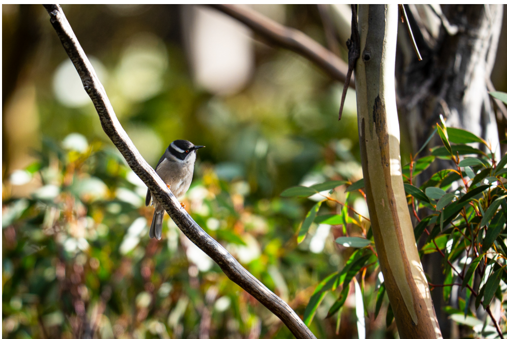
Strong-billed Honeyeater