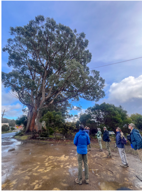
Group watching Swift Parrot