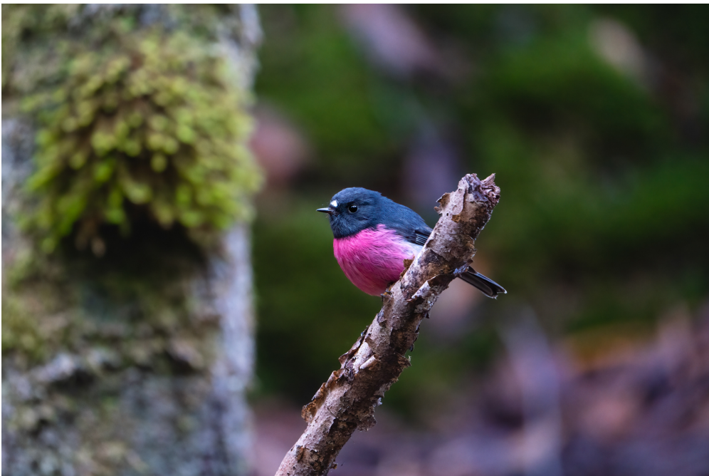
Pink Robin