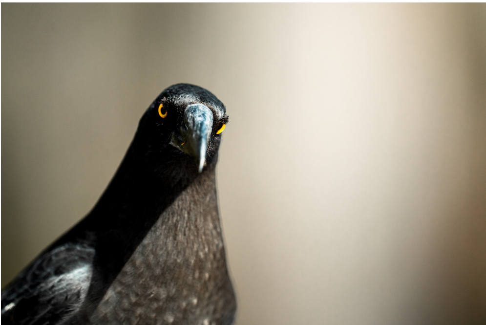
Black Currawong