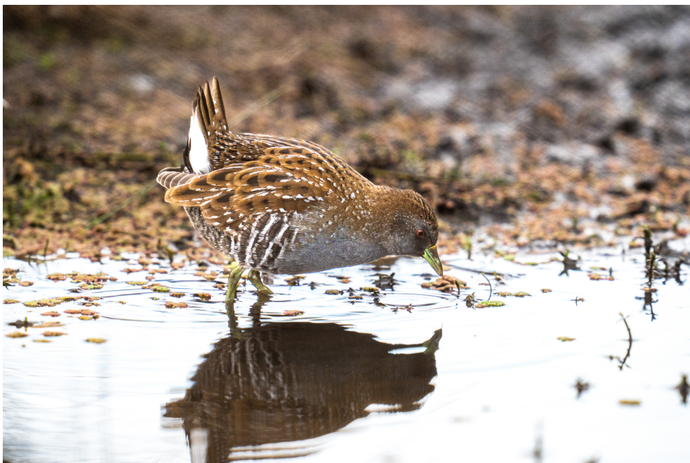
Australian (Spotted) Crake

Day 2 began with a drive to Mount Field National Park. Upon arrival, we enjoyed a quick picnic among Tasmanian Pademelons before setting out on our first walk. The park is a magical world of waterfalls and mossy rainforest, home to special birds such as Pink Robin, Bassian Thrush, and Yellow-tailed Black Cockatoo. Endemics including the Black Currawong, Green Rosella, Tasmanian Scrubwren, and perhaps the hardest to get good views of, the Scrubtit, rounded off a rewarding