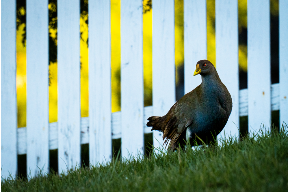
Tasmania Nativehen