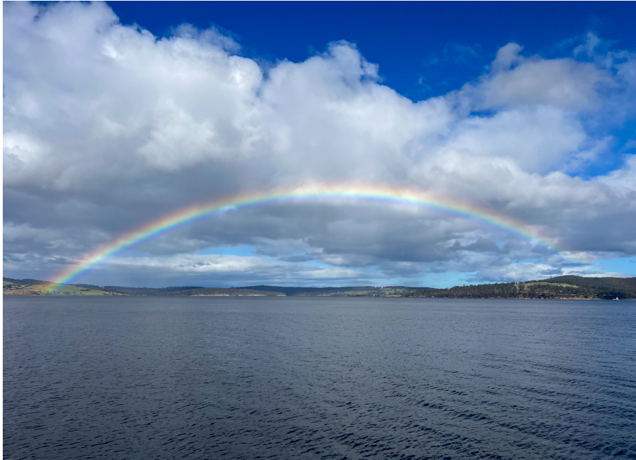
Rainbow crossing to Bruny Island

Birding on Bruny Island began early the next morning with a tour of Inala Nature Reserve. Here, we enjoyed excellent views of the endangered endemic Forty-spotted Pardalote from Inala's unique "Pardalote Platform" and learned about the conservation challenges and vital work being done to save one of Tasmania's most iconic birds from extinction.