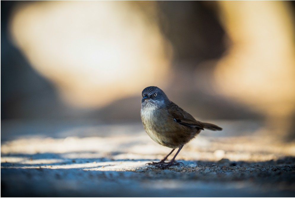
Tasmanian Scrubwren