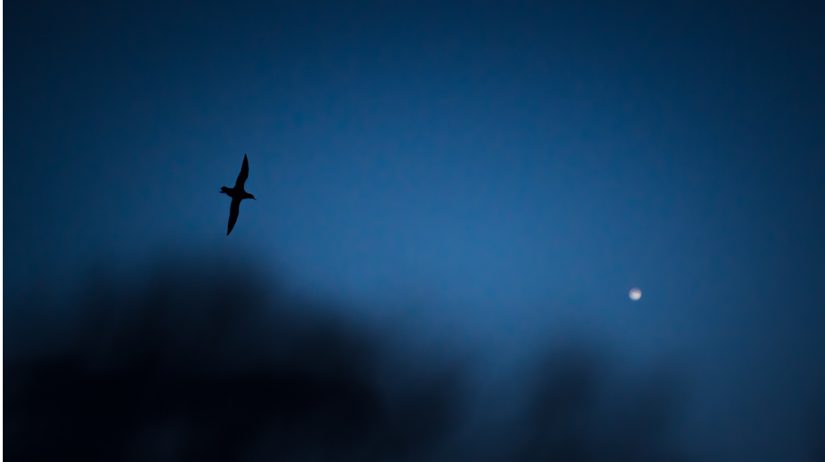
Short-tailed Shearwater

In the evening, after an early dinner, we visited a shearwater breeding colony to watch the birds return after dusk. As the light faded, the wheeling forms of Short-tailed Shearwaters appeared overhead, crash-landing into the vegetation before disappearing into their burrows. On our way home, we set off on a short night drive in search of Eastern Quolls. Just before returning to the hotel, we were delighted by views of a perched Tasmanian Boobook, a perfect end to the day.