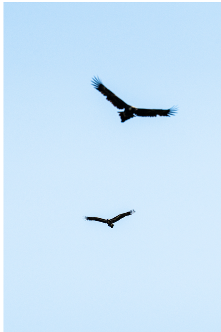
Wedge-tailed Eagle © Sören Salvatore

tailed Eagles before ending an amazing tour with our Inala guide Don.