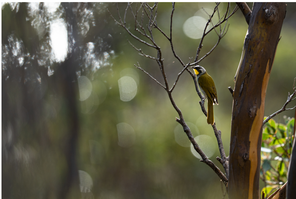
Yellow-throated Honeyeater

and windy weather to show themselves. The drive back to the hotel offered great views of Bruny Island's iconic White Wallabies. The island is home to around 200 albino Bennett's Wallabies.