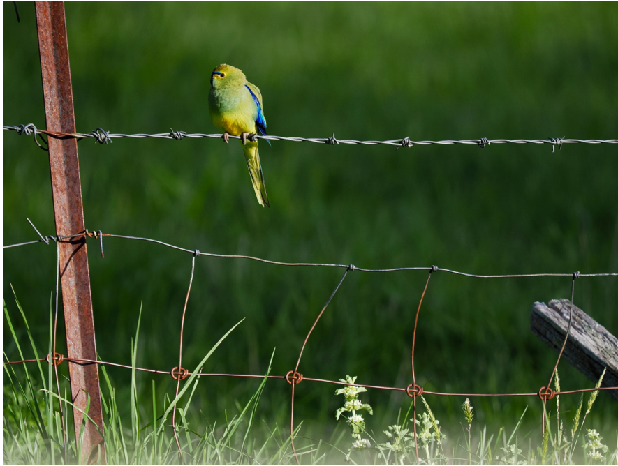
Blue-winged Parrot

After another lovely picnic surrounded by Blue-winged and Swift Parrots, we boarded the ferry back to the mainland. Before ending the tour in Hobart, we made one final stop at Peter Murrell Reserve. Here, a Striated Fieldwren became our 100th bird species seen in the past five days, a fantastic achievement for the group and their guides. To celebrate, two sleepy Brush-tailed Possums in a tree hollow and a strolling Echidna sent us off to our final celebratory lunch before we said our goodbyes.