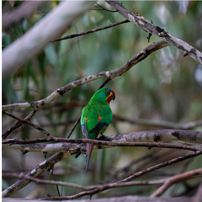
Swift Parrot

On our drive back to the hotel for a well-deserved dinner, we spotted yet another Bruny Island specialty, the Albino Bennett's Wallaby. The island is home to around 200 white wallabies. After dinner we drove to the Neck Rookery, home to around 10,000 breeding pairs of Short-tailed Shearwaters. Not long after sunset, they seemingly appear out of nowhere and start filling the sky above us before crash-landing onto the ground and running to their burrows. Our last full day on Bruny Island started with a short walk around the Neck Campground in search of Satin Flycatchers. We spotted both males and females flying and calling in the dry eucalypt forests before exiting the trail onto the white-sand beach where we encountered Australasian Gannets and Great Crested Terns. Afterwards we headed to Adventure Bay to embark on our Bruny Island Cruise along the beautiful but rugged coastline of South Bruny. Although it was quite the rough ride, we were rewarded with views of Shy Albatross, Black-faced Cormorants and Australian Fur Seals. The icing on the cake was a huge Elephant Seal hiding among the rocks. After a late lunch at the cruise terminal, we looped around the island and headed south again—this time on land—to do some birding around the South Bruny lighthouse.