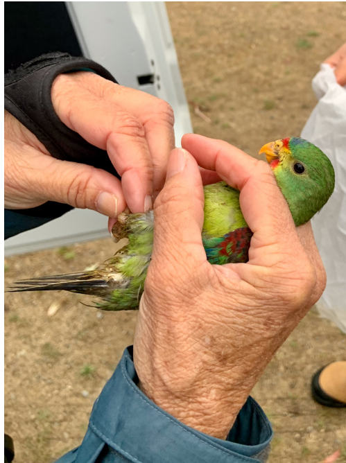
Rescued Swift Parrot, juvenile © Keith Geller

Before ending the tour in Hobart, we made one final stop at Peter Murrell Reserve. We got great views of Striated Fieldwren, Shining Bronze-Cuckoo and a pair of Scarlet Robins. Although not quite a bird, but close enough, we also checked out some Flying Duck Orchids before ending the tour.