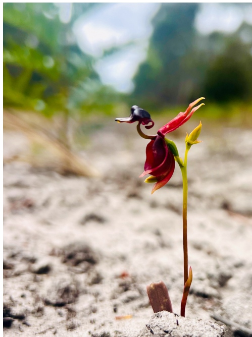
Flying Duck Orchid

Before ending the tour in Hobart, we made one final stop at Peter Murrell Reserve. We got great views of Striated Fieldwren, Shining Bronze-Cuckoo and a pair of Scarlet Robins. Although not quite a bird, but close enough, we also checked out some Flying Duck Orchids before ending the tour.