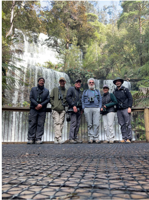
Our group at Russell Falls

Scrubtit, rounded out a rewarding morning before lunch at the Waterfalls Café. Our lunch was interrupted by a strolling echidna, a sight we couldn't miss. Little did we know that this would only be the first of many close encounters with echidnas on this tour.