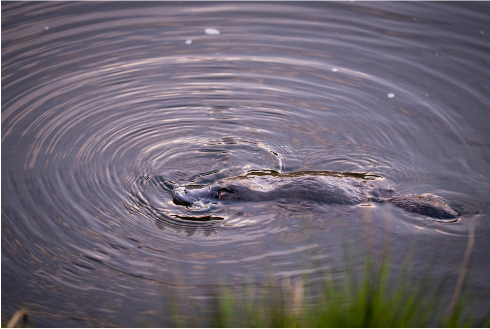
Platypus © Sören Salvatore