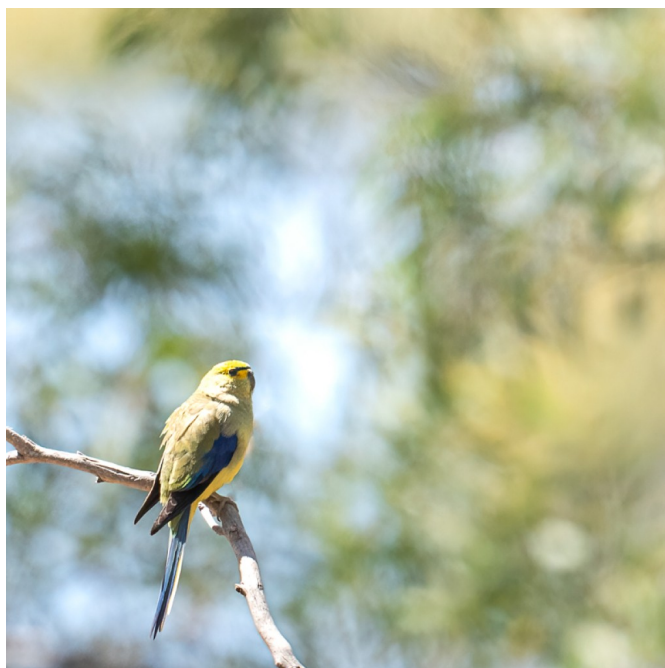
Blue-winged Parrot

The next morning, it was time to end our stay on Bruny Island. On the way to the ferry, we stopped on North Bruny for some excellent Blue-winged Parrot sightings. While walking along the road, one of the guests spotted a struggling bird on the ground. After investigating further, we found a very cold and weakened Swift Parrot juvenile in the tall wet grass. Since we couldn't find any evidence of an active nest nearby, we decided to capture the bird and bring it to the vet for inspection. Luckily the young Swiftly was cleared by the vet without any injuries. After being nursed back to strength at the Bonorong Wildlife Sanctuary, the Swift Parrot was released again a couple of days after the tour ended.