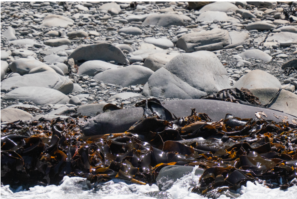
Elephant Seal