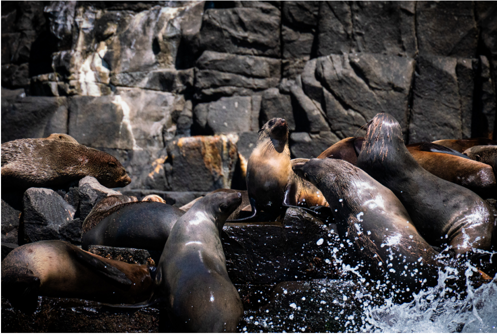
Australia Fur Seal

The next morning, it was time to end our stay on Bruny Island. On the way to the ferry, we stopped on North Bruny for some excellent Blue-winged Parrot sightings. While walking along the road, one of the guests spotted a struggling bird on the ground. After investigating further, we found a very cold and weakened Swift Parrot juvenile in the tall wet grass. Since we couldn't find any evidence of an active nest nearby, we decided to capture the bird and bring it to the vet for inspection. Luckily the young Swiftly was cleared by the vet without any injuries. After being nursed back to strength at the Bonorong Wildlife Sanctuary, the Swift Parrot was released again a couple of days after the tour ended.