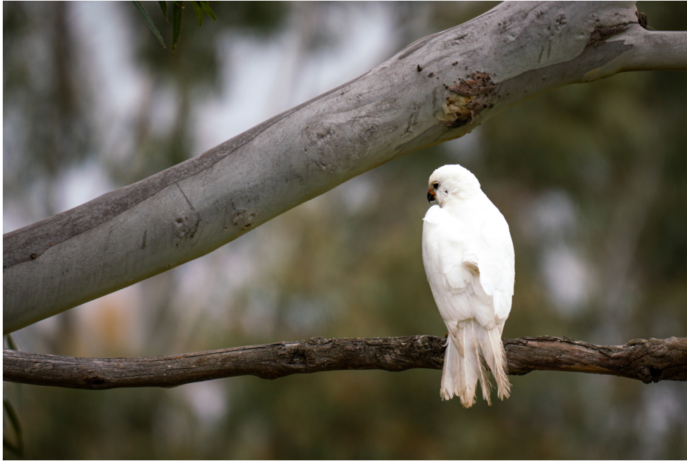
Gray Goshawk (White morph)