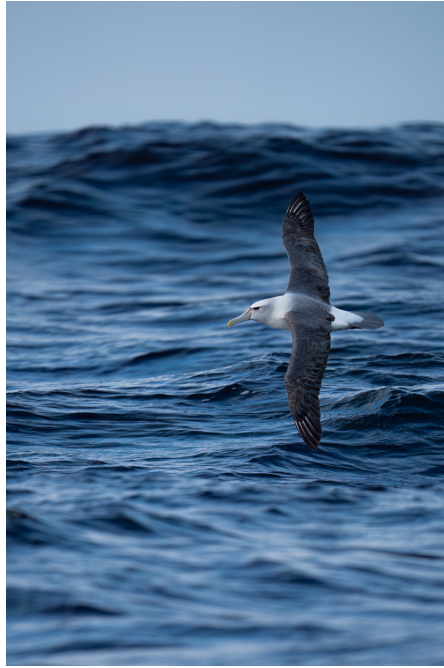
Shy Albatross