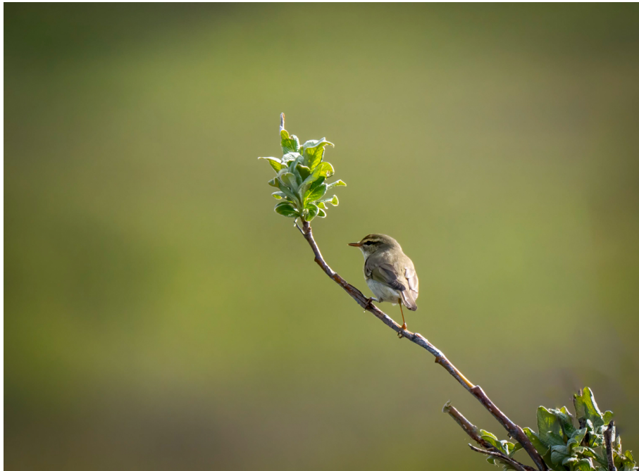
Arctic Warbler

included Gray-cheeked Thrush, White-crowned Sparrow, and White Wagtail. Continuing along another road, we added Alder Flycatcher, Arctic Warbler, Northern Waterthrush, Greater White-fronted Goose, Northern Shoveler, an immature Bald Eagle, and another flyby Rough-legged Hawk. It was another enjoyable day exploring the tundra and adding to our growing trip list.