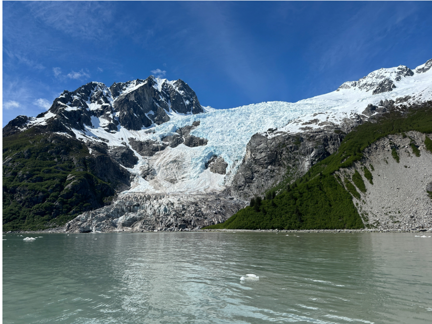
Kenai Fjord cruise

we observed Gadwall, Pigeon Guillemot, Arctic Tern, Pelagic Cormorant, and Double-crested Cormorant. Calm weather made for excellent conditions throughout the day. Birding highlights included Horned Puffin, Tufted Puffin, Marbled Murrelet, Ancient Murrelet, Kittlitz's Murrelet, Parakeet Auklet, Rhinoceros Auklet, and Thick-billed Murre. Marine mammals were equally impressive, with Harbor Seal, Sea Otter, Steller's Sea Lion, Fin Whale, Humpback Whale, and Coastal Mountain Goat all observed.