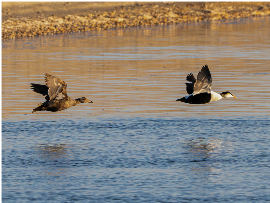
Common Eider

Farther along the coast, we added Brant (Black), Common Eider, Red-breasted Merganser, Pigeon Guillemot, Common Murre, Black-legged Kittiwake, and numerous Red-throated Loons. Additional coastal birding produced Long-tailed Duck, Semipalmated Sandpiper, Pacific Loon, Say's Phoebe, and another opportunity to enjoy excellent views of the resident Gyrfalcon. We then returned to the airport for our flight back to Anchorage, where we enjoyed dinner before turning in for the evening.