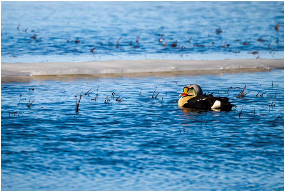
King Eider

tailed Duck, Pomarine Jaeger, Red-throated Loon, Pacific Loon, Lapland Longspur, Steller's Eider, Red-necked Phalarope, Northern Pintail, and Dunlin. Additional King Eiders and Brant were welcome sightings. During the evening, we added Baird's Sandpiper, Ruddy Turnstone, American Golden-Plover, and three Ruff to conclude another rewarding day.