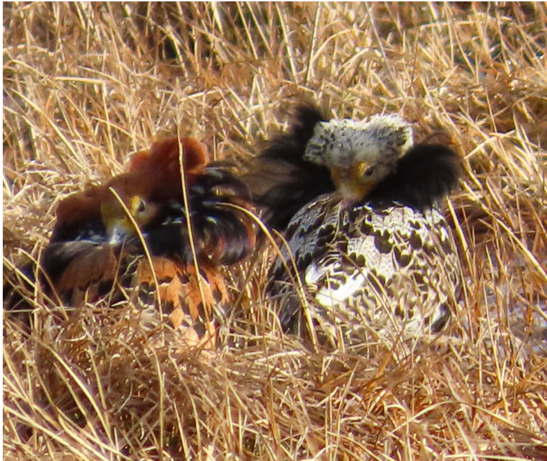
Ruff

Wilson's Snipe, Parasitic Jaeger, Snowy Owl, and Steller's Eider.