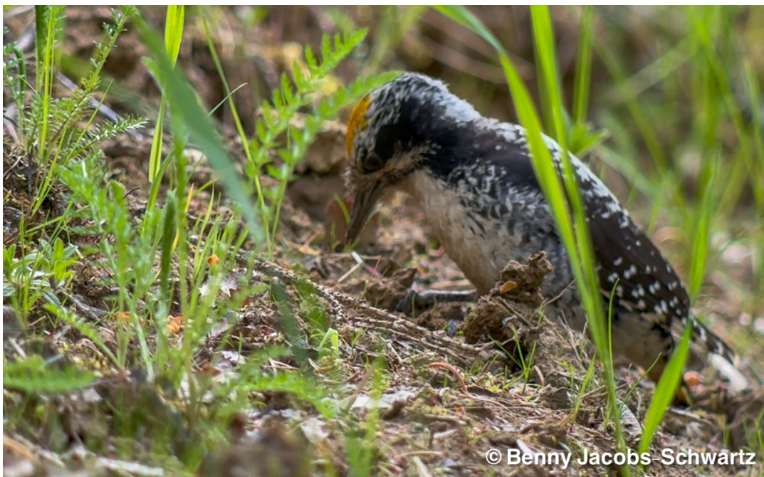
American Three-toed Woodpecker