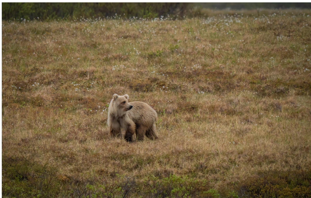
Brown Bear (Grizzly)

Sparrow, and Rusty Blackbird. Warbler diversity was excellent, with Blackpoll Warbler, Northern Waterthrush, Yellow Warbler, Orange-crowned Warbler, and Wilson's Warbler all observed. Farther along, we found Wilson's Snipe and enjoyed outstanding views of a Brown Bear as it wandered across the tundra roughly 200 yards away. Nearby ponds held Green-winged Teal, Greater Scaup, and Long-tailed Duck, while additional highlights included Bank Swallow, Arctic Warbler, Arctic Tern, and Short-billed Gull.