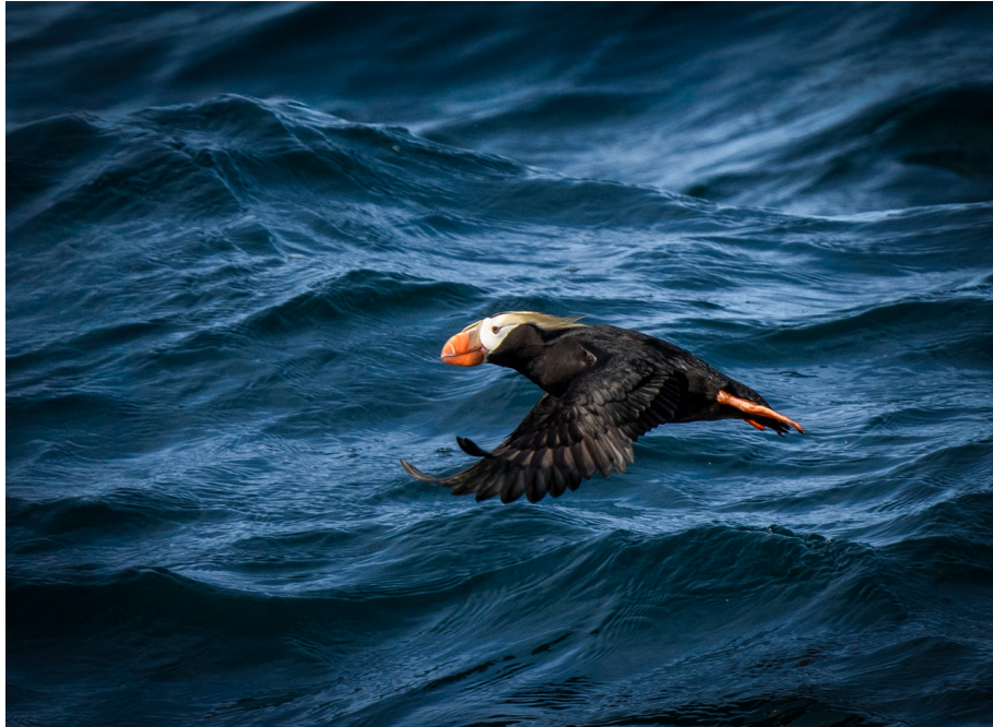
Tufted Puffin © Joakim Ed