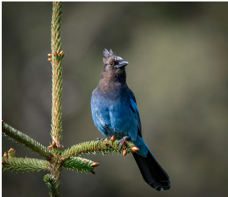
Stellar's Jay

Our morning in Seward was dedicated to several remaining target species, and we were successful in finding Rufous Hummingbird, Coastal Steller's Jay, and Chestnut-backed Chickadee. On the drive back toward Anchorage, we added Trumpeter Swan, Mallard, Common Loon, and Boreal Chickadee. Before dinner, we birded around Lake Hood and Lake Spenard, where Lesser Scaup, Common Goldeneye, Bonaparte's Gull, and Red-necked Grebe rounded out another productive day.