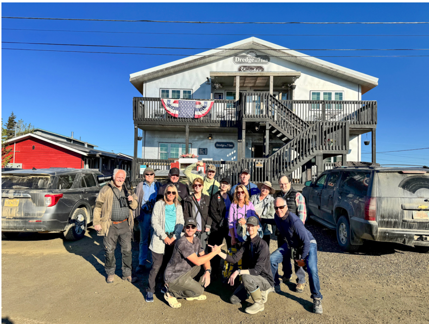
Our group