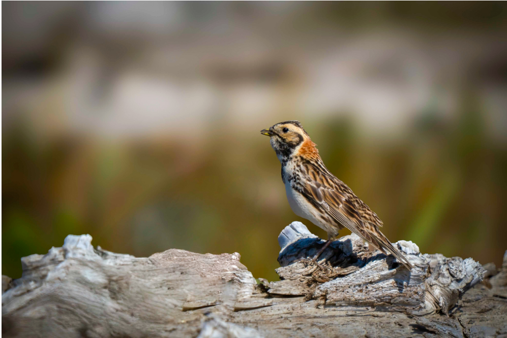
Lapland Longspur, female