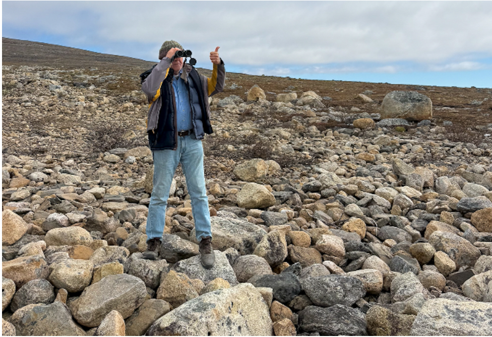
Thumbs up