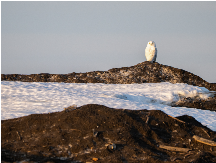
Snowy Owl

Before departing for Barrow, we spent the morning birding around Anchorage. Highlights included Cackling Goose, Canada Goose, Trumpeter Swan, Gadwall, Green-winged Teal, and Sandhill Crane. Following our flight north, we began birding around Barrow. Our first afternoon produced Brant, Tundra Swan, King Eider, Red Phalarope, Pomarine Jaeger, Glaucous Gull, Pacific Loon, Snow Bunting, Savannah Sparrow, and a brief sighting of Snowy Owl. Later, we added Spectacled Eider, Long-tailed Duck, Long-billed Dowitcher, and Pectoral Sandpiper, making for an excellent introduction to Alaska's North Slope.