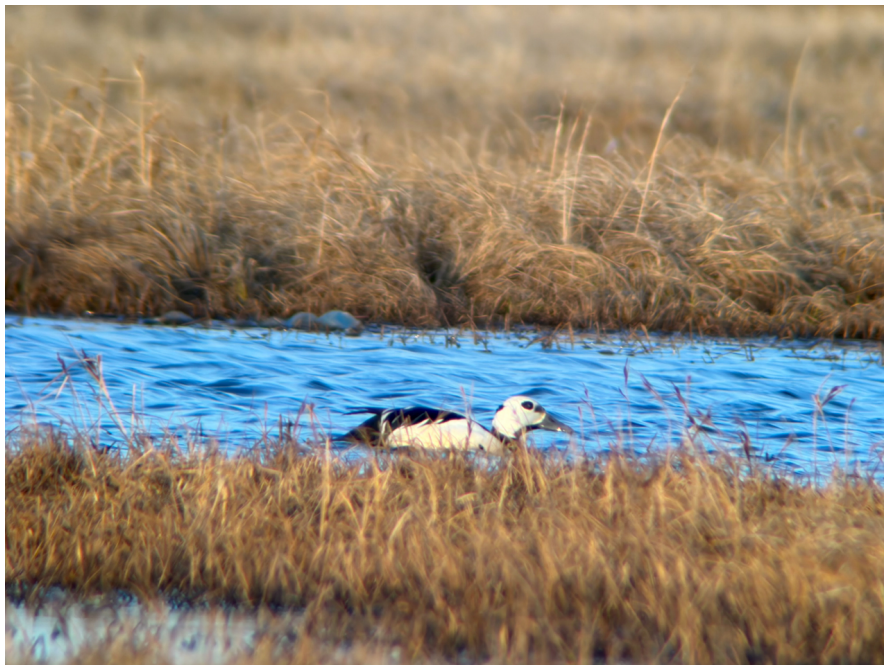
Steller's Eider