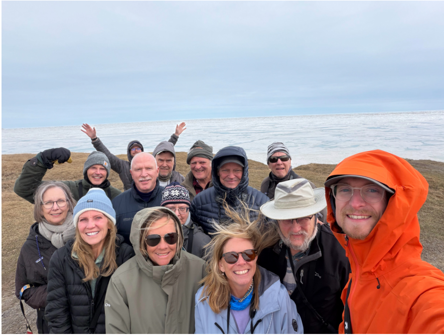
Our group