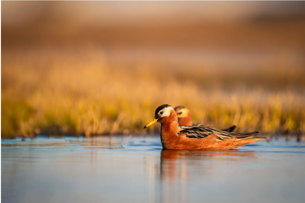
Red Phalarope