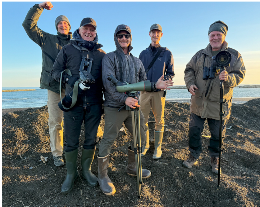
Ivory Gull twitch