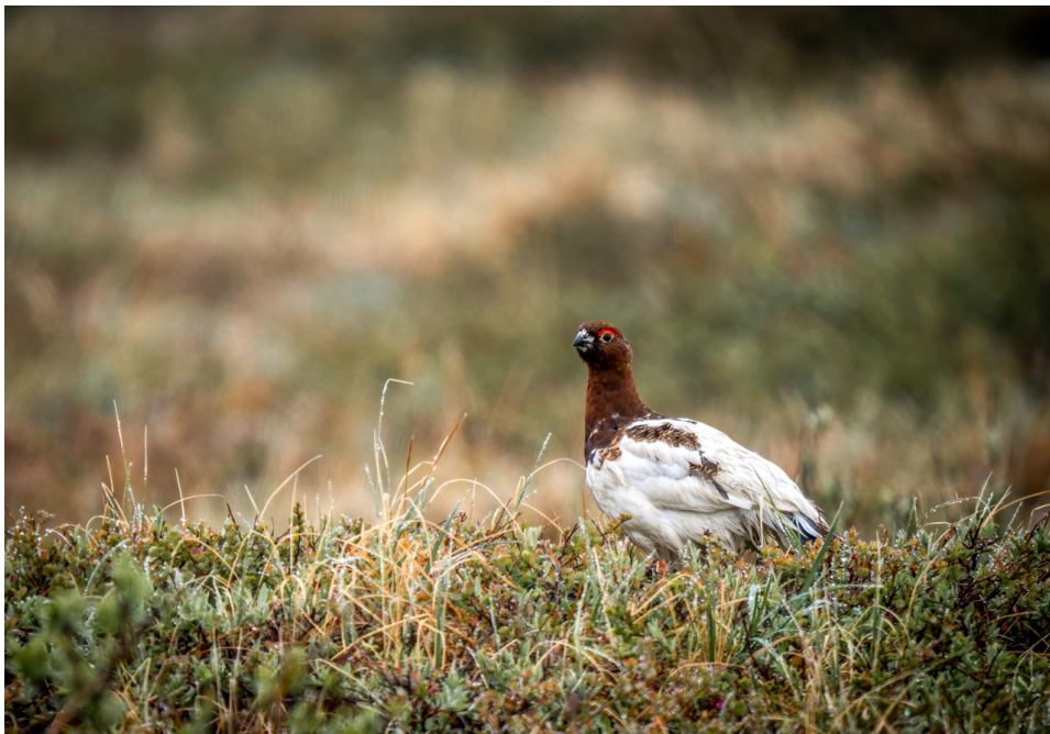
Willow Ptarmigan