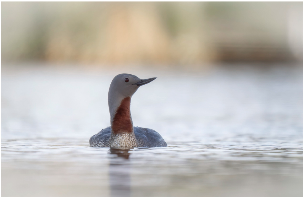
Red-throated Loon