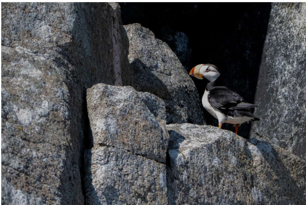
Horned Puffin