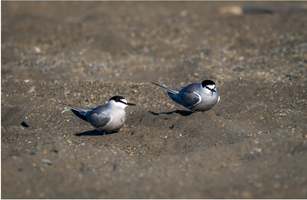
Aleutian Tern

Farther along the coast, we added Brant (Black), Common Eider, Red-breasted Merganser, Pigeon Guillemot, Common Murre, Black-legged Kittiwake, and numerous Red-throated Loons. Additional coastal birding produced Long-tailed Duck, Semipalmated Sandpiper, Pacific Loon, Say's Phoebe, and another opportunity to enjoy excellent views of the resident Gyrfalcon. We then returned to the airport for our flight back to Anchorage, where we enjoyed dinner before turning in for the evening.