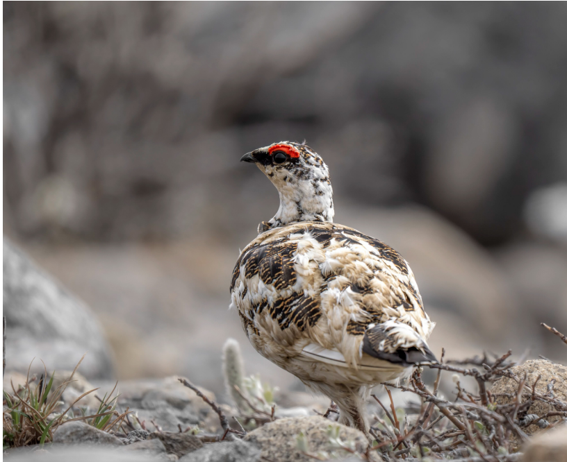
Rock Ptarmigan