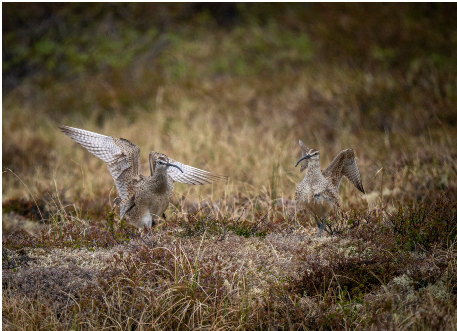
Hudsonian Whimbrel